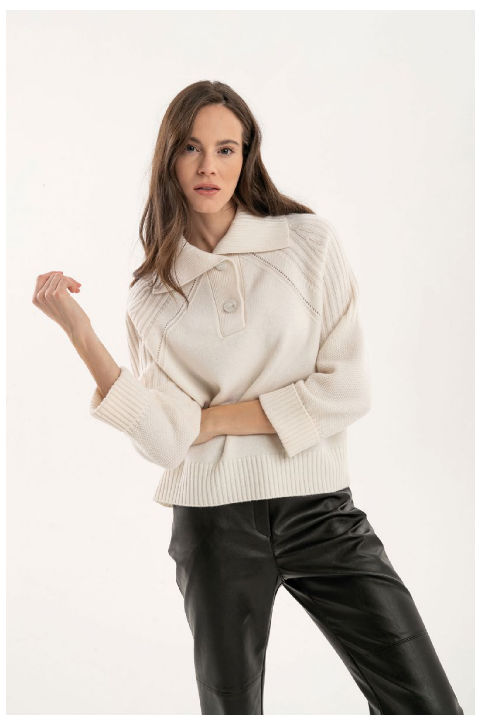
Sweater in wool and cashmere, art. 2209 Trousers in faux leather, art. 3061