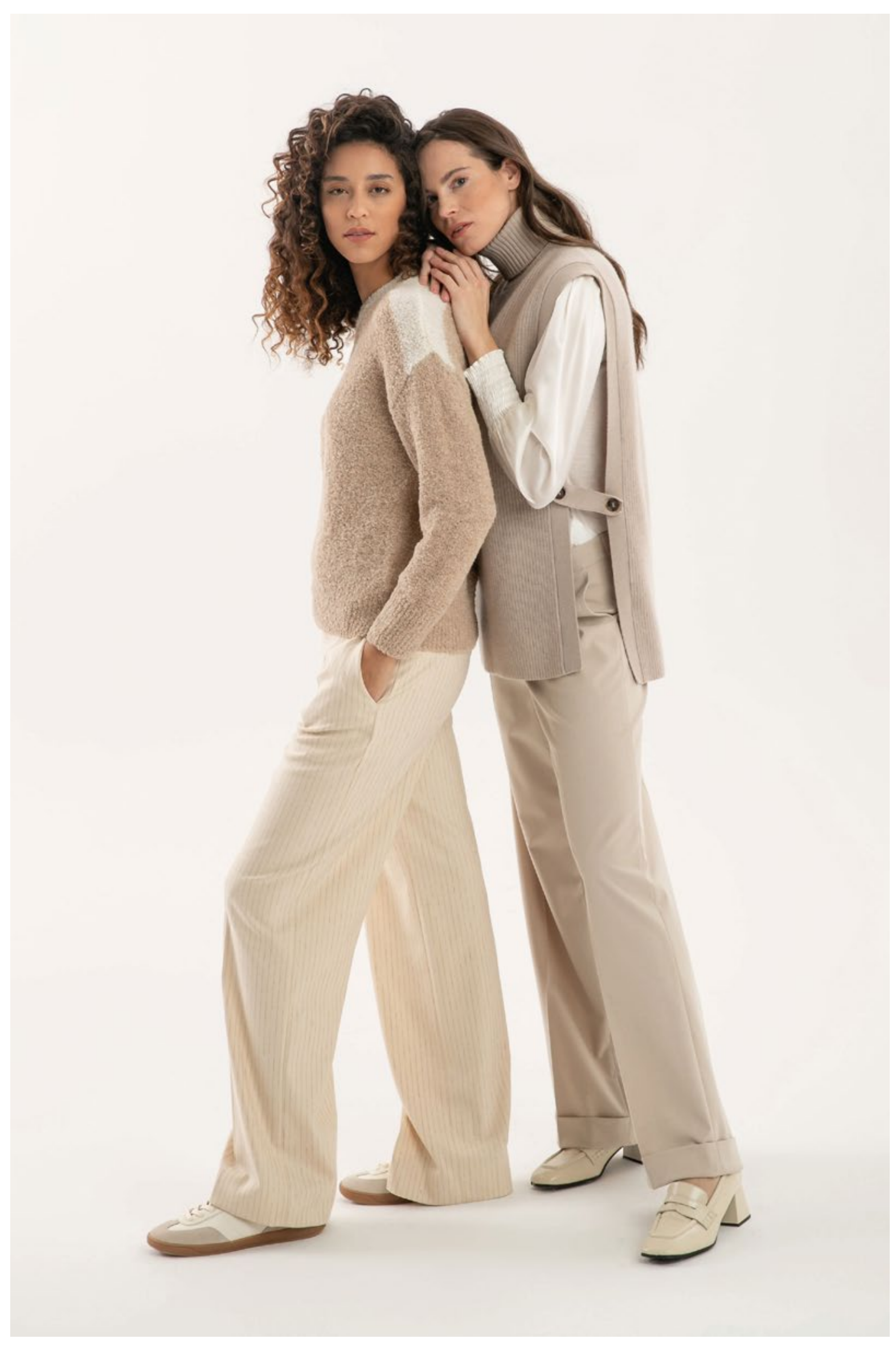
LEFT: Sweater in wool and Alpaca, art. 2649 - Trousers in pinstripe viscose and cotton, art. 3032 RIGHT: Blouse in milk fiber and satin silk stretch, art. 1213 - Turtle-neck sleeveless cape in 100% cashmere, art. 2128 - Trousers in viscose micro-flannel, art. 3023