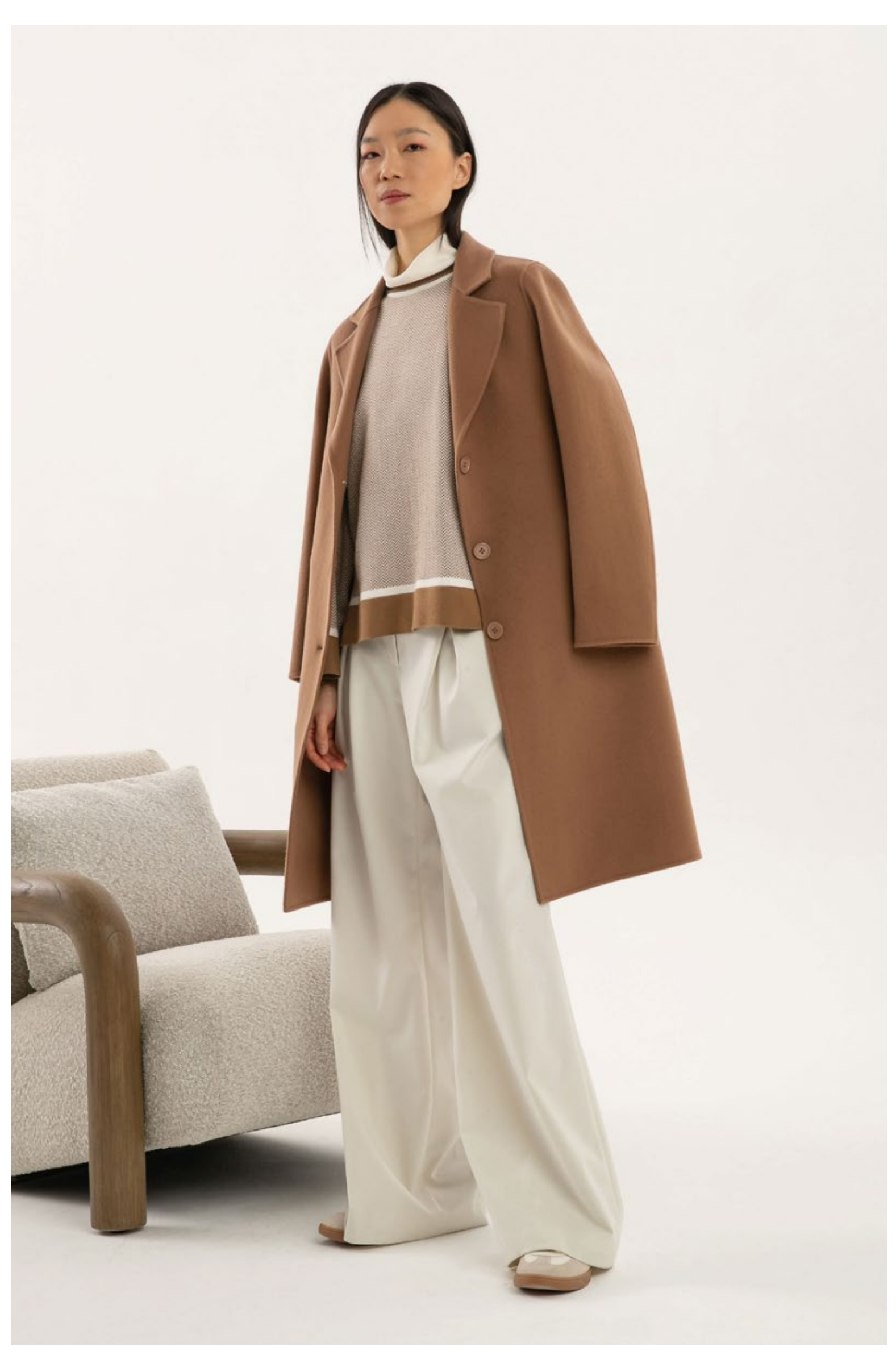
Turtle-neck sweater in Merino wool, art. 2516 Trousers in viscose micro-flannel, art. 3020 Coat in double fabric wool and cashmere, art. 8110