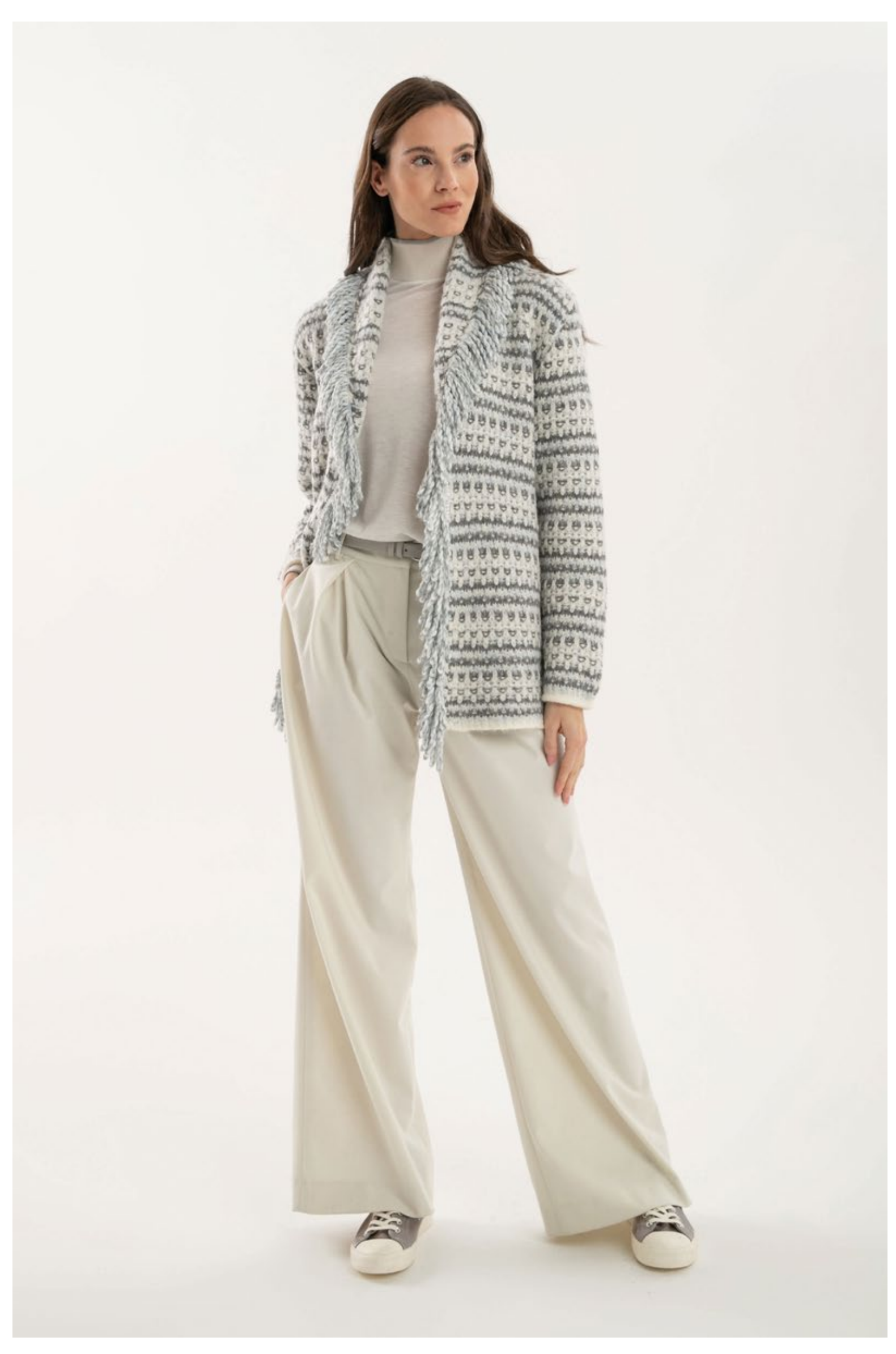
T-shirt in milk fiber with wool-knitted collar and cuffs, art. 1209 Chunky cardigan in wool and Alpaca with fringes, art. 2701 Trousers in viscose micro-flannel, art. 3020 Leather belt, art. 6036