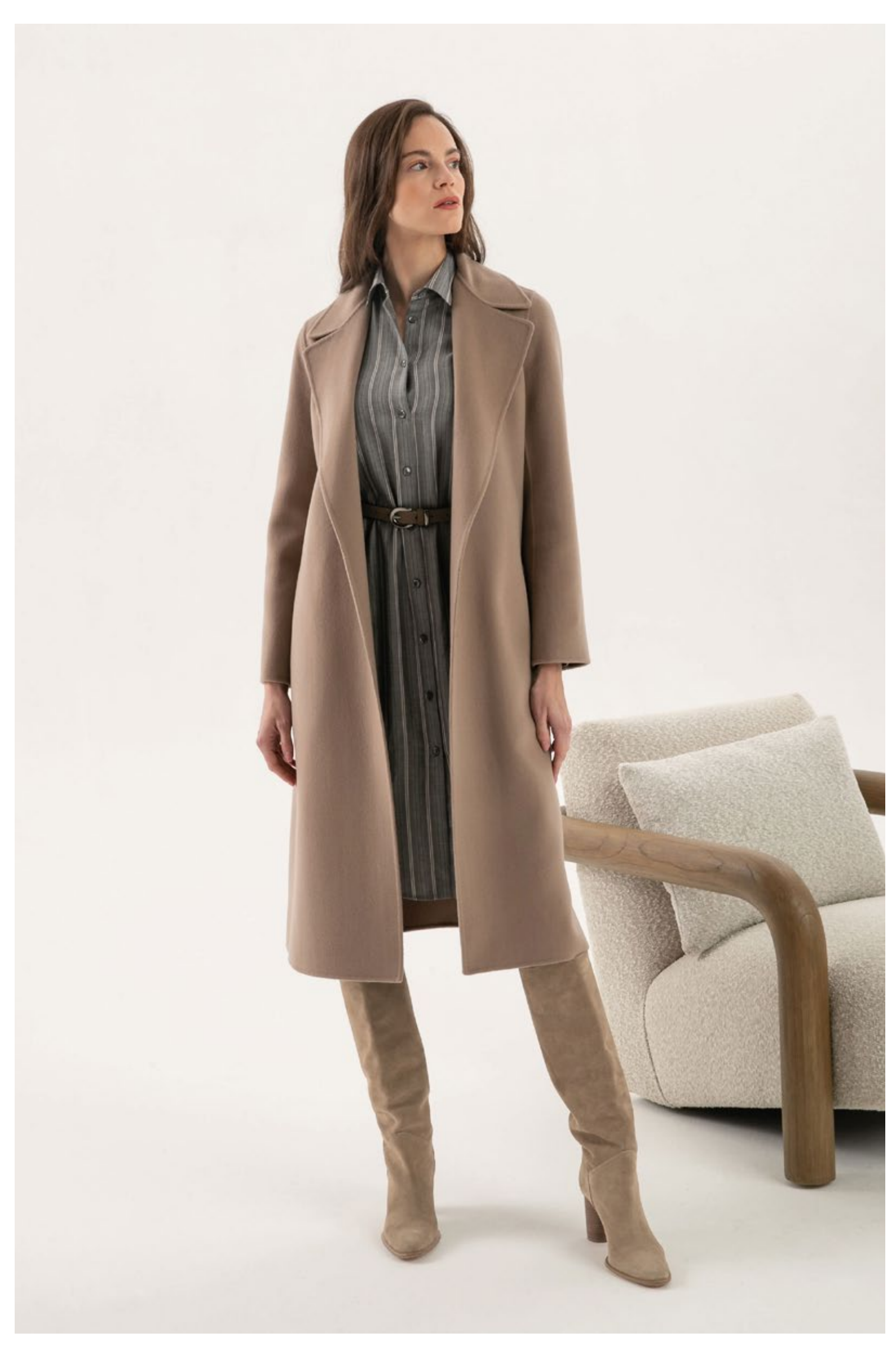
Pinstripe shirt dress in cotton, art. 4017 Coat in double fabric wool and cashmere, art. 8109 Leather belt, art. 6035