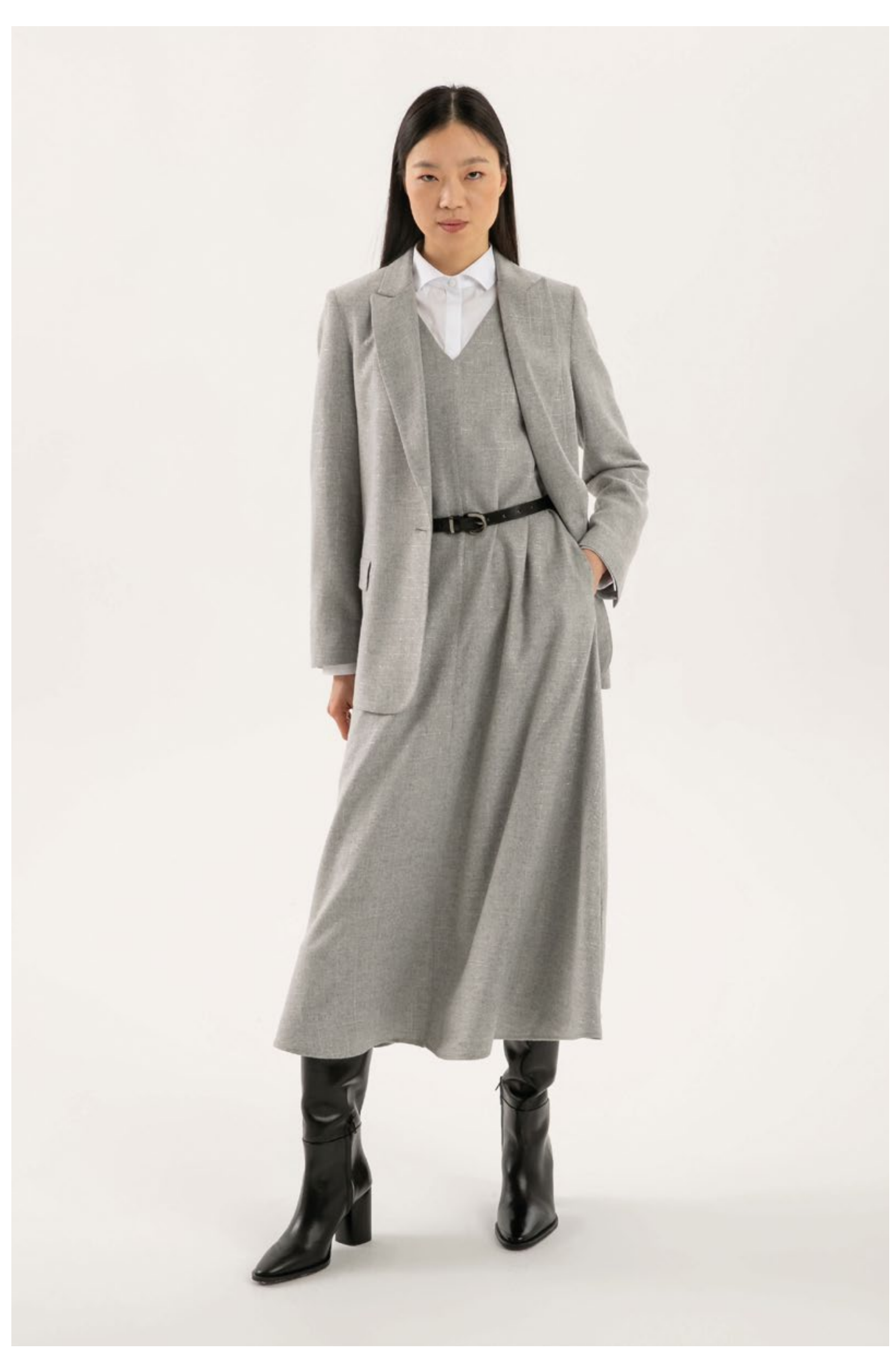
Shirt in stretch popeline with chain embellishment, art. 5033 Dress in viscose and wool with lurex, art. 4029 Jacket in viscose and wool with lurex, art. 8034 Leather belt, art. 6038