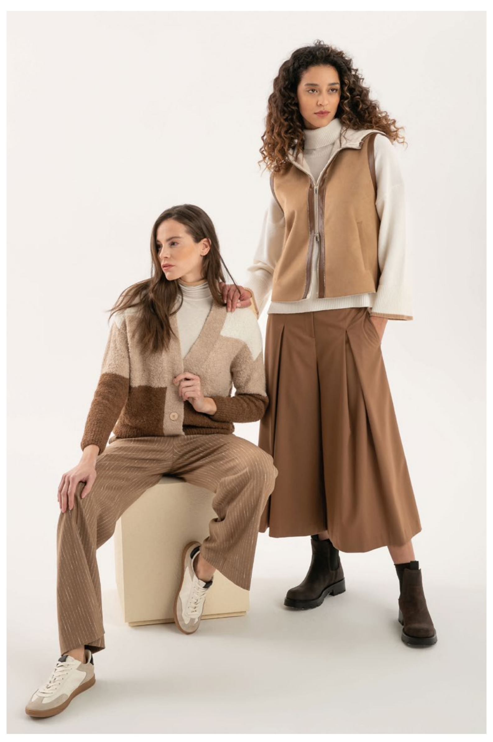
LEFT: Turtle-neck t-shirt in stretch modal cashmere, art. 1512 - Cardigan in wool and Alpaca, art. 2646 - Trousers in pinstripe viscose and cotton, art. 3032

RIGHT: Turtle-neck sweater in 100% cashmere, art. 2134 - Trousers in viscose micro-flannel, art. 3024 - Gilet with faux fur, art. 8095