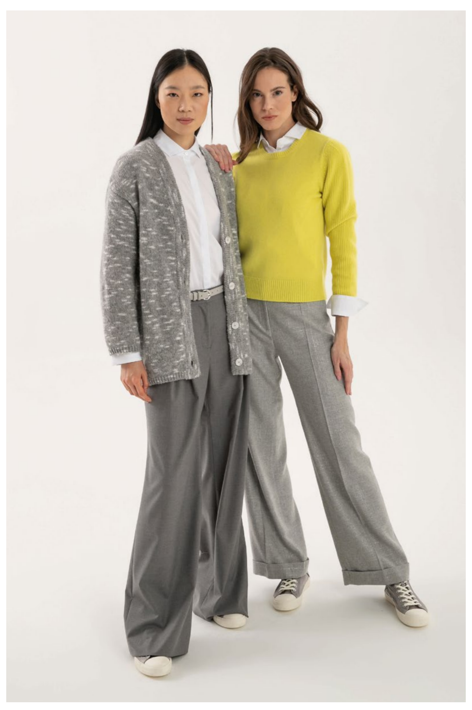
LEFT: Shirt in stretch popeline with chain embellishment, art. 5033 - Cardigan in wool and Alpaca, art. 2655 - Trousers in viscose micro-flannel, art. 3020 - Leather belt, art. 6036 RIGHT: Shirt in stretch popeline with chain embellishment, art. 5033 - Sweater in 100% cashmere, art. 2125 - Trousers in viscose and wool with lurex, art. 3028