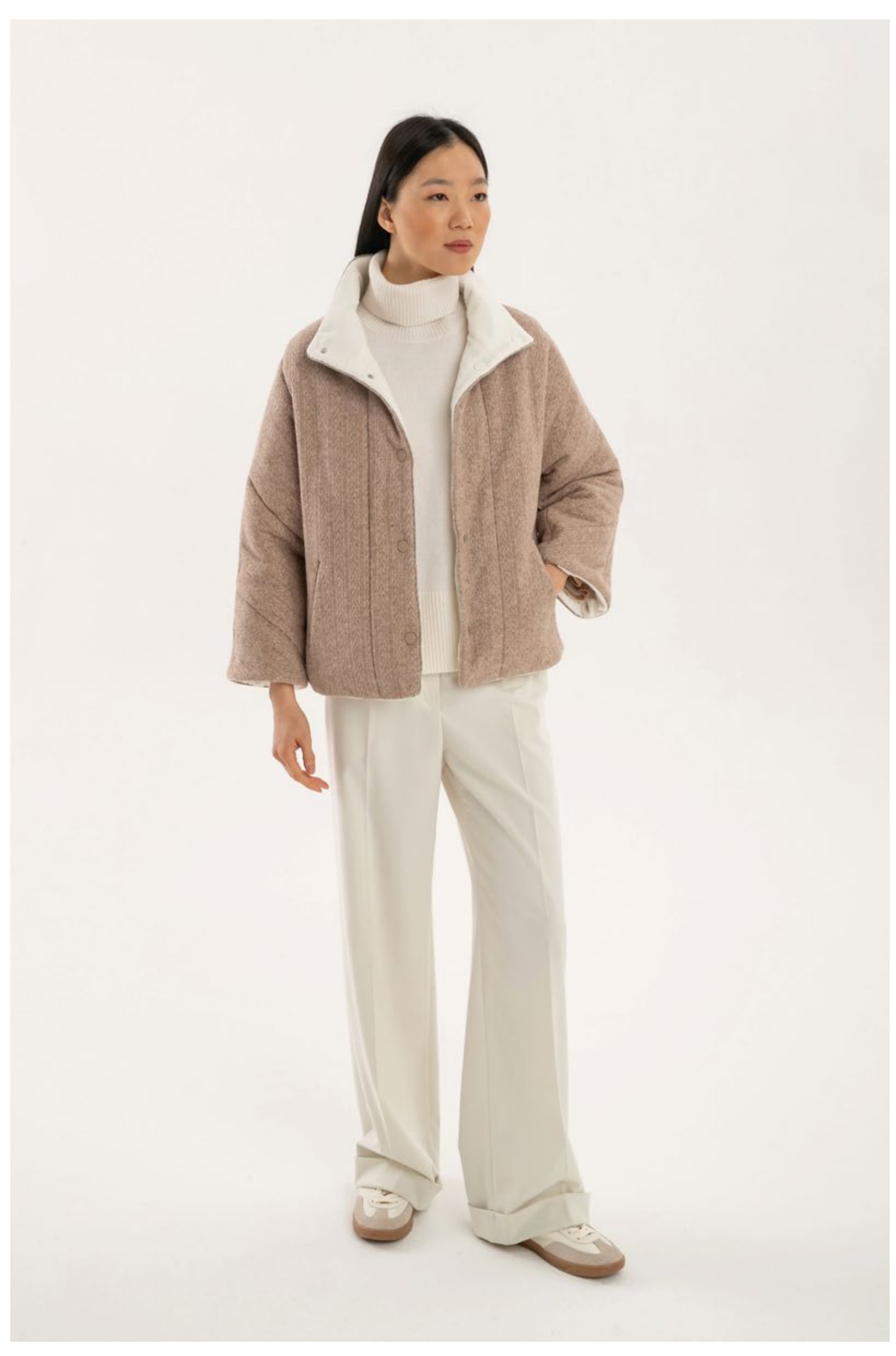
Sweater in 100% cashmere, art. 2134 Trousers in viscose micro-flannel, art. 3023 Double-face down jacket, art. 8091