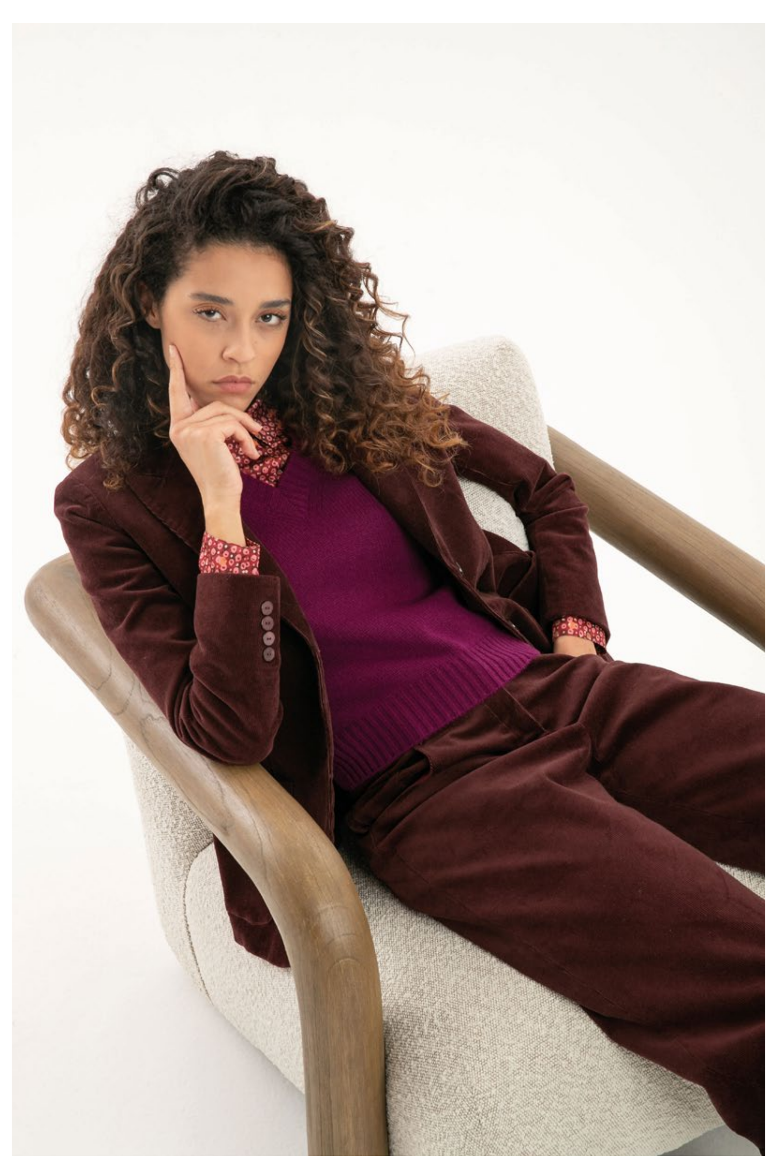
Printed shirt in stretch viscose, art. 5019 V-neck top in 100% cashmere, art. 2145 Trousers in cotton corduroy, art. 3043 Jacket in cotton corduroy, art. 8057