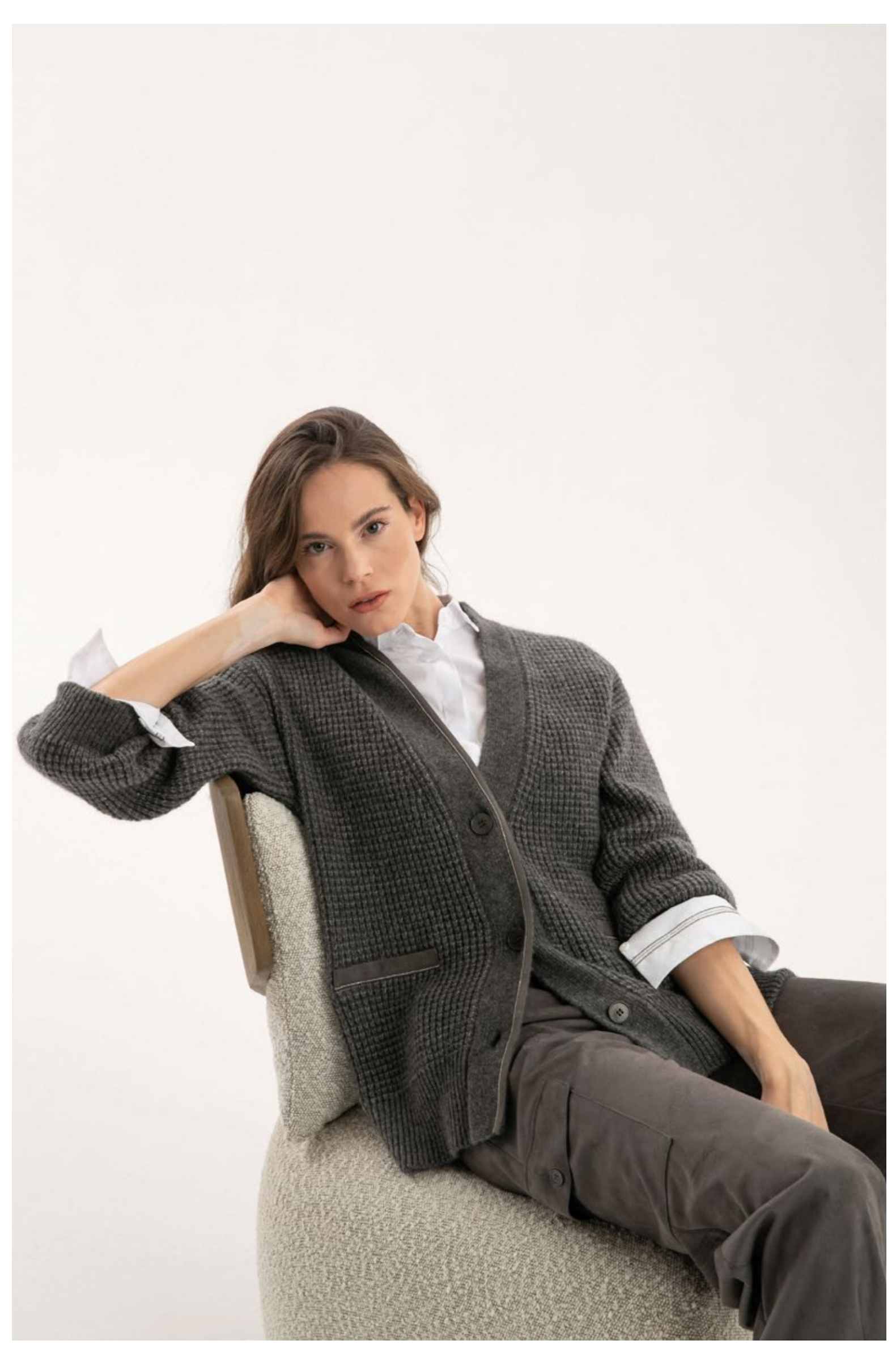
Shirt in stretch popeline with chain embellishment, art. 5033 Cardigan in cashmere and silk, art. 2613 Trousers in faux suede, art. 3015