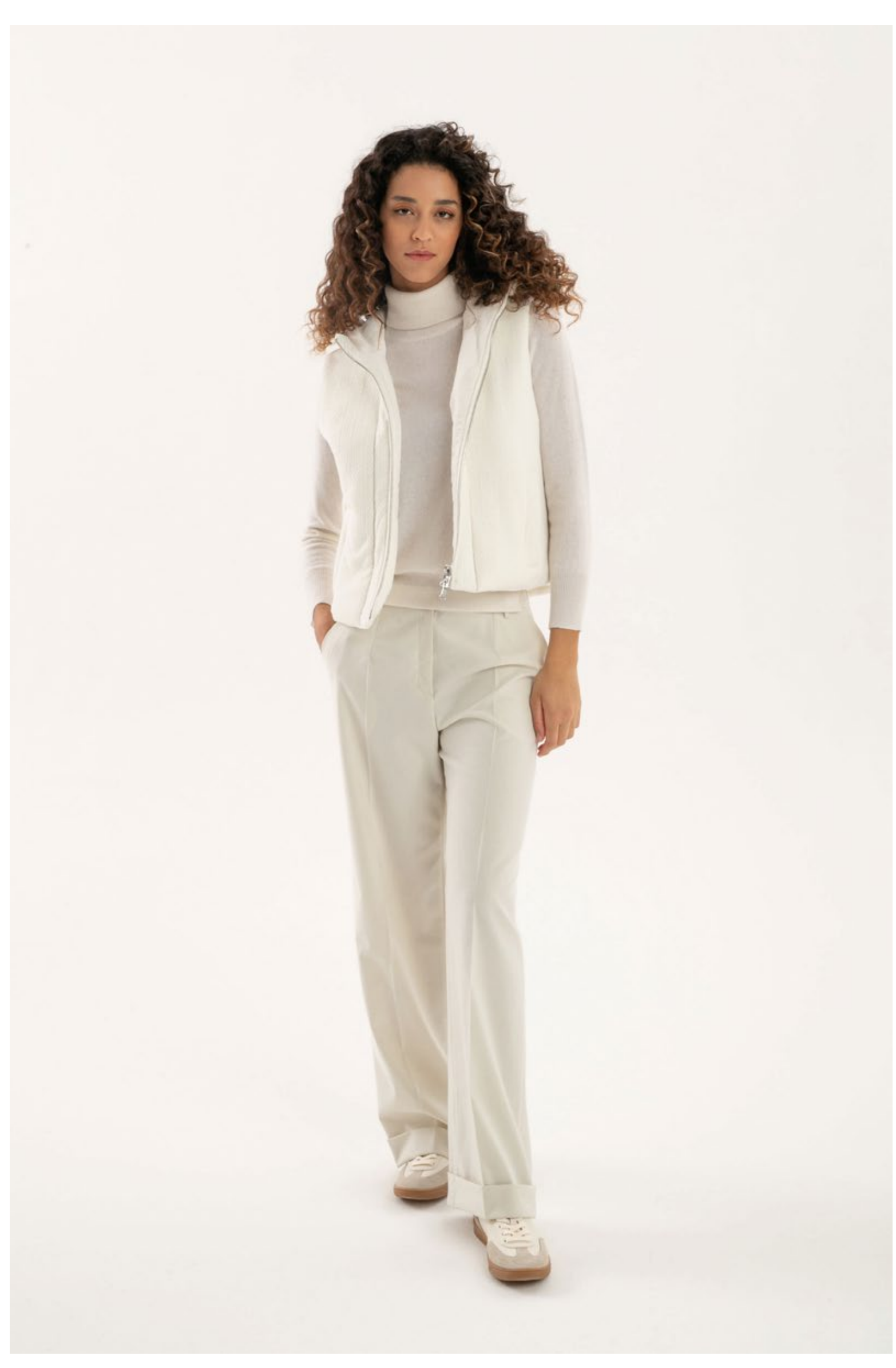
Sweater in 100% cashmere, art. 2152 Trousers in viscose micro-flannel, art. 3023 Sleeveless double-face down jacket, art. 8090