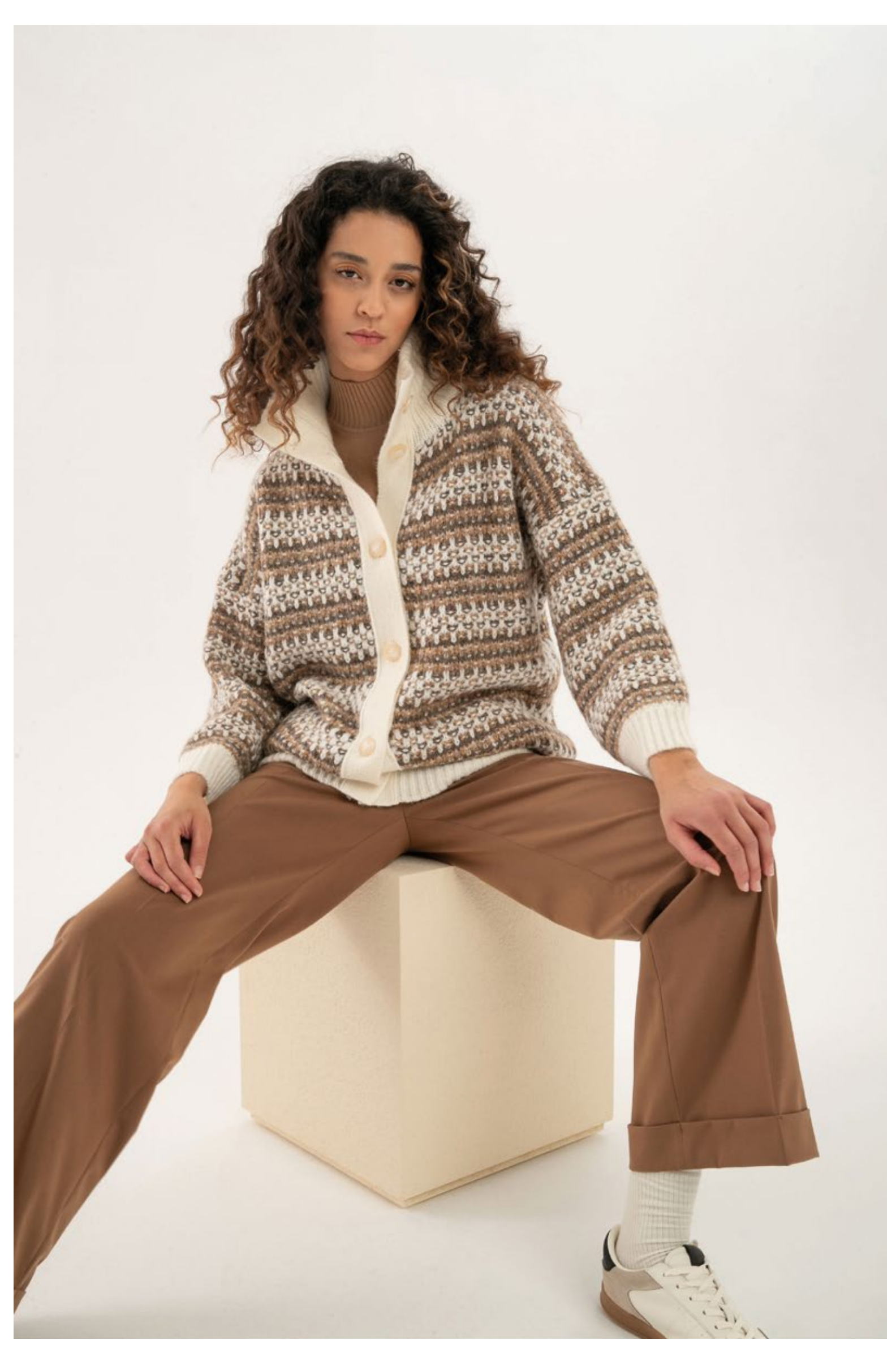
Turtle-neck top in wool and cashmere, art. 2203 Chunky cardigan in wool and Alpaca, art. 2700 Trousers in viscose micro-flannel, art. 3023