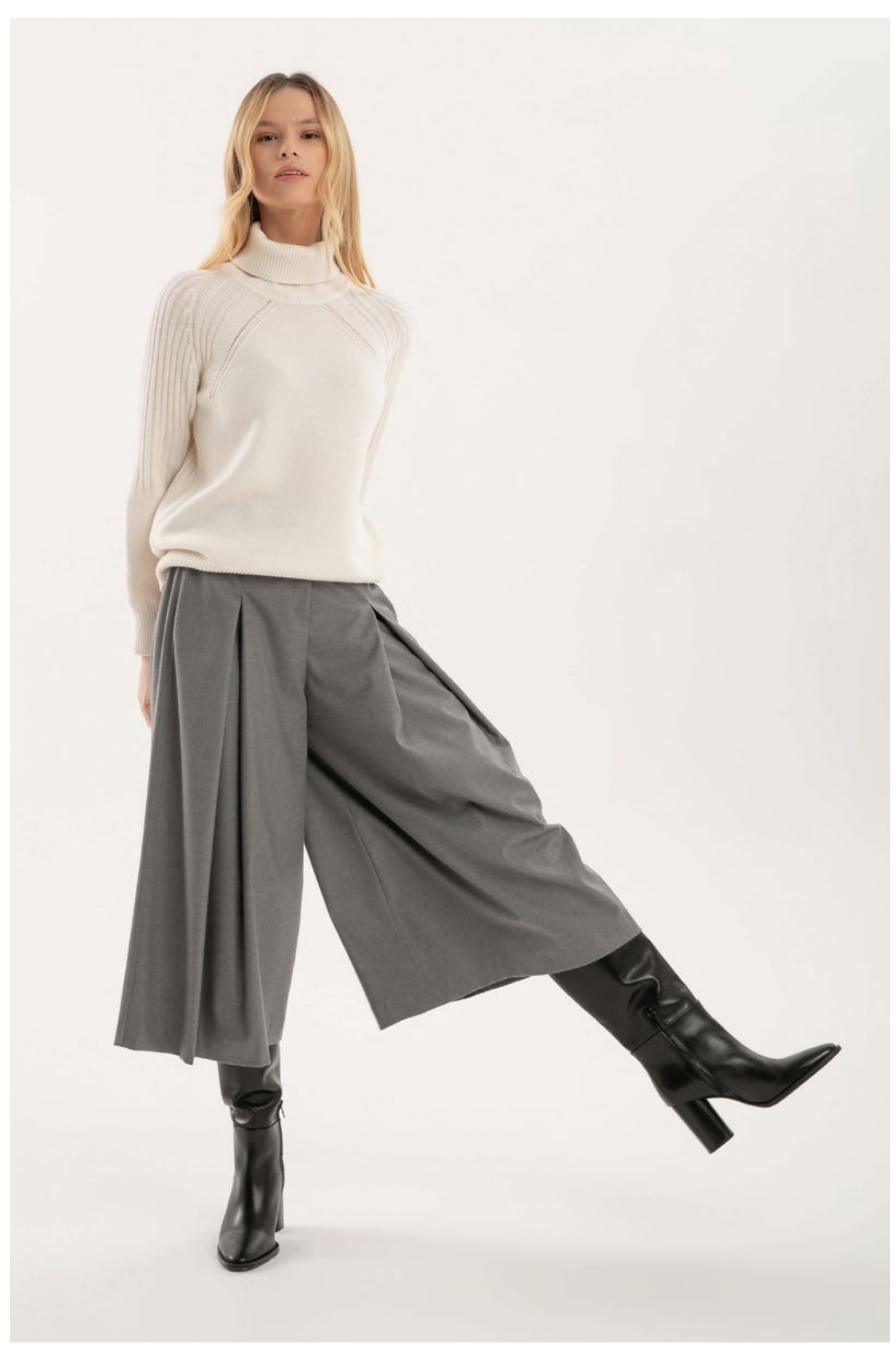
Turtle-neck sweater in wool and cashmere, art. 2211 Trousers in viscose micro-flannel, art. 3024