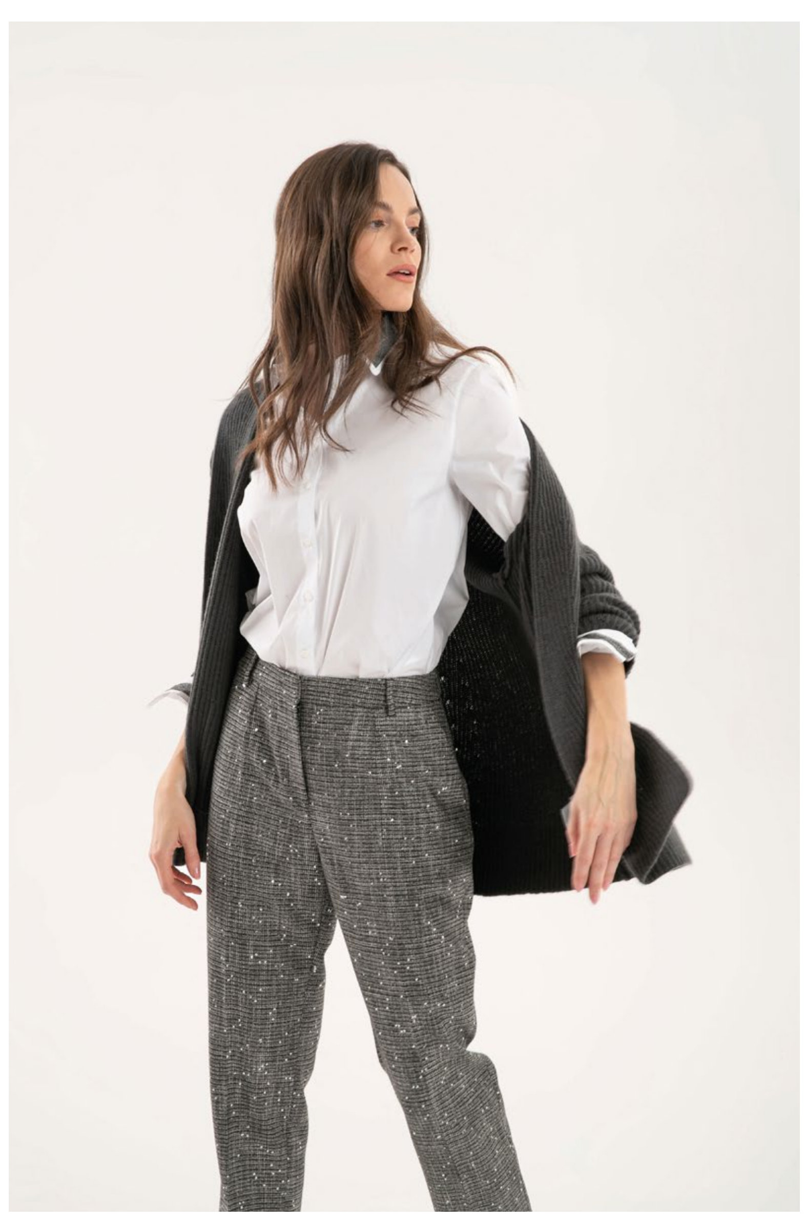
Shirt in stretch popeline with lurex and chain embellishment, art. 5030 Cardigan in wool and cashmere, art. 2227 Trousers with sequins, art. 3048