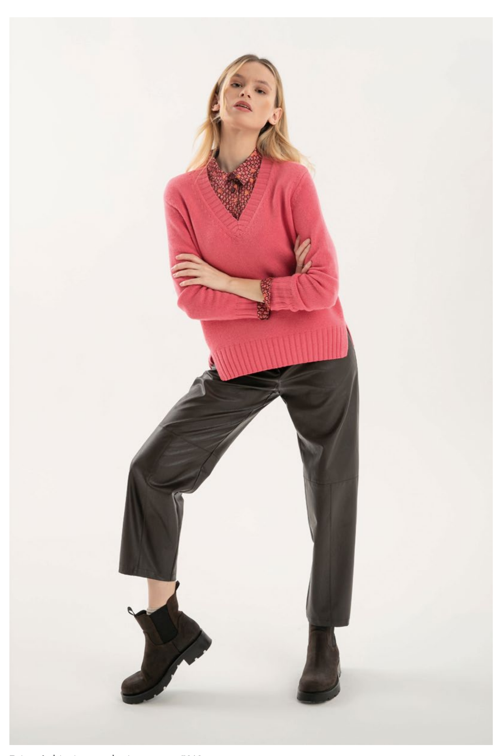
Printed shirt in stretch viscose, art. 5019 V-neck sweater in 100% cashmere, art. 2141 Trousers in faux leather, art. 3062