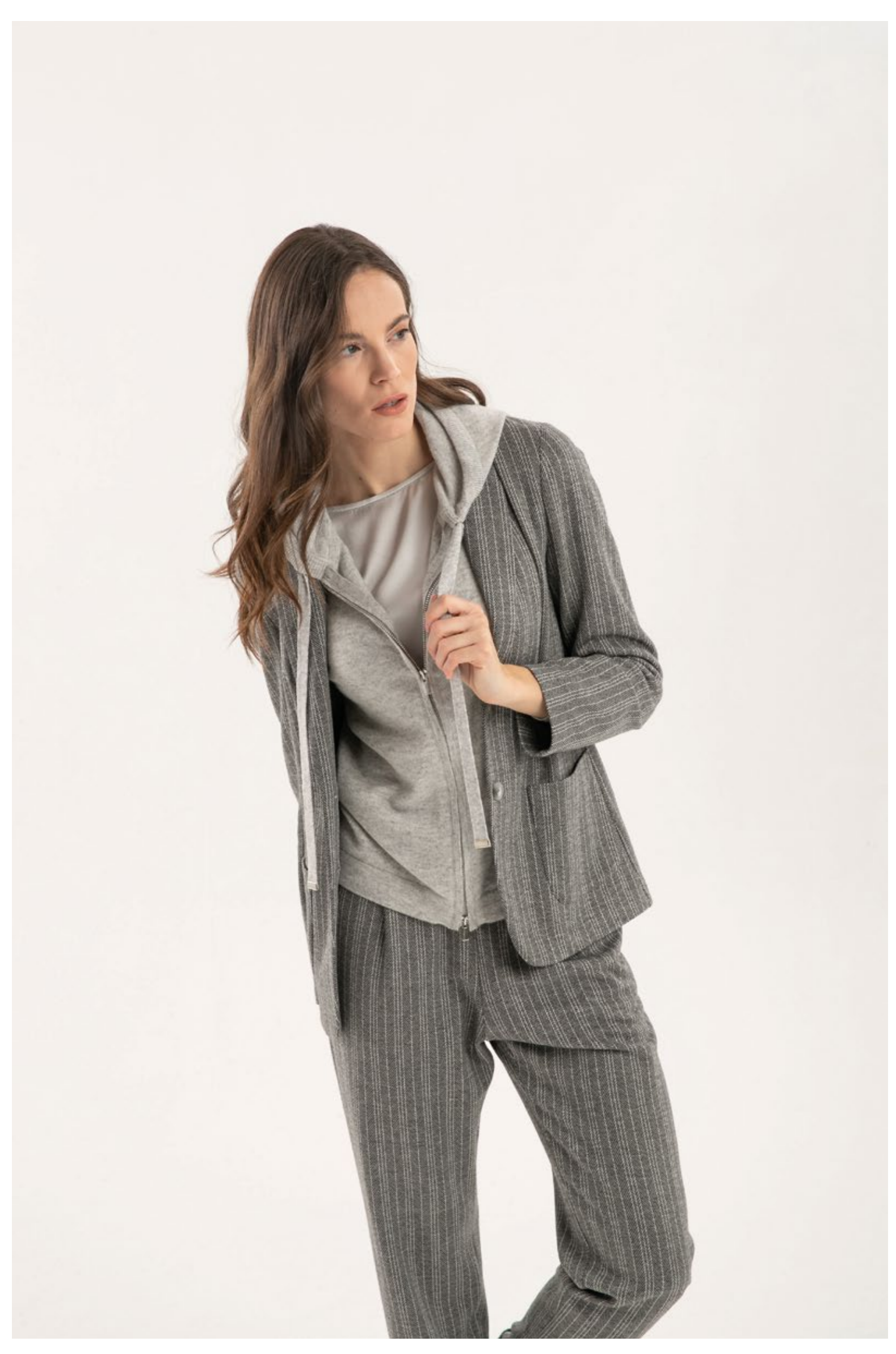
Top in satin silk stretch, art. 1907 Hooded sweater in 100% cashmere, art. 2109 Trousers in jacquard, art. 3006 Jacket in jacquard, art. 8006