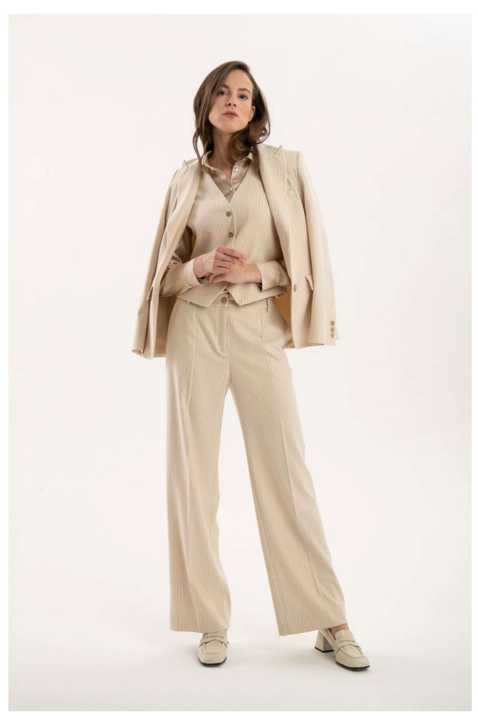
Shirt in satin silk stretch, art. 5001 Vest in pinstripe viscose and cotton, art. 8037 Jacket in pinstripe viscose and cotton, art. 8036 Trousers in pinstripe viscose and cotton, art. 3032