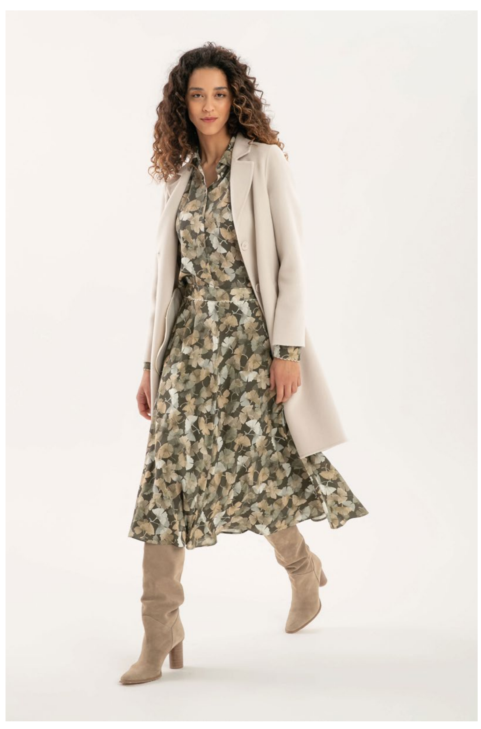
Printed shirt in stretch viscose, art. 5014 Printed skirt in stretch viscose, art. 3058 Coat in double fabric wool and cashmere, art. 8110