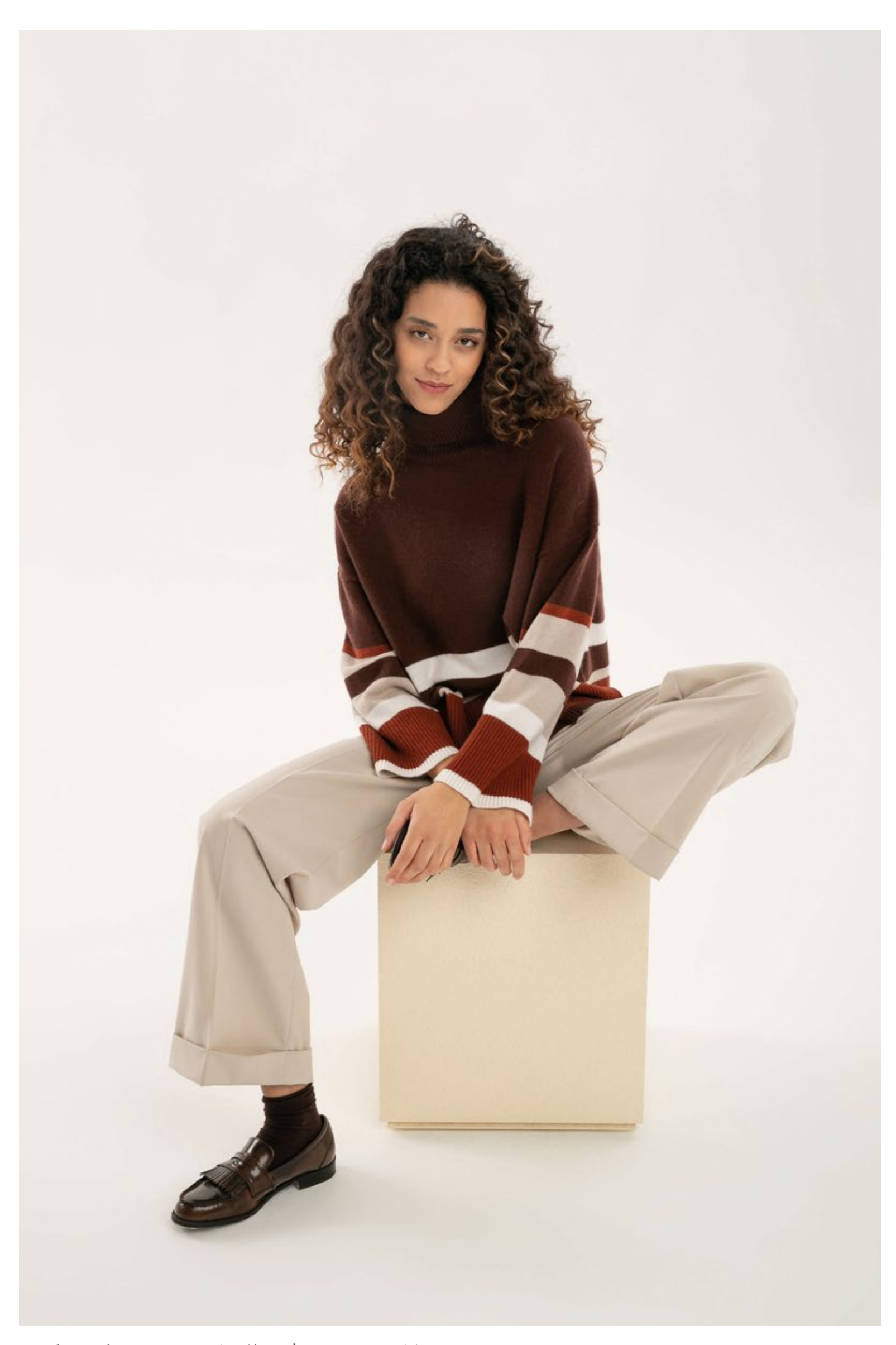
Turtle-neck sweater in 100% cashmere, art. 2168 Trousers in viscose micro-flannel, art. 3023