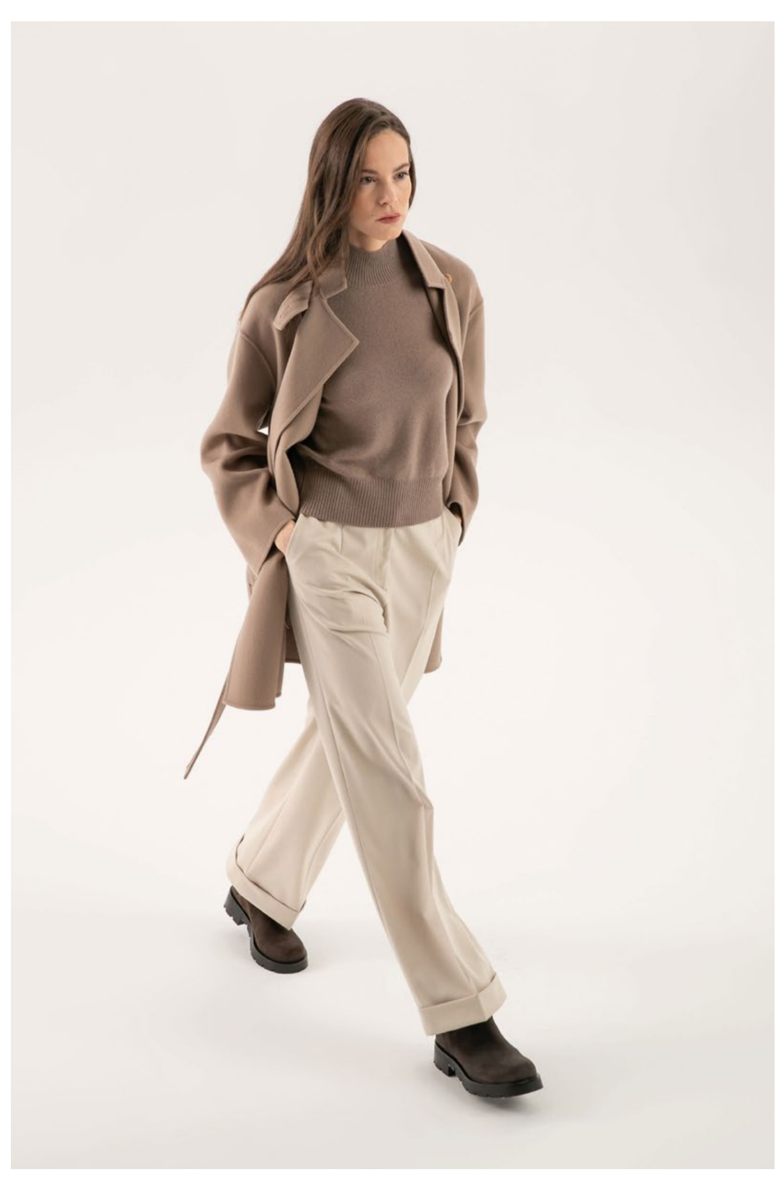
High neck top in 100% cashmere, art. 2115 Trousers in viscose micro-flannel, art. 3023 Coat in double fabric wool and cashmere, art. 8107