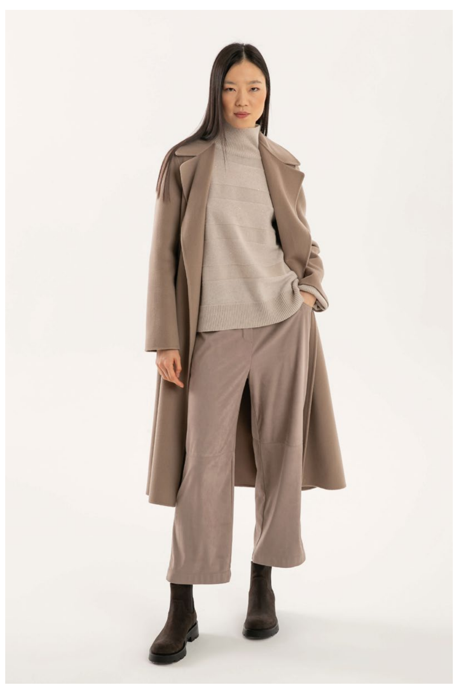
Turtle-neck sweater in cashmere with sequins, art. 2635 Trousers in faux suede, art. 3018 Coat in double fabric wool and cashmere, art. 8109