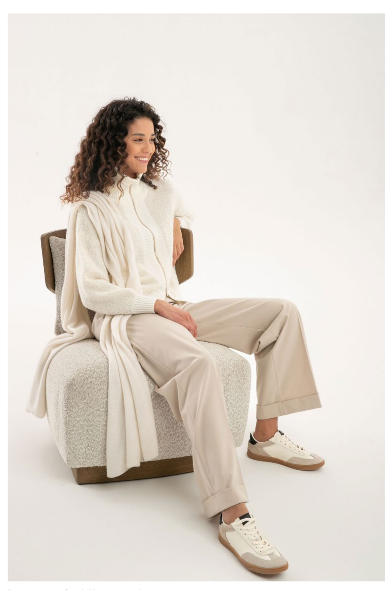
Sweater in wool and Alpaca, art. 2645 Trousers in viscose micro-flannel, art. 3023 Scarf in 100% cashmere, art. 6014