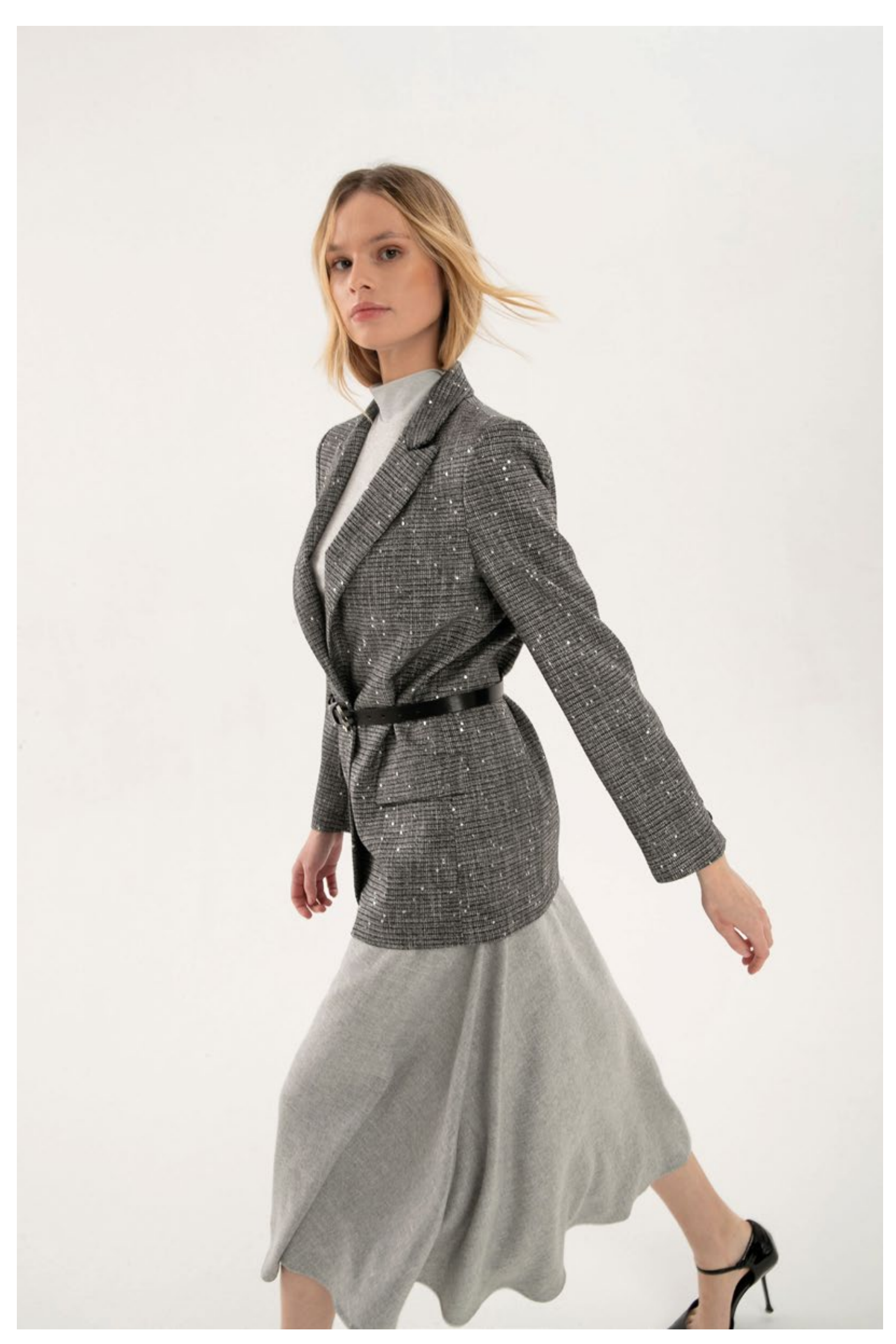
High neck top in jersey lurex, art. 1331 Skirt in viscose and wool with lurex, art. 3029 Jacket with sequins, art. 8051 Leather belt, art. 6038