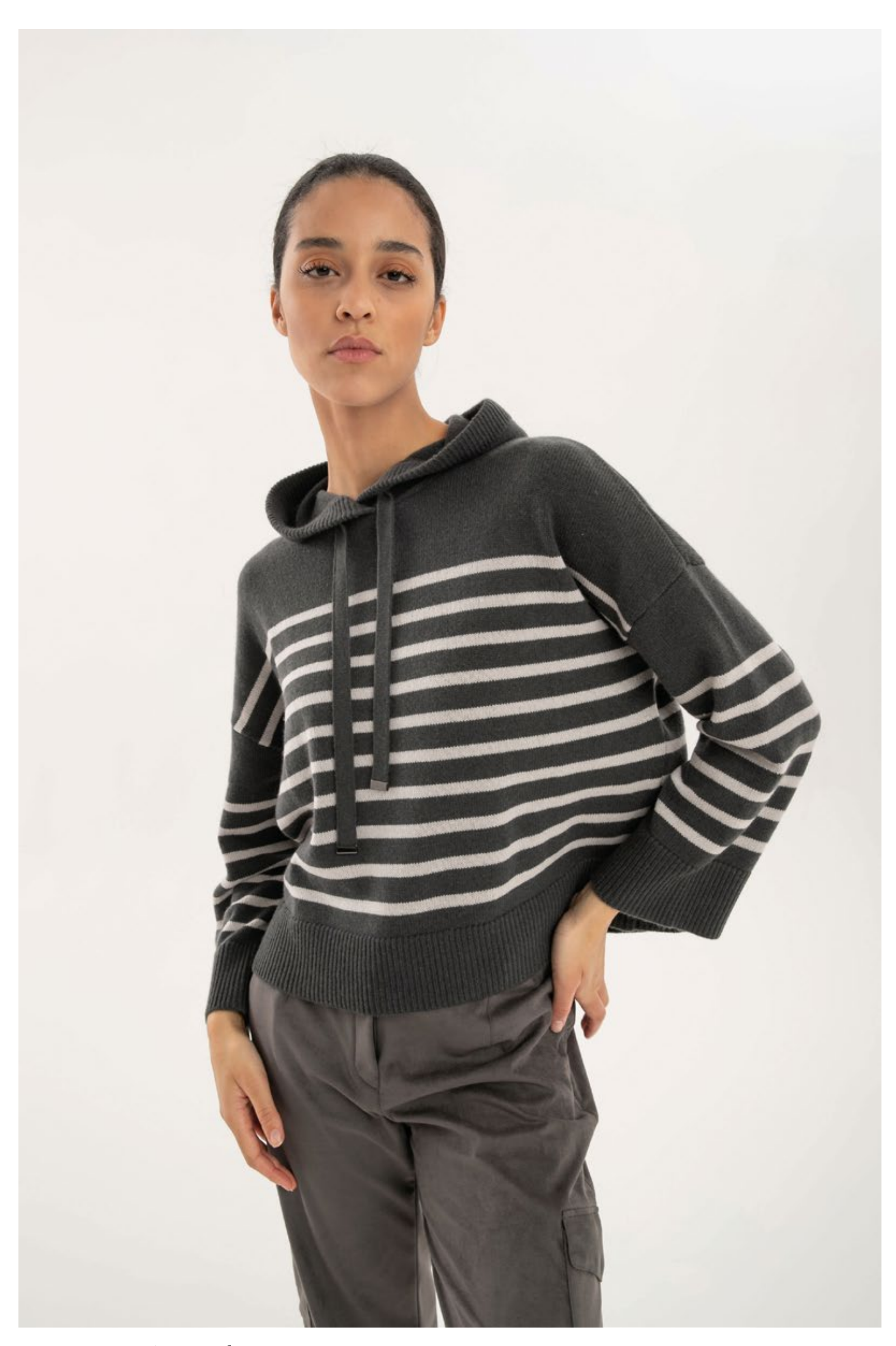
Sweater in wool and cashmere, art. 2230 Trousers in faux suede, art. 3015