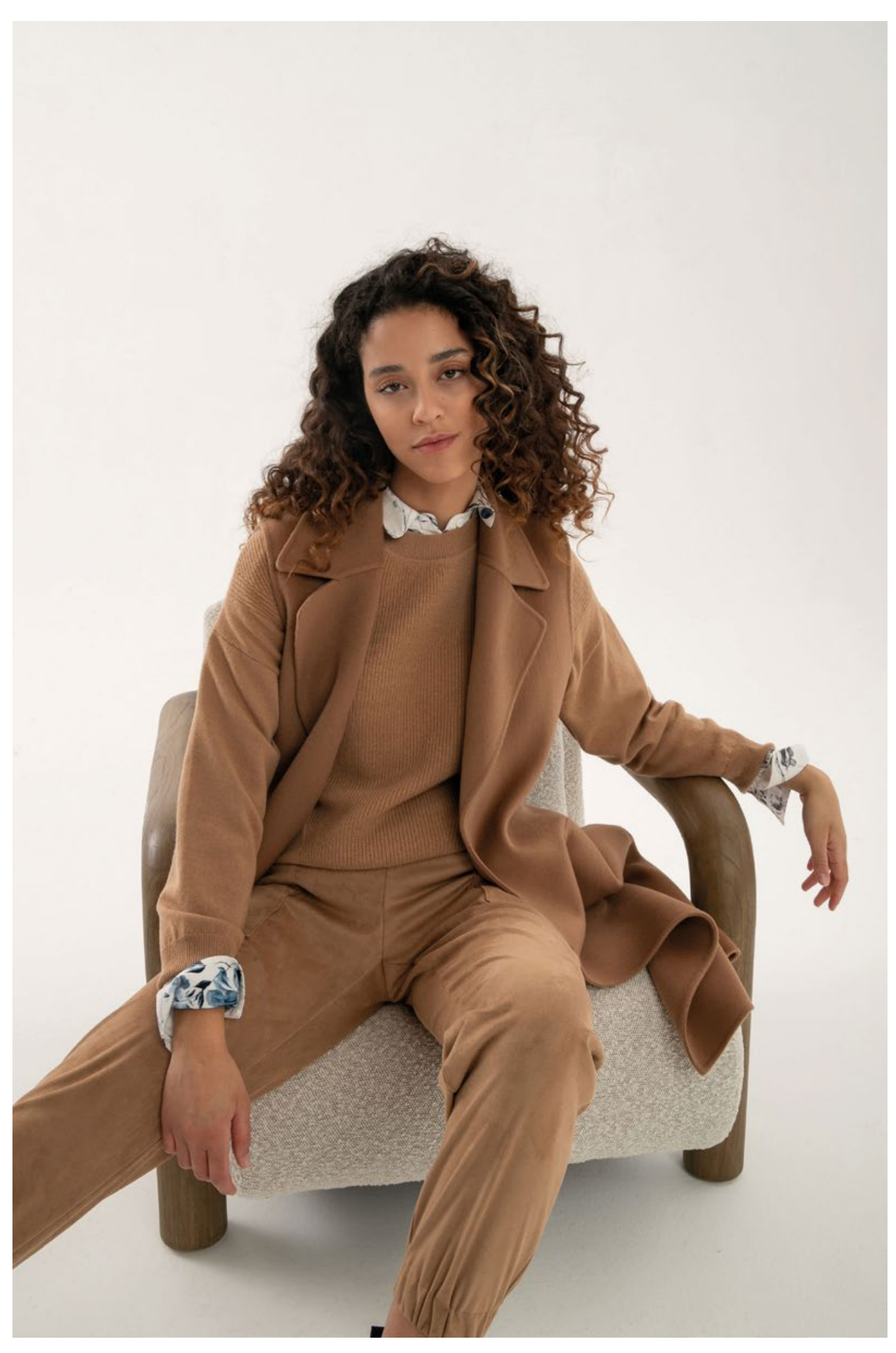
Printed shirt in viscose jacquard, art. 5006 Sweater in wool and cashmere, art. 2214 Trousers in faux suede, art. 3017 Gilet in double fabric wool and cashmere, art. 8108