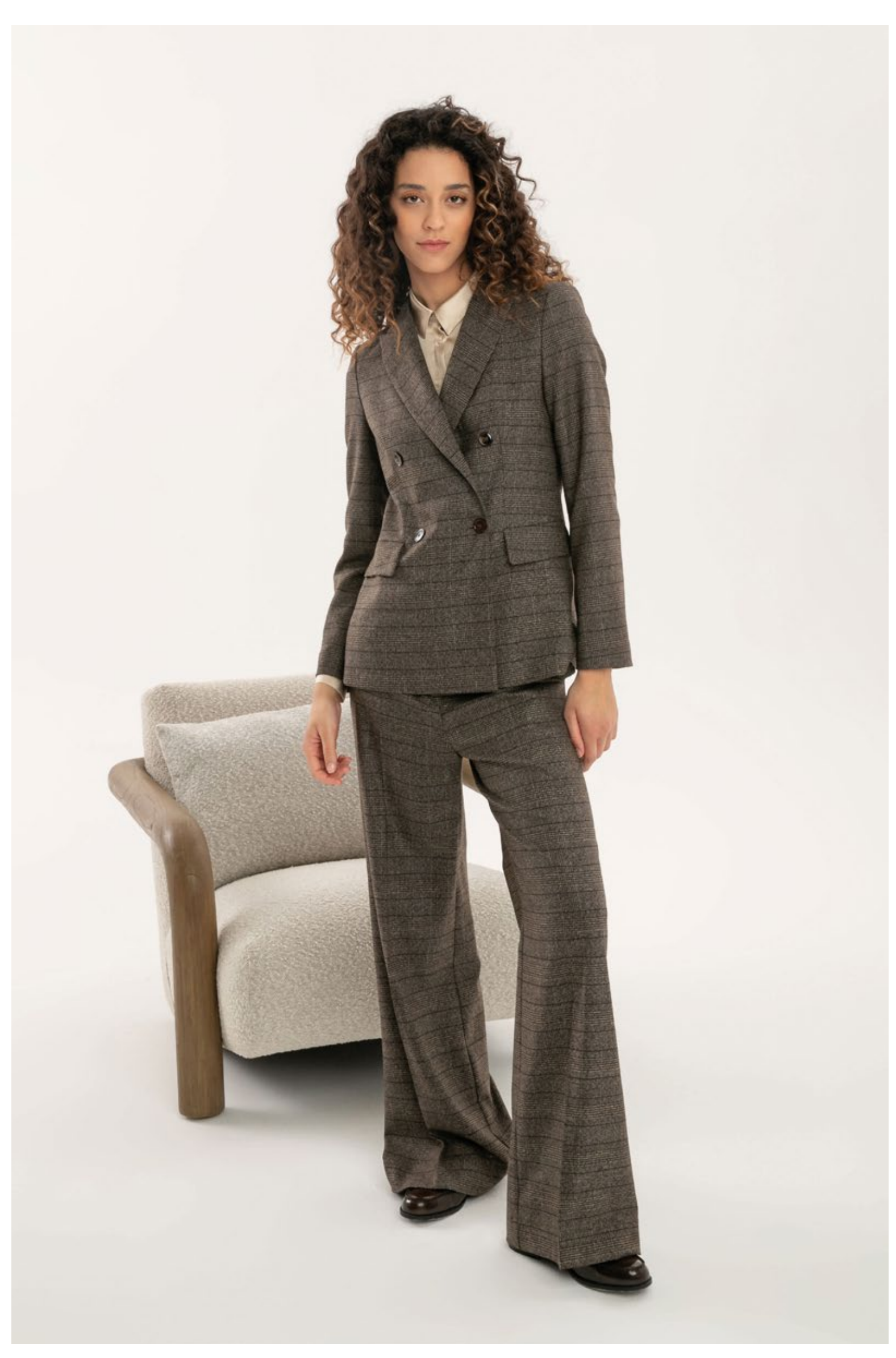
Shirt in satin silk stretch, art. 5001 Jacket, art. 8041 var. 135 brown check Trousers, art. 3036 var. 135 brown check