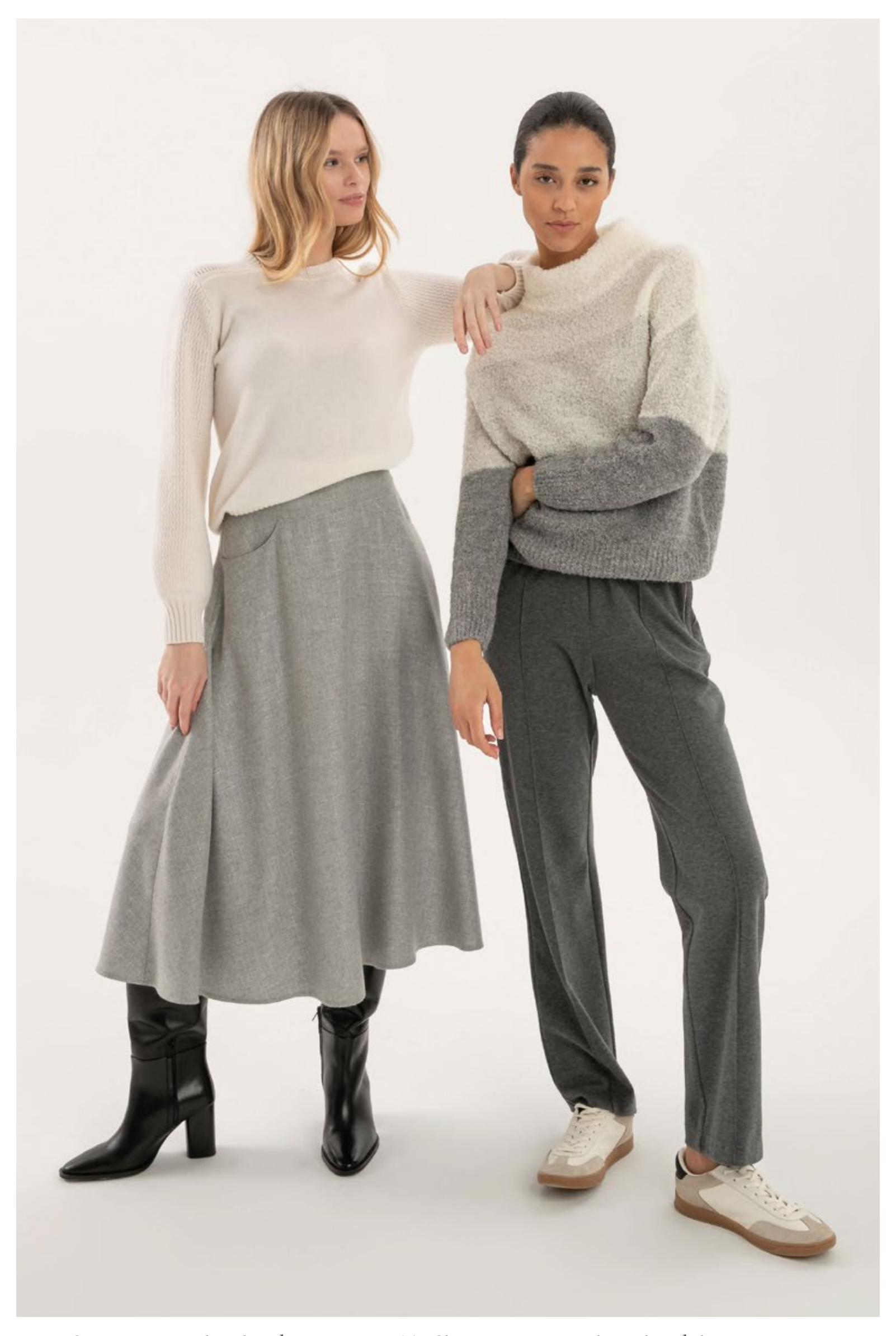
LEFT: Sweater in wool and cashmere, art. 2216 - Skirt in viscose and wool with lurex, art. 3029 RIGHT: High neck sweater in wool and Alpaca, art. 2647 - Cotton pants, art. 3003