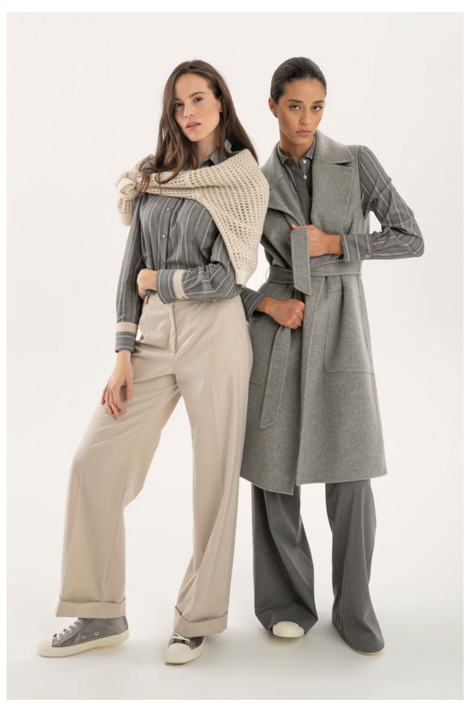
LEFT: Pinstripe shirt in cotton, art. 5044 - Trousers in viscose micro-flannel, art. 3023 - On shoulder: Sweater in cashmere and silk with lurex, art. 2600 RIGHT: Pinstripe shirt in cotton, art. 5045 - Trousers in viscose micro-flannel, art. 3020 - Gilet in

RIGHT: Pinstripe shirt in cotton, art. 5045 - Trousers in viscose micro-flannel, art. 3020 - Gilet in double fabric wool and cashmere, art. 8108