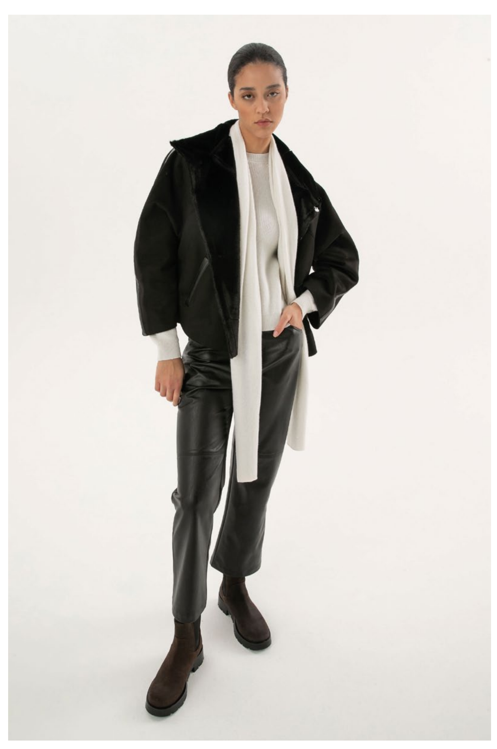
Sweater in cashmere with sequins, art. 2630 Trousers in faux leather, art. 3061 Jacket with faux fur, art. 8096 Scarf in cashmere with sequins, art. 6012