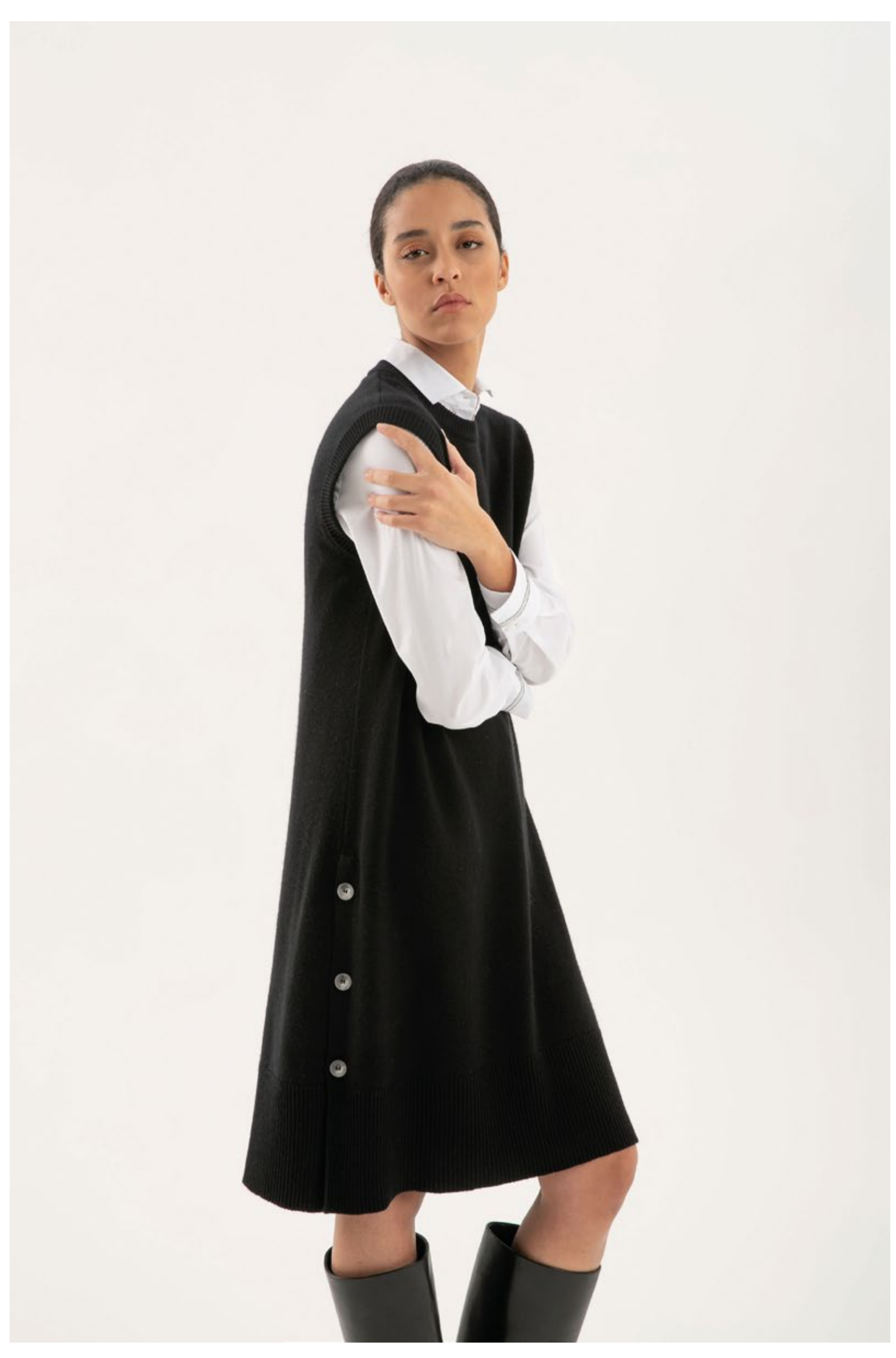
Shirt in stretch popeline with chain embellishment, art. 5033 Sleeveless dress in wool and cashmere, art. 2258