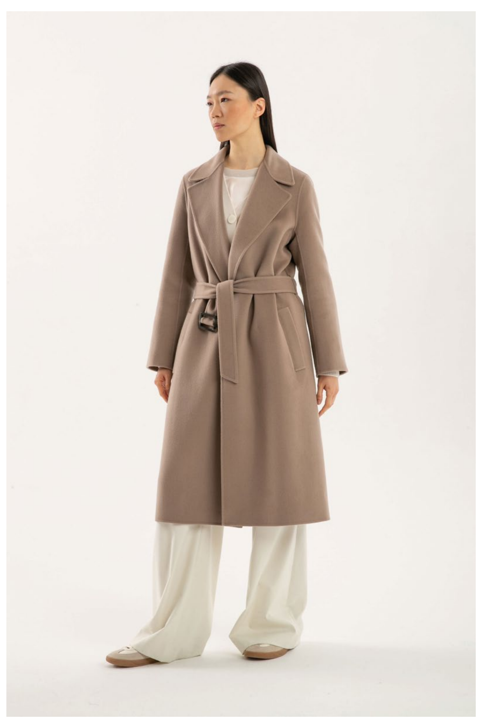
Sleeveless top in satin silk stretch with knitted collar, art. 1905 Cardigan in wool and cashmere, art. 2225 Trousers in viscose micro-flannel, art. 3020 Coat in double fabric wool and cashmere, art. 8109