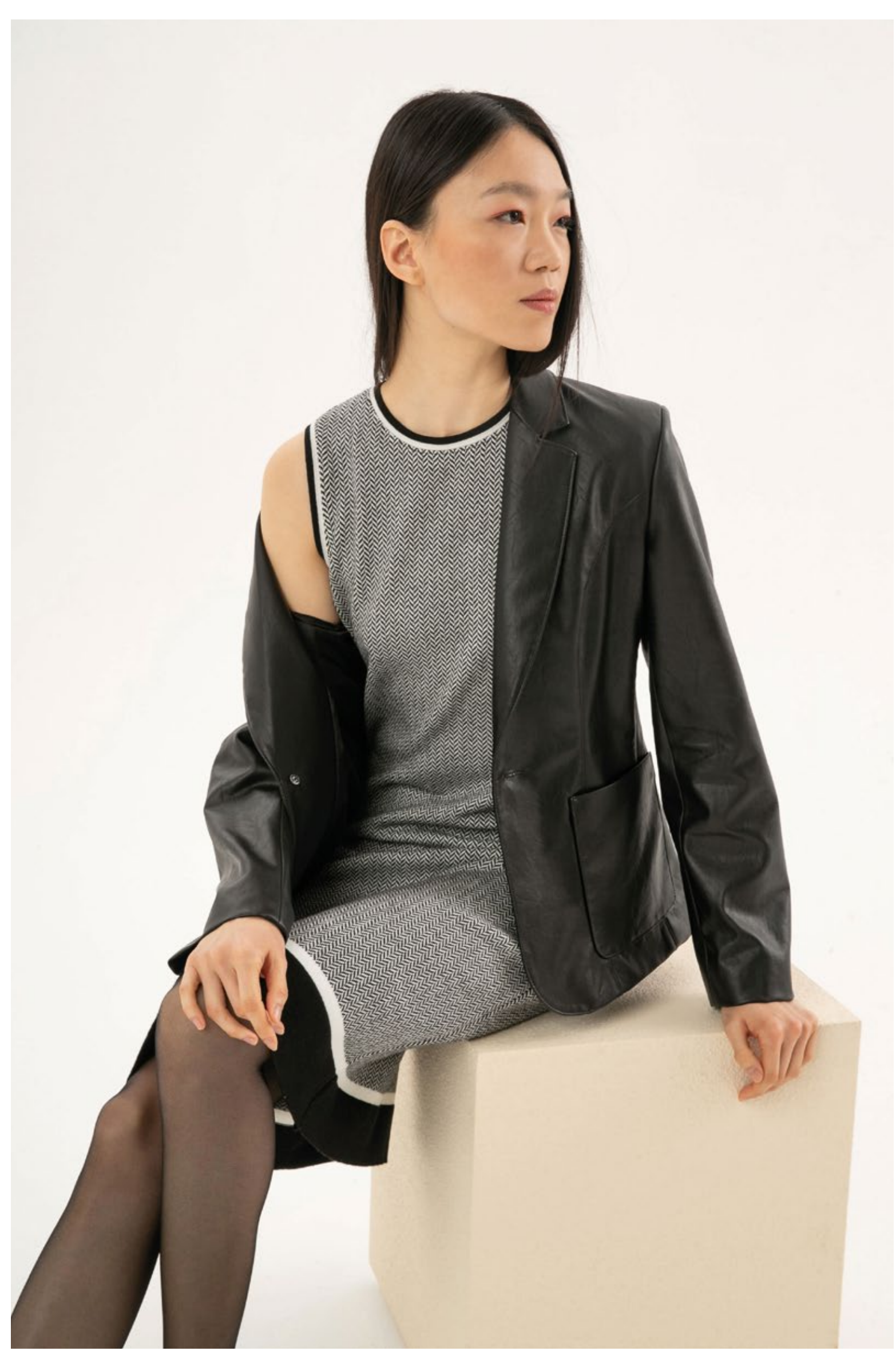
Sleeveless dress in Merino wool, art. 2515 Jacket in faux leather, art. 8079