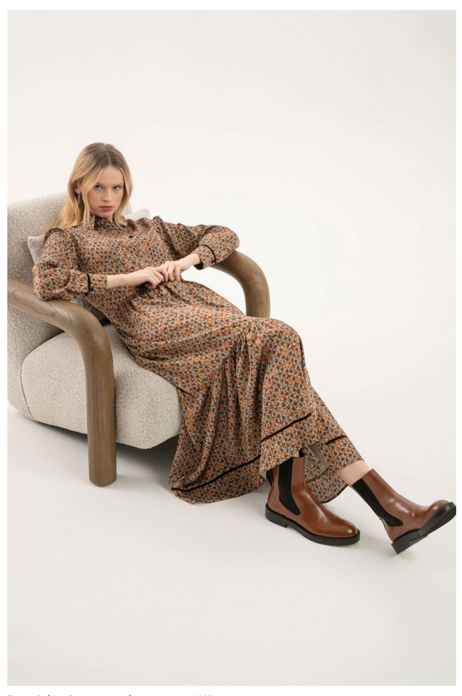
Printed shirt dress in stretch viscose, art. 4015