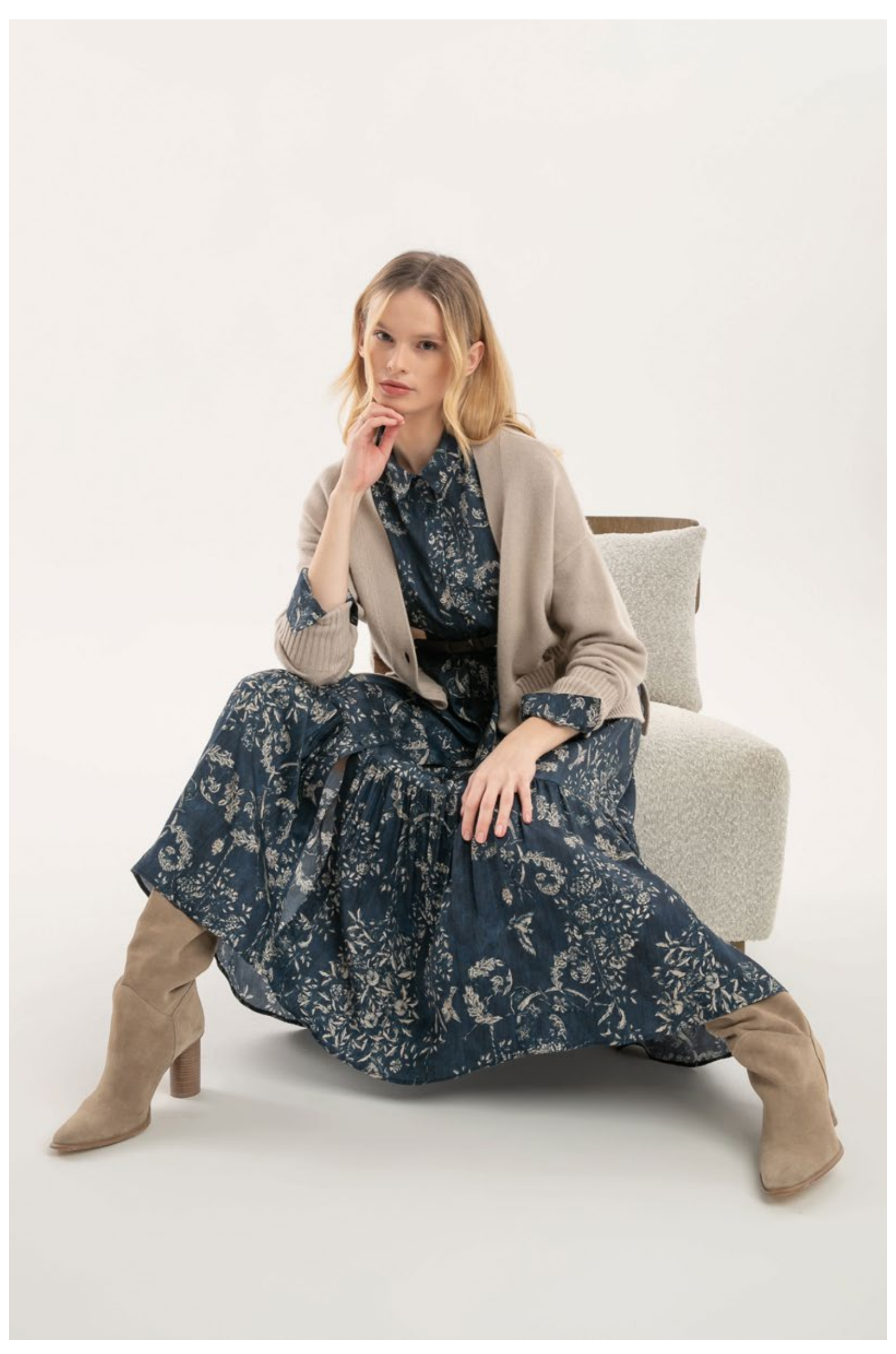
Printed shirt dress in lyocell and viscose, art. 4005 Cardigan in 100% cashmere, art. 2121 Leather belt, art. 6035