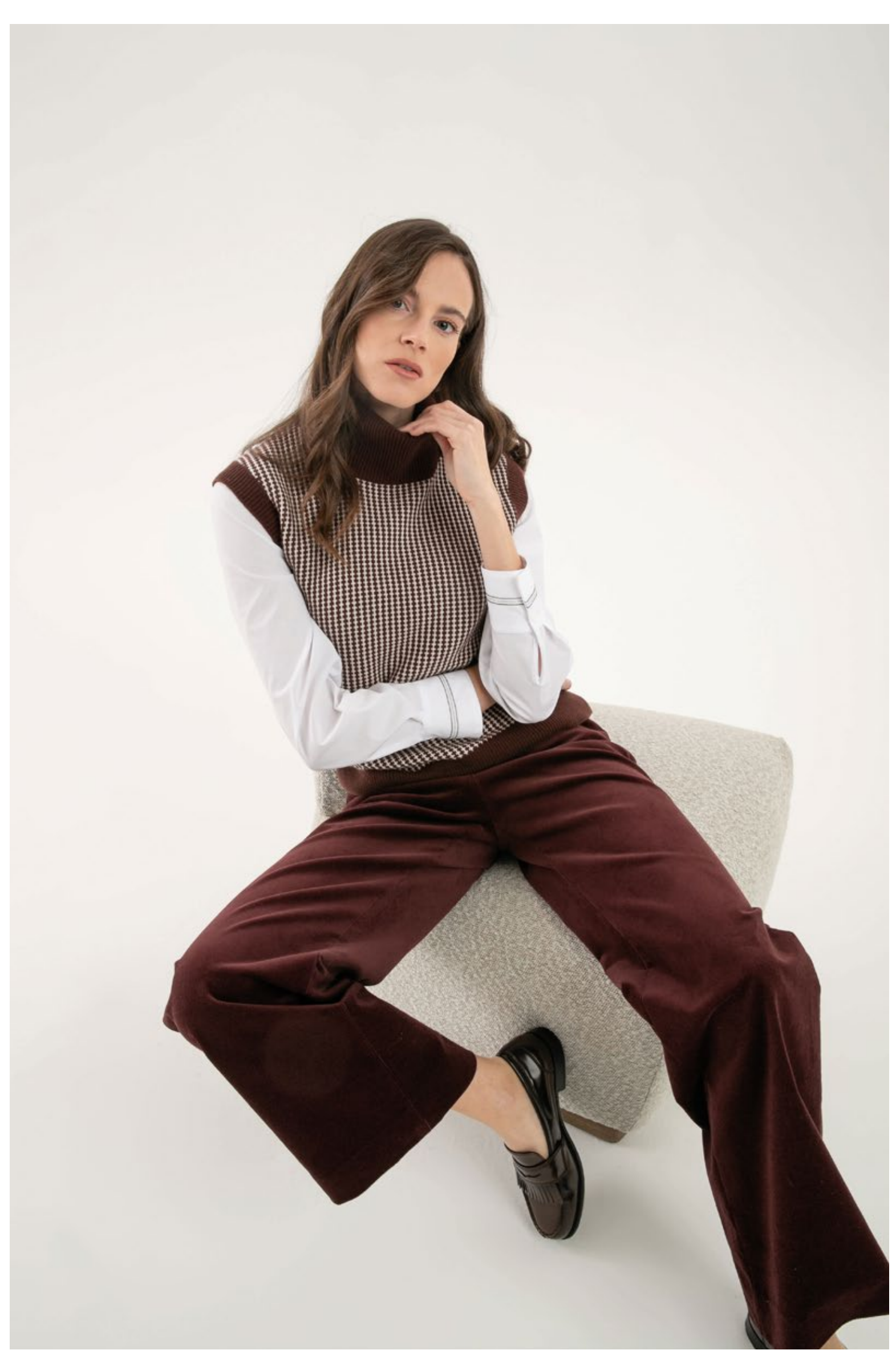
Shirt in stretch popeline with chain embellishment, art. 5033 Turtle-neck gilet in 100% cashmere, art. 2112 Trousers in cotton corduroy, art. 3043