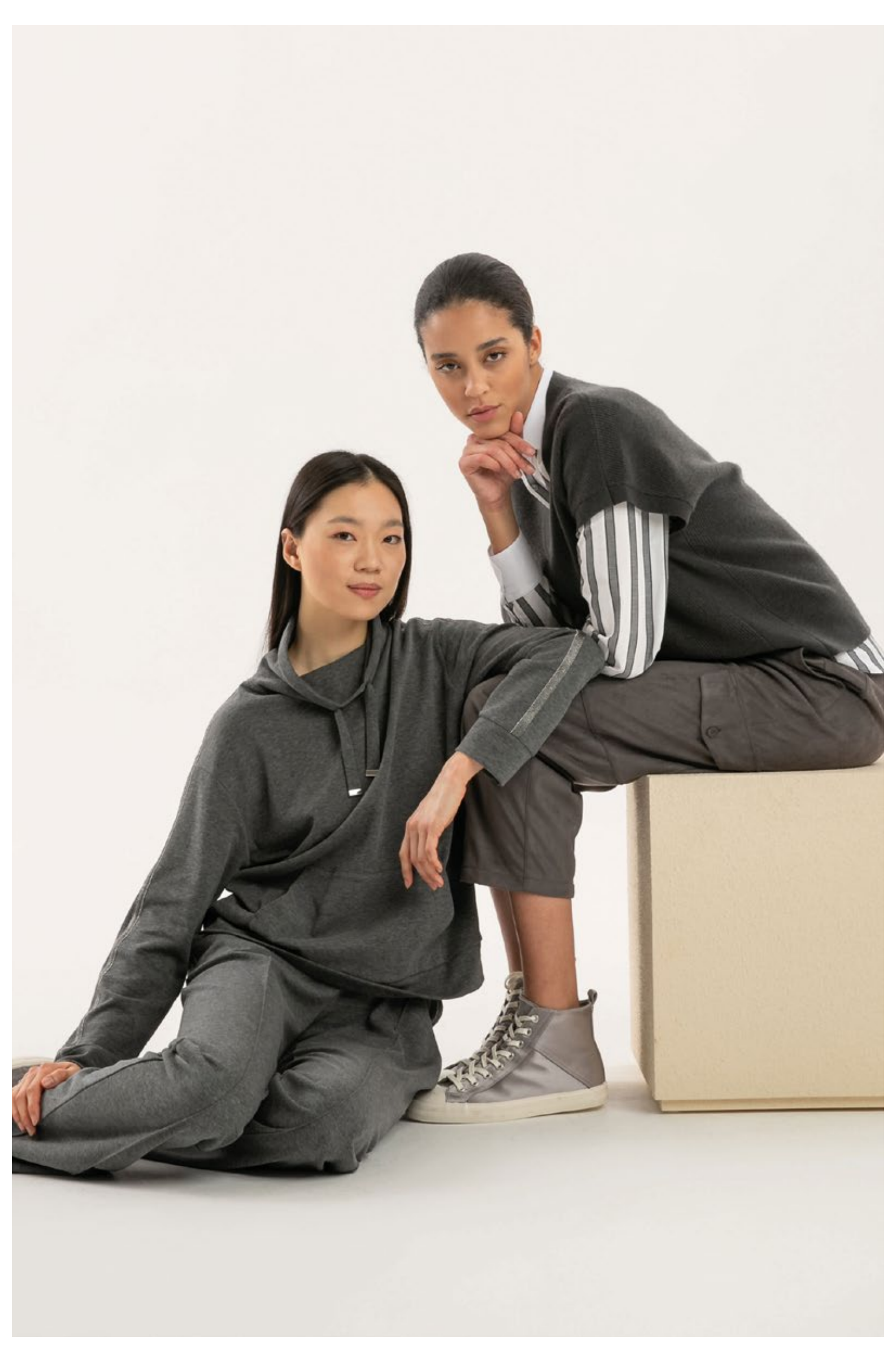
LEFT: Cotton sweater, art. 1803 - Cotton pants, art. 3003 RIGHT: Cabana pinstripe shirt in cotton, art. 5042 - Sleeveless sweater in 100% cashmere, art. 2108 - Trousers in faux suede, art. 3015