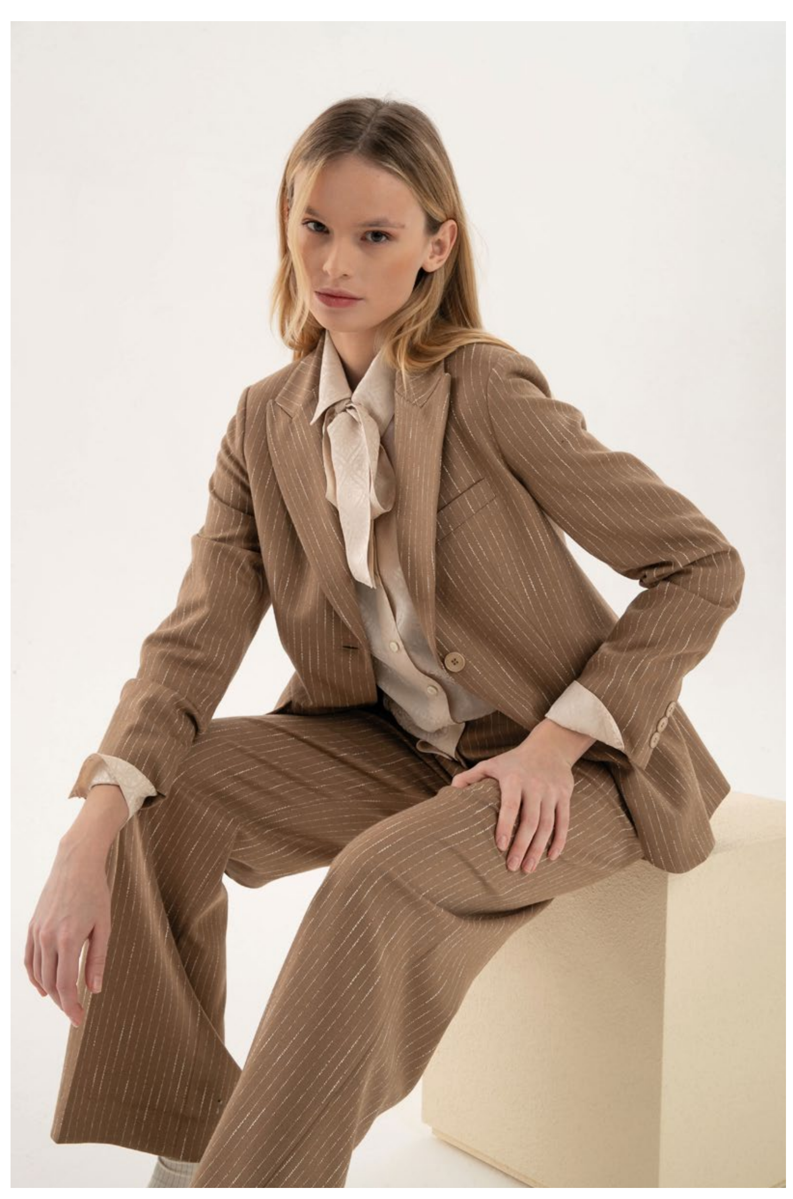
Shirt in satin viscose jacquard, art. 5024 Jacket in pinstripe viscose and cotton, art. 8036 Trousers in pinstripe viscose and cotton, art. 3032