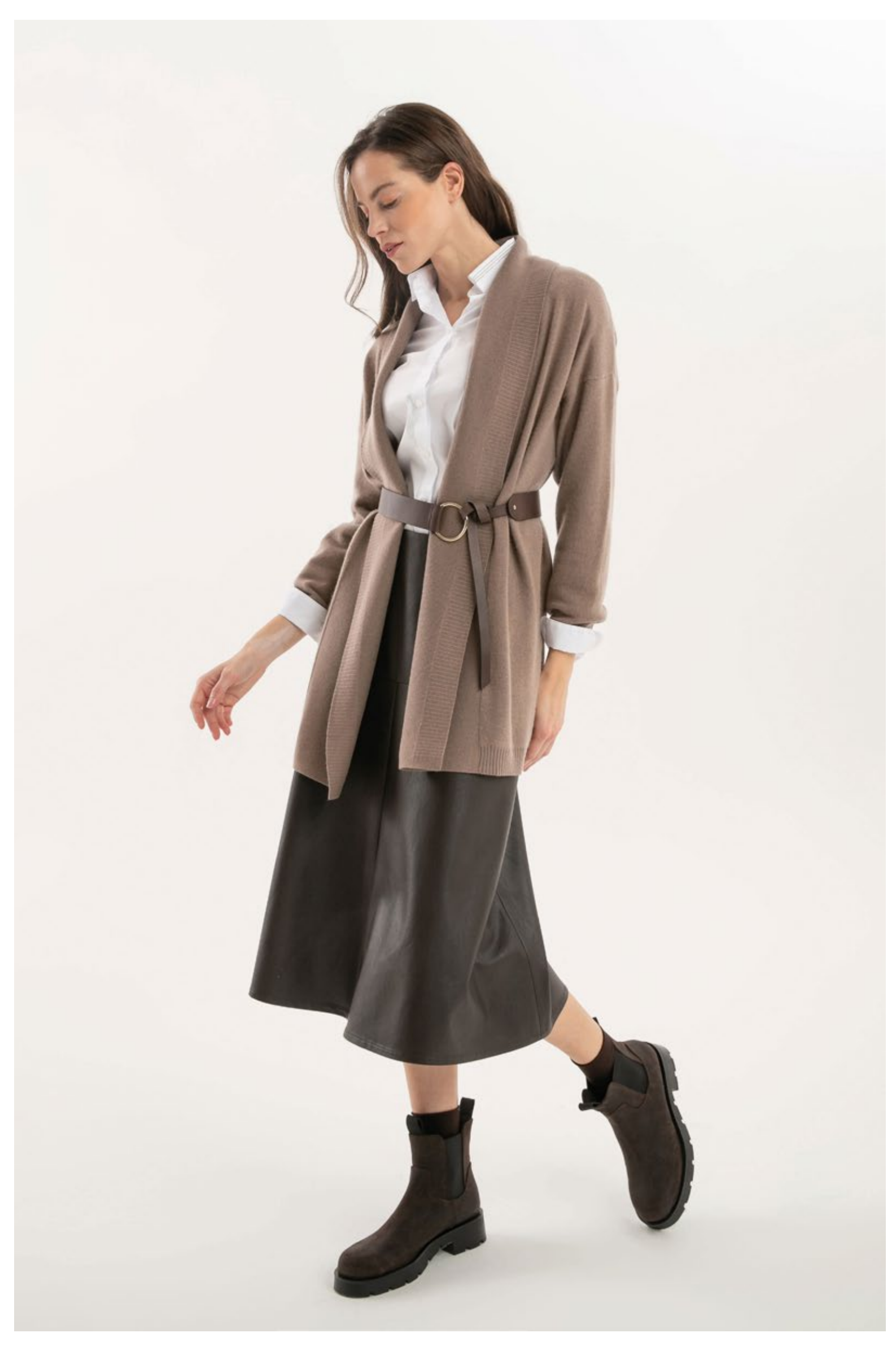
Shirt in stretch popeline with chain embellishment, art. 5034 Cardigan in 100% cashmere, art. 2116 Skirt in faux leather, art. 3064 Leather belt, art. 6032