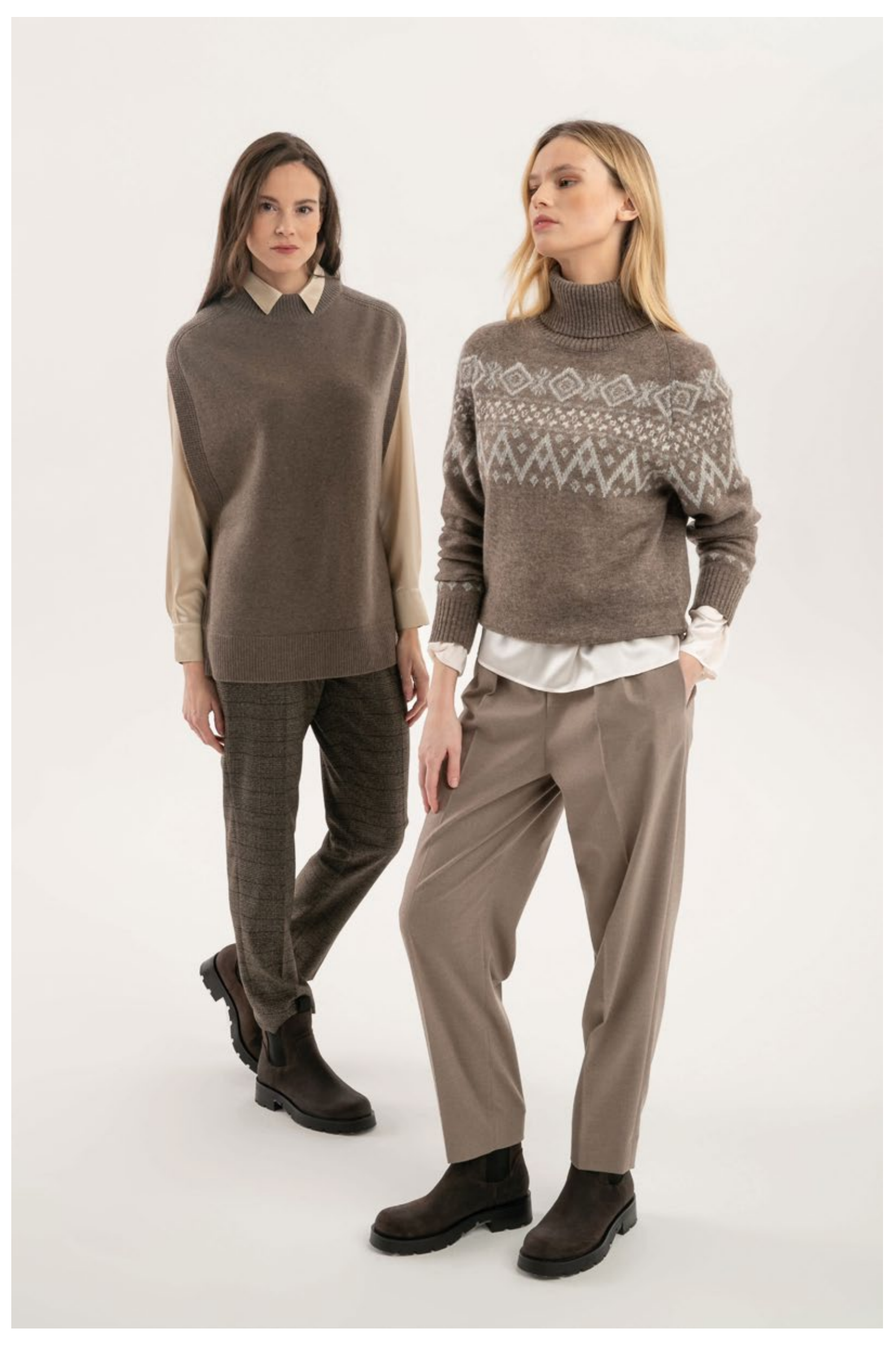
LEFT: Shirt in satin silk stretch, art. 5001 - Gilet in wool and cashmere, art. 2217 - Trousers, art. 3037 var. 135 brown check

RIGHT: Blouse in satin silk stretch, art. 1910 - Turtle-neck sweater in super kid mohair and silk, art. 2681 - Trousers in viscose micro-flannel, art. 3022