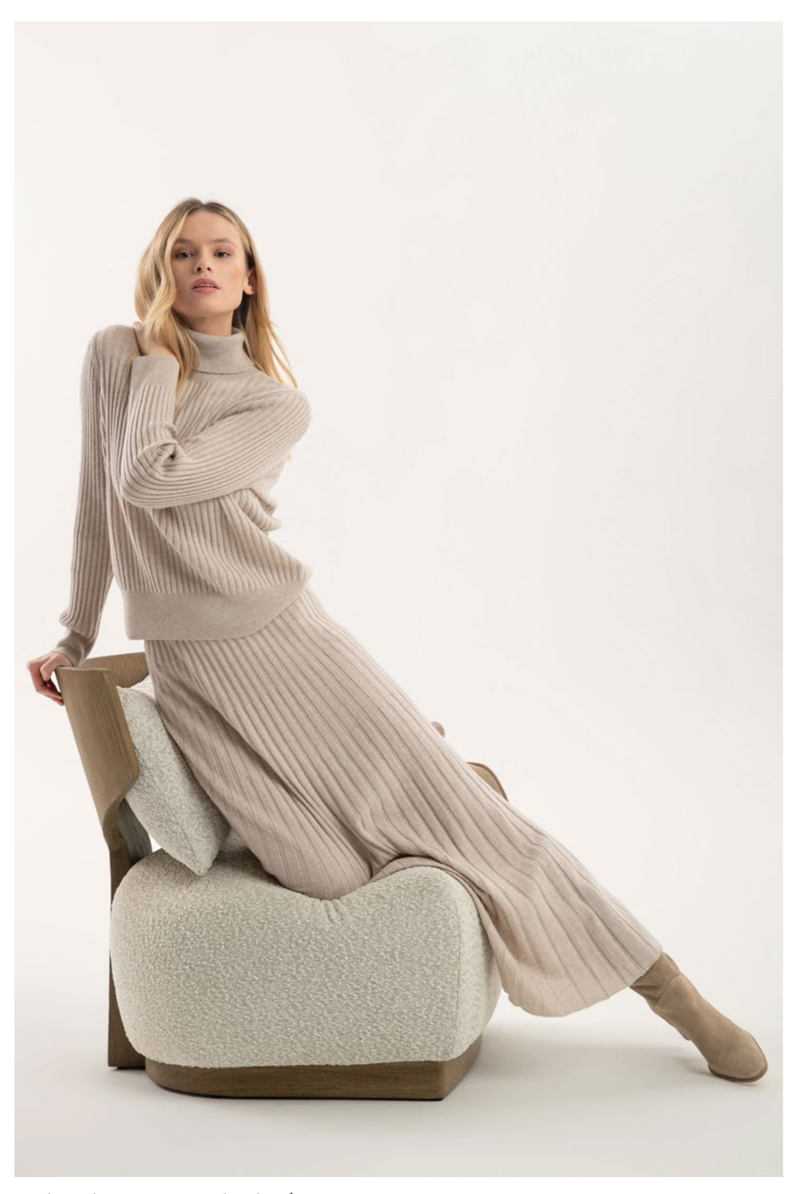
Turtle-neck sweater in wool and cashmere, art. 2252 Skirt in wool and cashmere, art. 2250