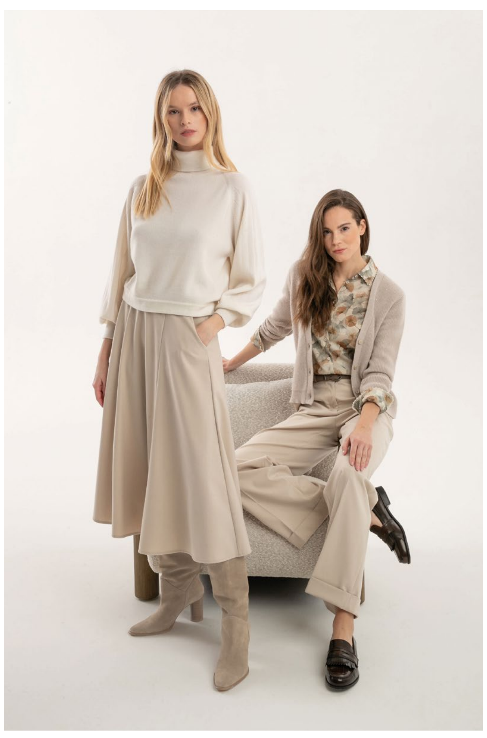
LEFT: Sweater in 100% cashmere, art. 2106 - Skirt in viscose micro-flannel, art. 3025 RIGHT: Printed shirt in stretch viscose, art. 5015 - Cardigan in cashmere with sequins, art. 2633 - Trousers in viscose micro-flannel, art. 3023 - Leather belt, art. 6035