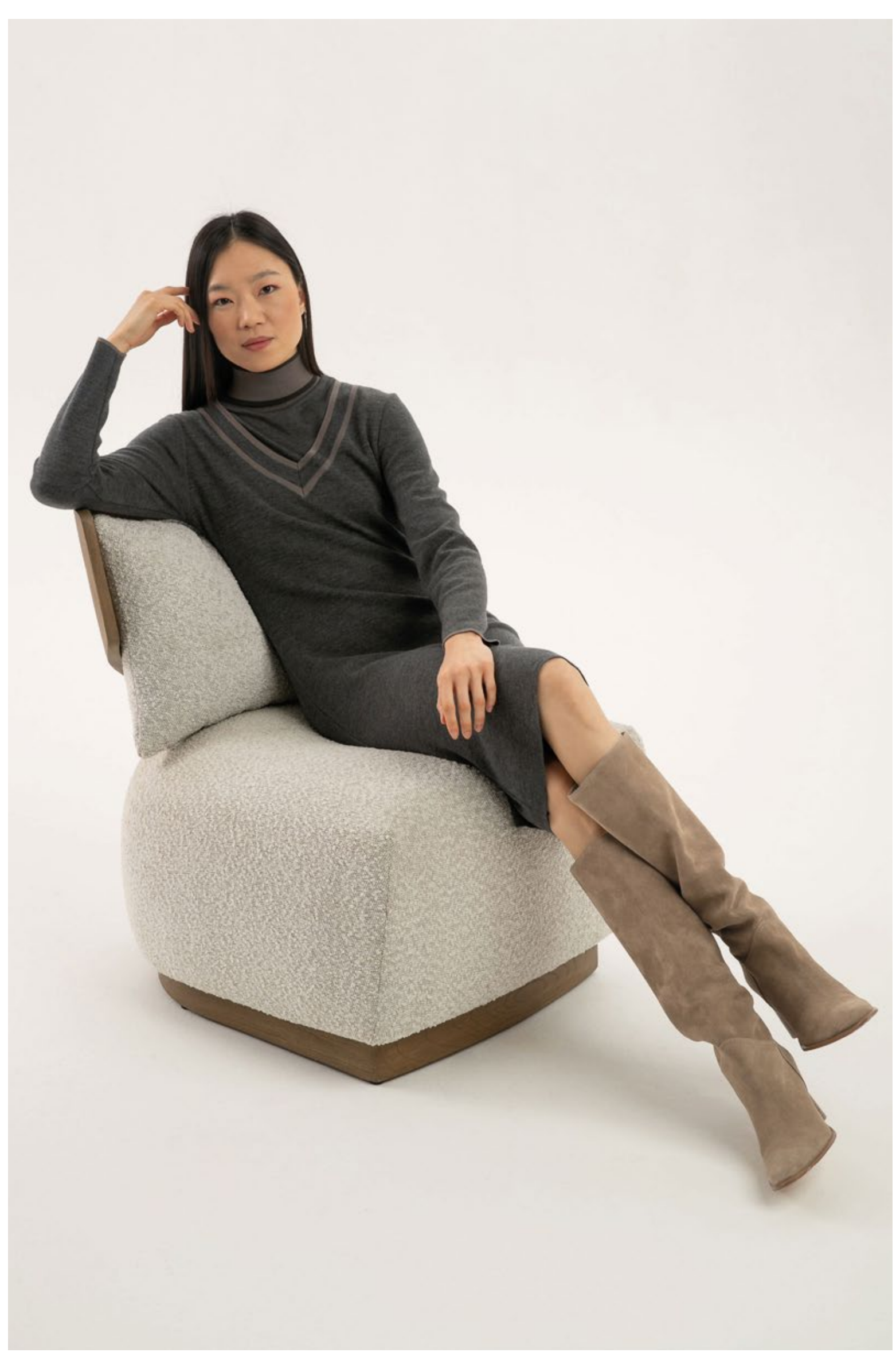
Turtle-neck top in viscose, modal and wool, art. 1411 V-neck dress in Merino wool, art. 2513