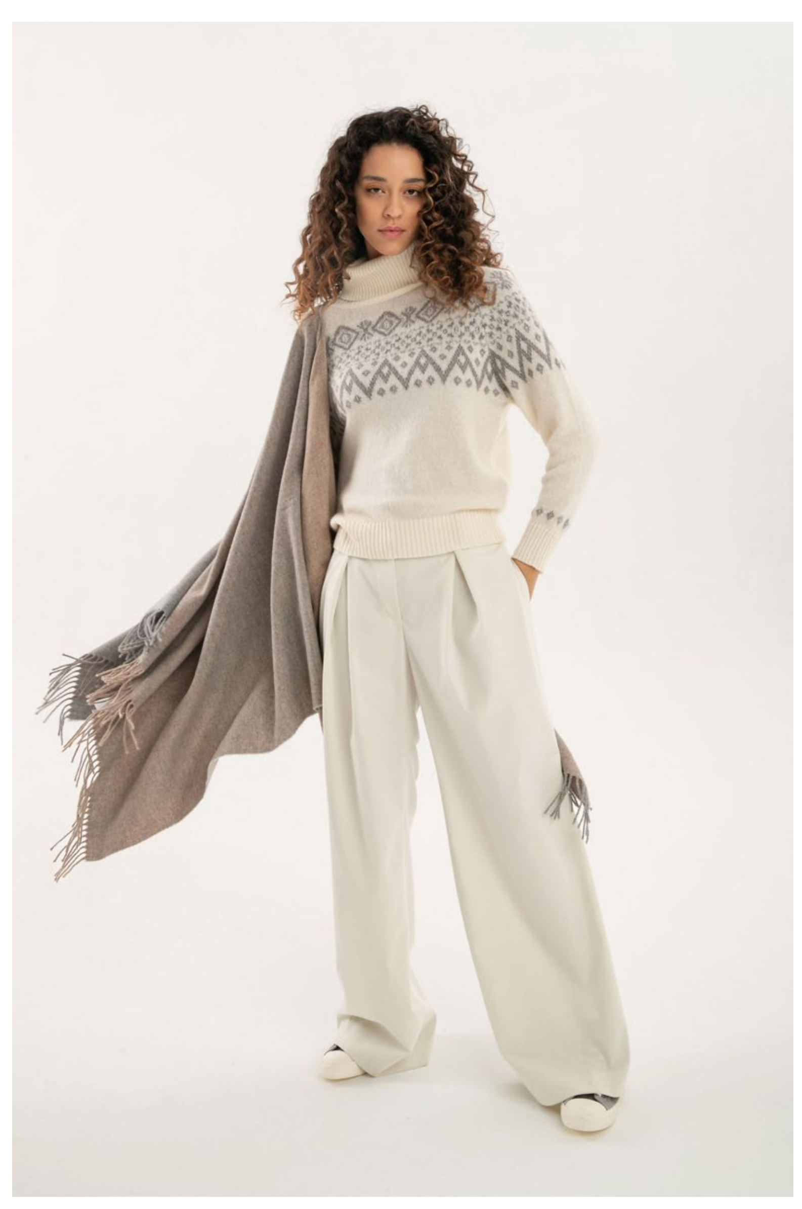
Turtle-neck sweater in super kid mohair and silk, art. 2681 Trousers in viscose micro-flannel, art. 3020 Cape with fringes in wool blend, art. 6026