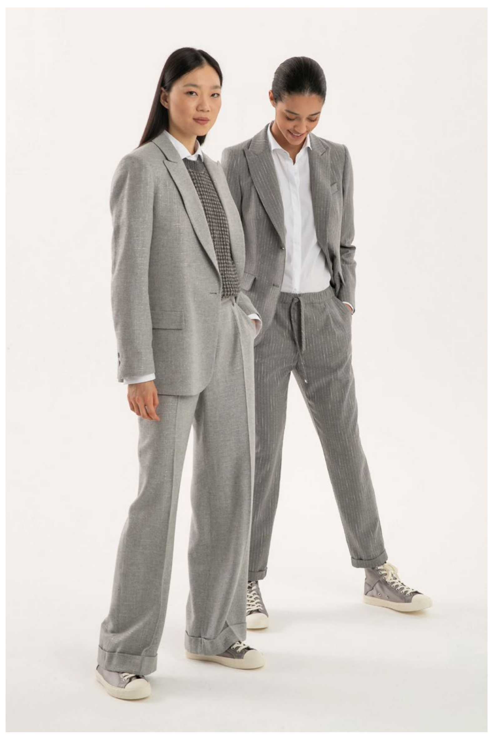
LEFT: Shirt in stretch popeline with chain embellishment, art. 5033 - Sweater in cashmere and silk with lurex, art. 2604 - Trousers, art. 3028 - Jacket, art. 8034 - Leather belt, art. 6036 RIGHT: Shirt in stretch popeline with chain embellishment, art. 5033 - Trousers in pinstripe viscose and cotton, art. 3031 - Jacket in pinstripe viscose and cotton, art. 8036