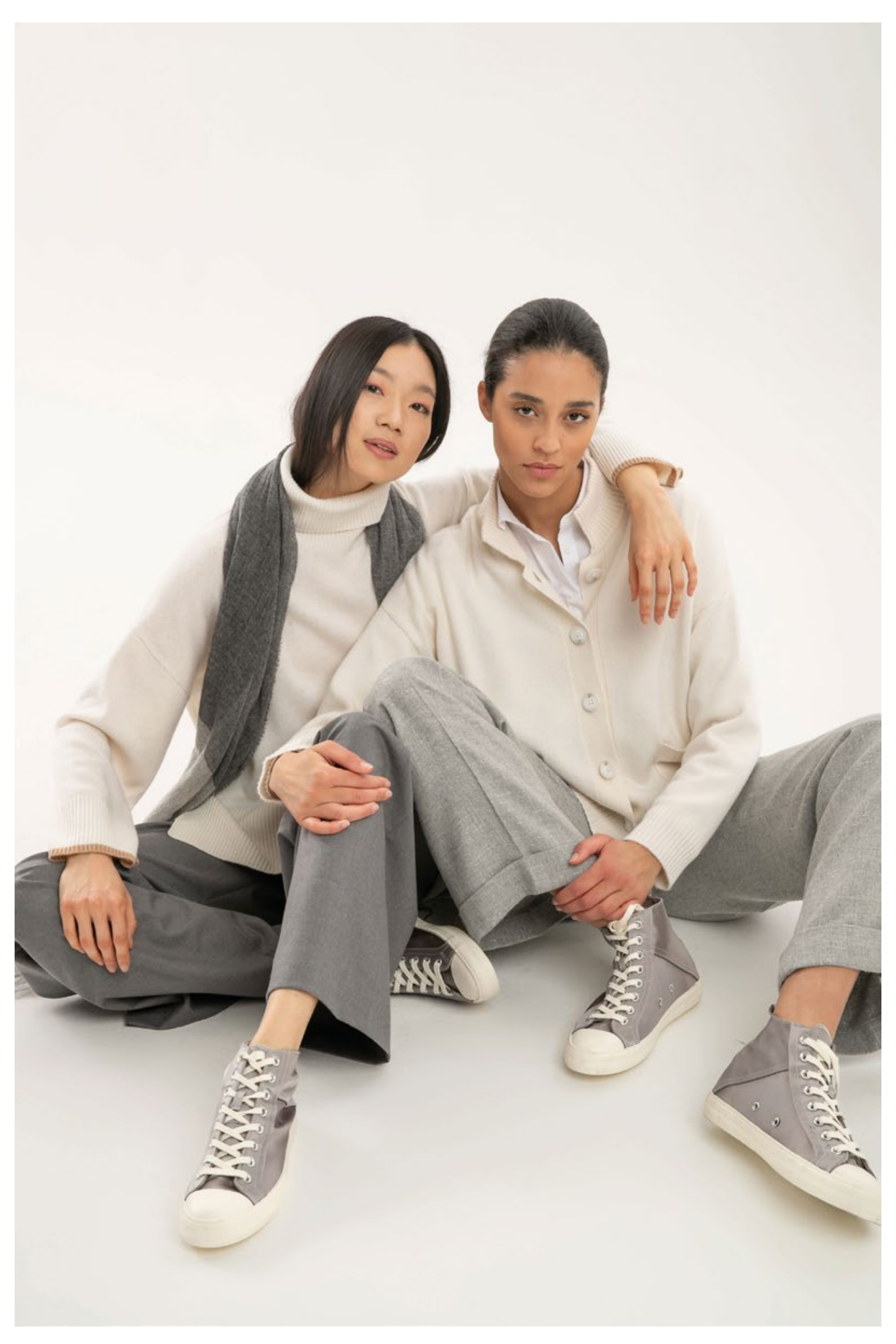
LEFT: Turtle-neck sweater in 100% cashmere, art. 2134 - Trousers in viscose micro-flannel, art. 3020 - Scarf in wool blend, art. 6016

RIGHT: Shirt in stretch popeline with chain embellishment, art. 5033 - Sweater in 100% cashmere, art. 2122 - Trousers in viscose and wool with lurex, art. 3028