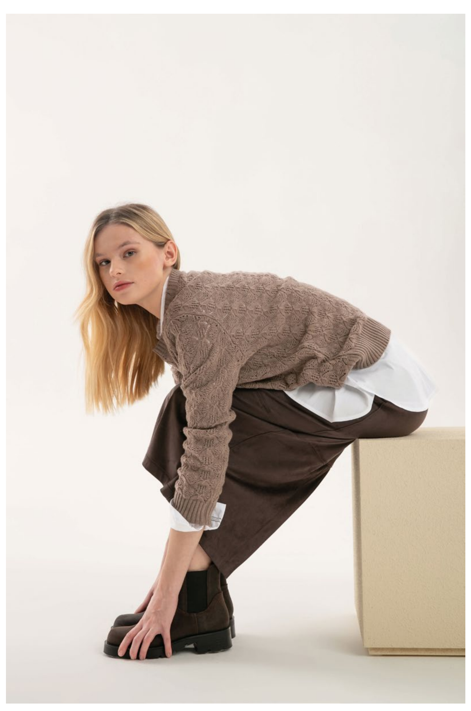
Shirt in stretch popeline with chain embellishment, art. 5033 Sweater in 100% cashmere, art. 2166 Skirt in faux suede, art. 3019