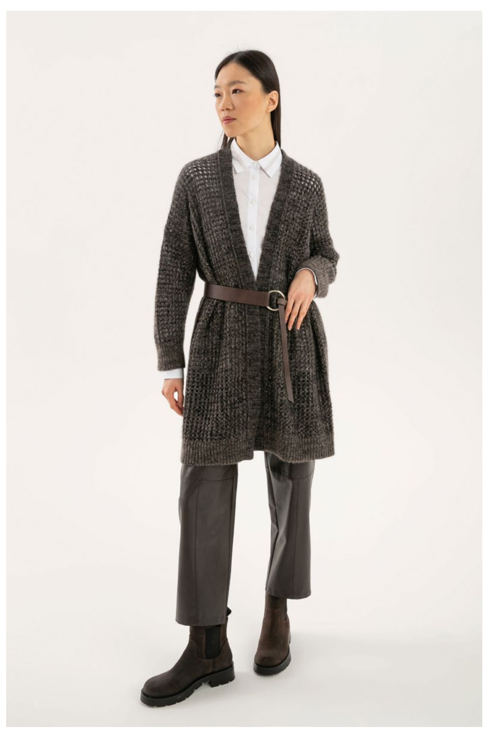
Shirt in stretch popeline with chain embellishment, art. 5034 Sweater in cashmere and silk with lurex, art. 2603 Trousers in faux leather, art. 3062 Leather belt, art. 6032