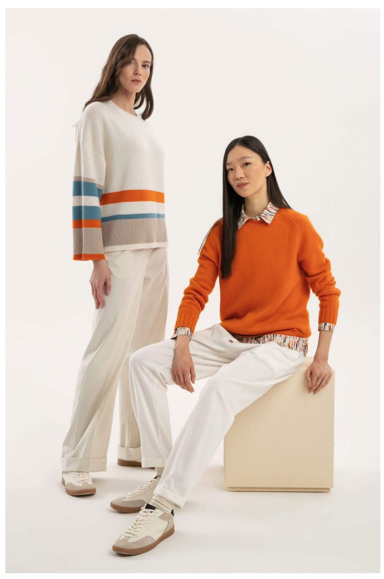
LEFT: Sweater in 100% cashmere, art. 2167 - Trousers in viscose micro-flannel, art. 3023 RIGHT: Printed shirt in stretch viscose, art. 5011 - Sweater in 100% cashmere, art. 2140 - Cotton pants, art. 3001