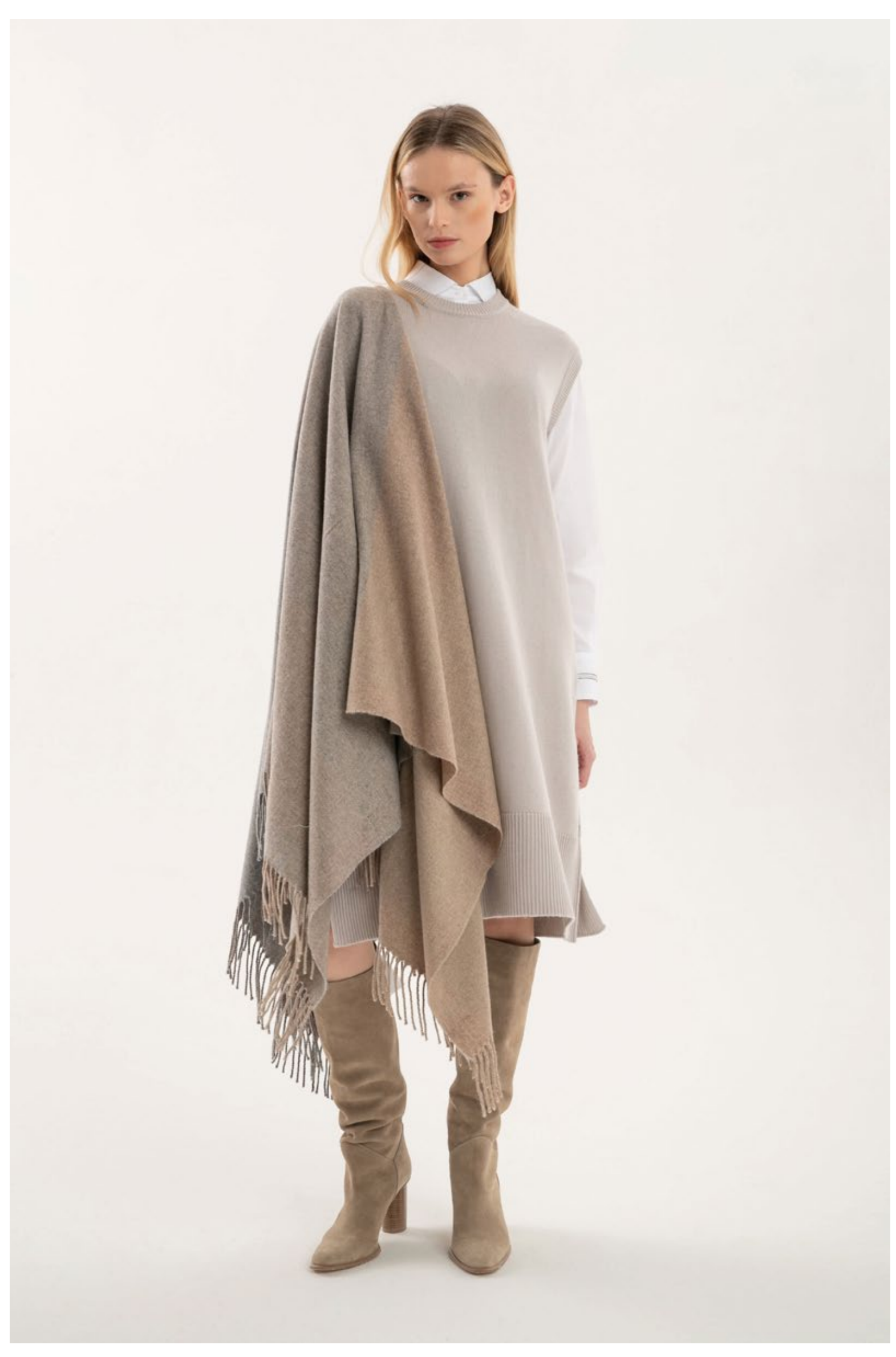
Shirt in stretch popeline with chain embellishment, art. 5033 Sleeveless dress in wool and cashmere, art. 2258 Cape with fringes in wool blend, art. 6026