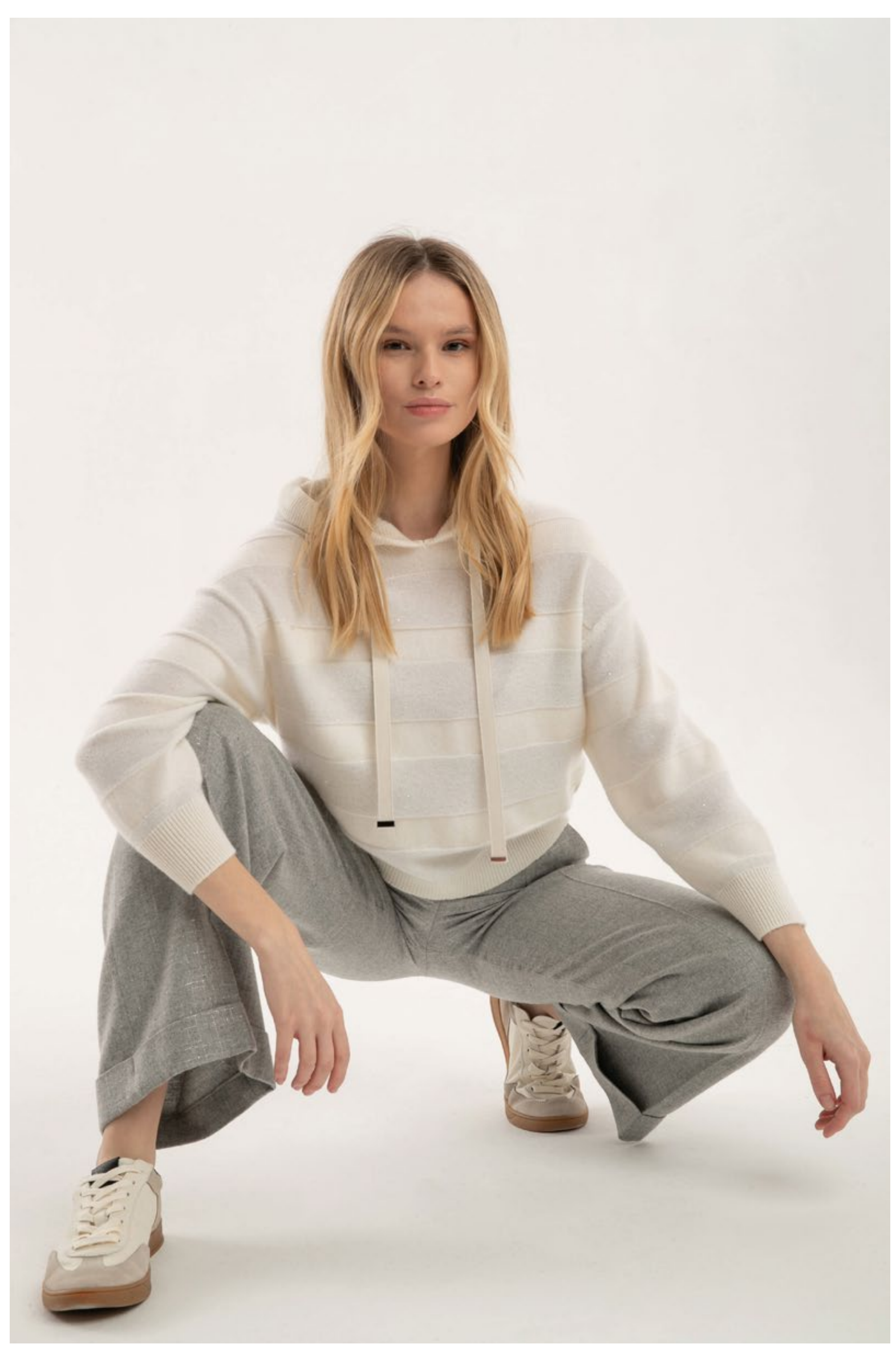
Hooded sweater in cashmere with sequins, art. 2636 Trousers in viscose and wool with lurex, art. 3028