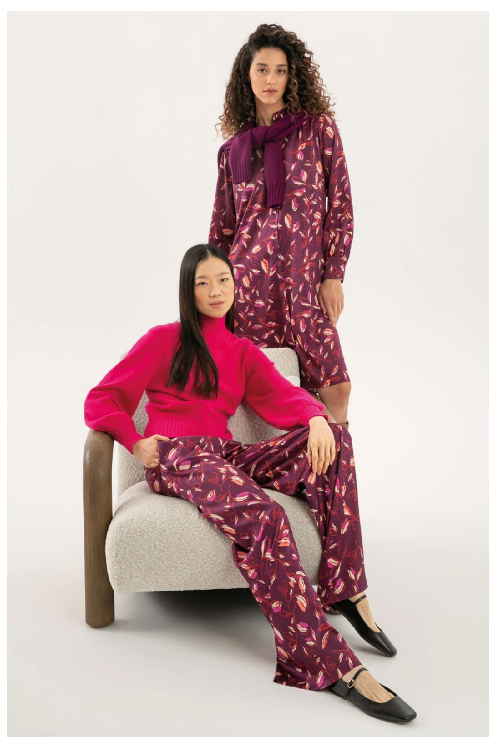
LEFT: Turtle-neck sweater in 100% cashmere, art. 2132 - Printed trousers in stretch viscose, art. 3053 RIGHT: Printed shirt dress in stretch viscose, art. 4012 - On shoulder : Sweater in 100% cashmere, art. 2142