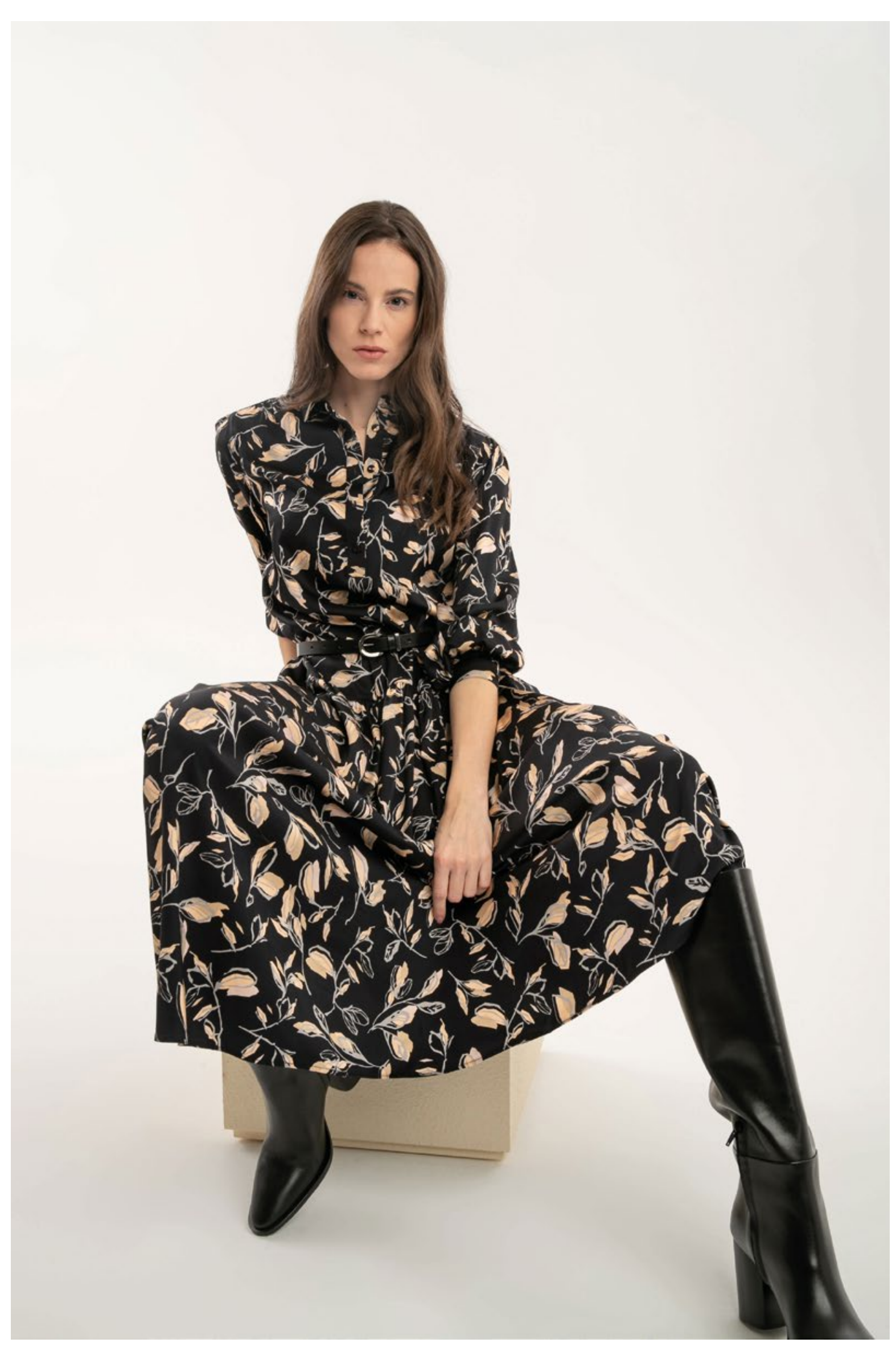
Printed dress in stretch viscose, art. 4013 Leather belt, art. 6038