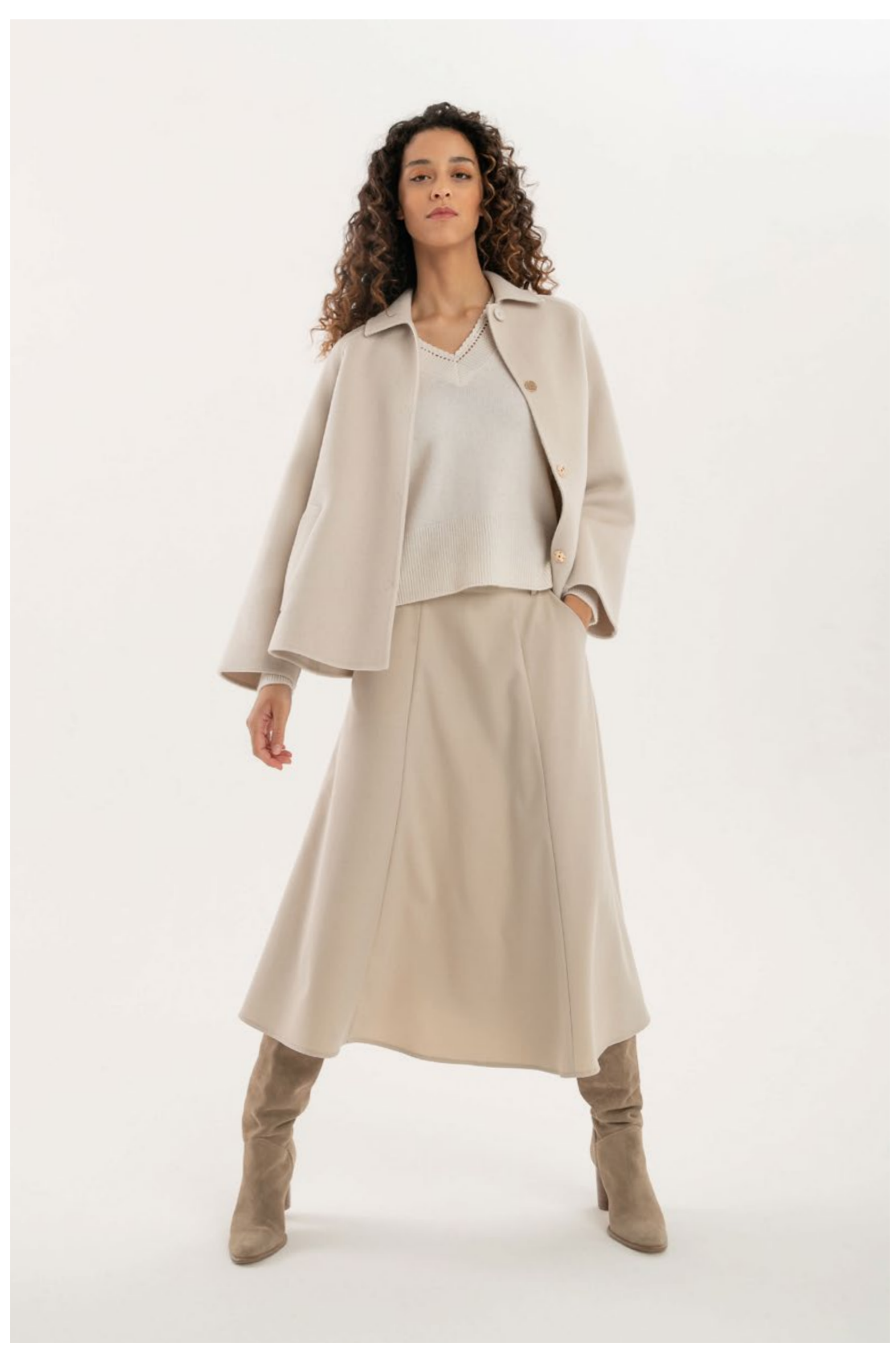
Sweater in 100% cashmere, art. 2138 Skirt in viscose micro-flannel, art. 3025 Coat in double fabric wool and cashmere, art. 8106