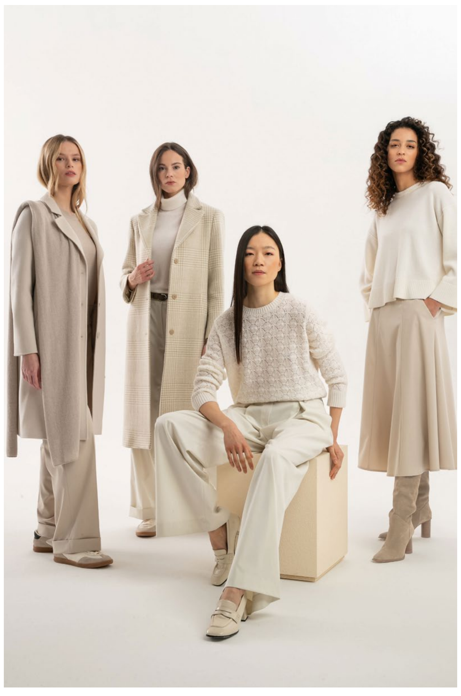
LEFT: Sweater, art. 2104 - Trousers, art. 3023 - Coat, art. 8110 - Scarf, art. 6012 CENTRE LEFT: Sweater, art. 2152 - Trousers, art. 3023 - Coat, art. 8127 - Leather belt, art. 6035 CENTRE RIGHT: Sweater, art. 2160 - Trousers, art. 3020 RIGHT: Sweater, art. 2124 - Skirt, art. 3025