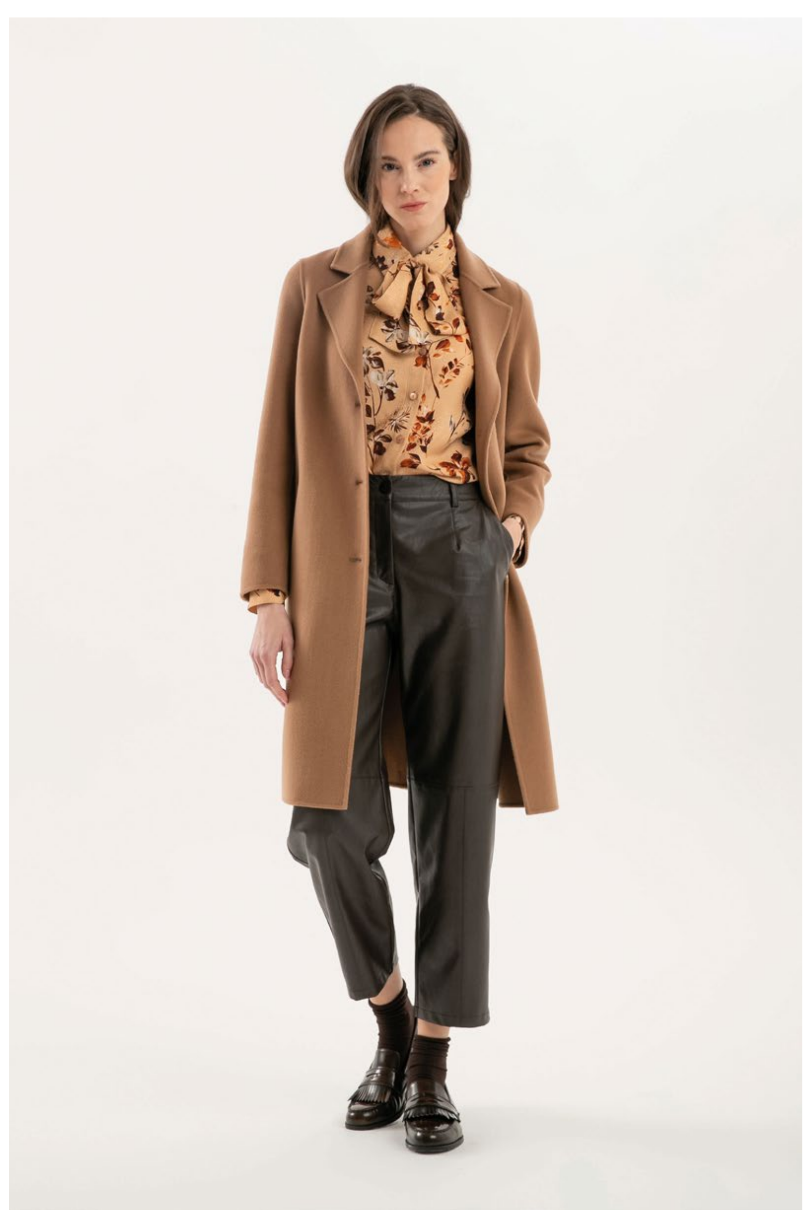
Printed shirt in viscose jacquard with lace, art. 5007 Trousers in faux leather, art. 3062 Coat in double fabric wool and cashmere, art. 8110