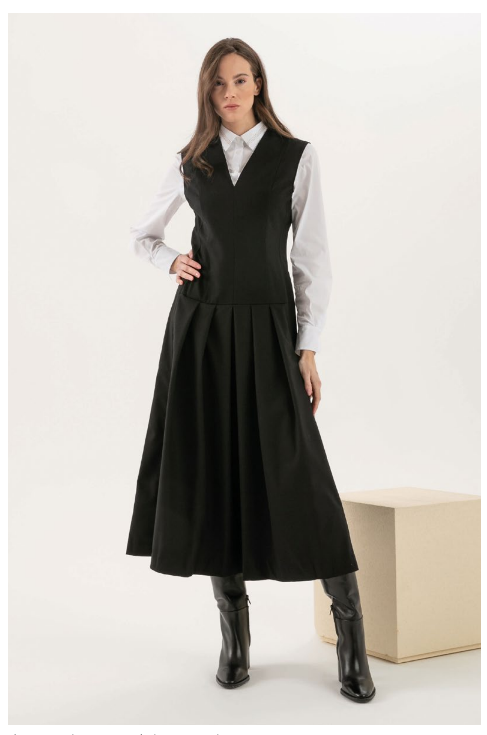
Shirt in stretch popeline with chain embellishment, art. 5034 Sleeveless dress in viscose micro-flannel with chain embellishment, art. 4025