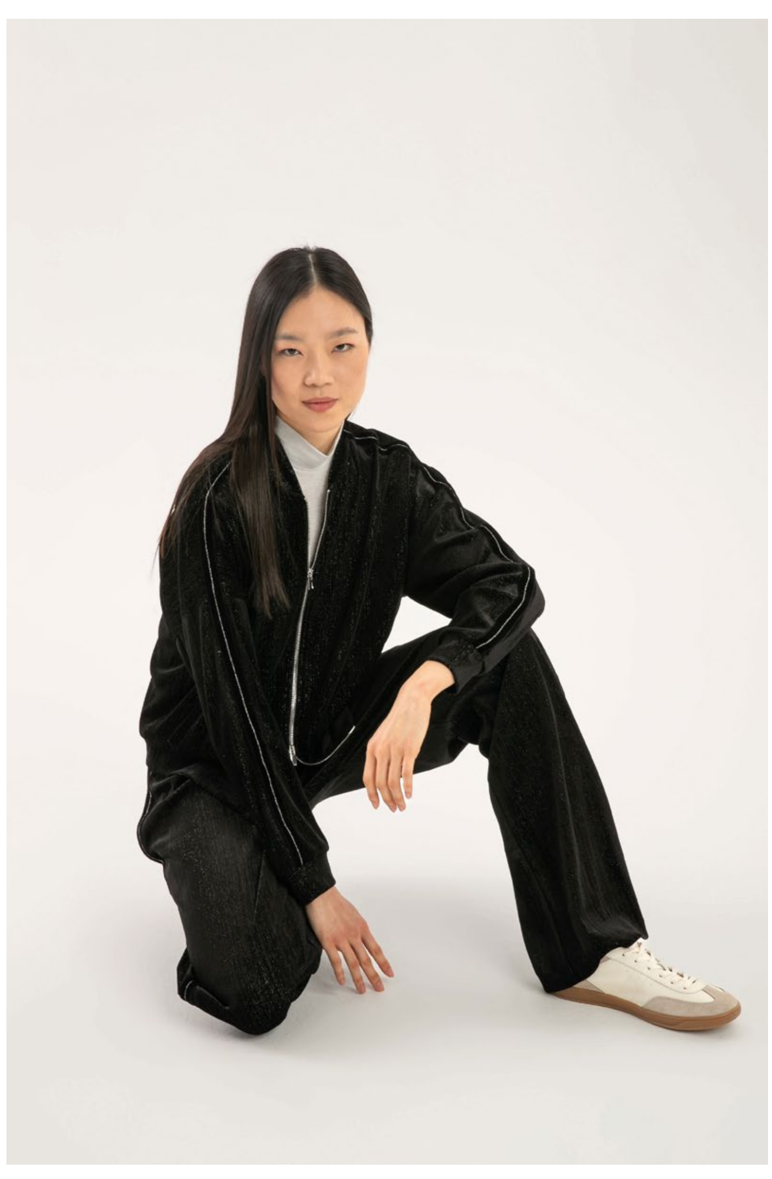
High neck top in jersey lurex, art. 1331 Sweater in shiny velvet, art. 1821 Pants in shiny velvet, art. 3046