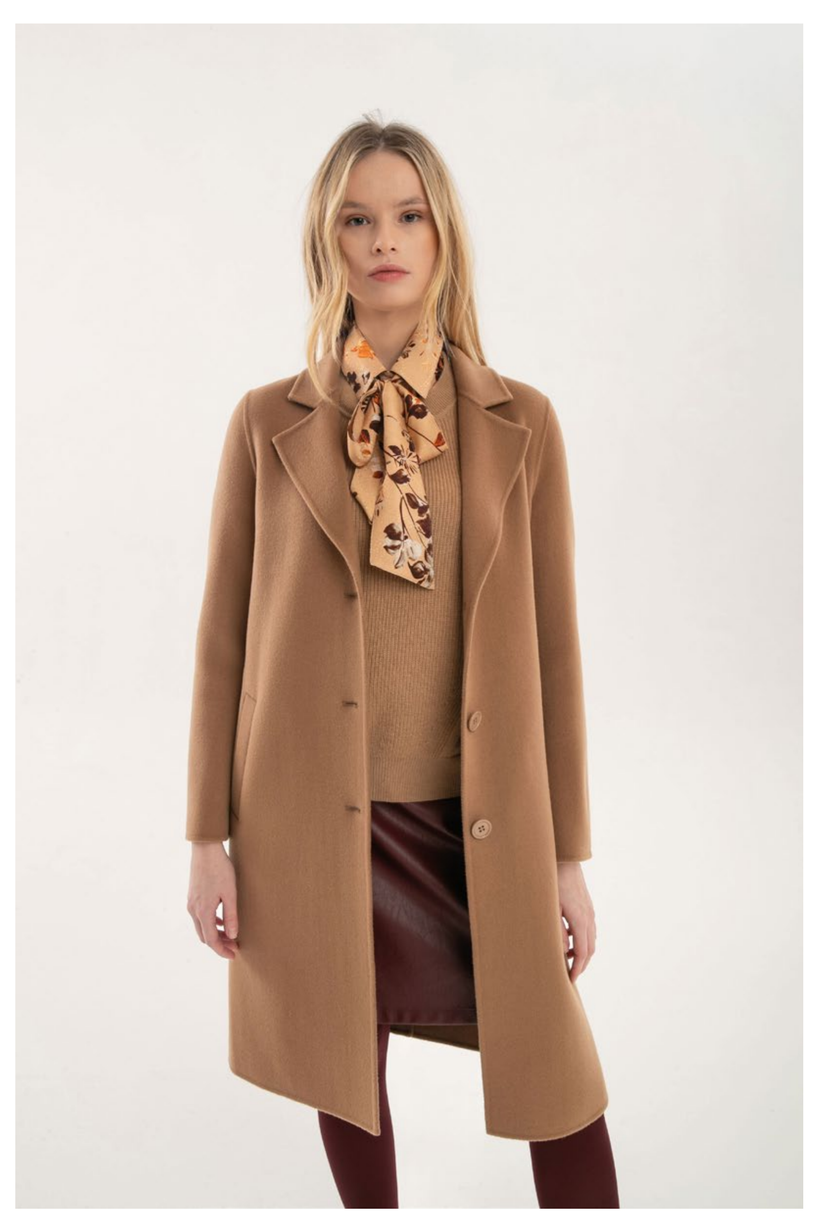
Printed shirt in viscose jacquard with lace, art. 5007 Sweater in wool and cashmere, art. 2214 Skirt in faux leather, art. 3063 Coat in double fabric wool and cashmere, art. 8110