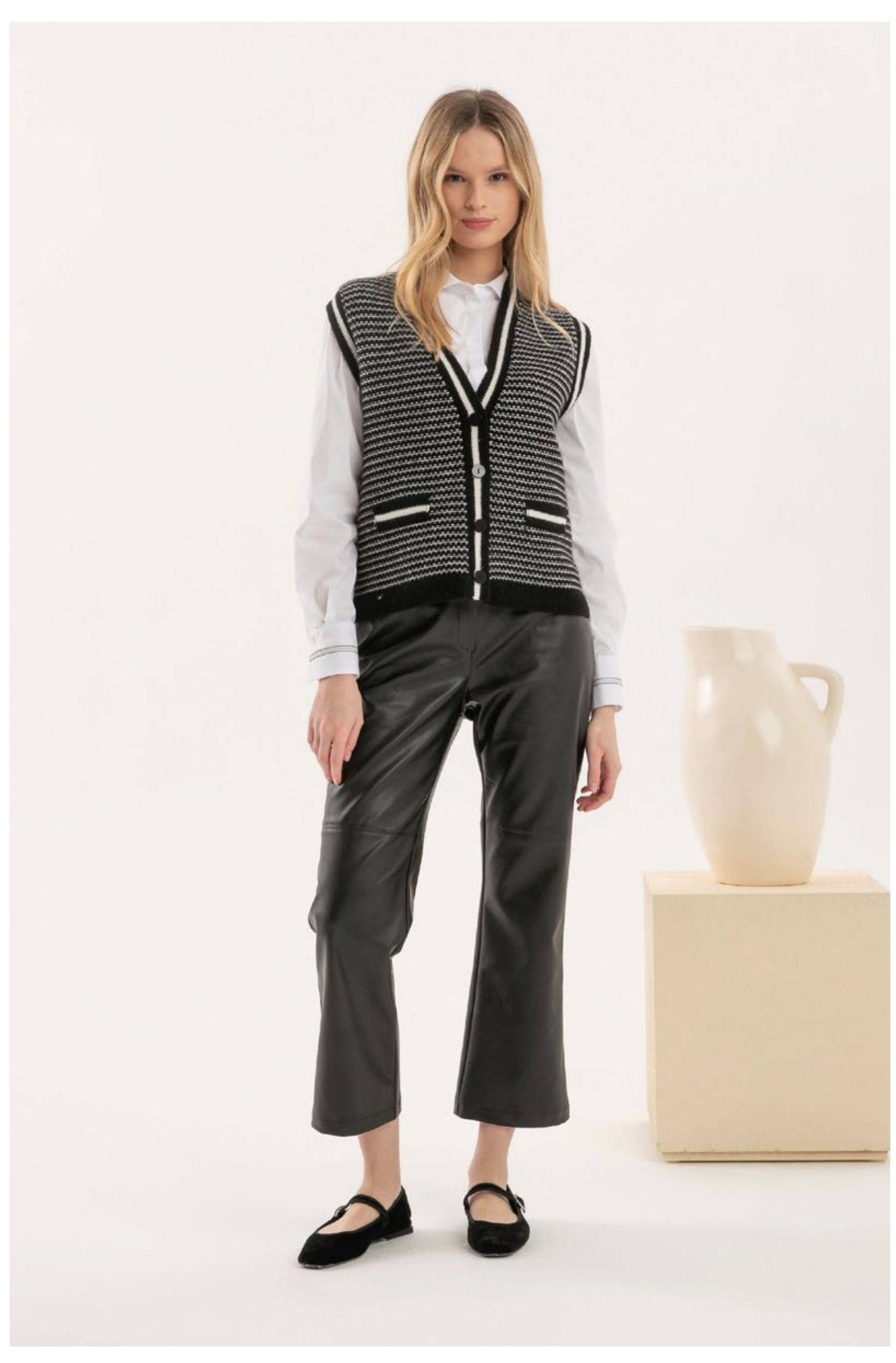
Shirt in stretch popeline with chain embellishment, art. 5033 Gilet in 100% cashmere, art. 2136 Trousers in faux leather, art. 3061