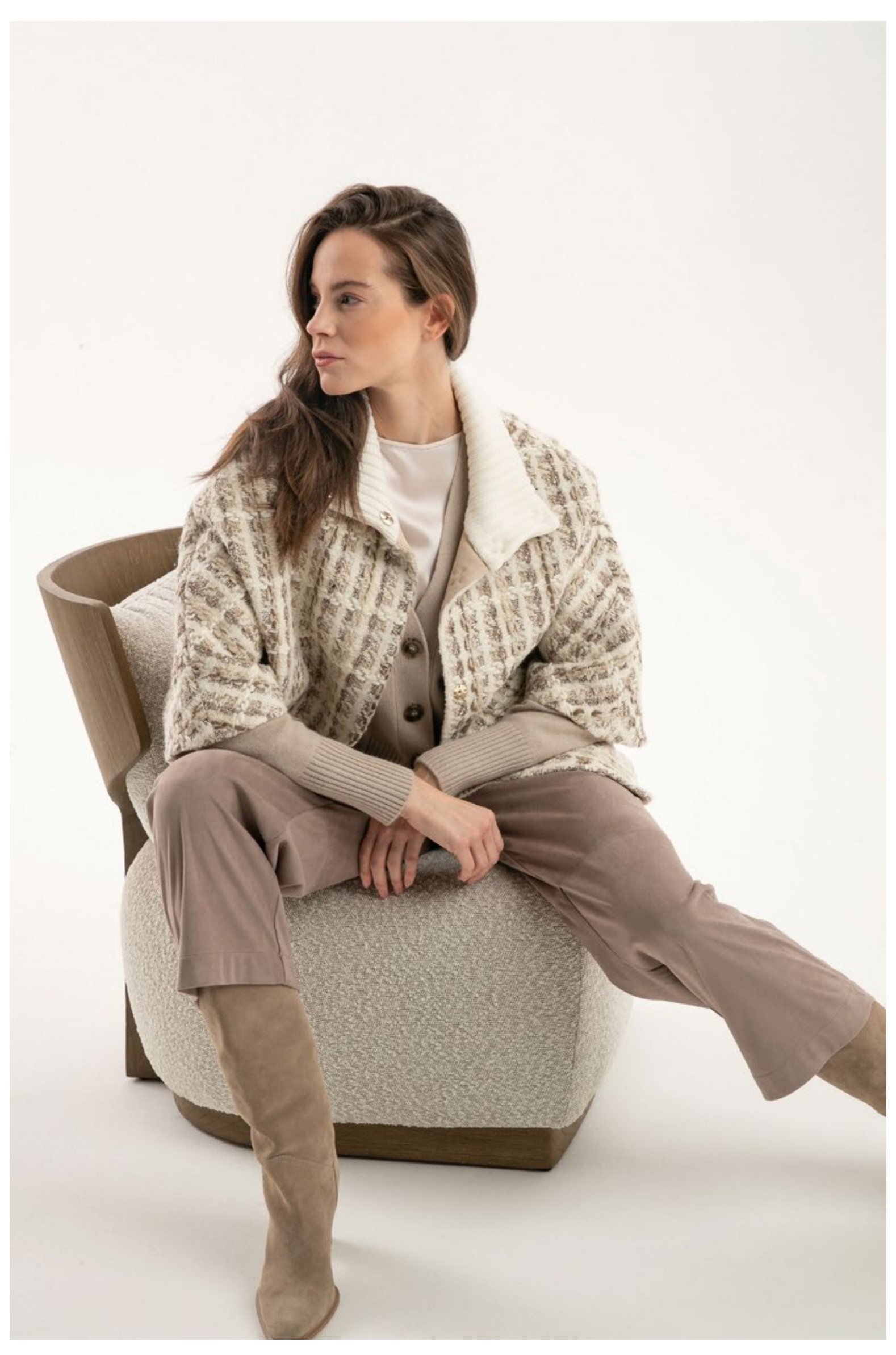
Blouse in satin silk stretch, art. 1910 Cardigan in 100% cashmere, art. 2121 Trousers in faux suede, art. 3018 Coat in wool and cotton with knitted collar, art. 8169