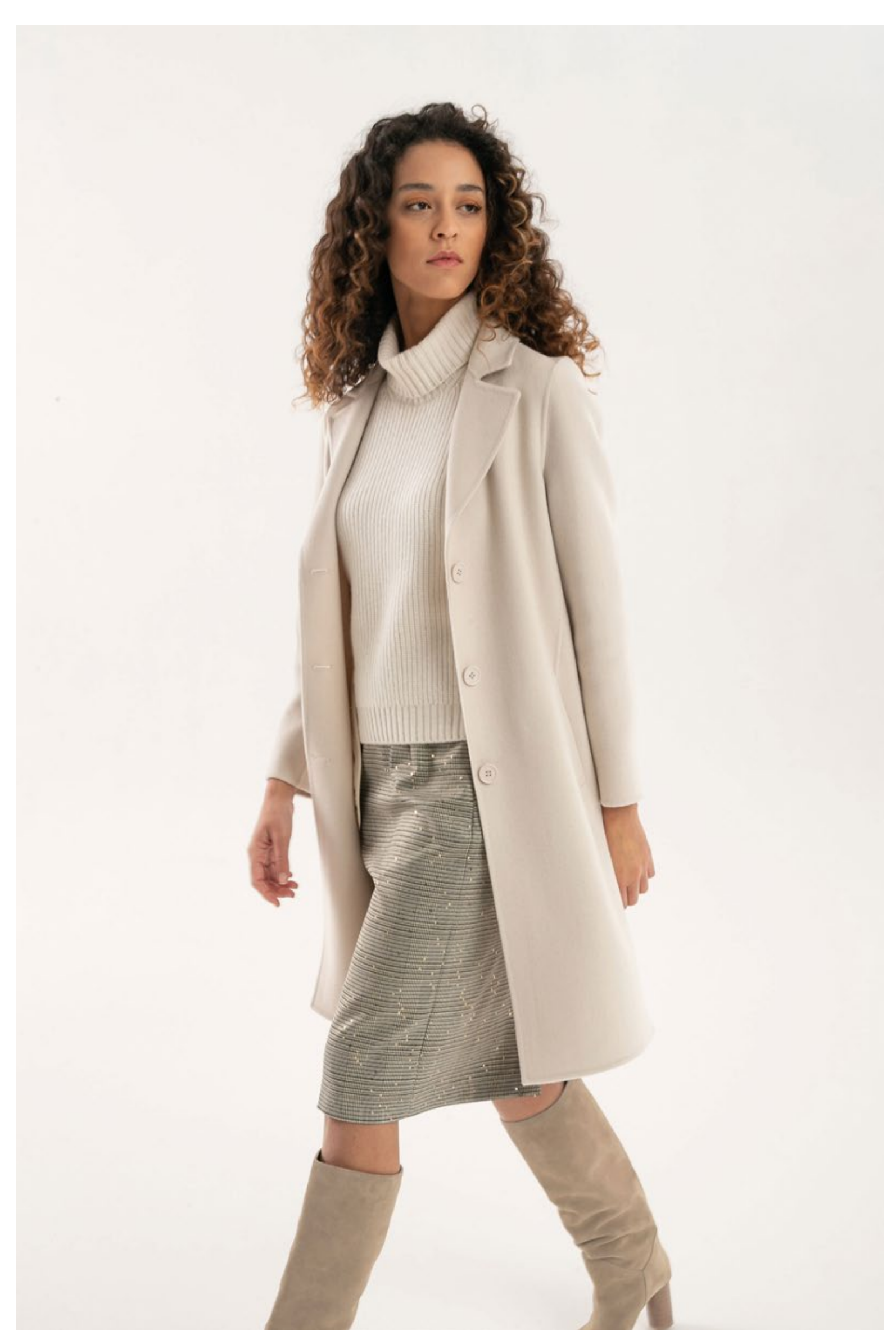
Sleeveless sweater in 100% cashmere, art. 2149 Skirt with sequins, art. 3047 Coat in double fabric wool and cashmere, art. 8110