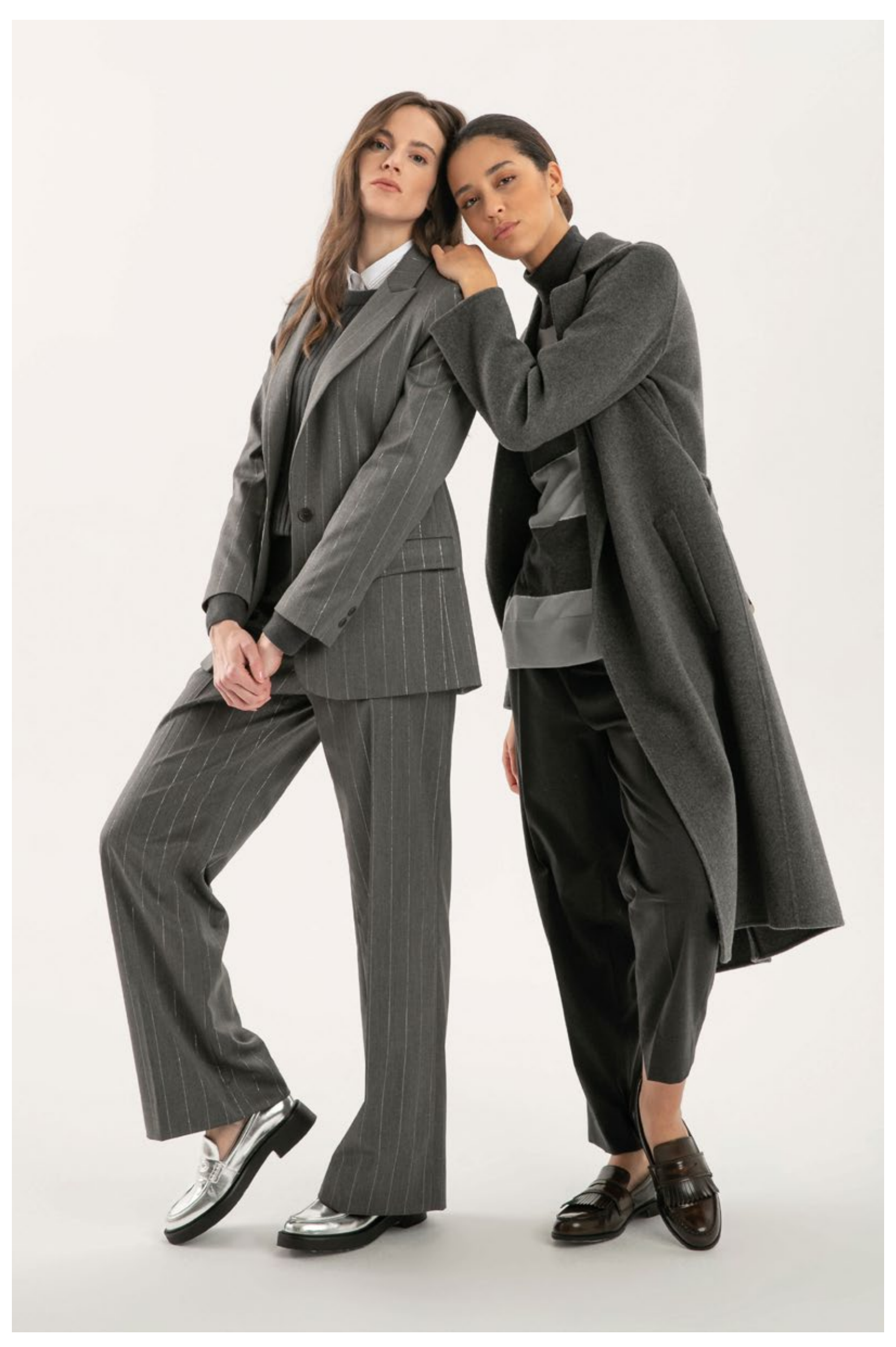
LEFT: Shirt in stretch popeline with chain embellishment, art. 5034 - Sweater in wool and cashmere, art. 2251 - Trousers in viscose with lurex pinstripe, art. 3040 - Jacket, art. 8047 RIGHT: Turtle-neck sweater in silk and cashmere, art. 2022 - Trousers in viscose micro-flannel, art. 3022 - Coat in double fabric wool and cashmere, art. 8109