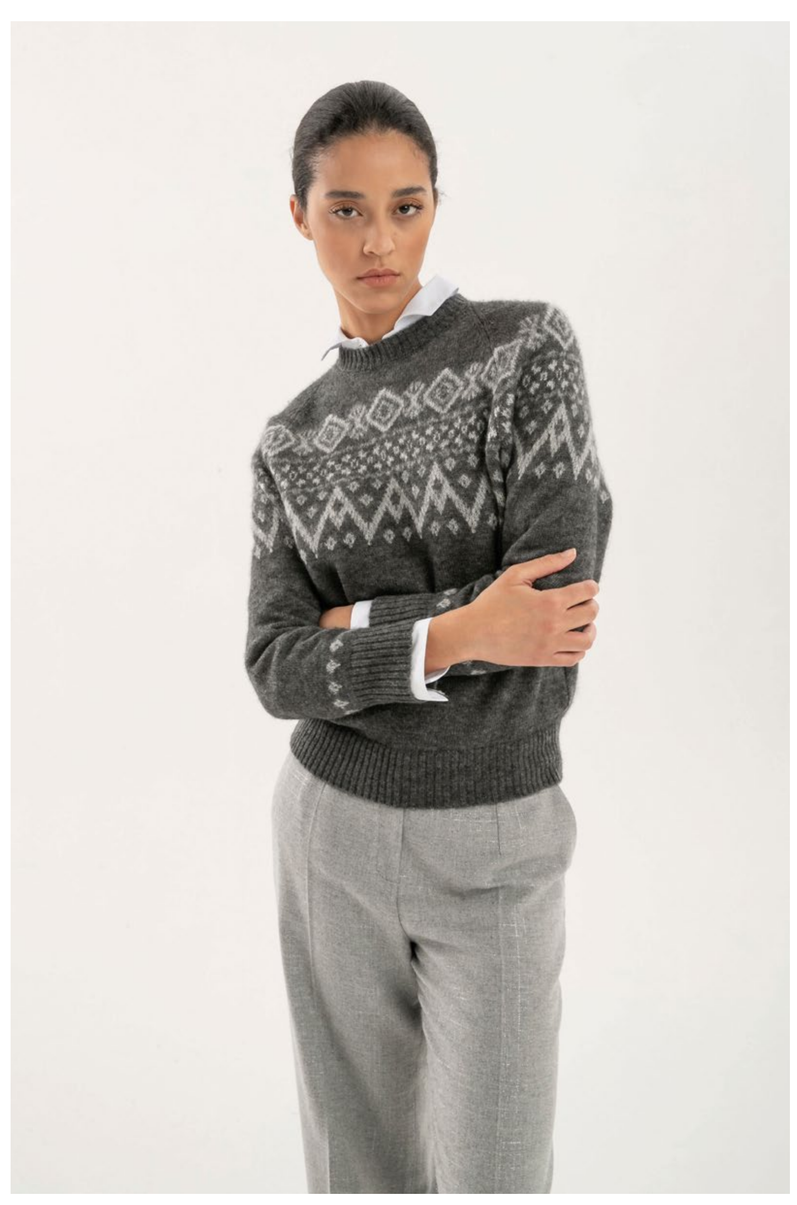
Shirt in stretch popeline with chain embellishment, art. 5033 Sweater in super kid mohair and silk, art. 2680 Trousers in viscose and wool with lurex, art. 3028