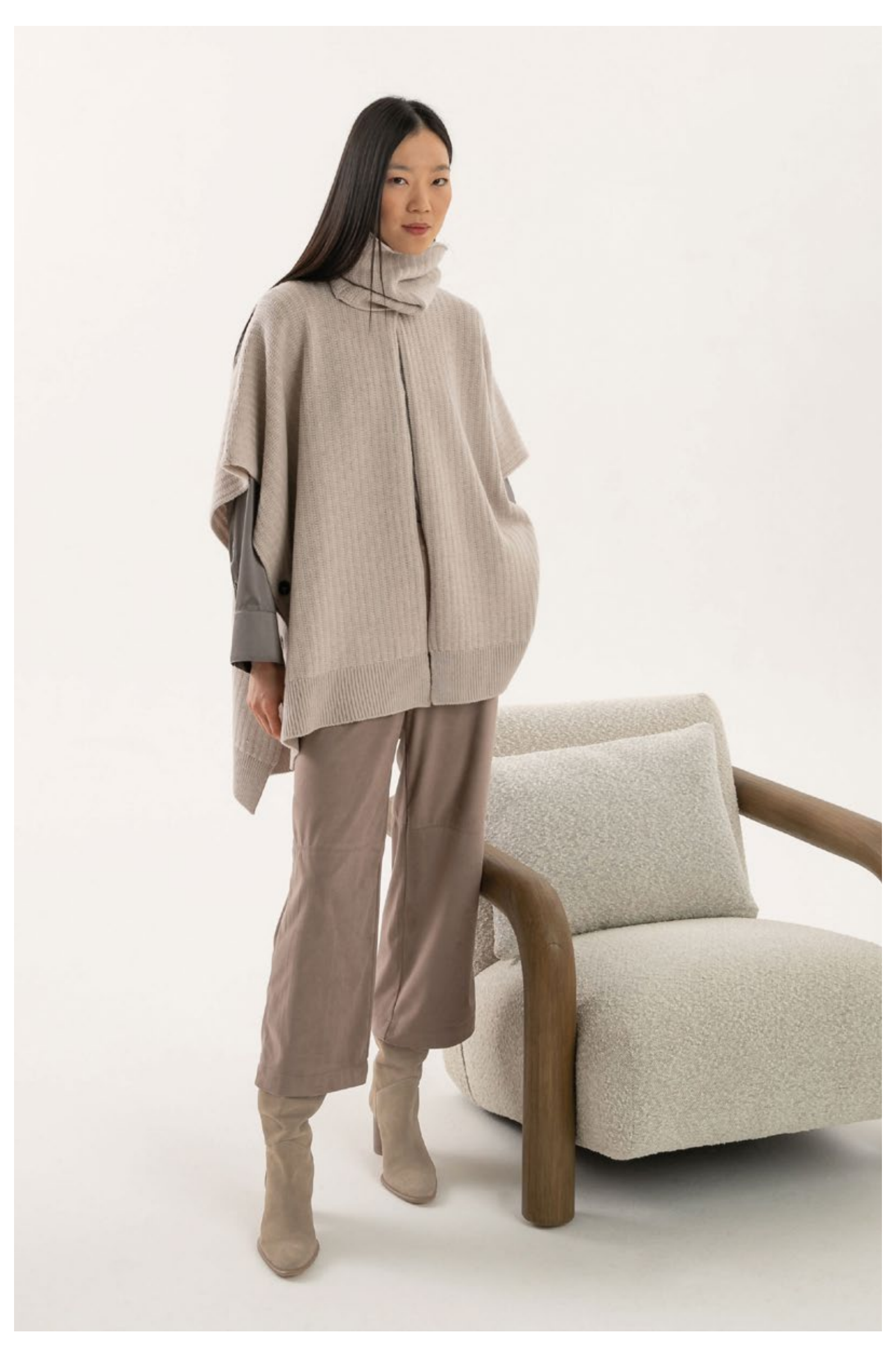
Shirt in satin silk stretch, art. 5003 Round-neck cape in wool and cashmere, art. 2245 Collar in wool and cashmere, art. 6045 Trousers in faux suede, art. 3018