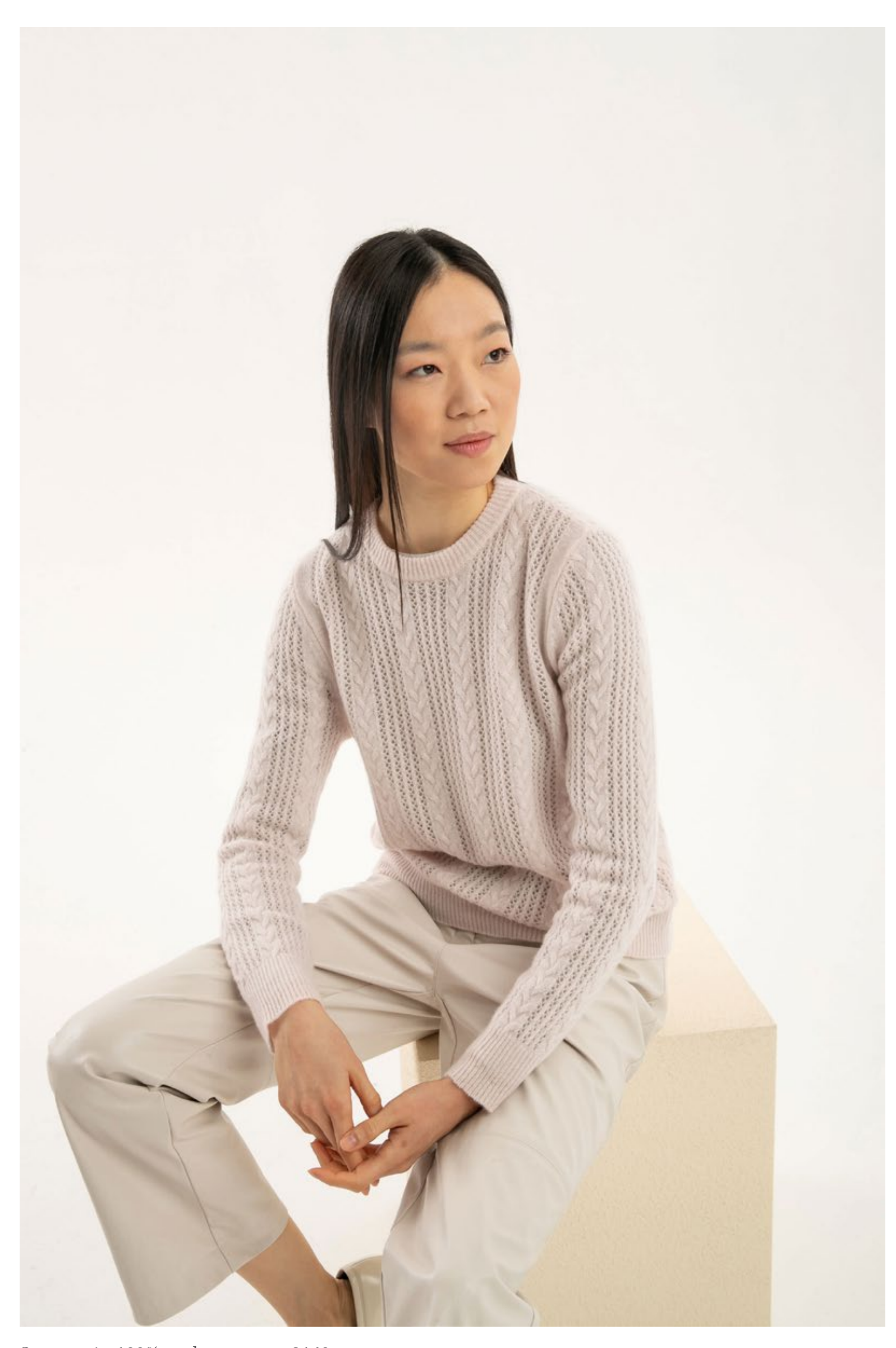
Sweater in 100% cashmere, art. 2160 Trousers in faux leather, art. 3061