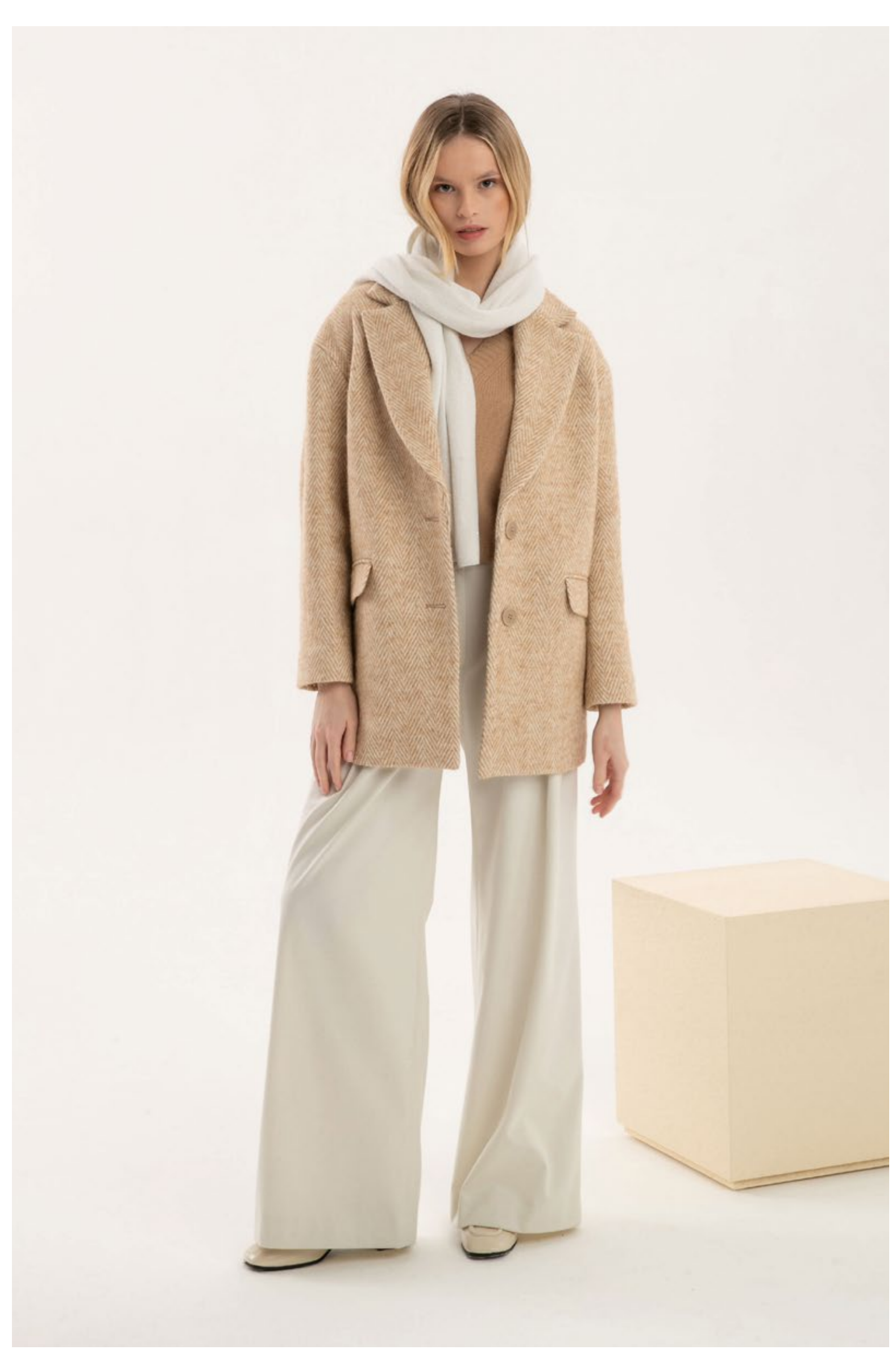
V-neck top in 100% cashmere, art. 2145 Trousers in viscose micro-flannel, art. 3020 Tweed coat in wool blend, art. 8120 Scarf in cashmere with sequins, art. 6012