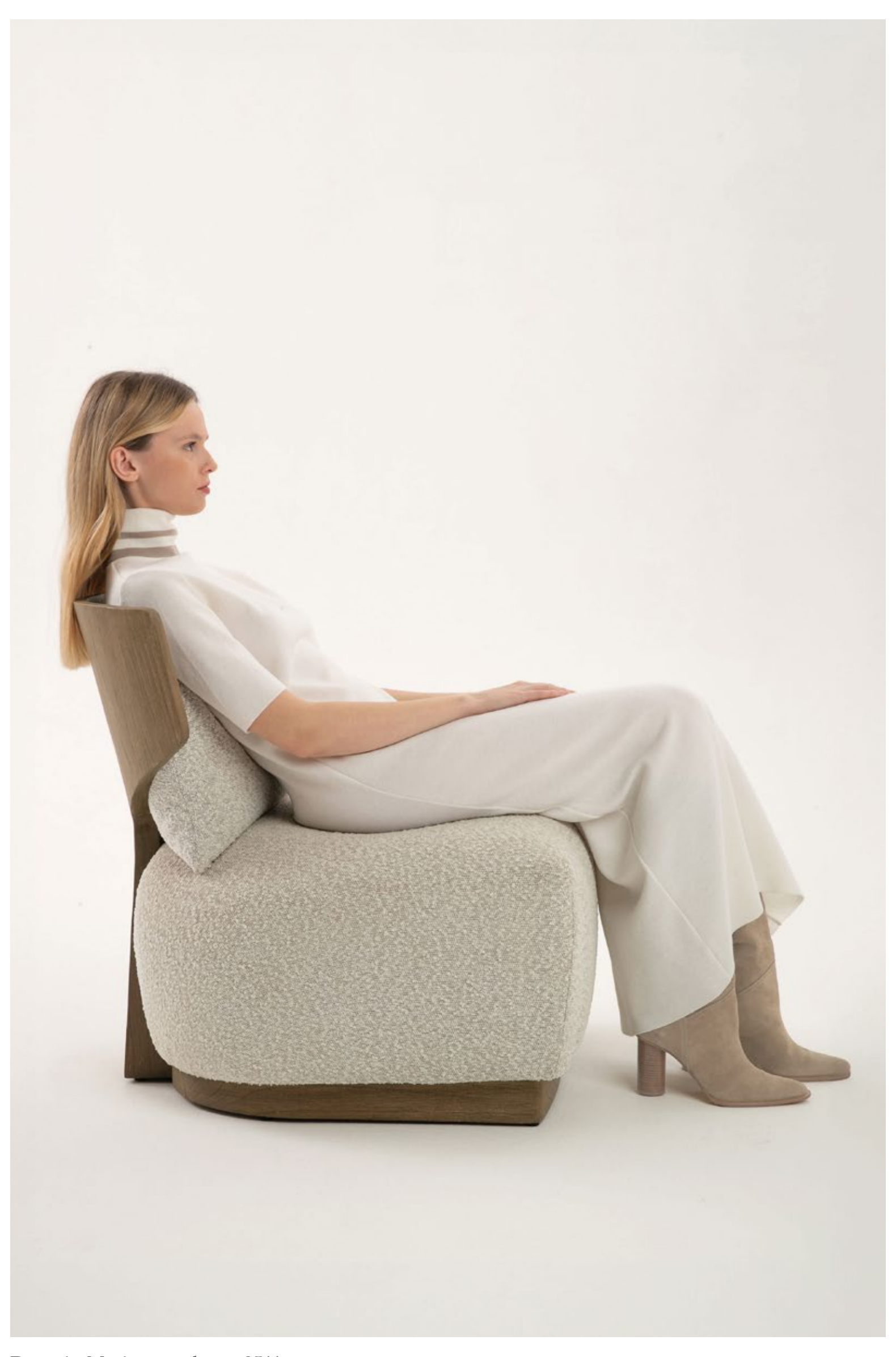
Dress in Merino wool, art. 2511