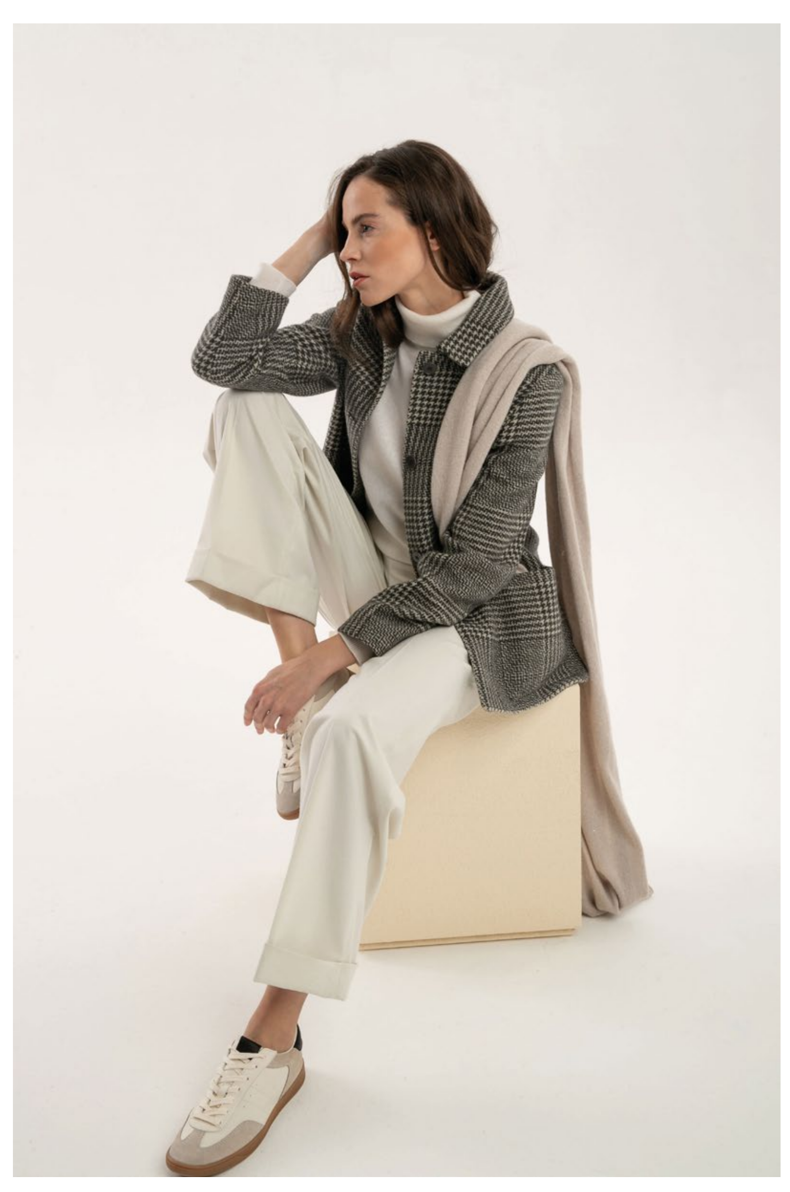
Sweater in 100% cashmere, art. 2152 Trousers in viscose micro-flannel, art. 3023 Coat jacket in wool and linen, art. 8126 Scarf in cashmere with sequins, art. 6012