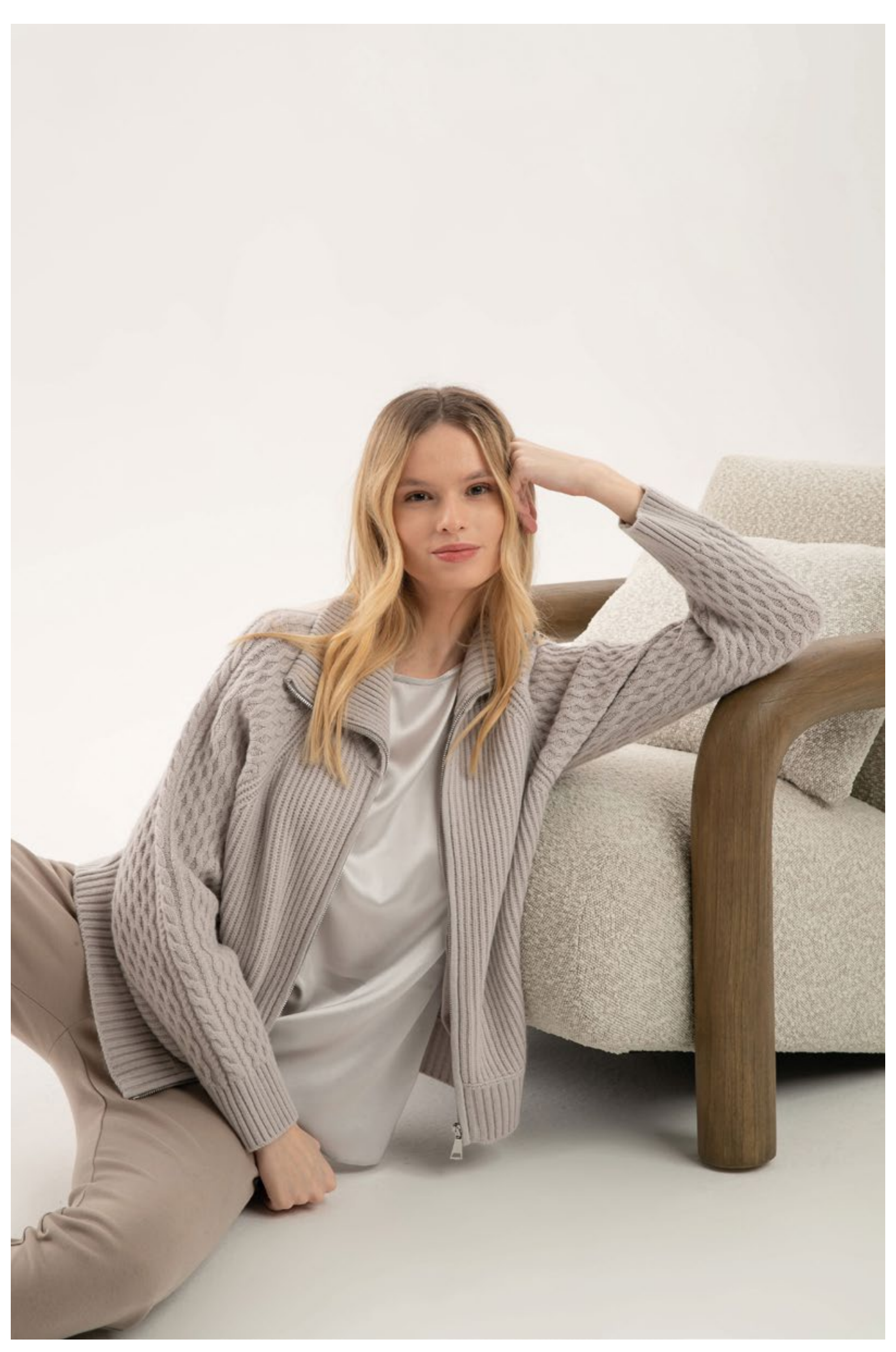
Top in satin silk stretch, art. 1907 Cardigan in wool and cashmere, art. 2229 Cotton pants, art. 3000