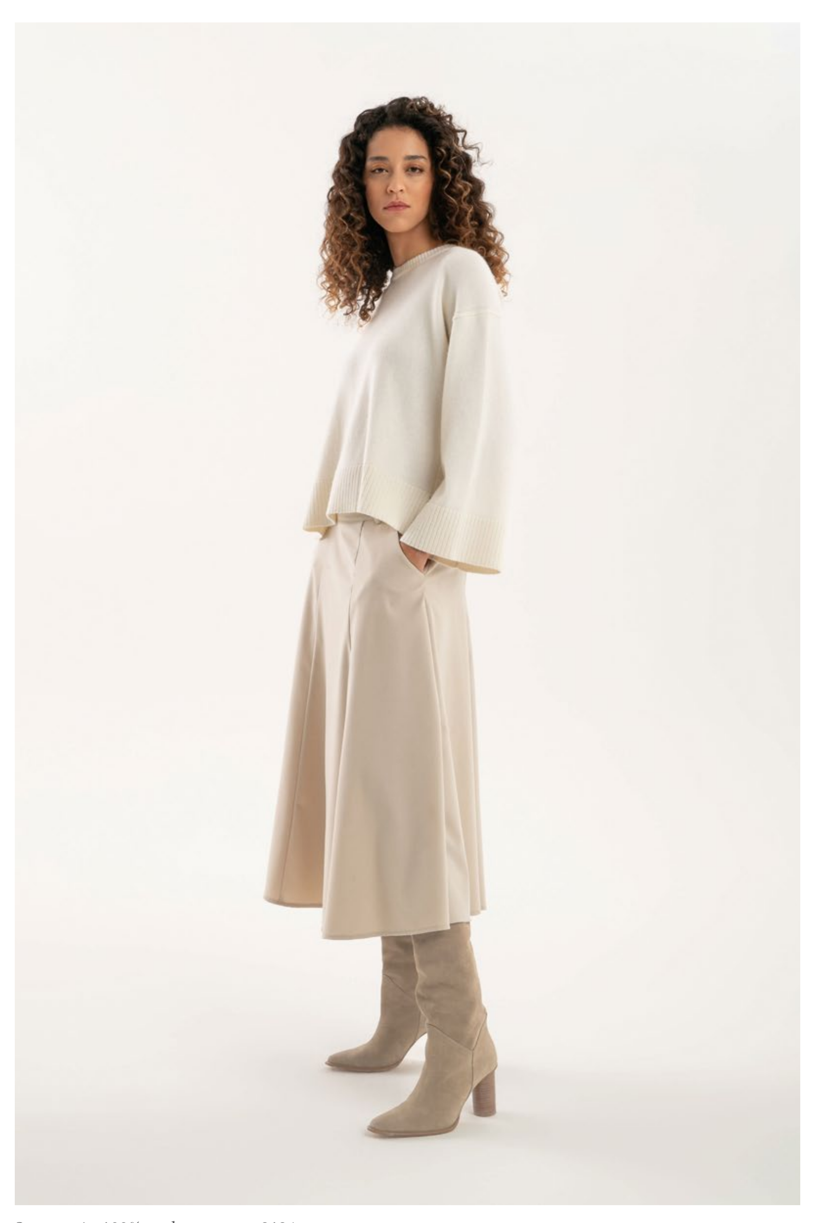
Sweater in 100% cashmere, art. 2124 Skirt in viscose micro-flannel, art. 3025