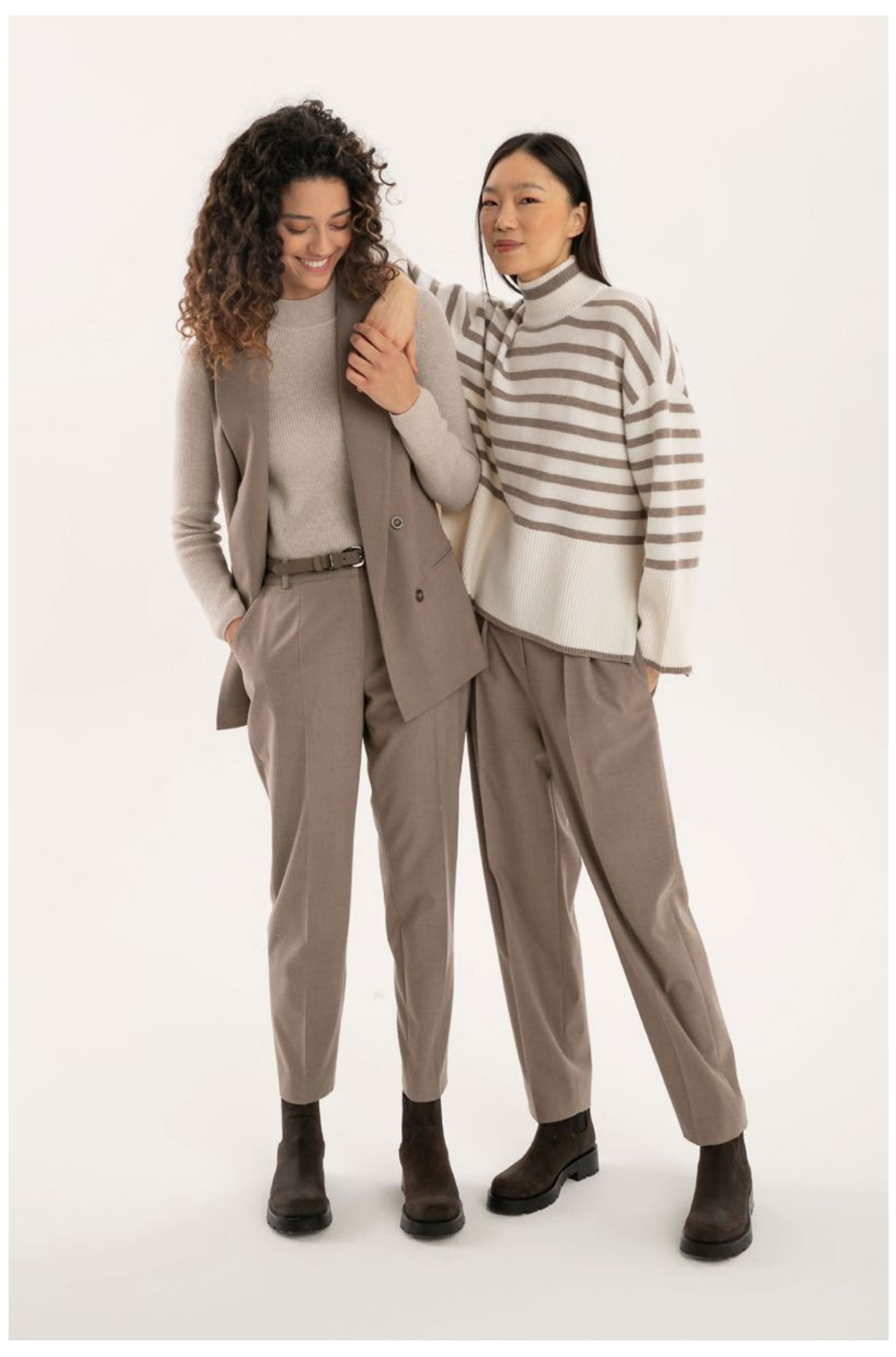
LEFT: Sweater in wool and cashmere, art. 2212 - Sleeveless jacket in viscose micro-flannel, art. 8029 - Trousers in viscose micro-flannel, art. 3021 - Leather belt, art. 6035 RIGHT: Turtle-neck sweater in wool and cashmere, art. 2231 - Trousers in viscose micro-flannel, art. 3022