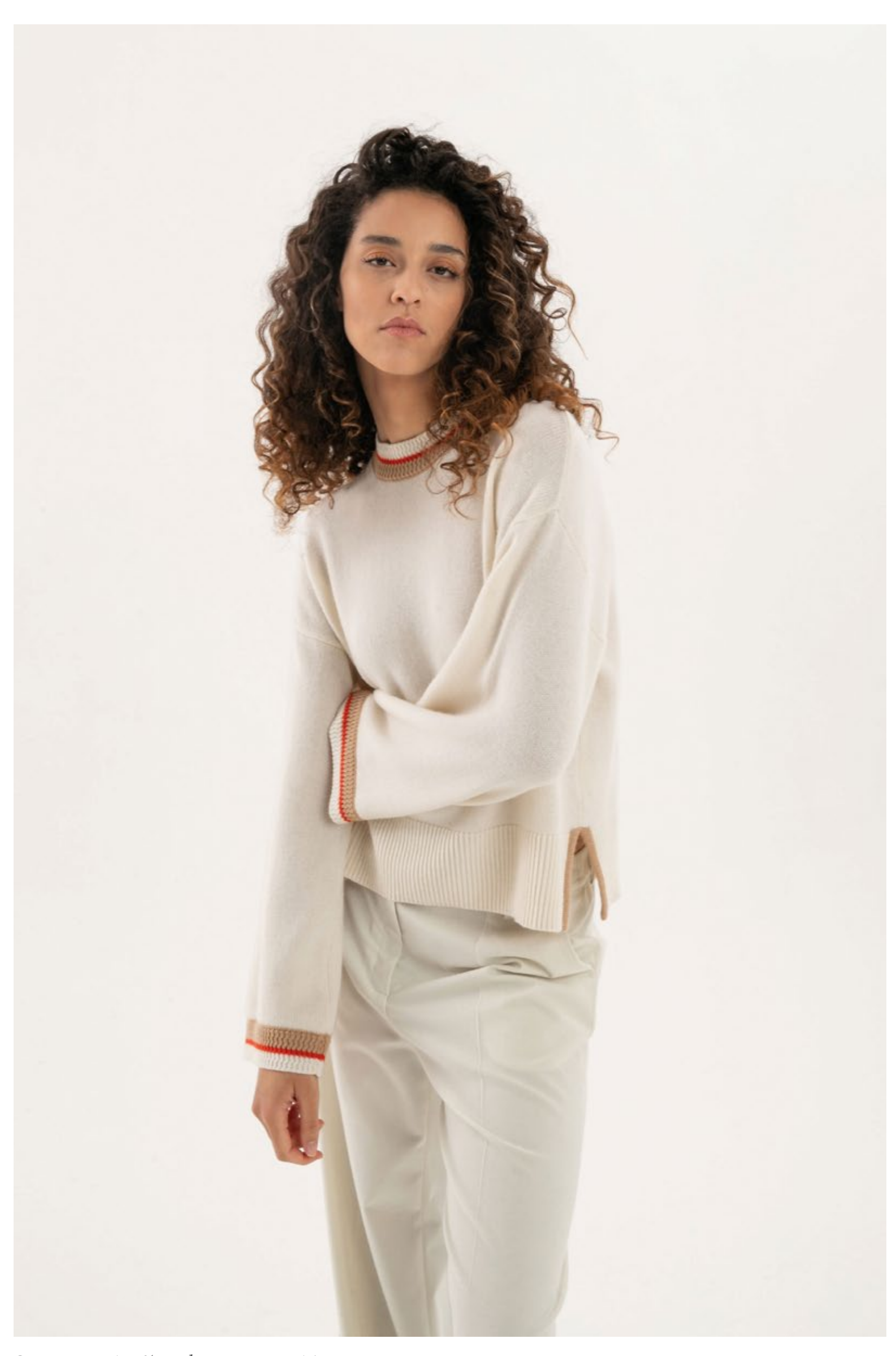
Sweater in 100% cashmere, art. 2169 Trousers in viscose micro-flannel, art. 3023