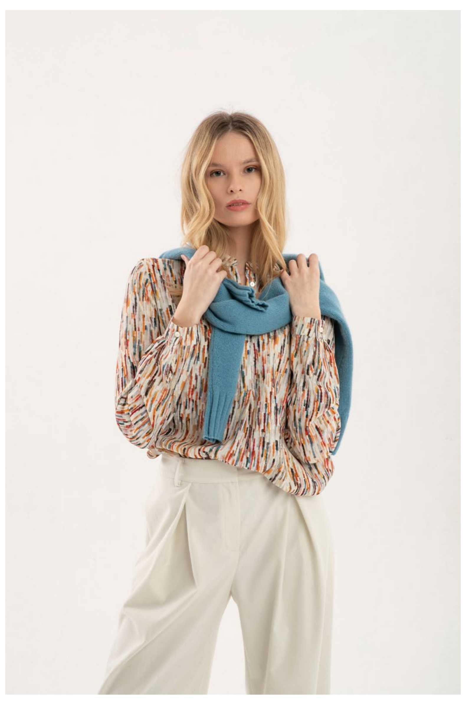
Henley-style printed blouse in stretch viscose, art. 1924 Trousers in viscose micro-flannel, art. 3020 On shoulder: Sweater in 100% cashmere, art. 2141