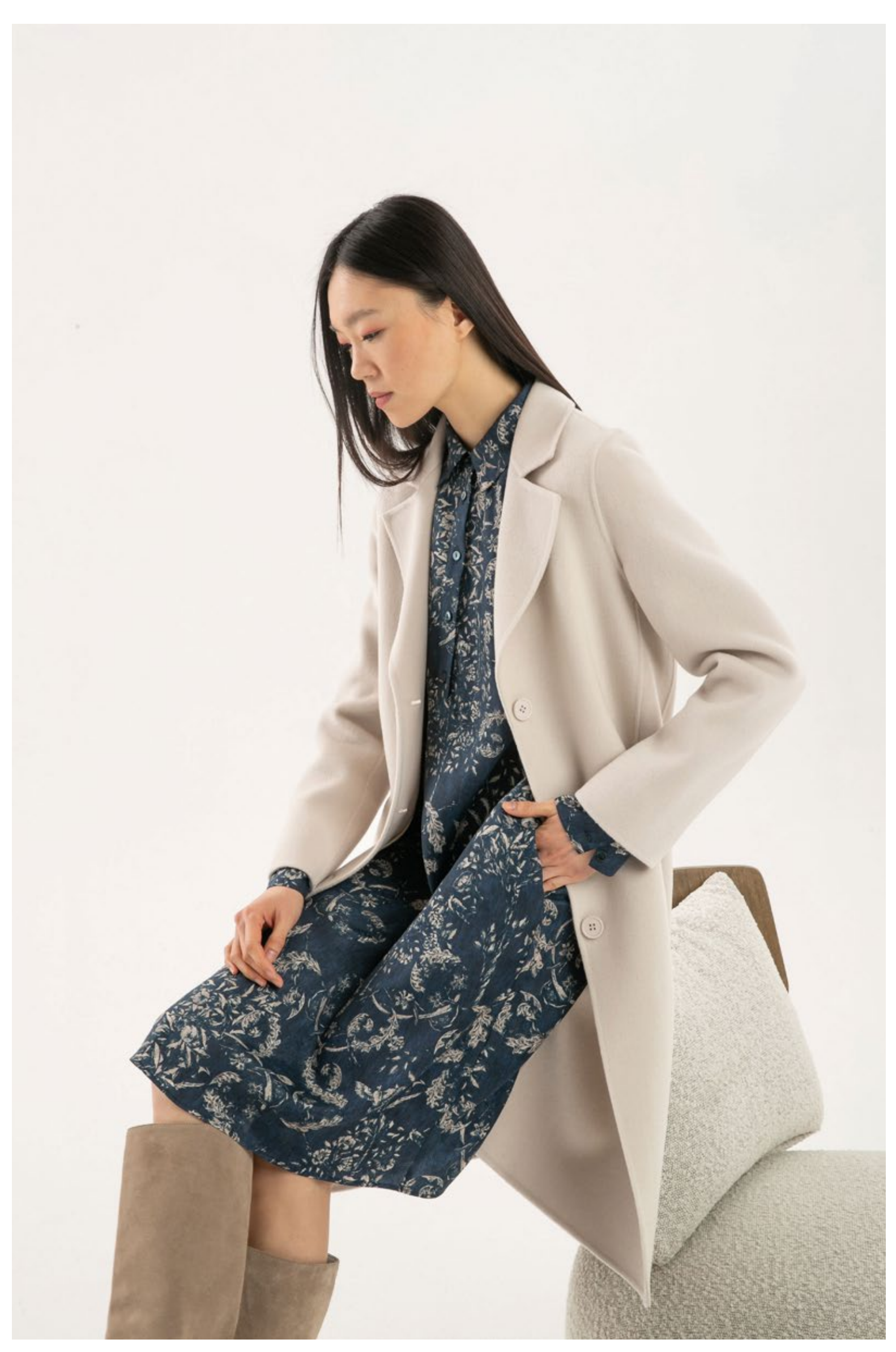
Printed dress in lyocell and viscose, art. 4006 Coat in double fabric wool and cashmere, art. 8110