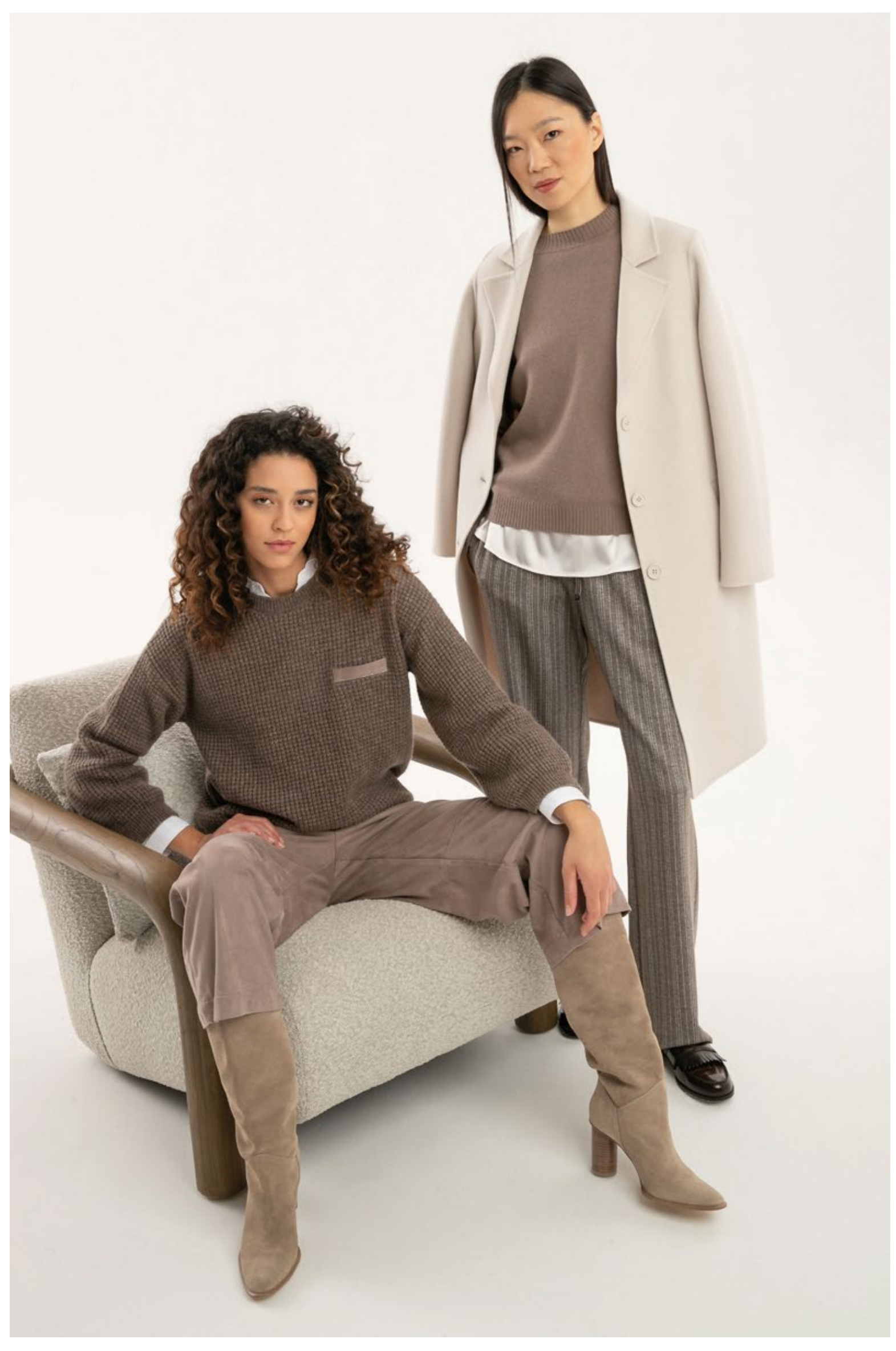
LEFT: Shirt in stretch popeline with chain embellishment, art. 5033 - Sweater in cashmere and silk, art. 2610 - Trousers in faux suede, art. 3018 RIGHT: Sleeveless top in satin silk stretch, art. 1907 - Sweater in 100% cashmere, art. 2150 - Trousers in jacquard, art. 3007 - Coat in double fabric wool and cashmere, art. 8110