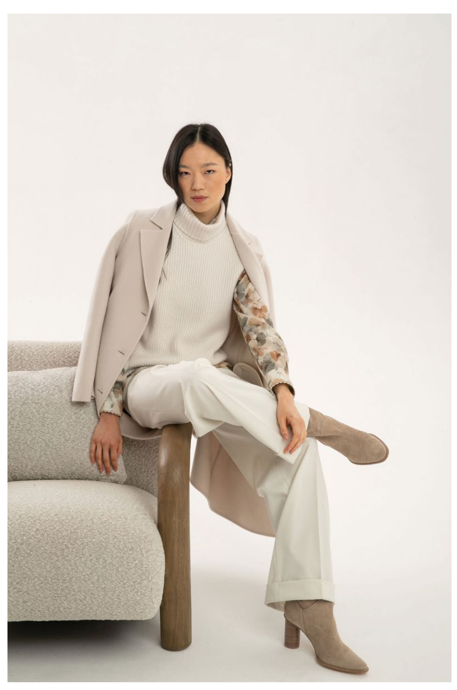
Printed shirt in stretch viscose, art. 5015 Sleeveless sweater in 100% cashmere, art. 2149 Trousers in viscose micro-flannel, art. 3023 Coat in double fabric wool and cashmere, art. 8110