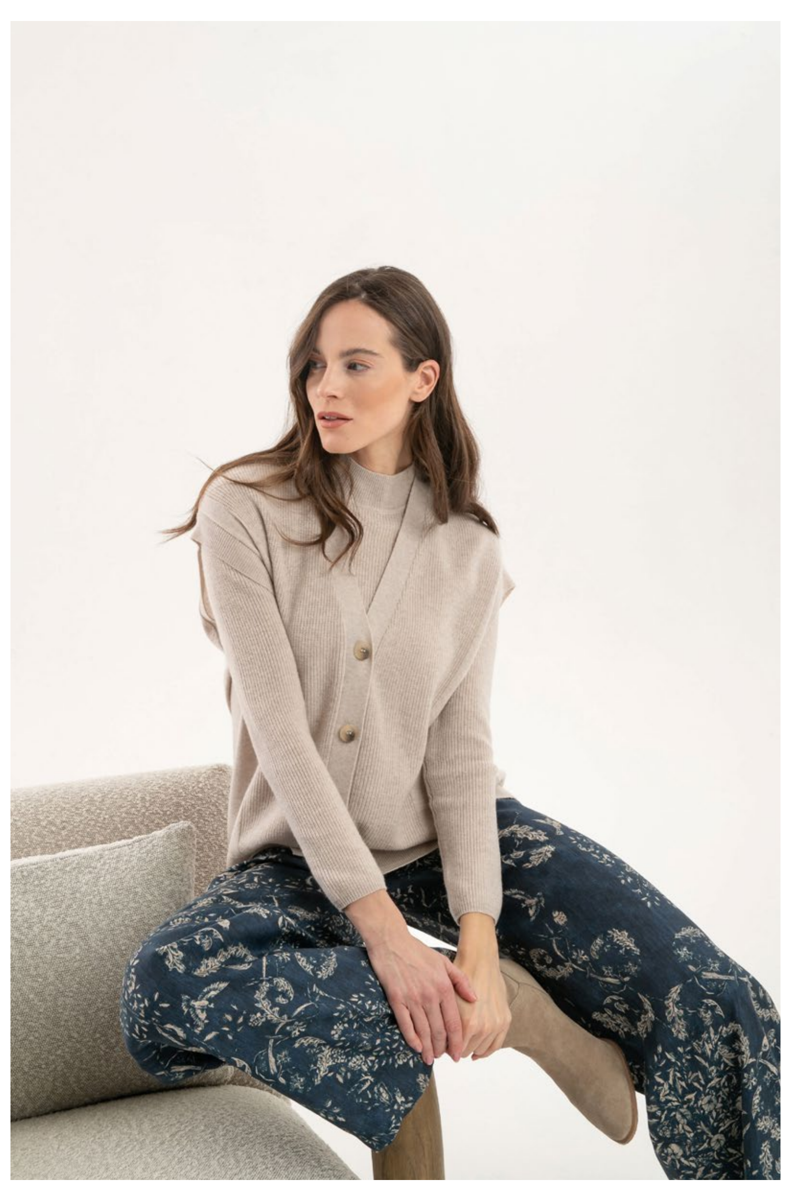
Turtle-neck sweater in wool and cashmere, art. 2212 Sleveeless cardigan in wool and cashmere, art. 2213 Printed trousers in lyocell and viscose, art. 3056