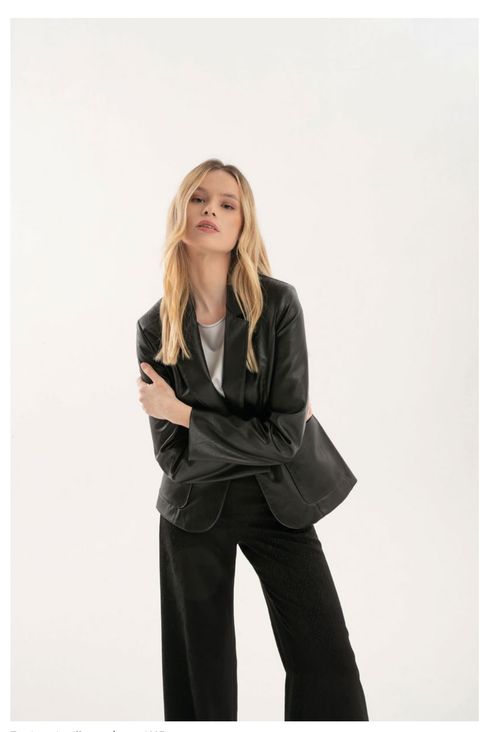
Top in satin silk stretch, art. 1907 Trousers in satin viscose jacquard, art. 3054 Jacket in faux leather, art. 8079