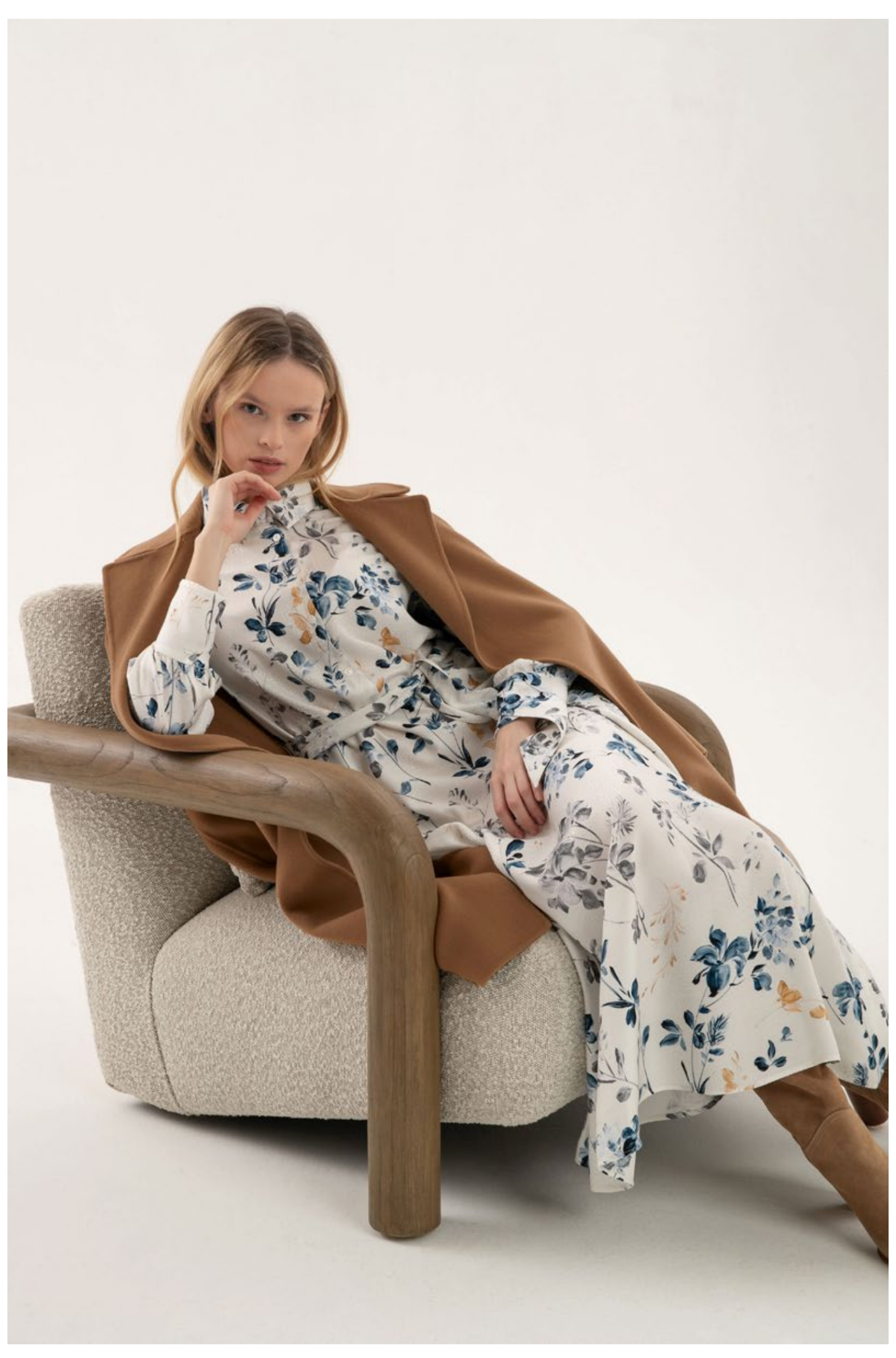
Printed shirt dress in viscose jacquard, art. 4003 Coat in double fabric wool and cashmere, art. 8109