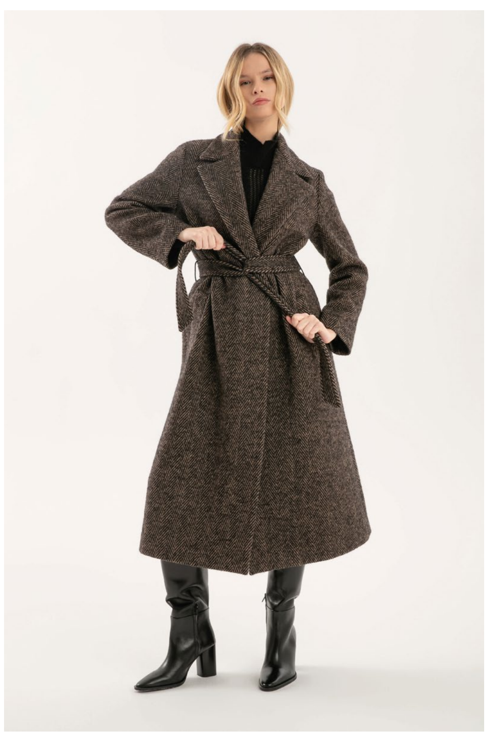
High neck sweater in 100% cashmere, art. 2161 Tweed coat in wool blend, art. 8121