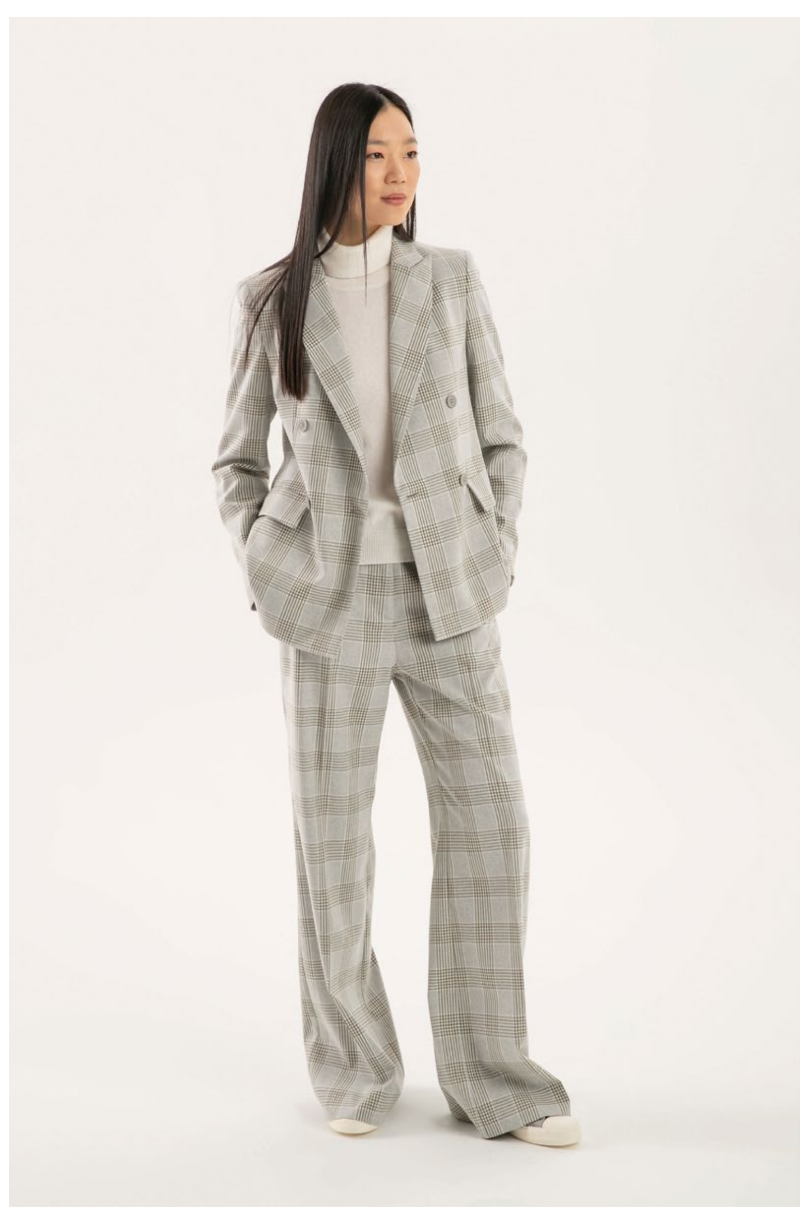
Turtle-neck sweater in 100% cashmere, art. 2152 Jacket, art. 8041 var. 502 grey check Trousers, art. 3036 var. 502 grey check