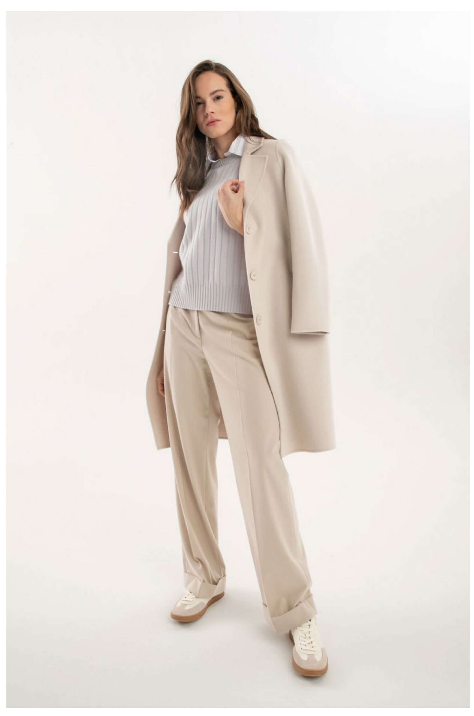
Shirt in stretch popeline with chain embellishment, art. 5034 Sweater in 100% cashmere, art. 2130 Trousers in viscose micro-flannel, art. 3023 Coat in double fabric wool and cashmere, art. 8110