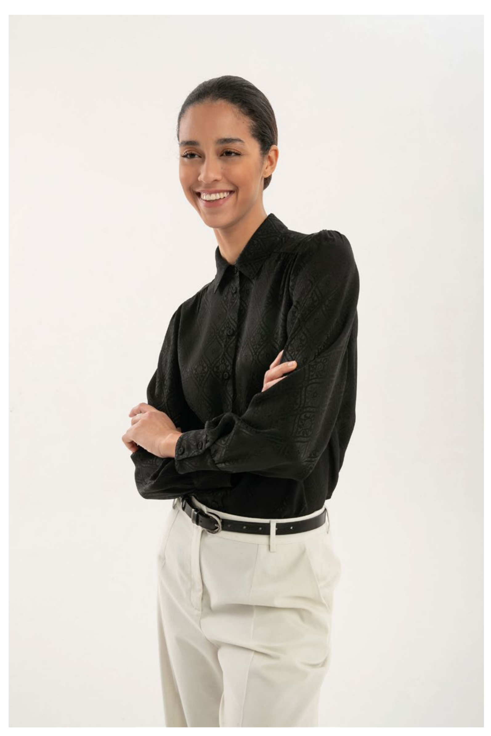
Shirt in satin viscose jacquard, art. 5023 Trousers in viscose micro-flannel, art. 3023 Leather belt, art. 6038