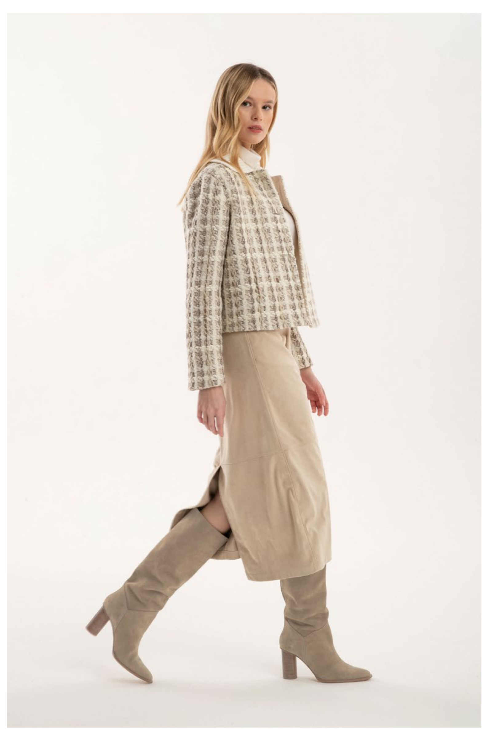
Sweater in 100% cashmere, art. 2152 Skirt in faux suede, art. 3019 Jacket in wool and cotton with knitted collar, art. 8168