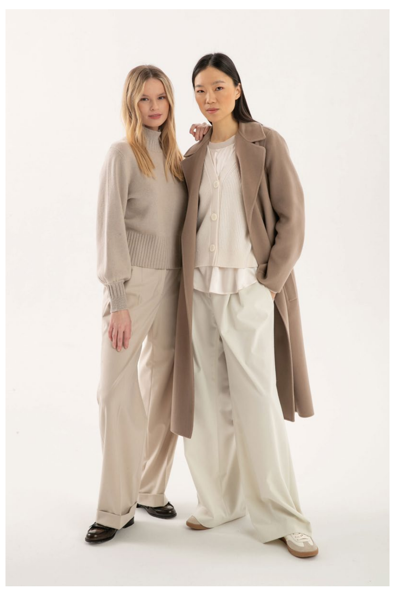
LEFT: Sweater in 100% cashmere, art. 2132 - Trousers in viscose micro-flannel, art. 3023 RIGHT: Sleeveless top in satin silk stretch with knitted collar, art. 1905 - Cardigan in wool and cashmere, art. 2225 - Trousers in viscose micro-flannel, art. 3020 - Coat in double fabric wool and cashmere, art. 8109