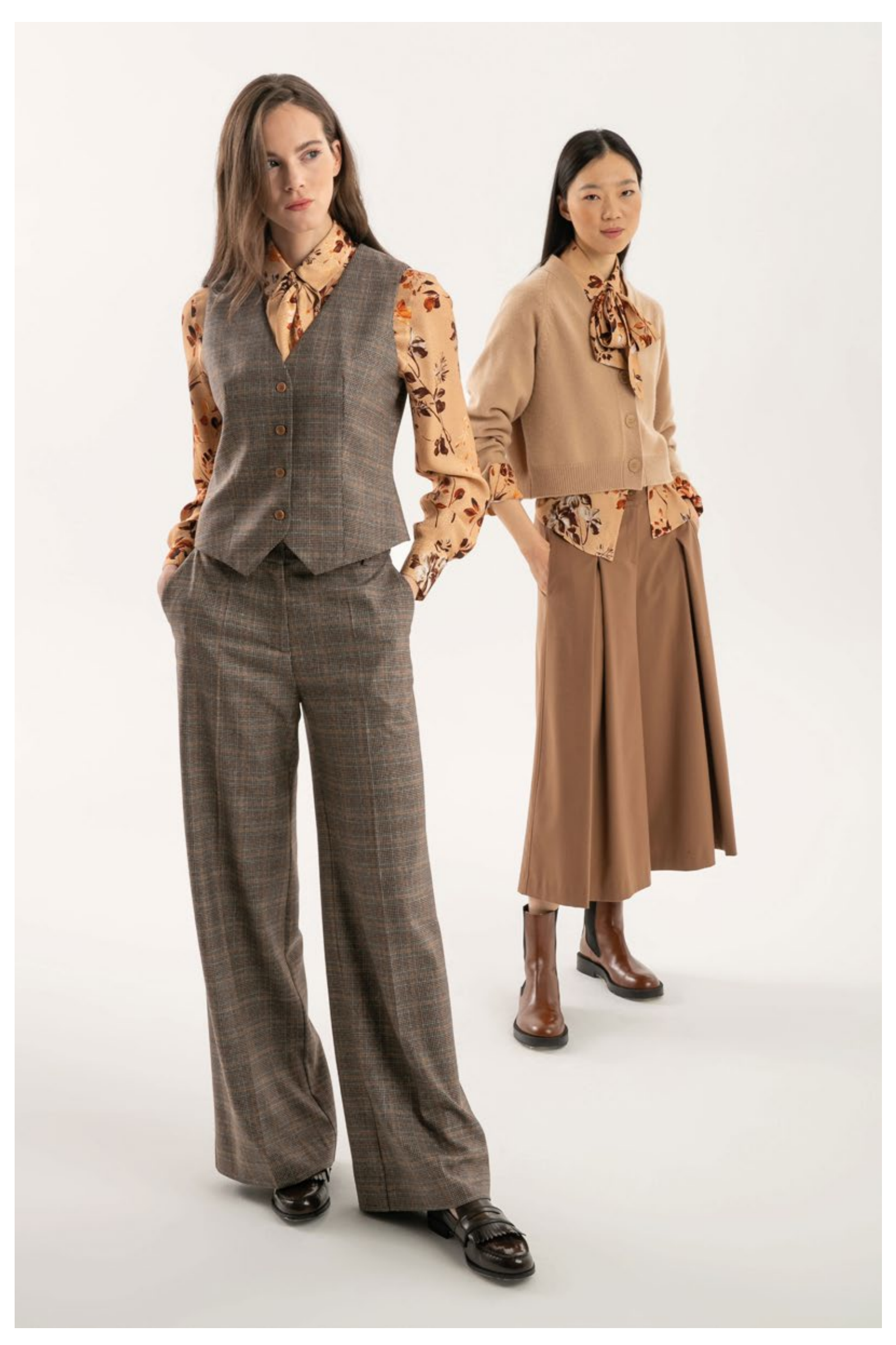
LEFT: Printed shirt in viscose jacquard with lace, art. 5007 - Vest, art. 8040 var. 104 orange check - Trousers, art. 3036 var. 104 orange check

RIGHT: Printed shirt in viscose jacquard with lace, art. 5007 - Cardigan in 100% cashmere, art. 2123 - Trousers in viscose micro-flannel, art. 3024