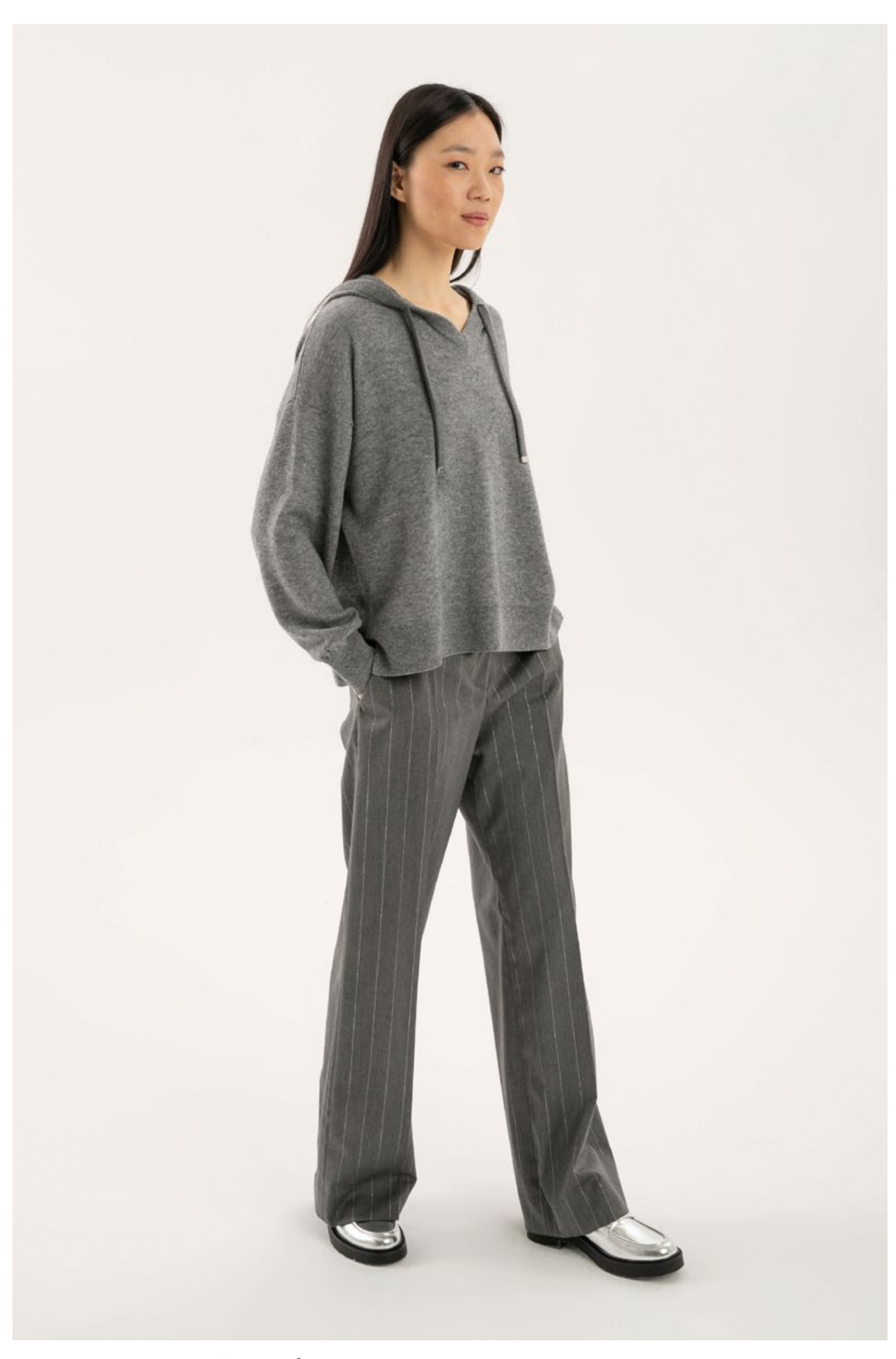
Hooded sweater in wool and cashmere, art. 2208 Trousers in viscose with lurex pinstripe, art. 3040