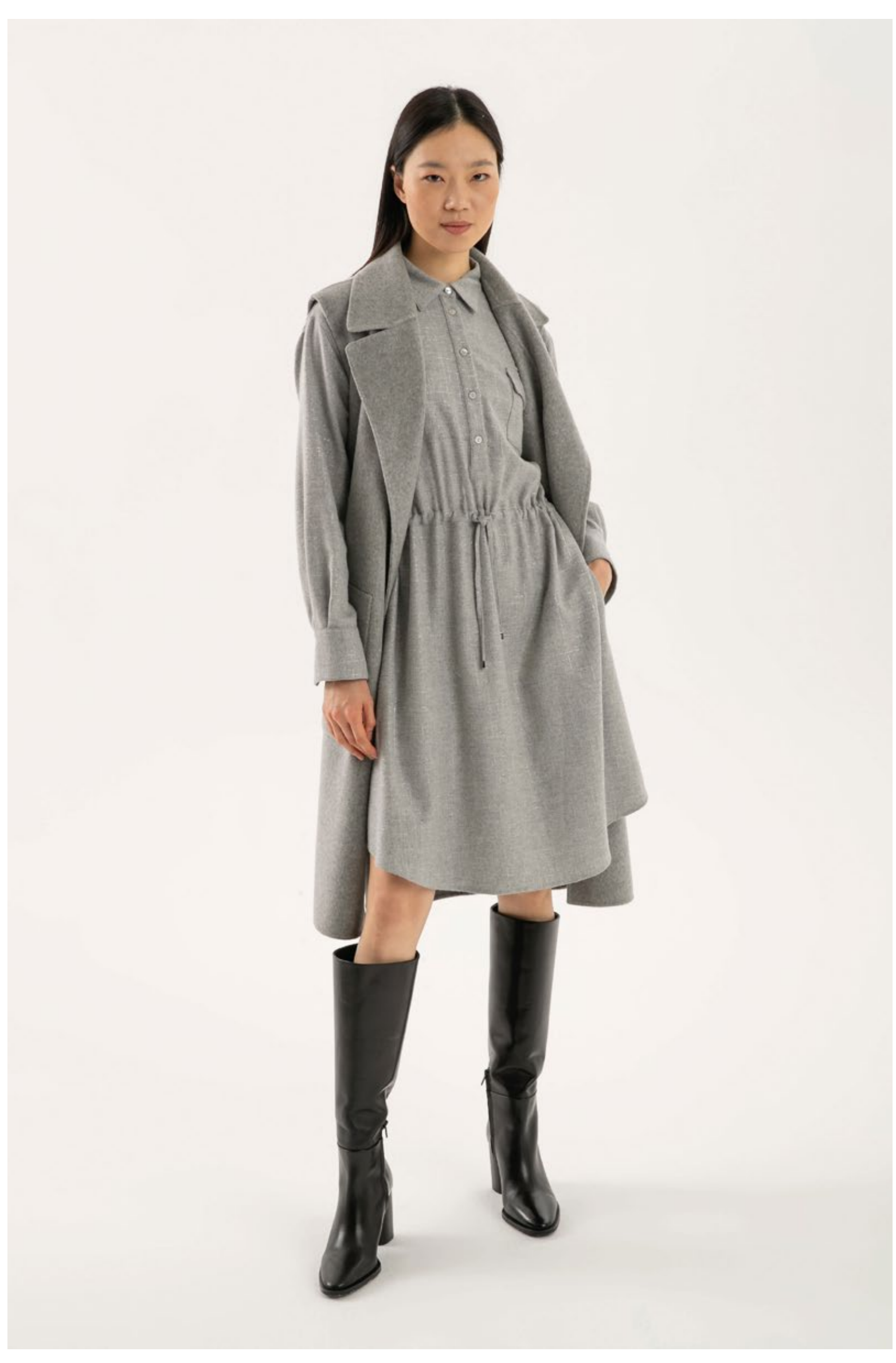
Dress in viscose and wool with lurex, art. 4028 Gilet in double fabric wool and cashmere, art. 8108