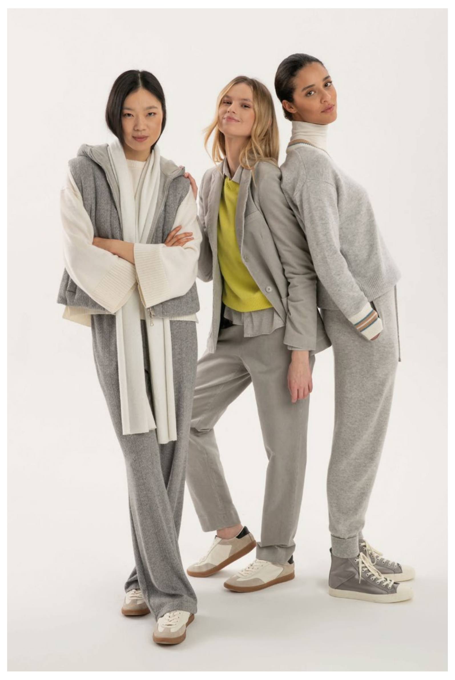
LEFT: Sweater in 100% cashmere, art. 2124 - Pants, art. 3013 - Sleeveless double-face down jacket, art. 8090 - Scarf in cashmere with sequins, art. 6012

CENTRE: Shirt in jersey lurex, art. 5000 - Sweater, art. 2100 - Trousers, art. 3044 - Jacket, art. 8057 RIGHT: Turtle-neck t-shirt, art. 1512 - Sweater, art. 2170 - Pants in 100% cashmere, art. 2158