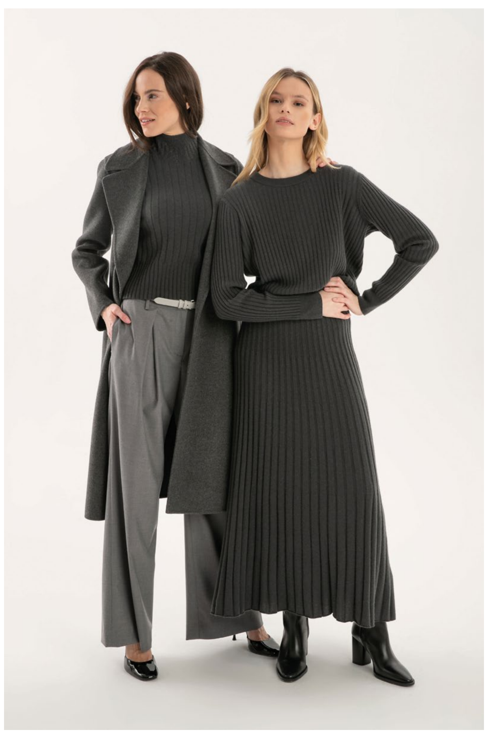
LEFT: High neck sweater in 100% cashmere, art. 2133 - Trousers in viscose micro-flannel, art. 3020 - Coat in double fabric wool and cashmere, art. 8109 - Leather belt, art. 6036 RIGHT: Sweater in wool and cashmere, art. 2251 - Skirt in wool and cashmere, art. 2250