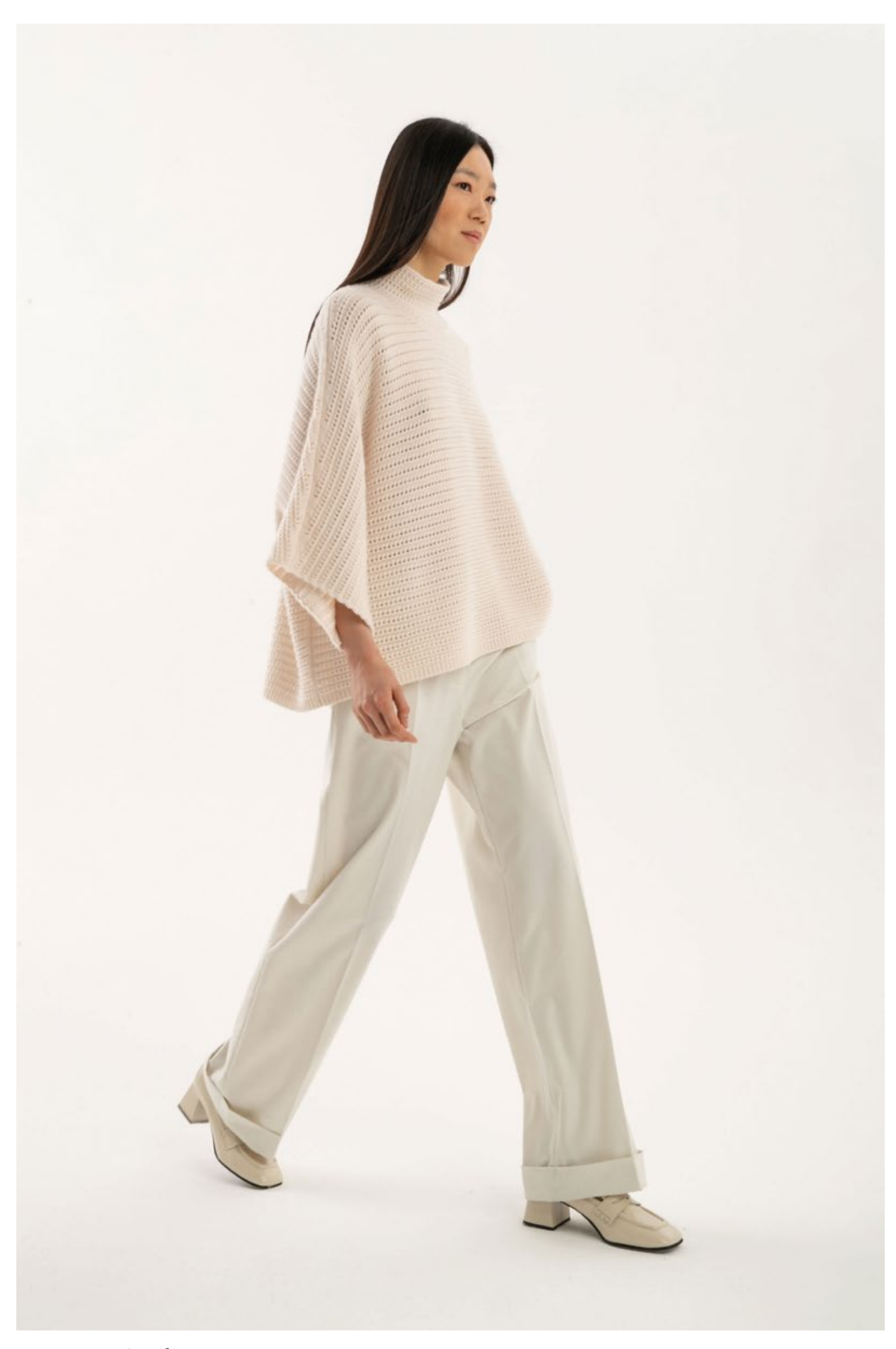
Cape in 100% cashmere, art. 2171 Trousers in viscose micro-flannel, art. 3023