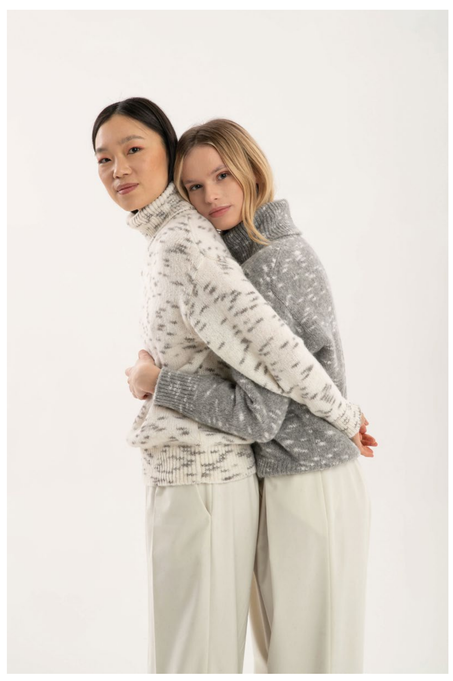
LEFT: Turtle-neck sweater in wool and Alpaca, art. 2654 - Trousers in viscose micro-flannel, art. 3023 RIGHT: Turtle-neck sweater in wool and Alpaca, art. 2654 - Trousers in viscose micro-flannel, art. 3020