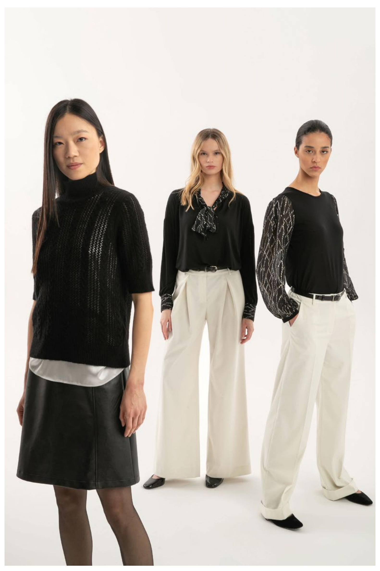
LEFT: Top, art. 1907 - High neck sweater in 100% cashmere, art. 2161 - Skirt in faux leather, art. 3063 CENTRE: Blouse in milk fiber with voile lamé, art. 1211 - Trousers, art. 3020 - Leather belt, art. 6038 RIGHT: Blouse in milk fiber with voile lamé, art. 1215 - Trousers, art. 3023 - Leather belt, art. 6038