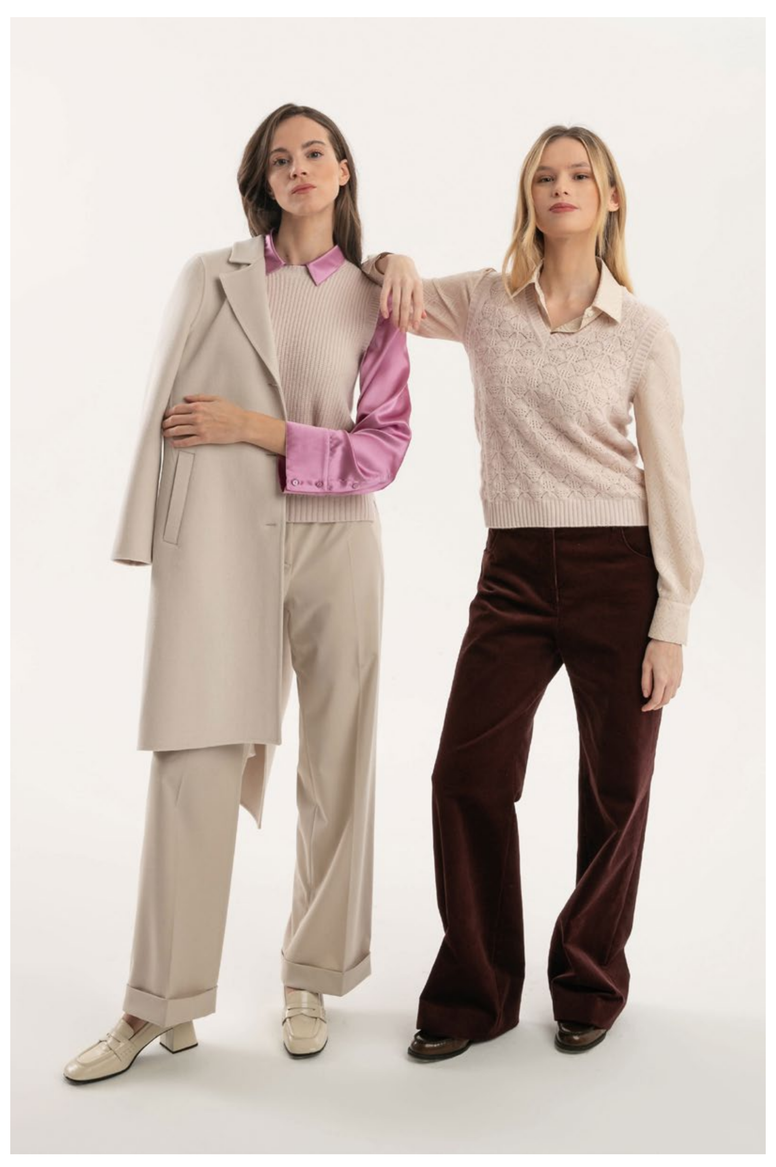
LEFT: Shirt in satin silk stretch, art. 5003 - Round-neck top in 100% cashmere, art. 2148 - Trousers in viscose micro-flannel, art. 3023 - Coat in double fabric wool and cashmere, art. 8110 RIGHT: Shirt in satin viscose jacquard, art. 5024 - V-neck top in 100% cashmere, art. 2165 - Trousers in cotton corduroy, art. 3043