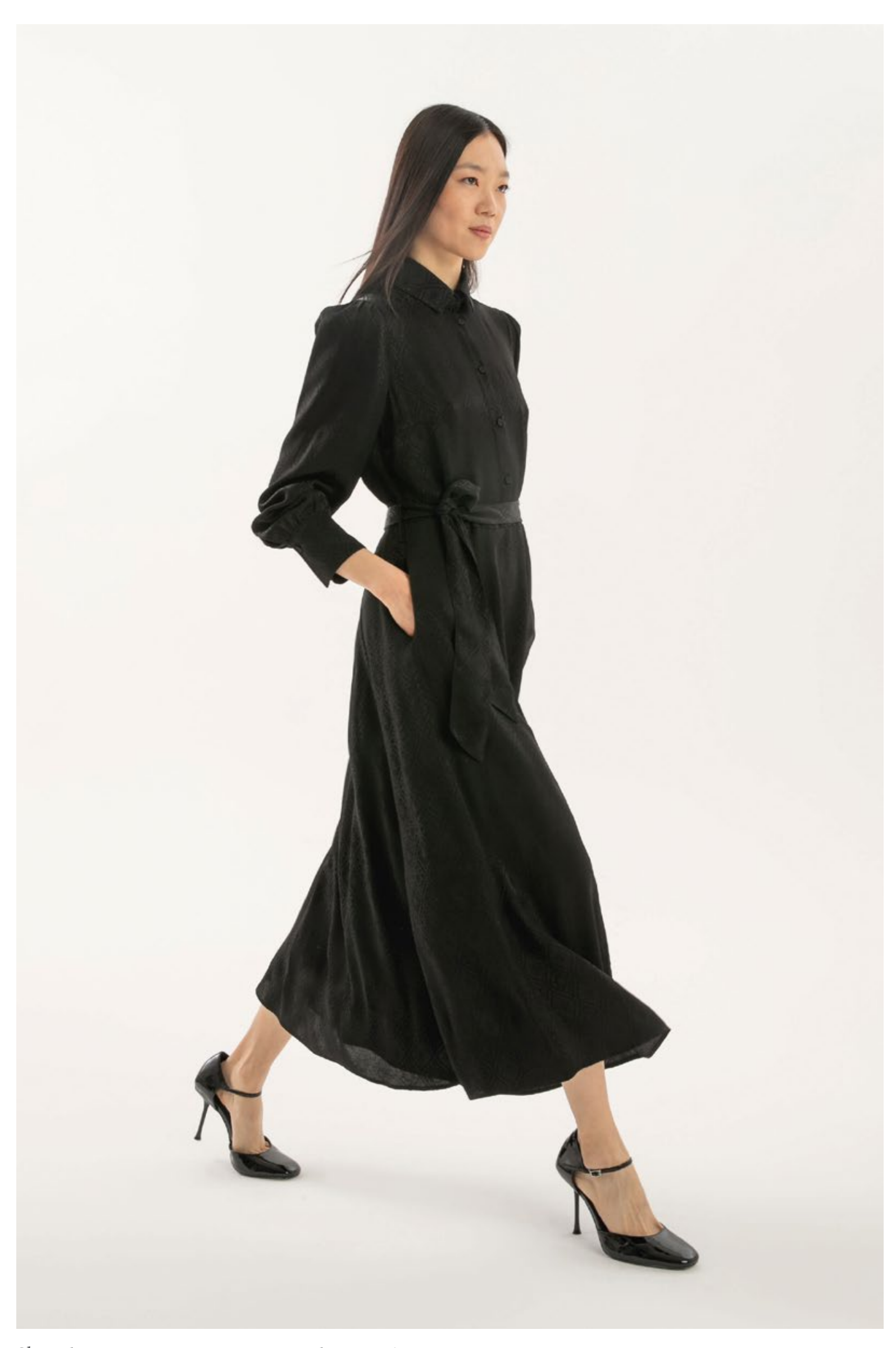
Shirt dress in satin viscose jacquard, art. 4019