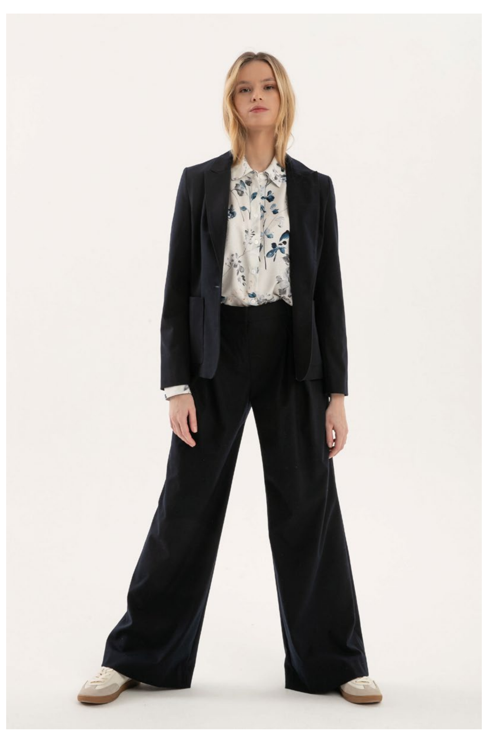
Printed shirt in viscose jacquard, art. 5006 Jacket in viscose micro-flannel, art. 8030 Trousers in viscose micro-flannel, art. 3020