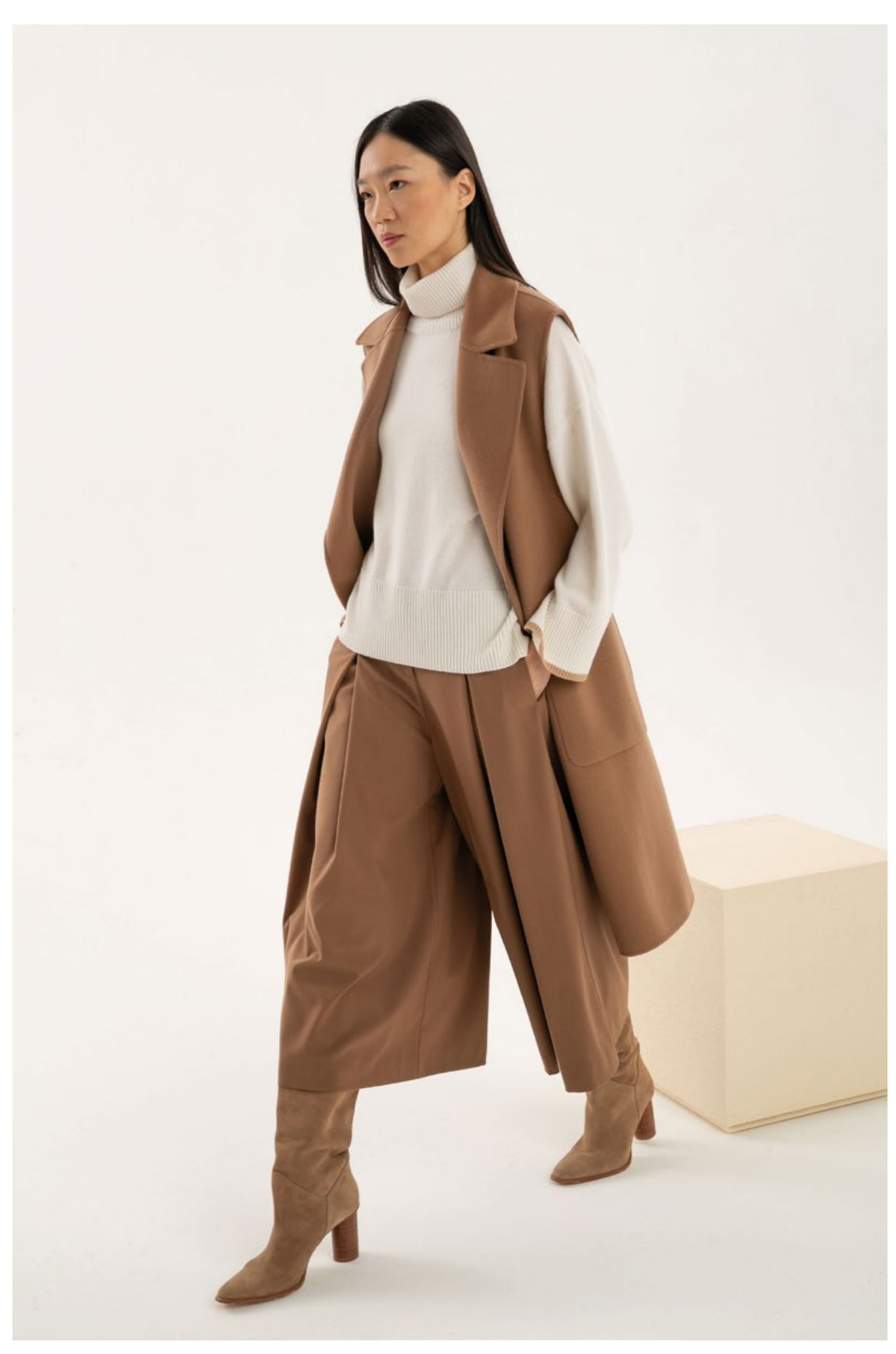
Sweater in 100% cashmere, art. 2134 Trousers in viscose micro-flannel, art. 3024 Gilet in double fabric wool and cashmere, art. 8108