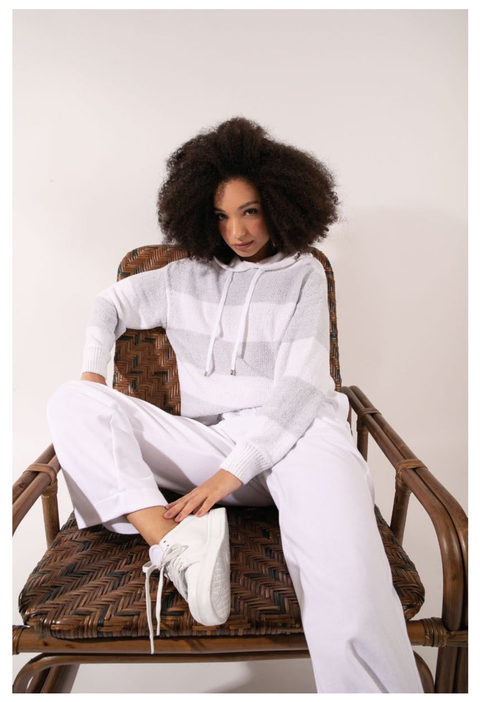
Hooded sweater in terry cotton, 2402 Wide-leg pants in cotton, art. 3005