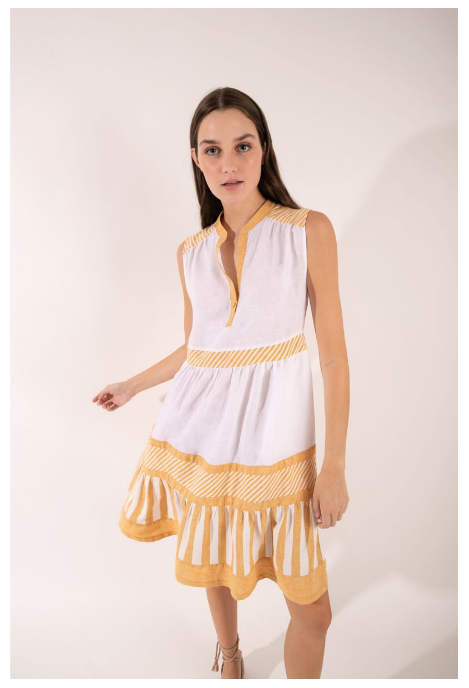
Dress in linen and viscose, art. 4176