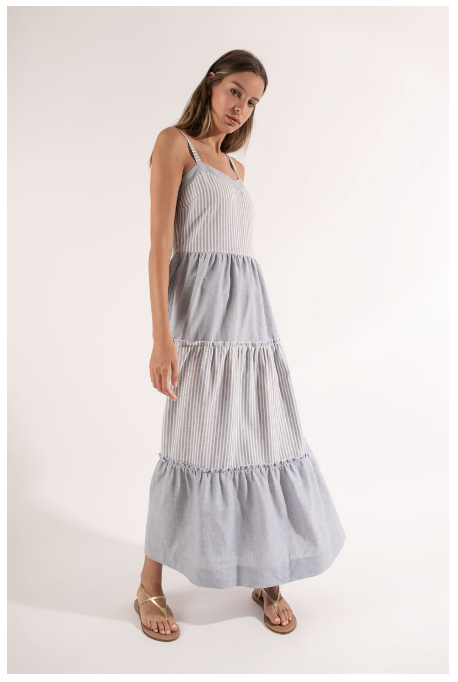
Dress in linen and viscose, art. 4178