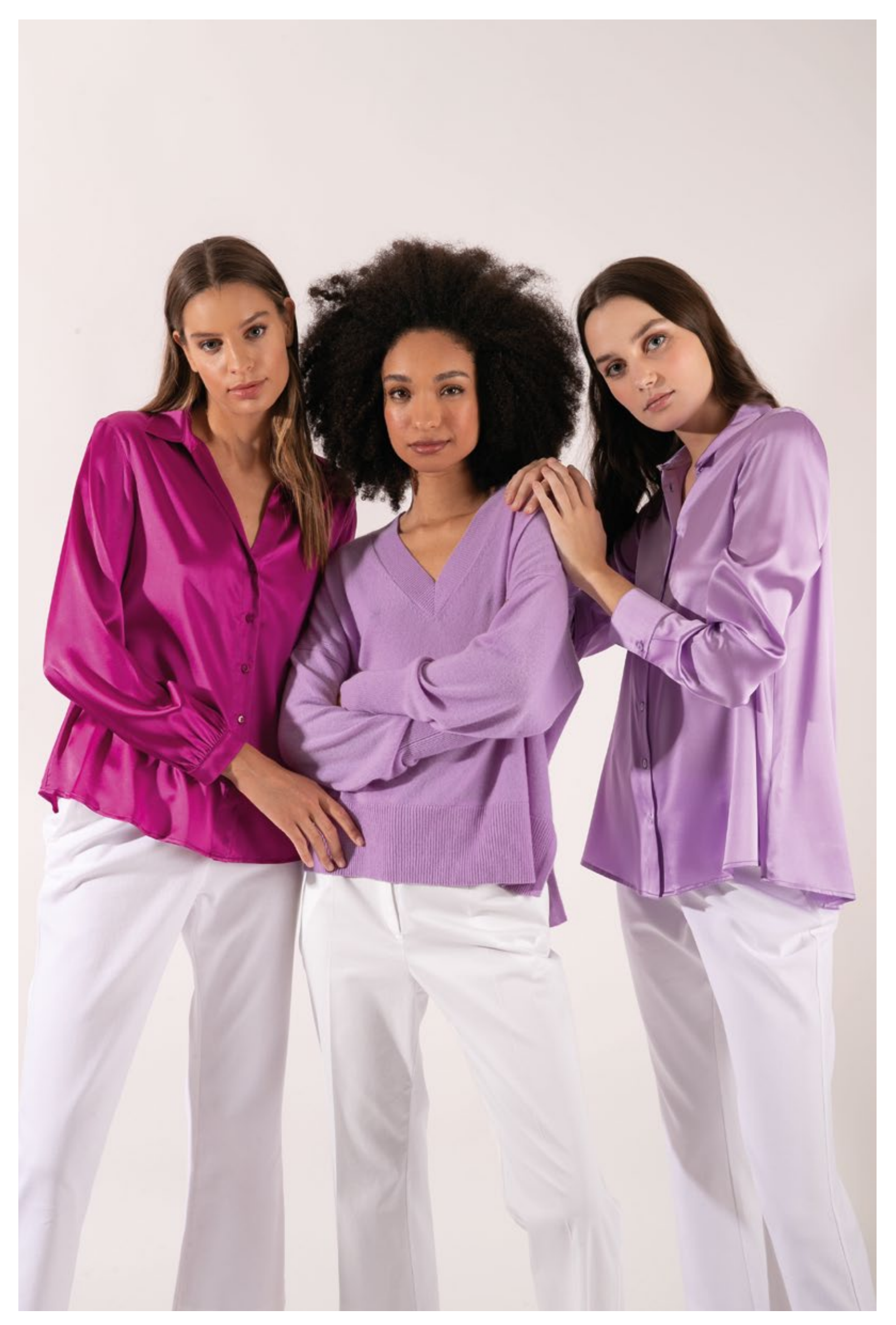
On the left: Blouse in stretch silk, art. 5016 - Boot-cut trousers in stretch bull cotton, art. 3040 In the centre: Sweater in 100% cashmere, art. 2102 - Boot-cut trousers in stretch cotton, art. 3025 On the right: Shirt in stretch silk, art. 5016 - Boot-cut trousers in stretch bull cotton, art. 3040