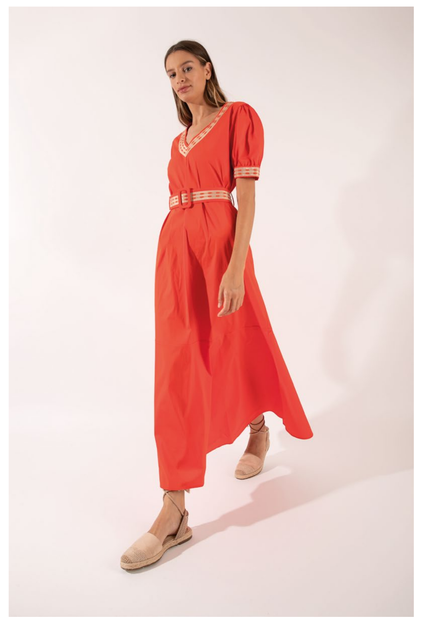
Dress in stretch popeline with decorative ribbon and belt, art. 4058