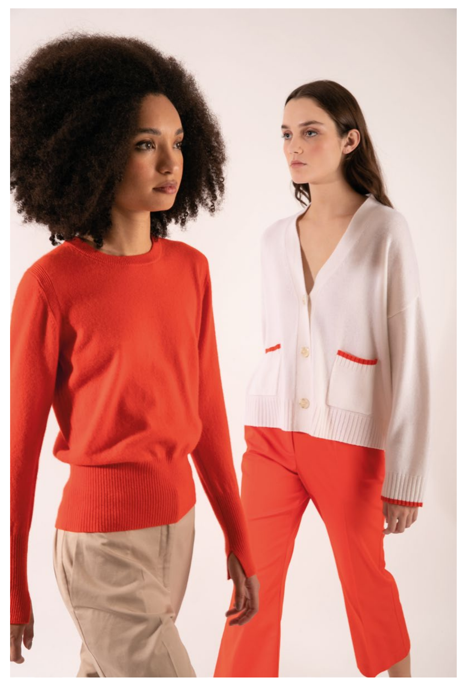
On the left: Sweater in 100% cashmere, art. 2115 - Straight-leg trousers in stretch cotton, art. 3026 On the right: Cardigan in 100% cashmere, art. 2127 - Boot-cut trousers in stretch cotton, art. 3025