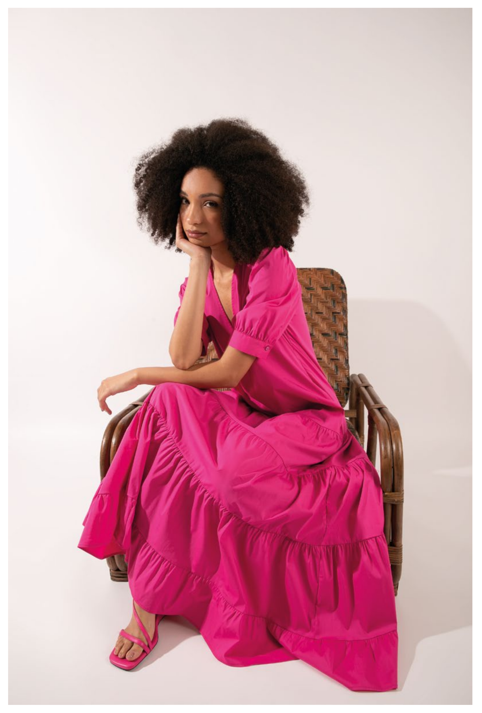
Dress in stretch popeline, art. 4050