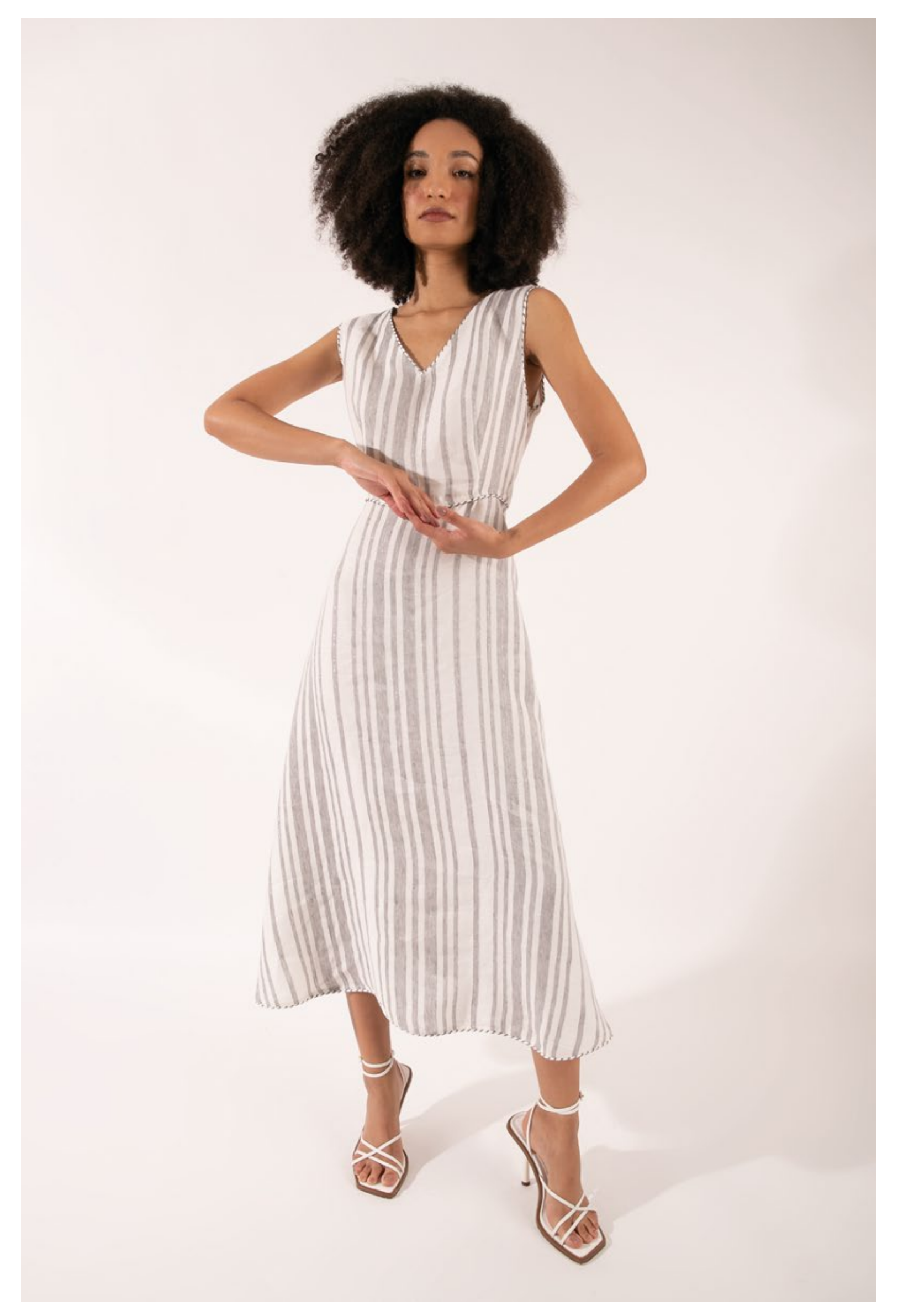
Dress in linen and viscose with trimming, art. 4173