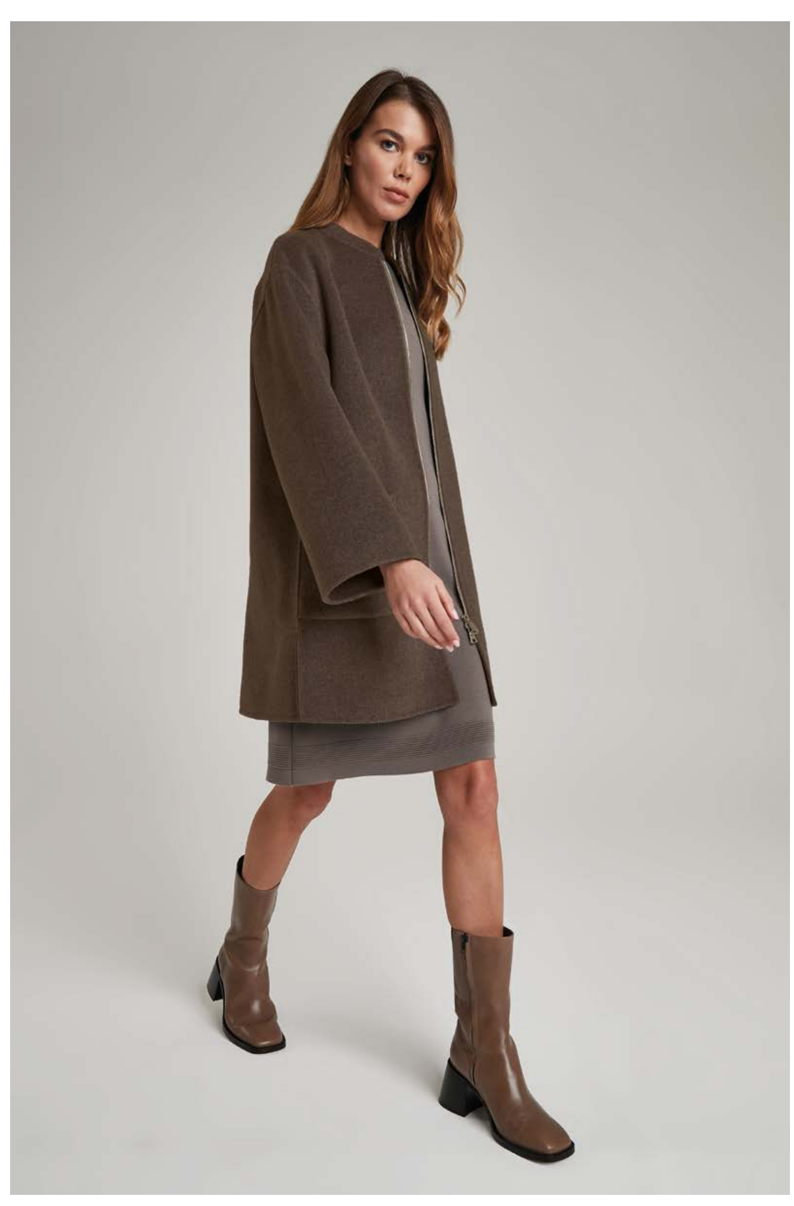
Sleeveless dress in merino wool, art. 2510 Coat in double fabric wool and cashmere, art. 8111