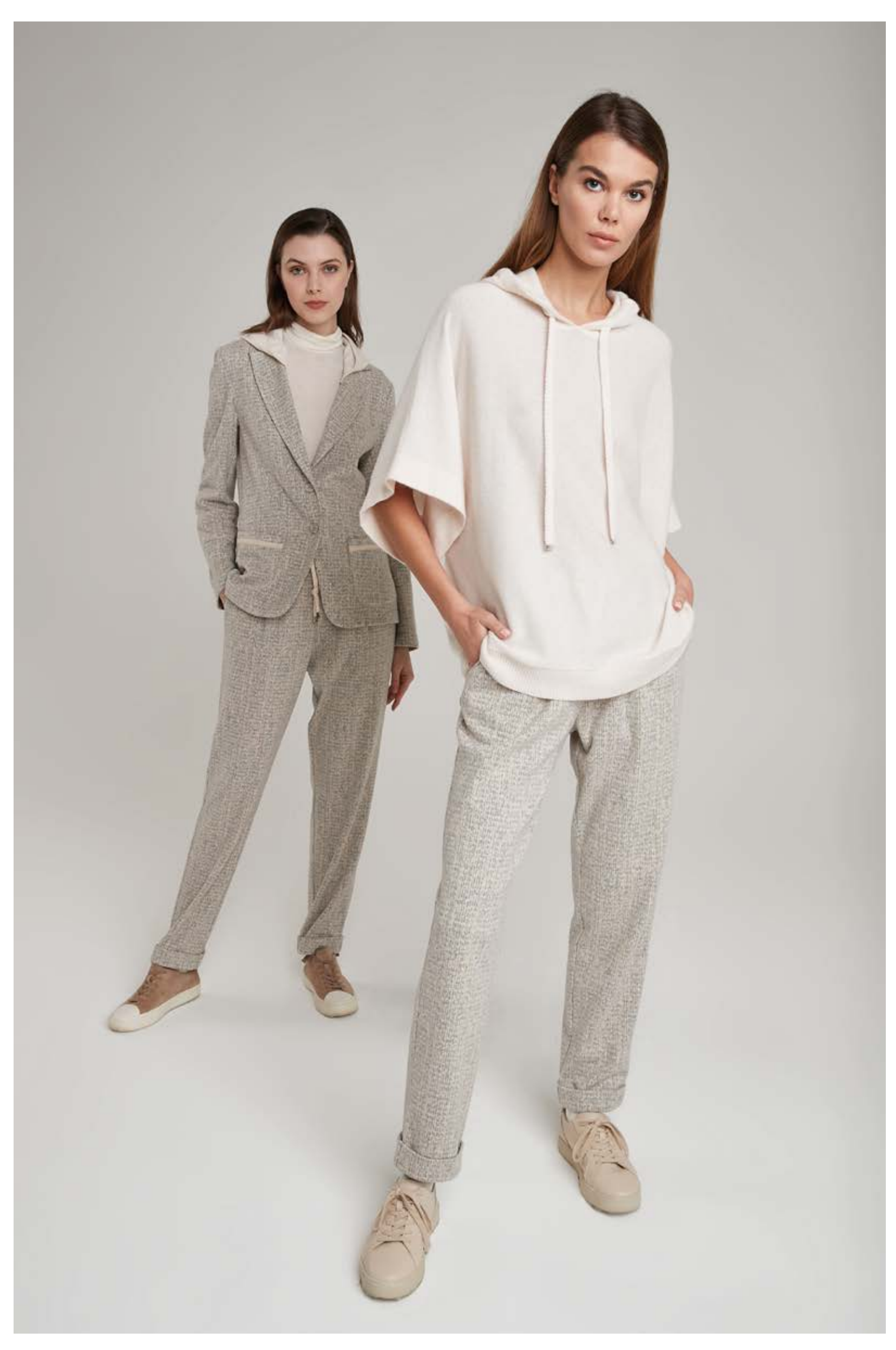
LEFT: Turtle-neck t-shirt in modal cashmere, art. 1502 - Jacket in cotton and viscose, art. 8006 Pants in in cotton and viscose, art. 3006

RIGHT: Hooded poncho in cashmere, art. 2113 - Trousers in cotton and viscose, art. 3006