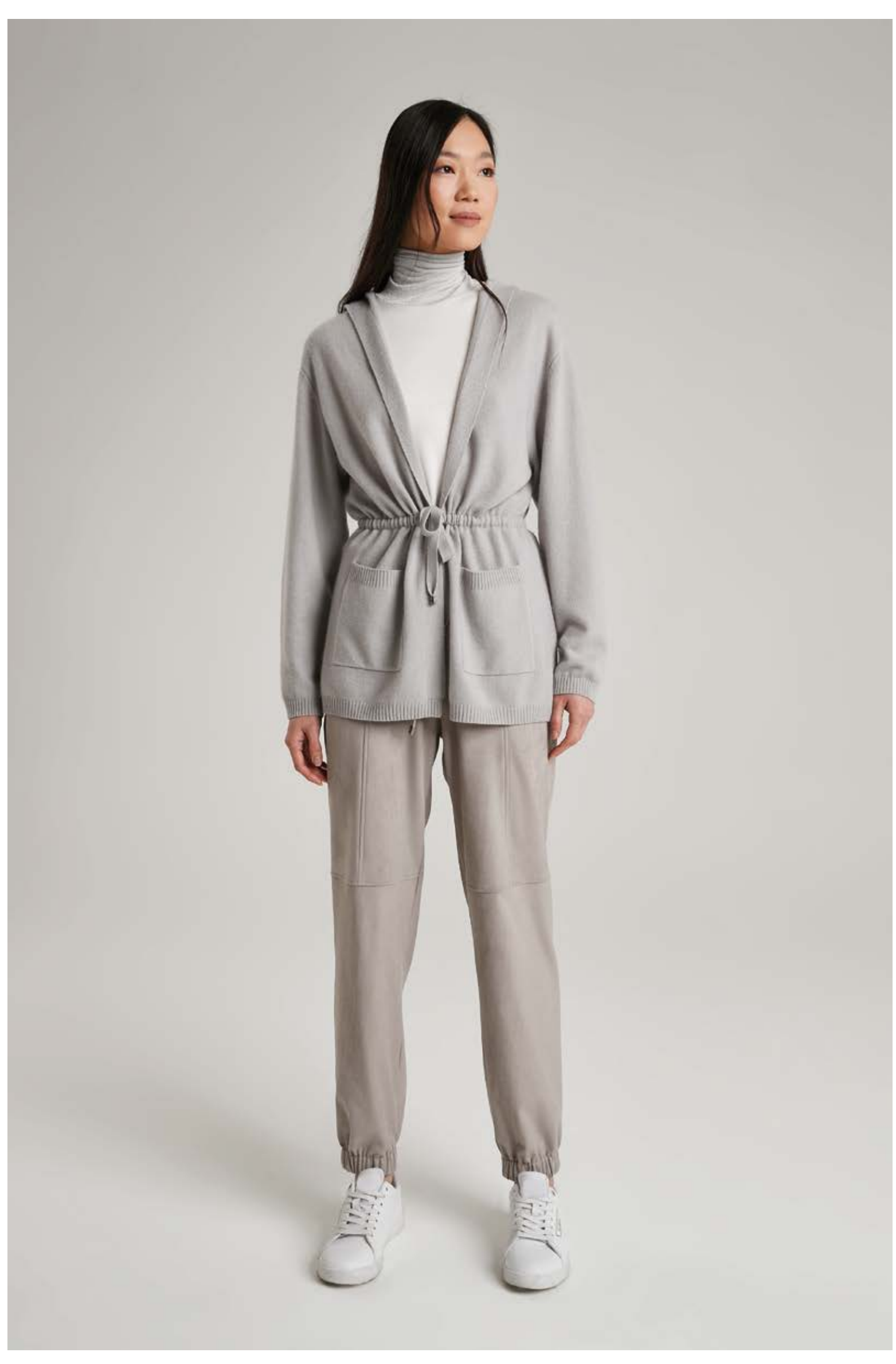
Turtle-neck t-shirt in micromodal cashmere with lurex, art. 1301 Cardigan in cashmere, art. 2117 Trousers in faux suede, art. 3017