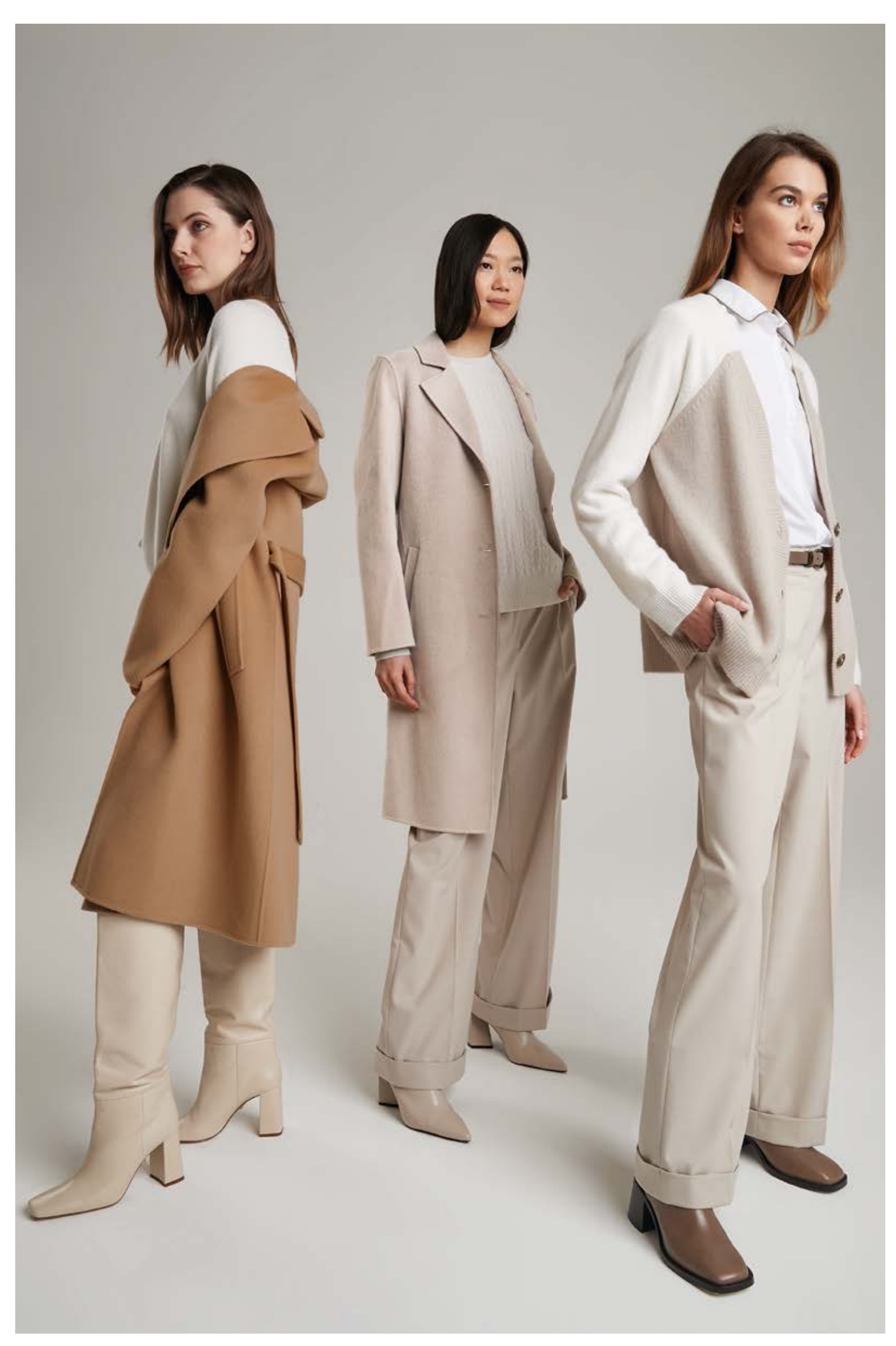
LEFT: Sweater in cashmere, art. 2122 - Skirt in wool and viscose, art. 3047 - Coat art. 8112 CENTRE: Sweater in cashmere with cables, art. 2160 - Trousers in viscose art. 3023 - Coat art. 8110 RIGHT: Shirt, art. 5040 - Cardigan in cashmere, art. 2128 - Trousers, art. 3023 - Leather belt, art. 6035