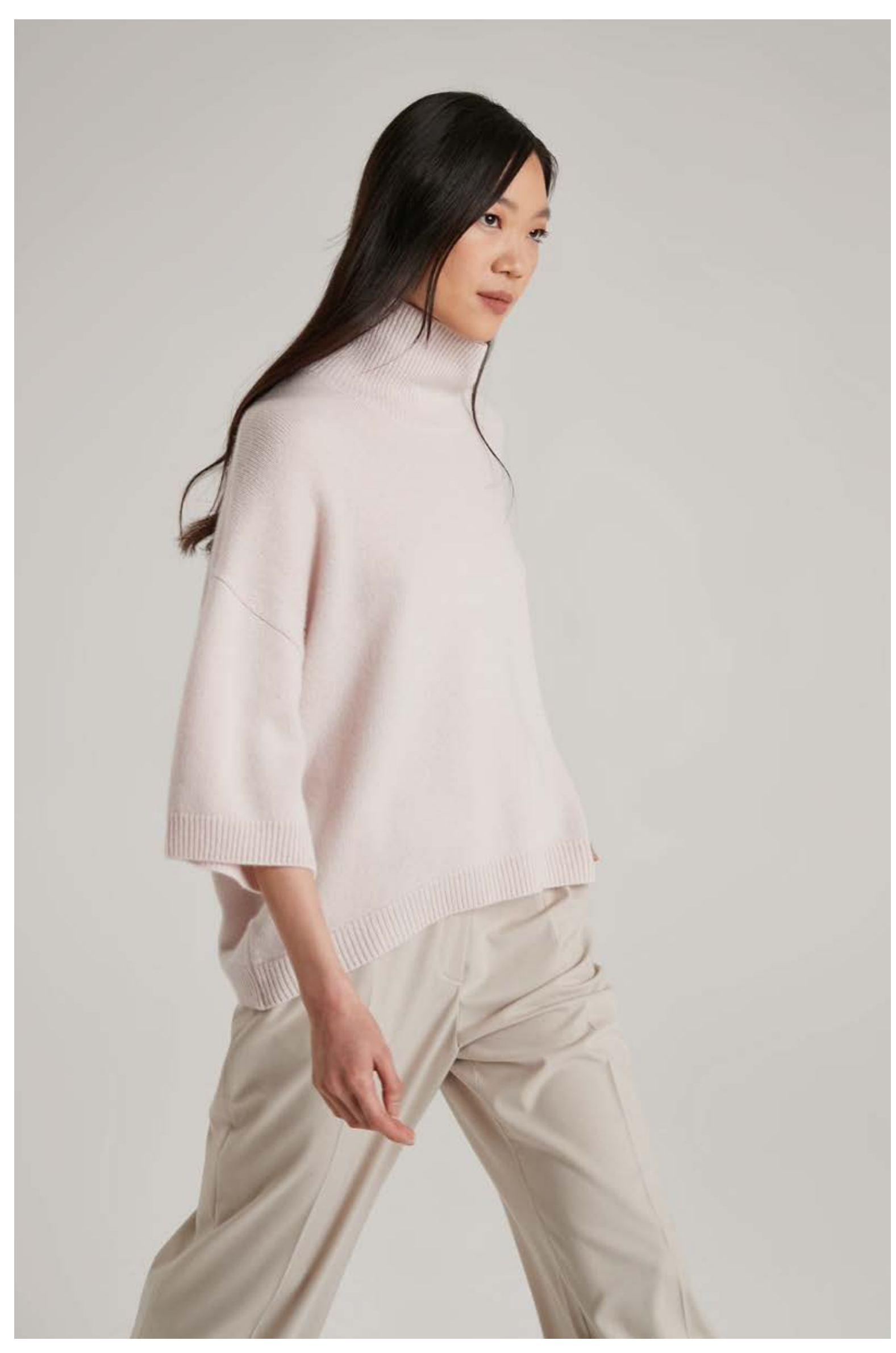
Turtle-neck sweater in cashmere, art. 2125 Trousers in viscose, art. 3023