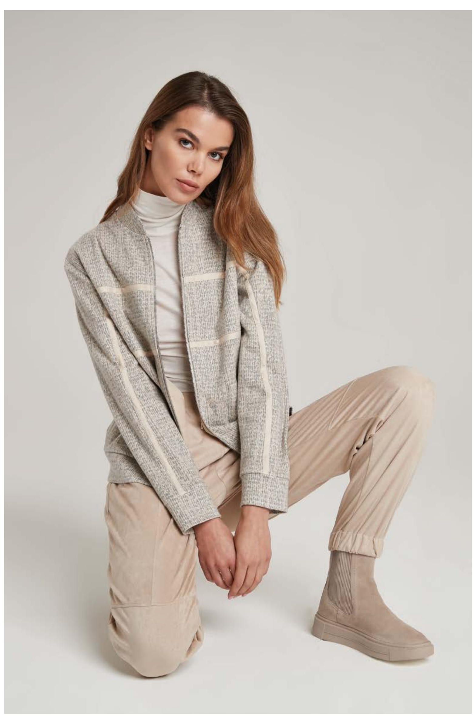
Turtle-neck t-shirt in modal cashmere, art. 1502 Sweater in cotton and viscose, art. 1806 Trousers in faux suede, art. 3017