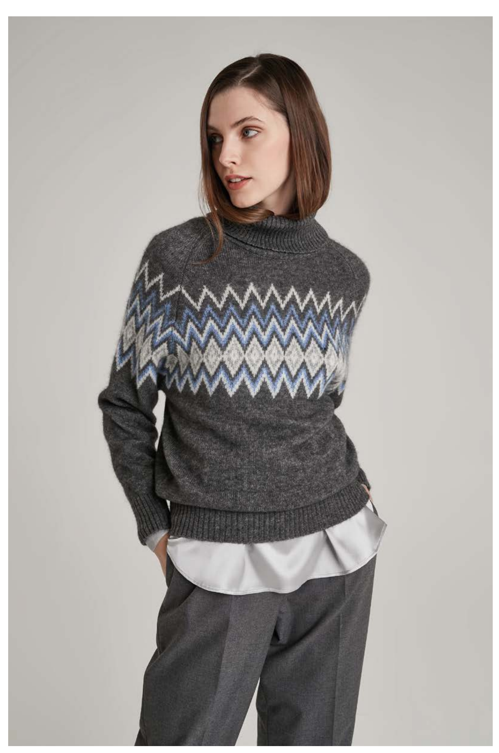
Silk blouse, art. 1911 Turtle-neck sweater in super kid mohair and silk, art. 2636 Trousers in viscose, art. 3022