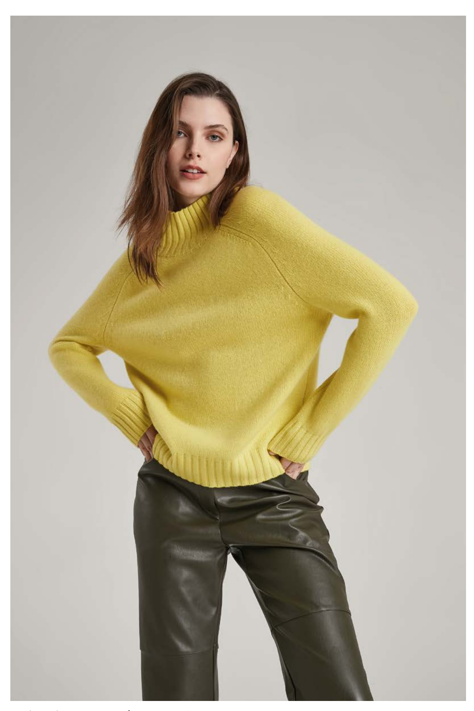
Turtle-neck sweater in cashmere, art. 2142 Trousers in faux leather, art. 3061