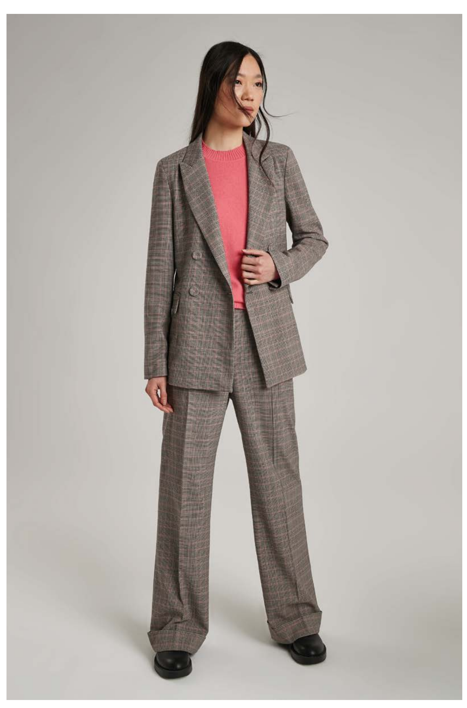
Sweater in cashmere, art. 2150 Jacket in viscose, art. 8070 Trousers in viscose, art. 3037