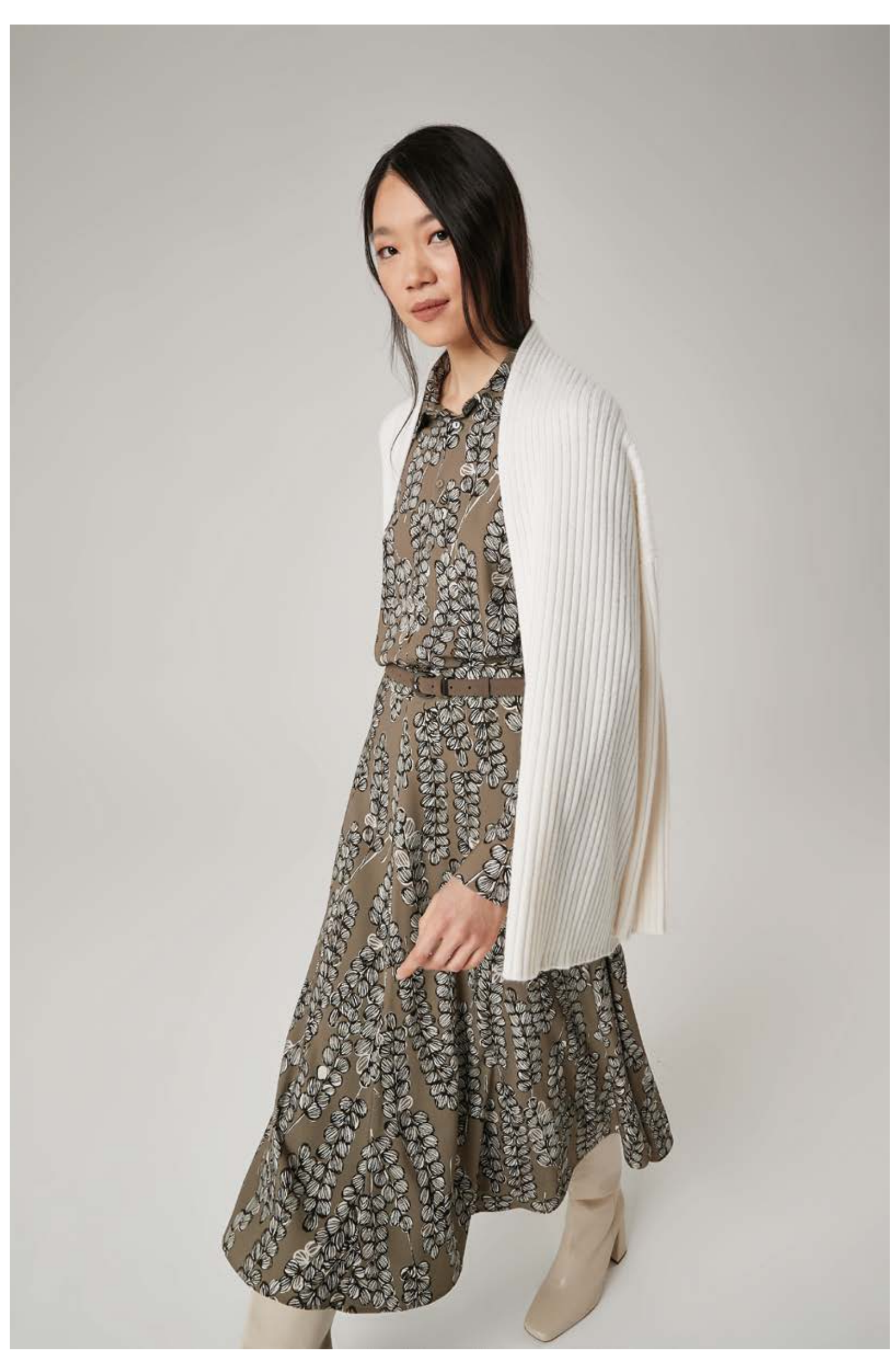
Shirt in stretch viscose, art. 5031 Cardigan in wool and cashmere, art. 2220 Skirt in stretch viscose, art. 3055 - Leather belt, art. 6035