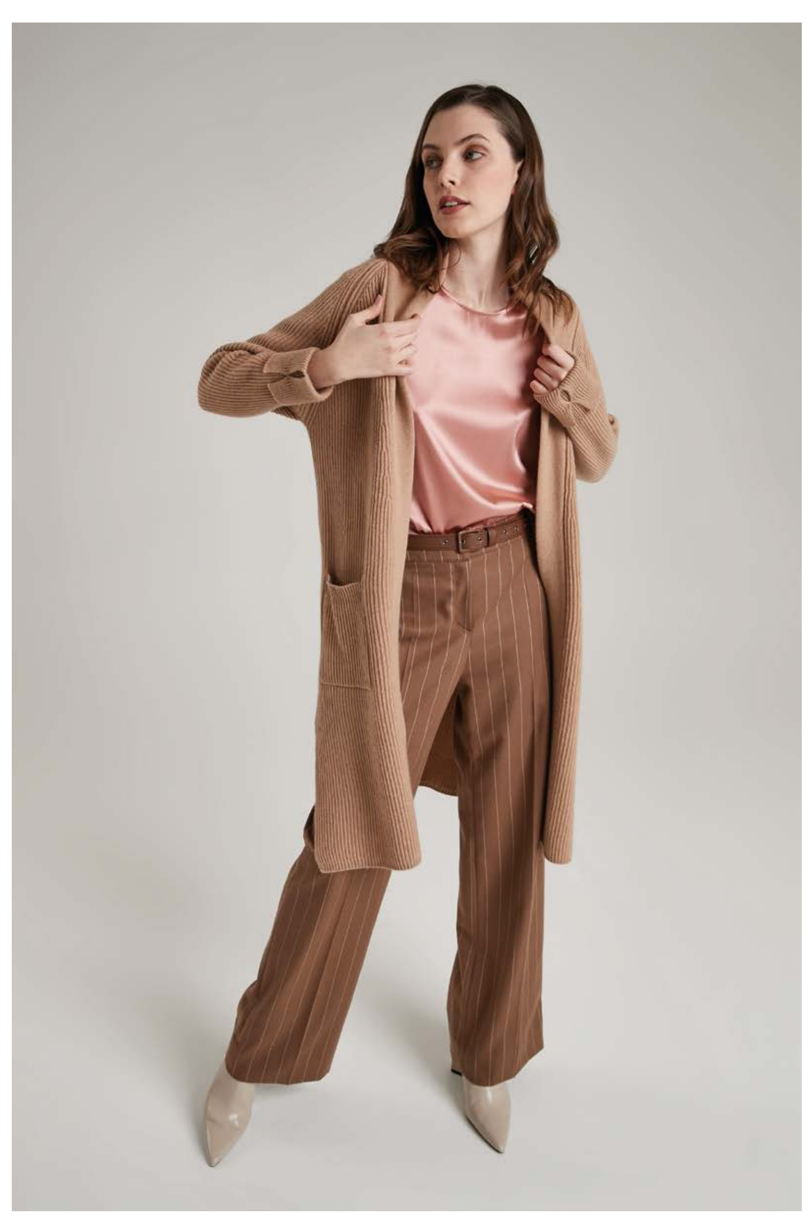
T-shirt in satin silk stretch, art. 1909 Cardigan in wool and cashmere, art. 2217 Pinstripe trousers in viscose, art. 3028 - Belt in faux leather, art. 6050