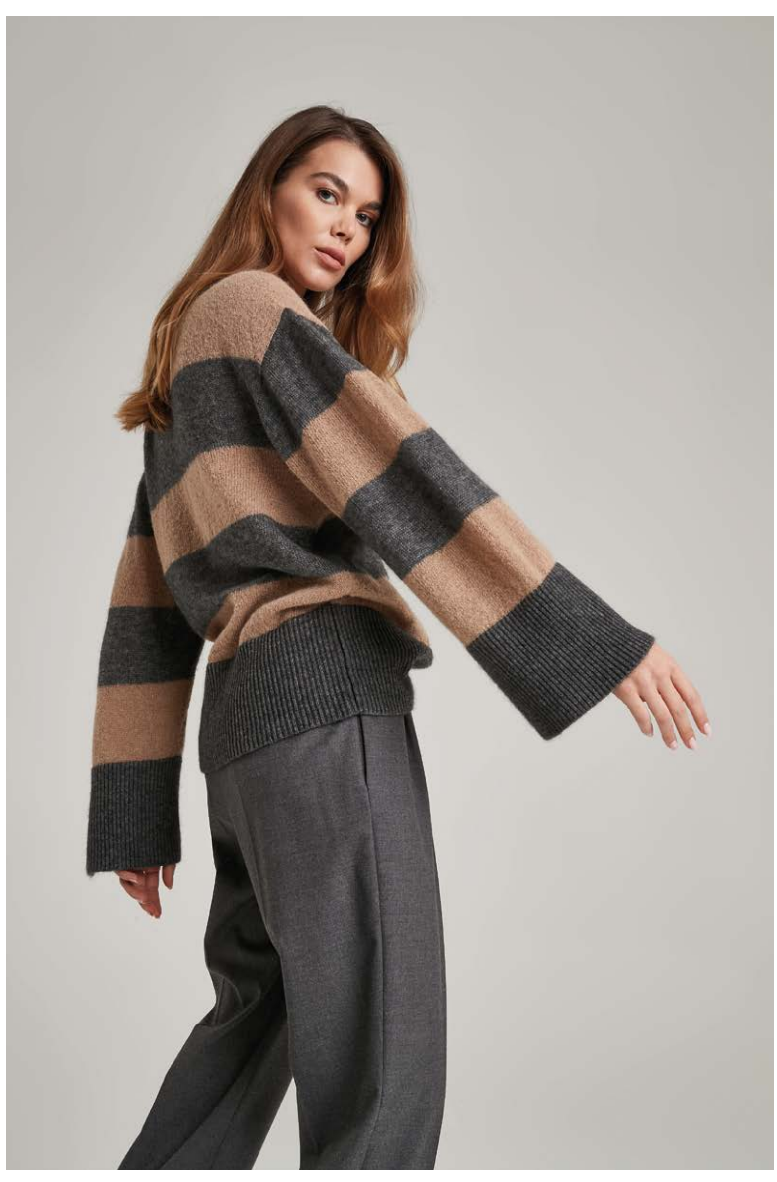
Turtle-neck sweater in super kid mohair and silk, art. 2624 Trousers in viscose, art. 3022