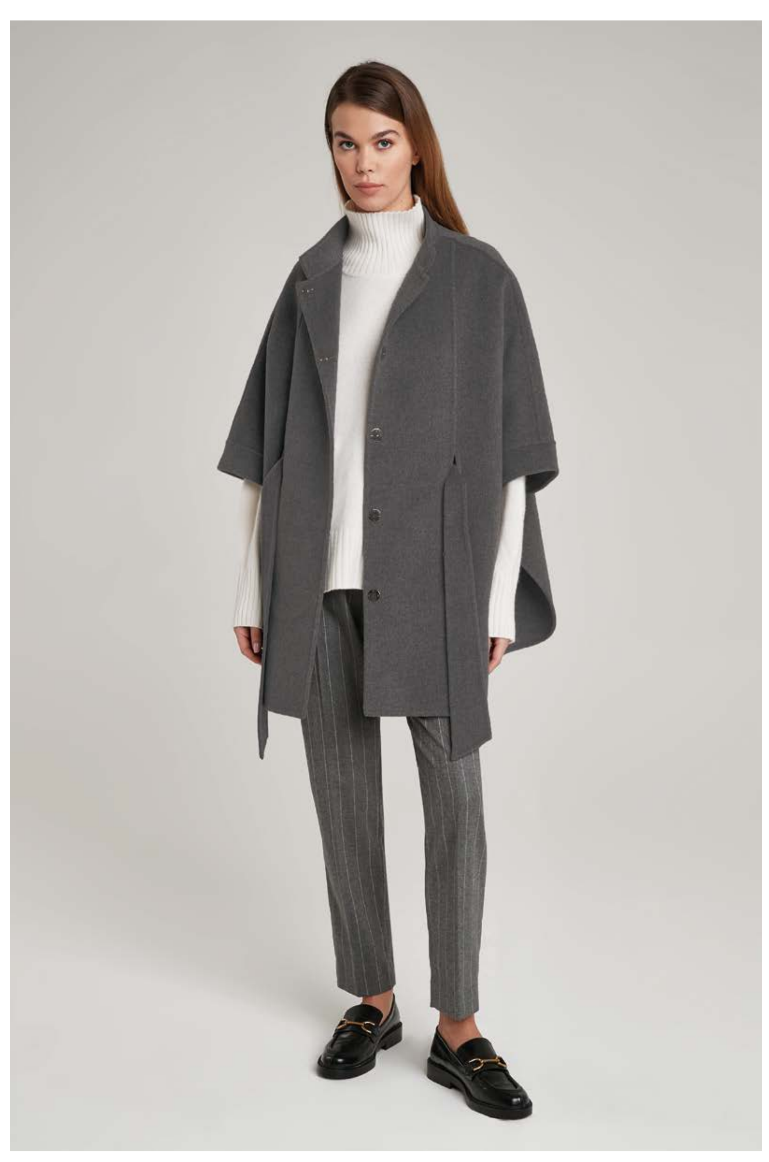
Turtle-neck sweater in cashmere, art. 2129 Cape in double fabric wool and cashmere, art. 8113 Pinstripe trousers in viscose, art. 3026