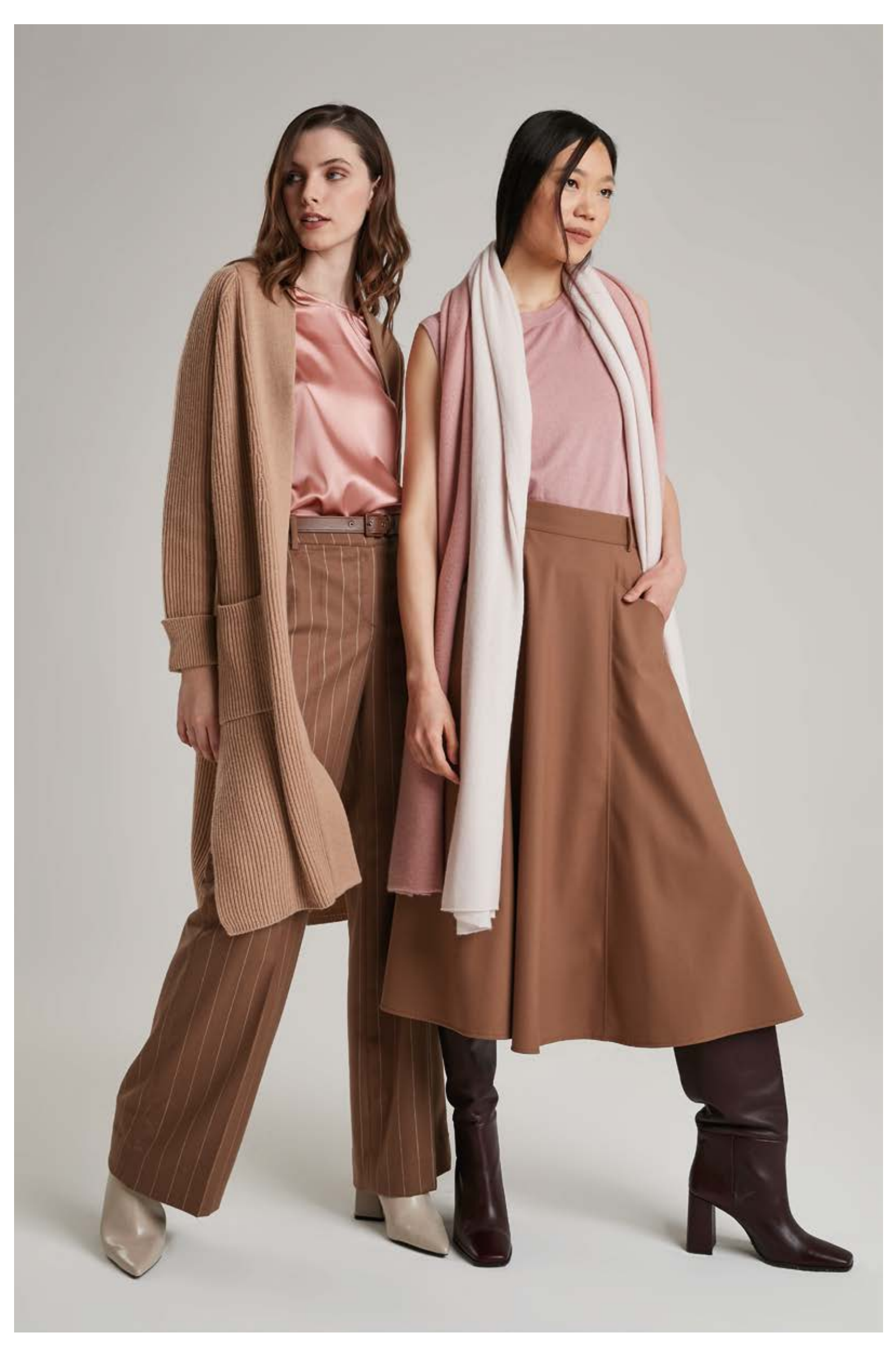
LEFT: T-shirt in satin silk stretch, art. 1909 - Cardigan in wool and cashmere, art. 2217 Pinstripe trousers in viscose, art. 3028 - Belt in faux leather, art. 6050 RIGHT: Top in silk and cashmere, art. 2012 - Skirt in viscose, art. 3024 - Scarf in cashmere, art. 6014