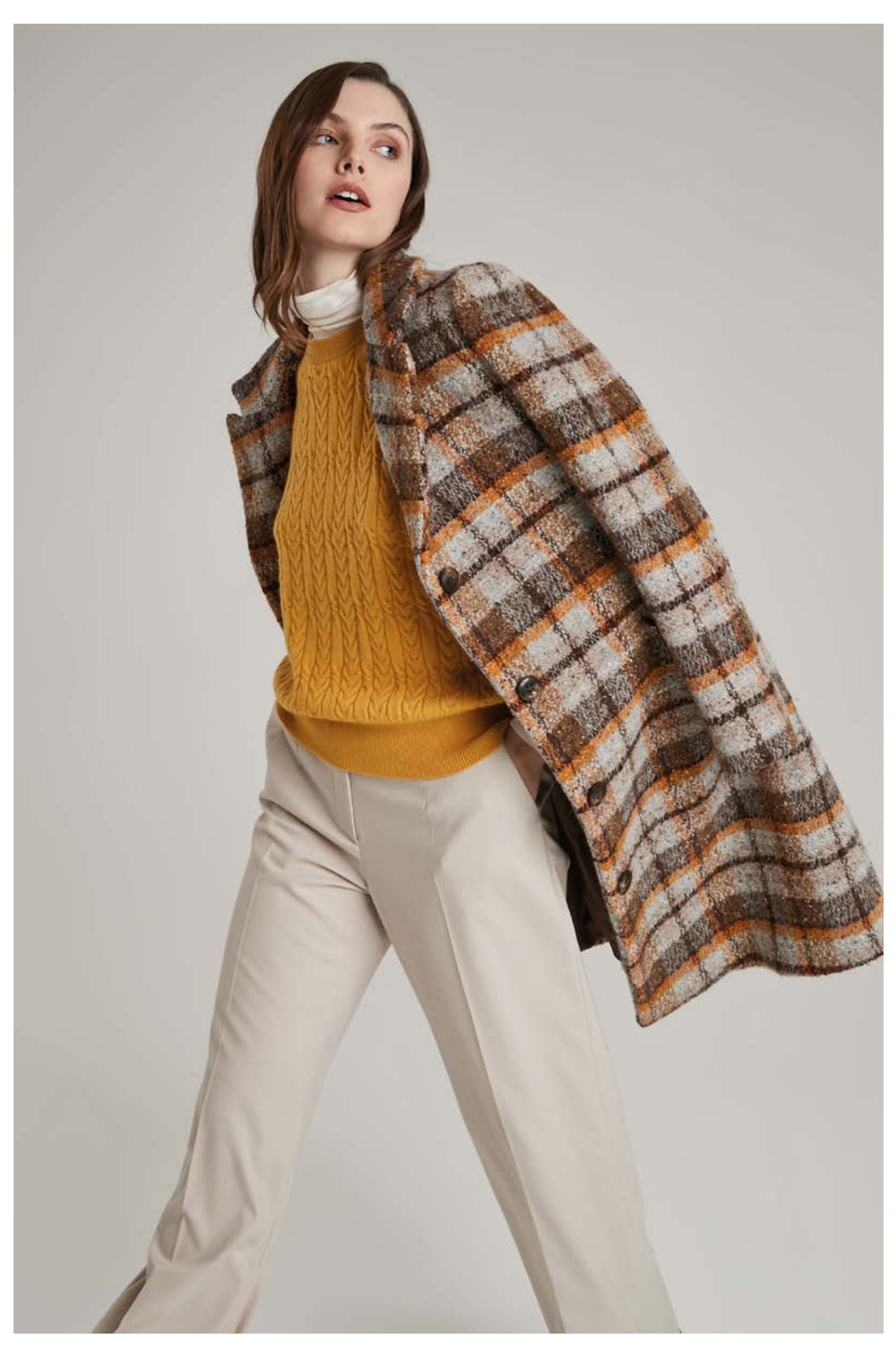
Turtle-neck t-shirt in modal cashmere, art. 1502 Gilet in cashmere with cables, art. 2162 Coat in wool, art. 8143 - Trousers in viscose, art. 3023