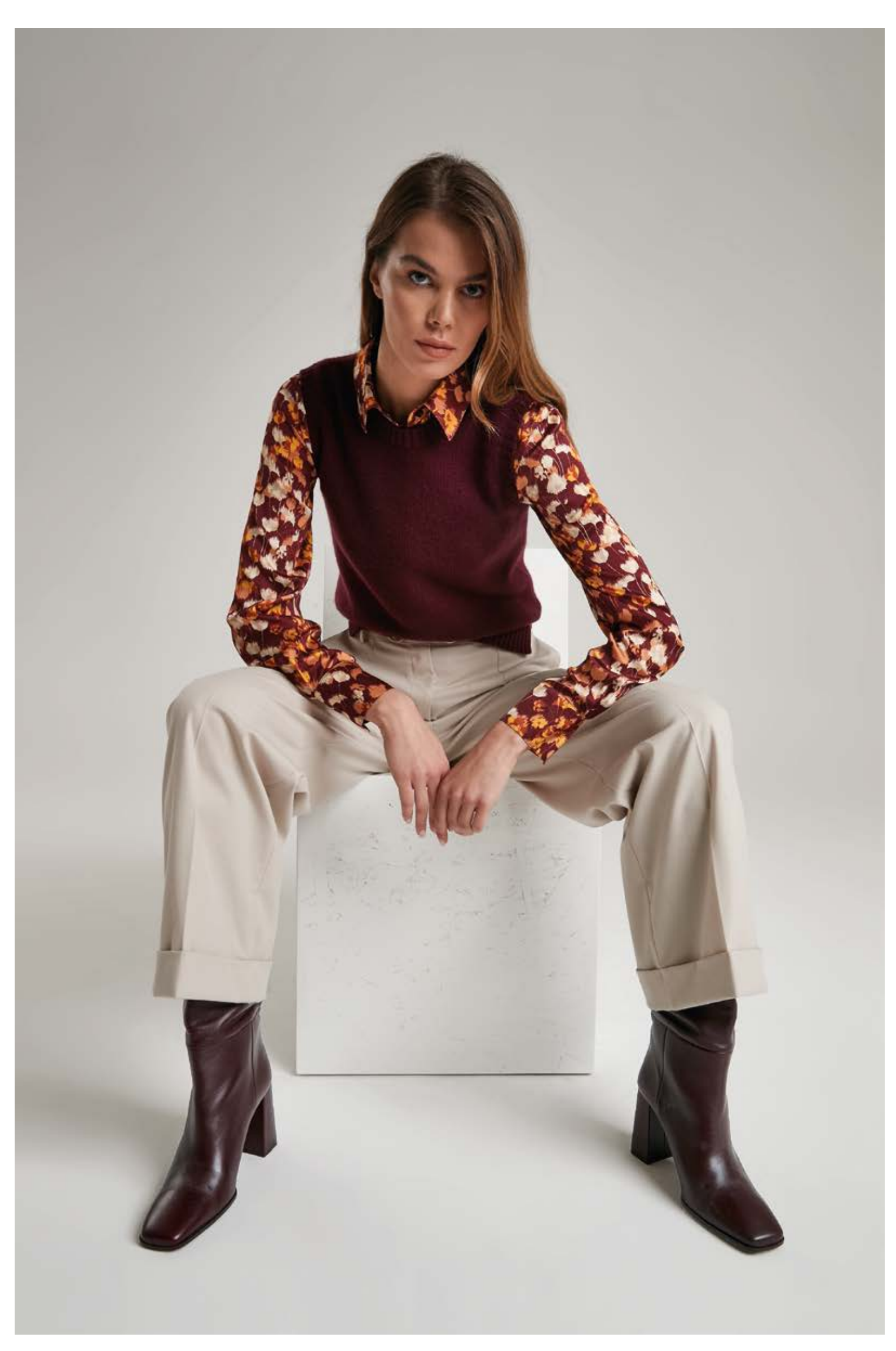
Shirt in stretch viscose, art. 5022 Gilet in cashmere, art. 2144 Trousers in viscose, art. 3023