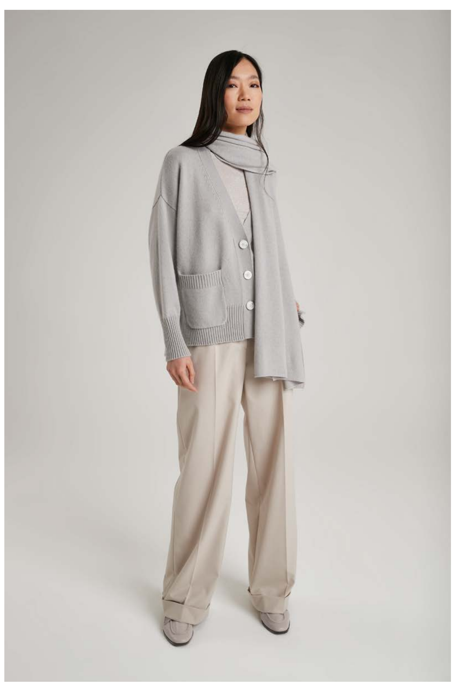
T-shirt in jersey lurex, art. 1332 Cardigan in cashmere, art. 2121 Trousers in viscose, art. 3023 - Scarf in cashmere, art. 6014