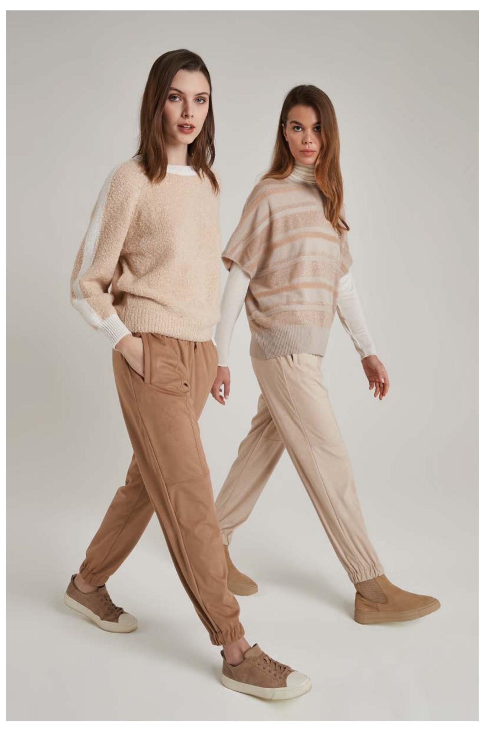
LEFT: Sweater in alpaca and wool boulclé, art. 2550 - Trousers in faux suede, art. 3017 RIGHT: Turtle-neck t-shirt in modal cashmere, art. 1502 - Poncho in cashmere with lurex, art. 2106 Trousers in faux suede, art. 3017