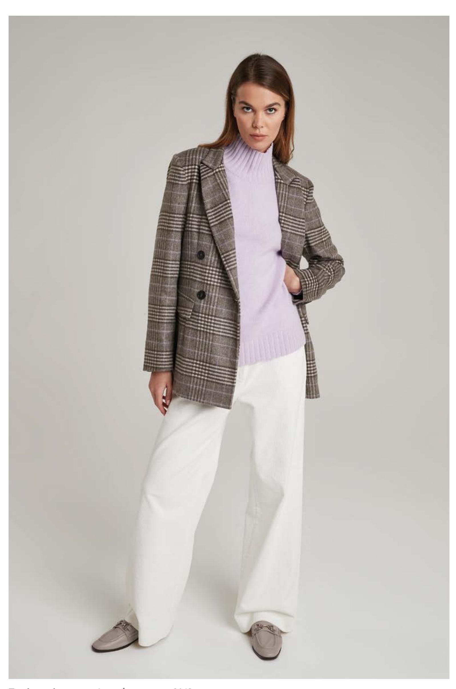
Turtle-neck sweater in cashmere, art. 2142 Jacket in fine wool, art. 8092 Corduroy trousers in cotton, art. 3043