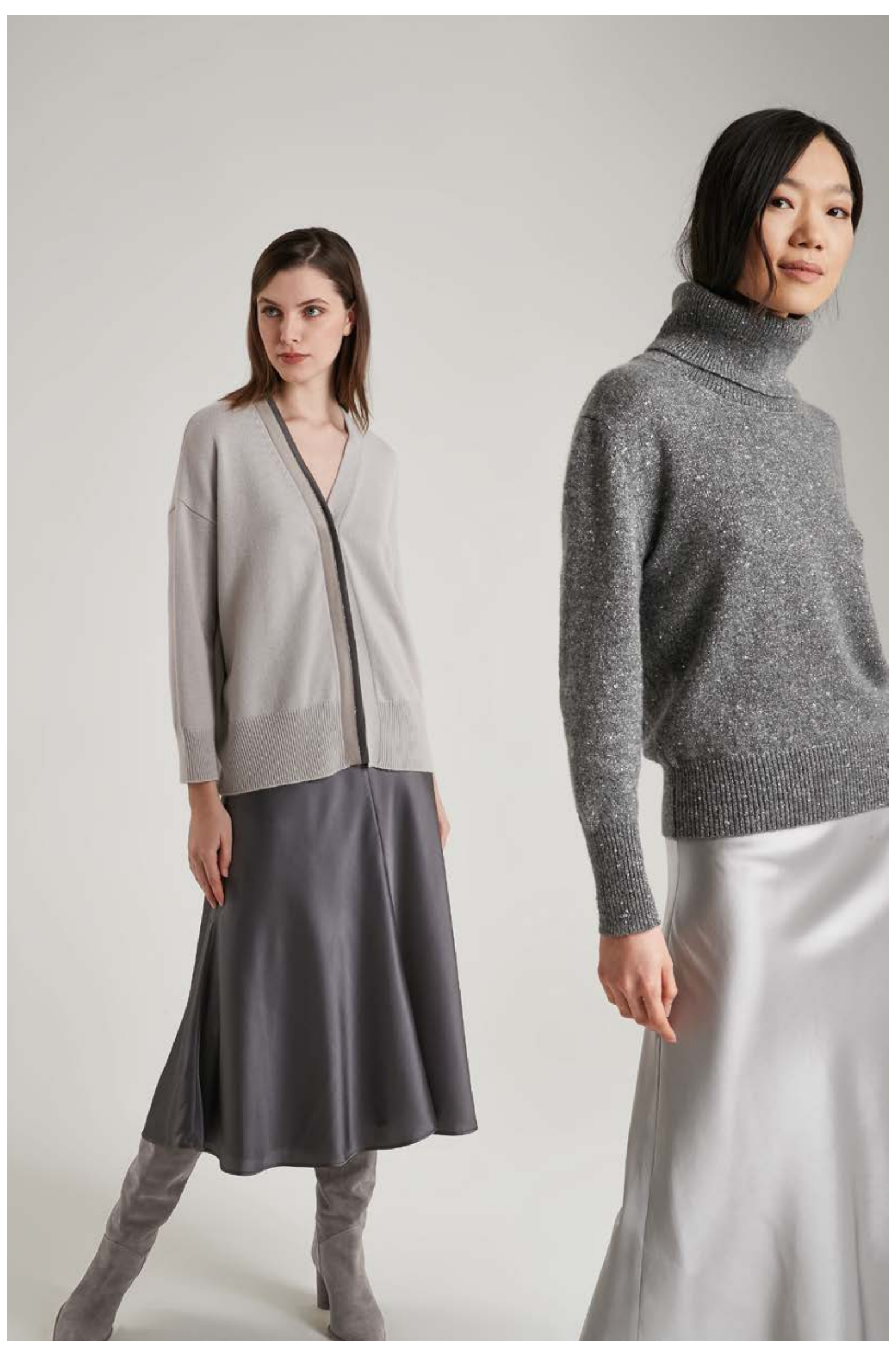
LEFT: Cardigan in wool and cashmere, art. 2218 - Skirt in satin silk stretch, art. 3050 RIGHT: Turtle-neck sweater in cashmere and wool with lurex, art. 2601 Dress in satin silk stretch, art. 4001