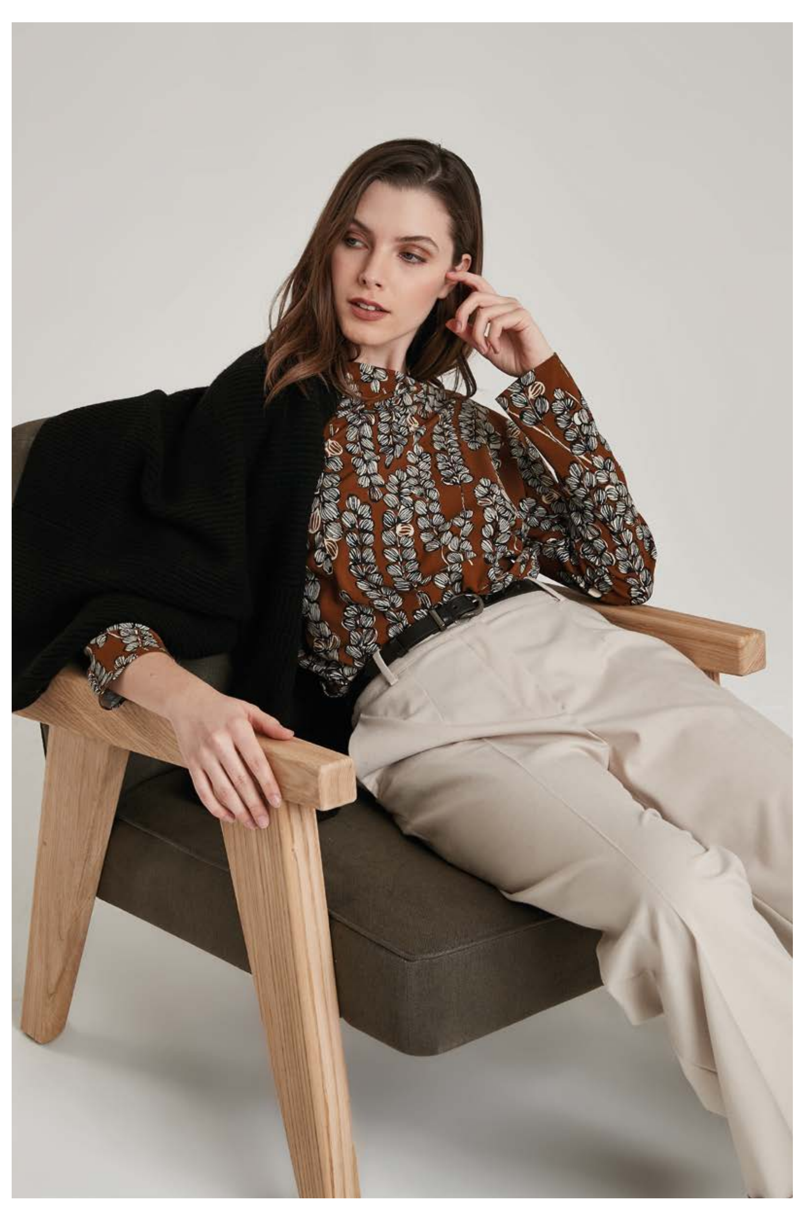
Blouse in stretch viscose, art. 1940 Trousers in viscose, art. 3023 - Leather belt, art. 6038 On shoulder: Cardigan in wool and cashmere, art. 2219