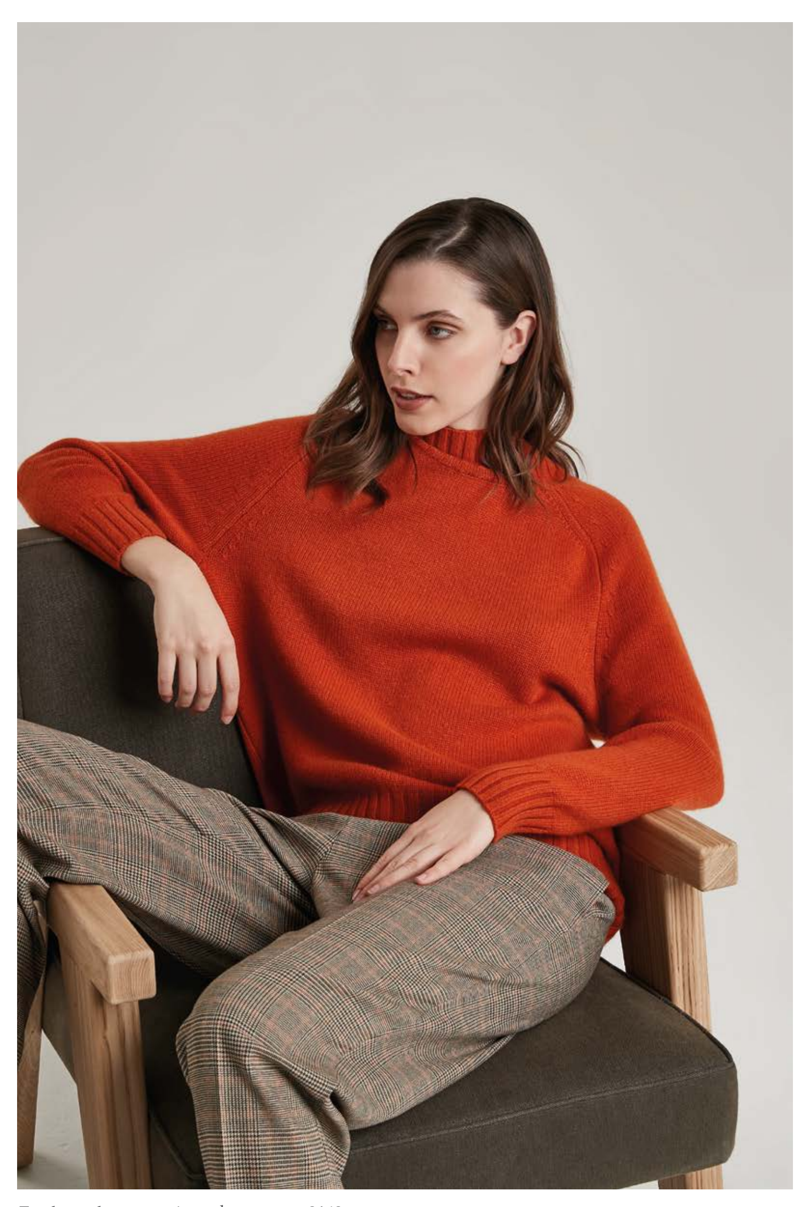
Turtle-neck sweater in cashmere, art. 2142 Trousers in viscose, art. 3036