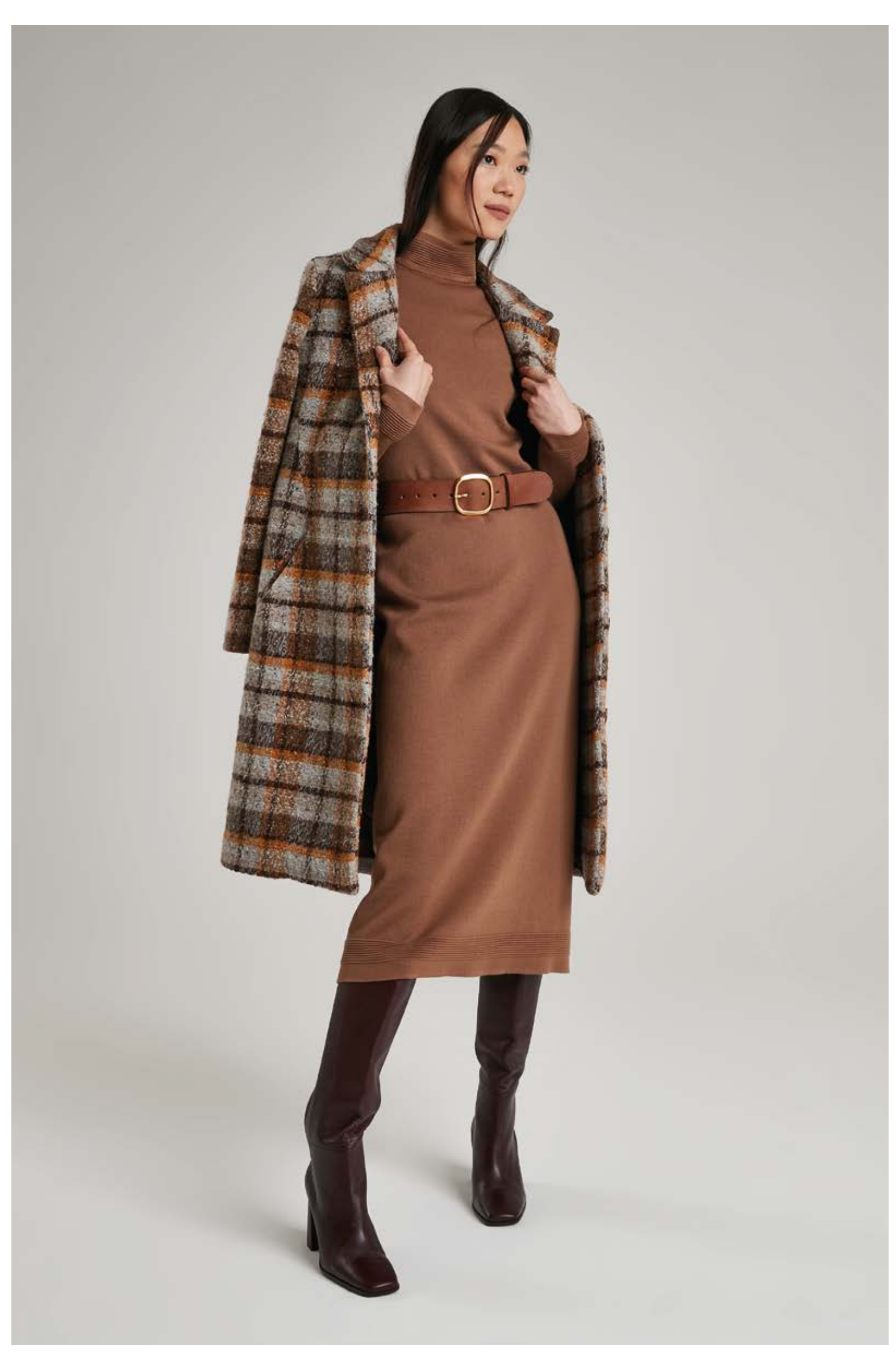
Turtle-neck dress in merino wool, art. 2511 Coat in wool, art. 8143 Leather belt, art. 6033