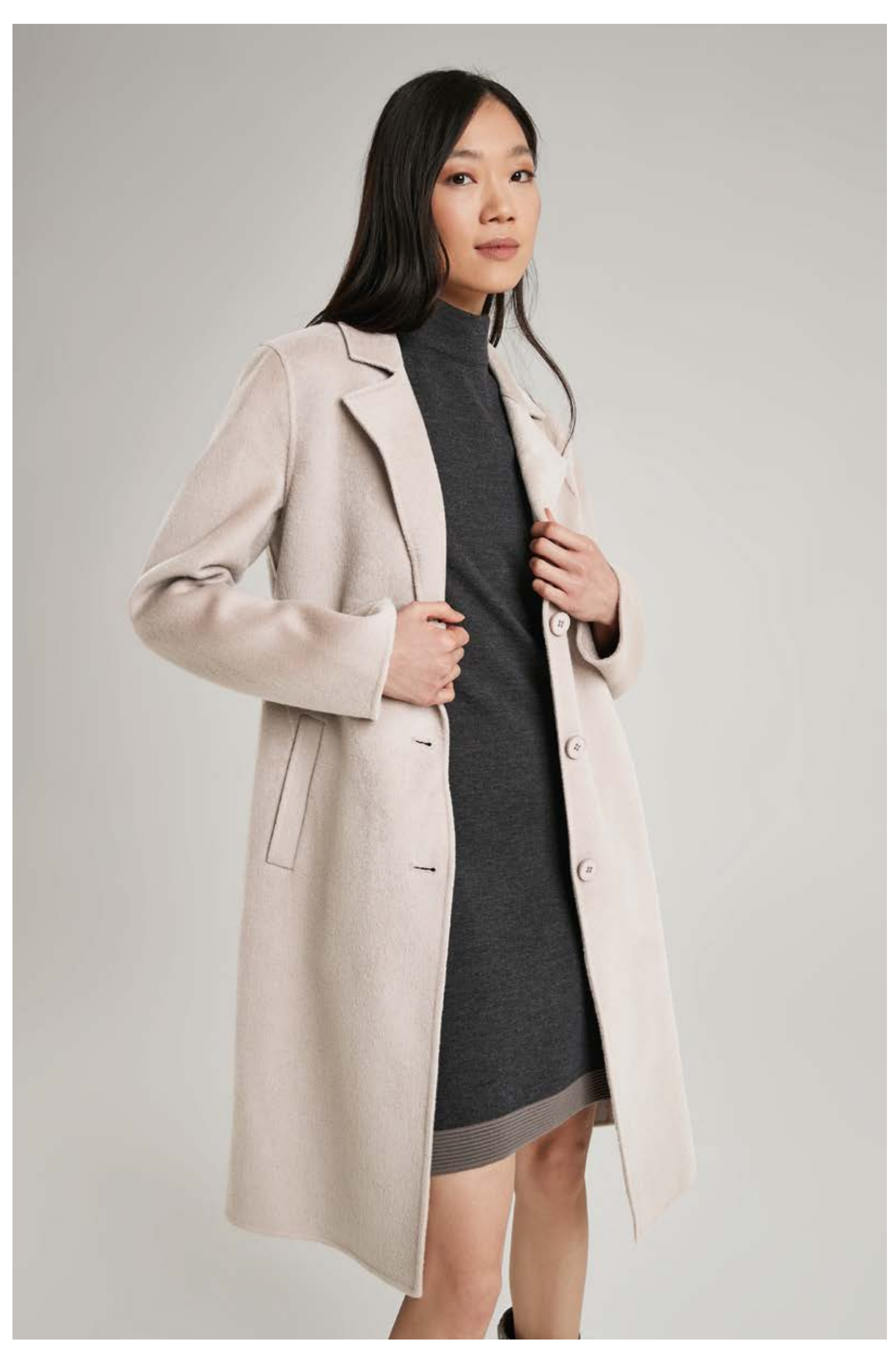
High-neck dress in merino wool, art. 2512 Coat in double fabric wool and cashmere, art. 8110