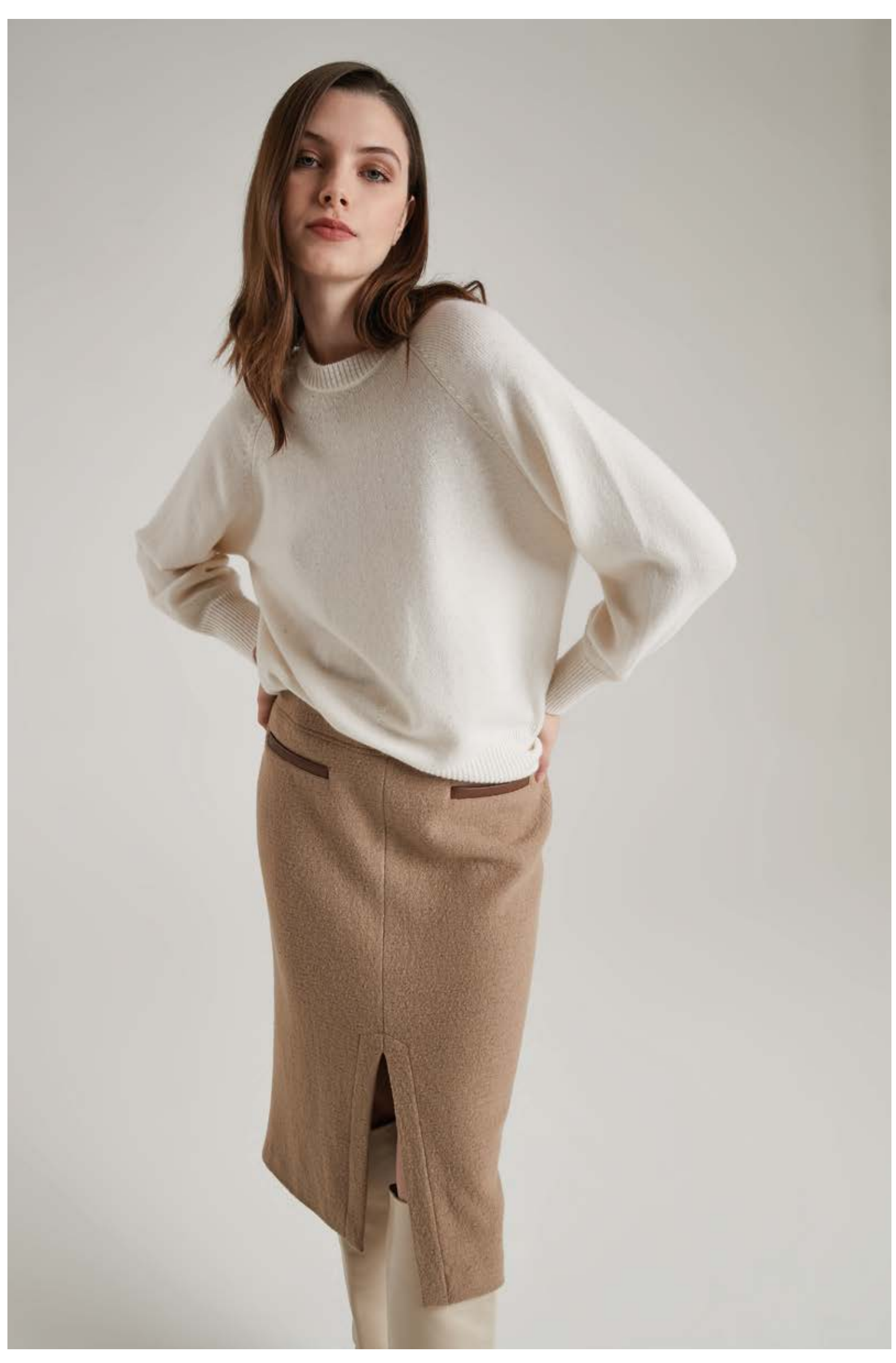
Sweater in cashmere, art. 2122 Skirt in wool and viscose, art. 3047