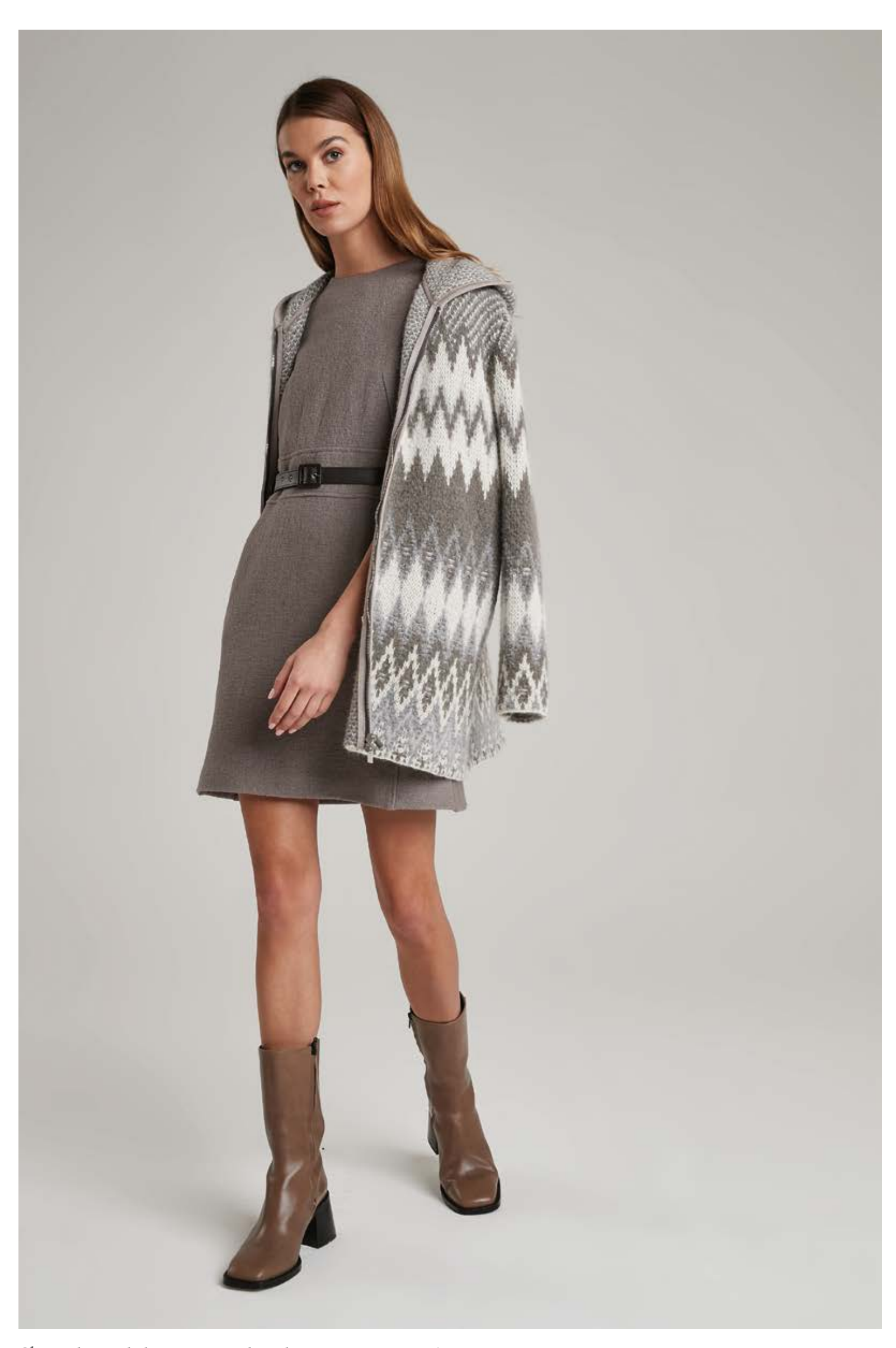
Shirt-sleeved dress in wool and viscose, art. 4046 Belt in faux leather, art. 6050 Jacquard hooded sweater in wool and alpaca, art. 2712