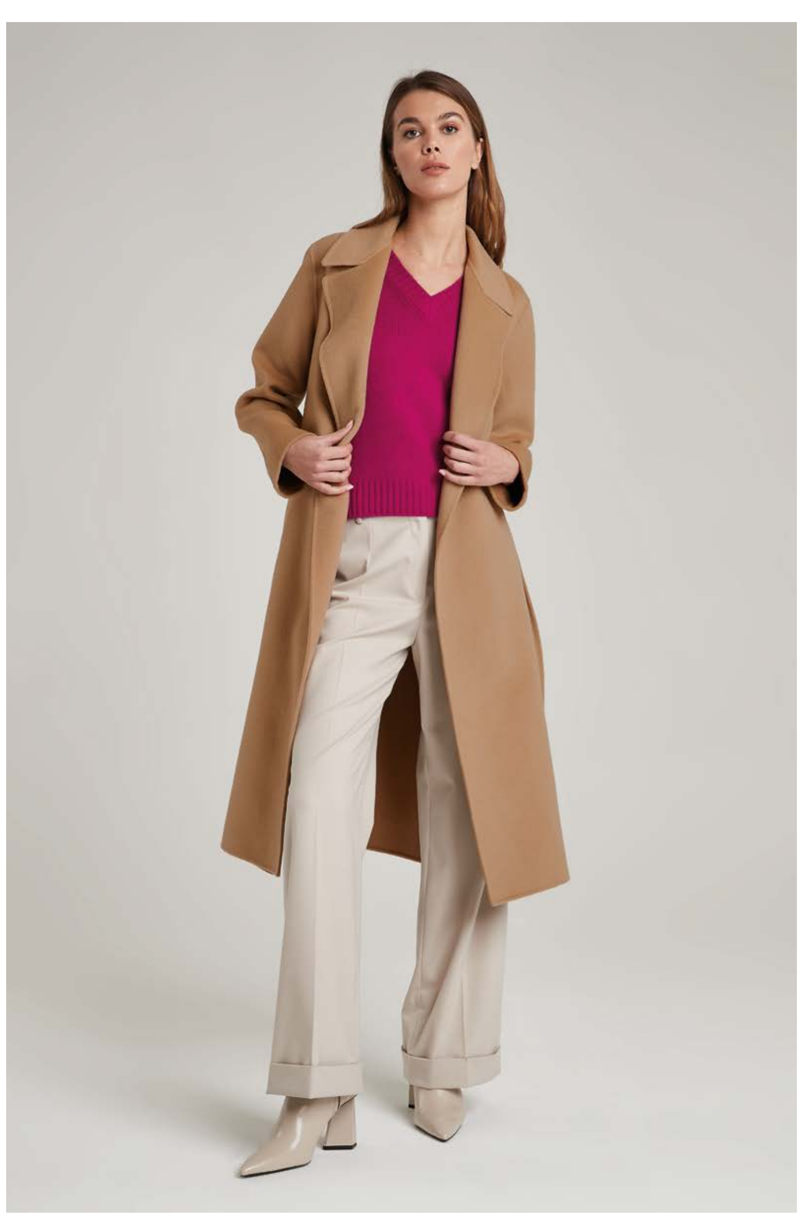
V-neck gilet in cashmere, art. 2145 Coat in double fabric wool and cashmere, art. 8112 Trousers in viscose, art. 3023