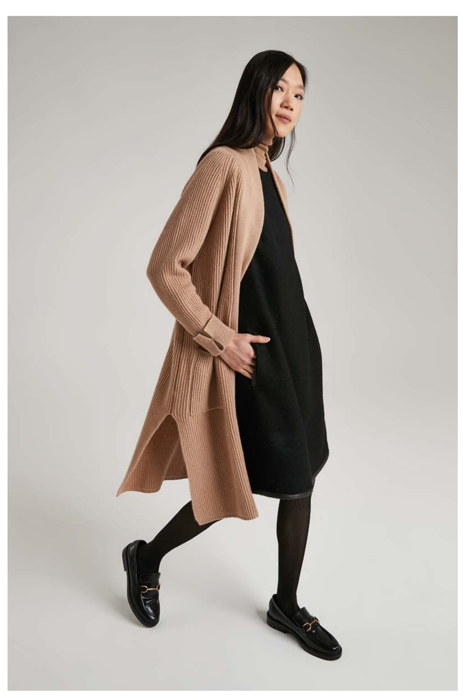
Turtle-neck top in silk and cashmere, art. 2011 Dress in wool and viscose, art. 4045 Cardigan in wool and cashmere, art. 2217