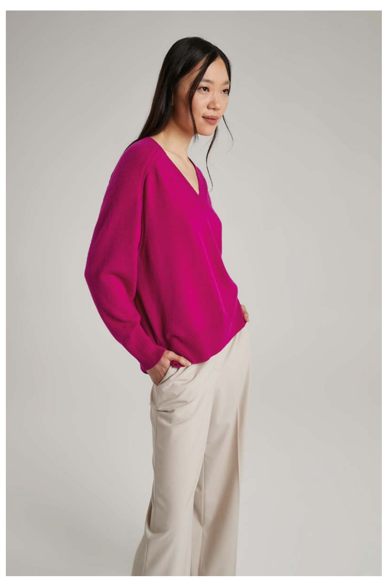
Sweater in cashmere, art. 2103 Trousers in viscose, art. 3023