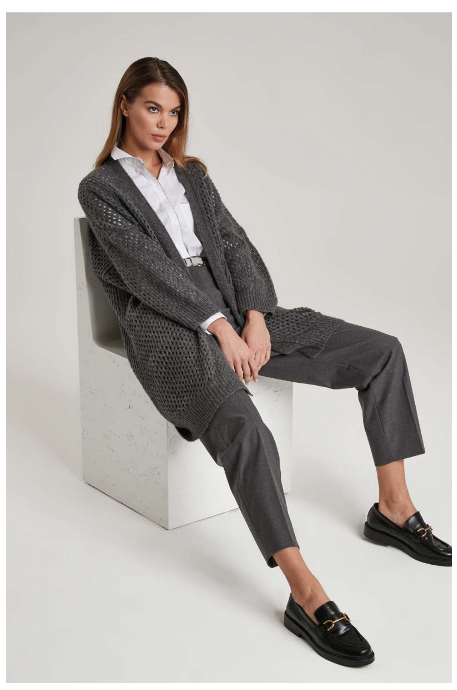
Shirt in stretch popeline, art. 5041 Cardigan in cashmere and silk, art. 2663 Trousers in viscose, art. 3022 - Leather belt, art. 6036