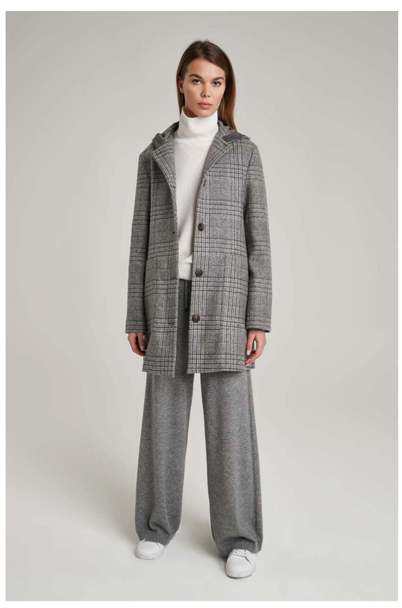
Turtle-neck sweater in cashmere moss stitch, art. 2137 Hooded coat in wool and nylon, art. 8121 Pants in wool and cashmere, art. 2231