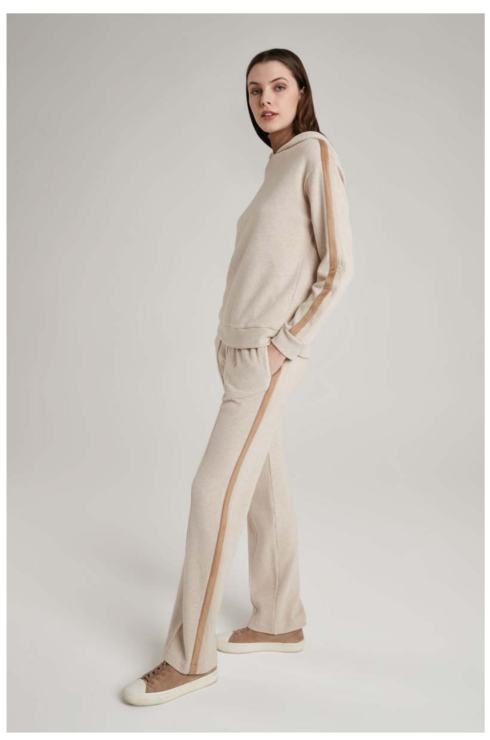
Turtle-neck top in silk and cashmere, art. 2011 Hooded sweater in organic cotton, art. 1813 Pants in organic cotton, art. 3013