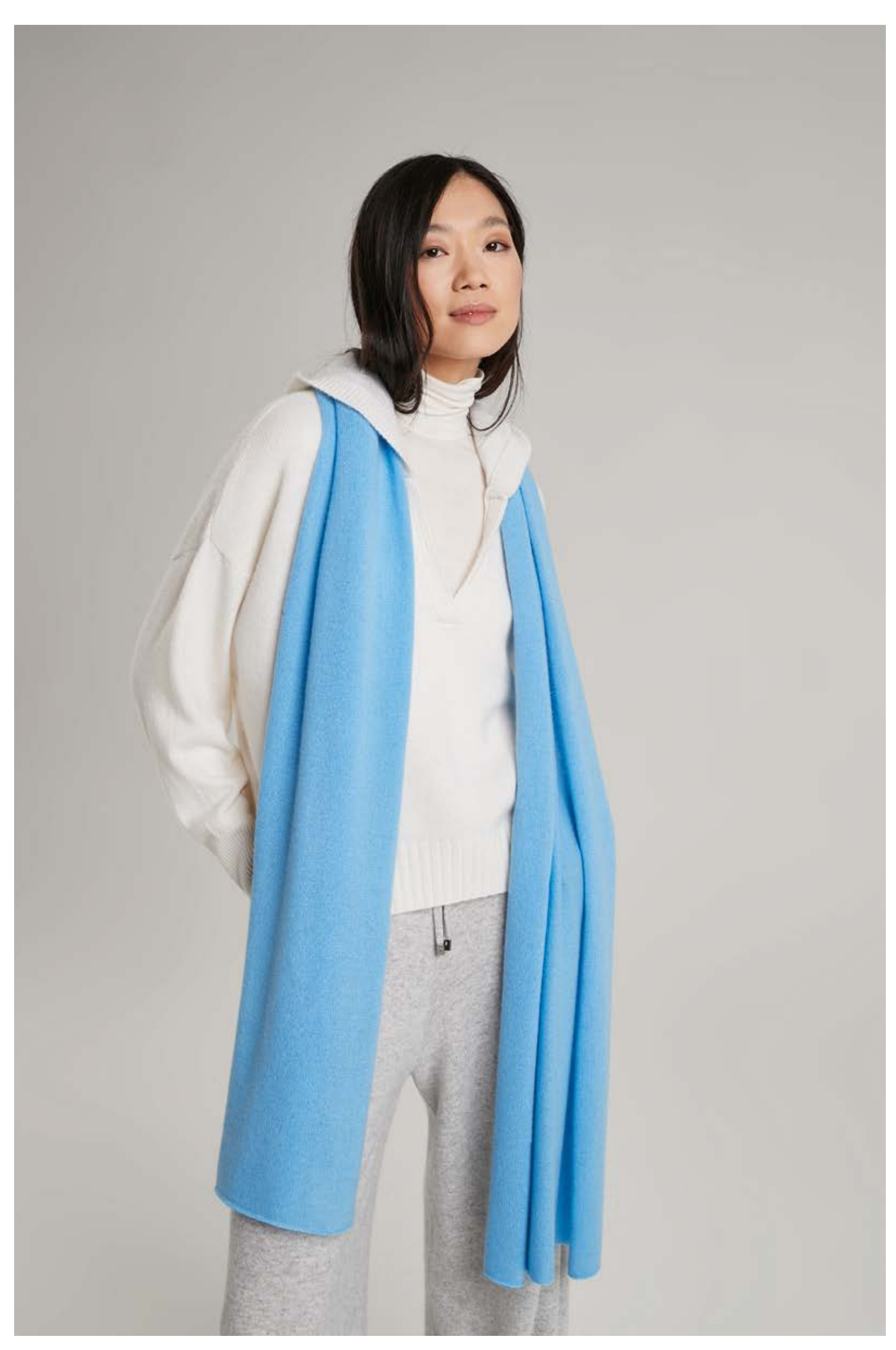
Turtle-neck t-shirt in modal cashmere, art. 1502 Sweater in cashmere, art. 2110 Pants in cashmere, art. 2159 - Scarf in cashmere, art. 6014