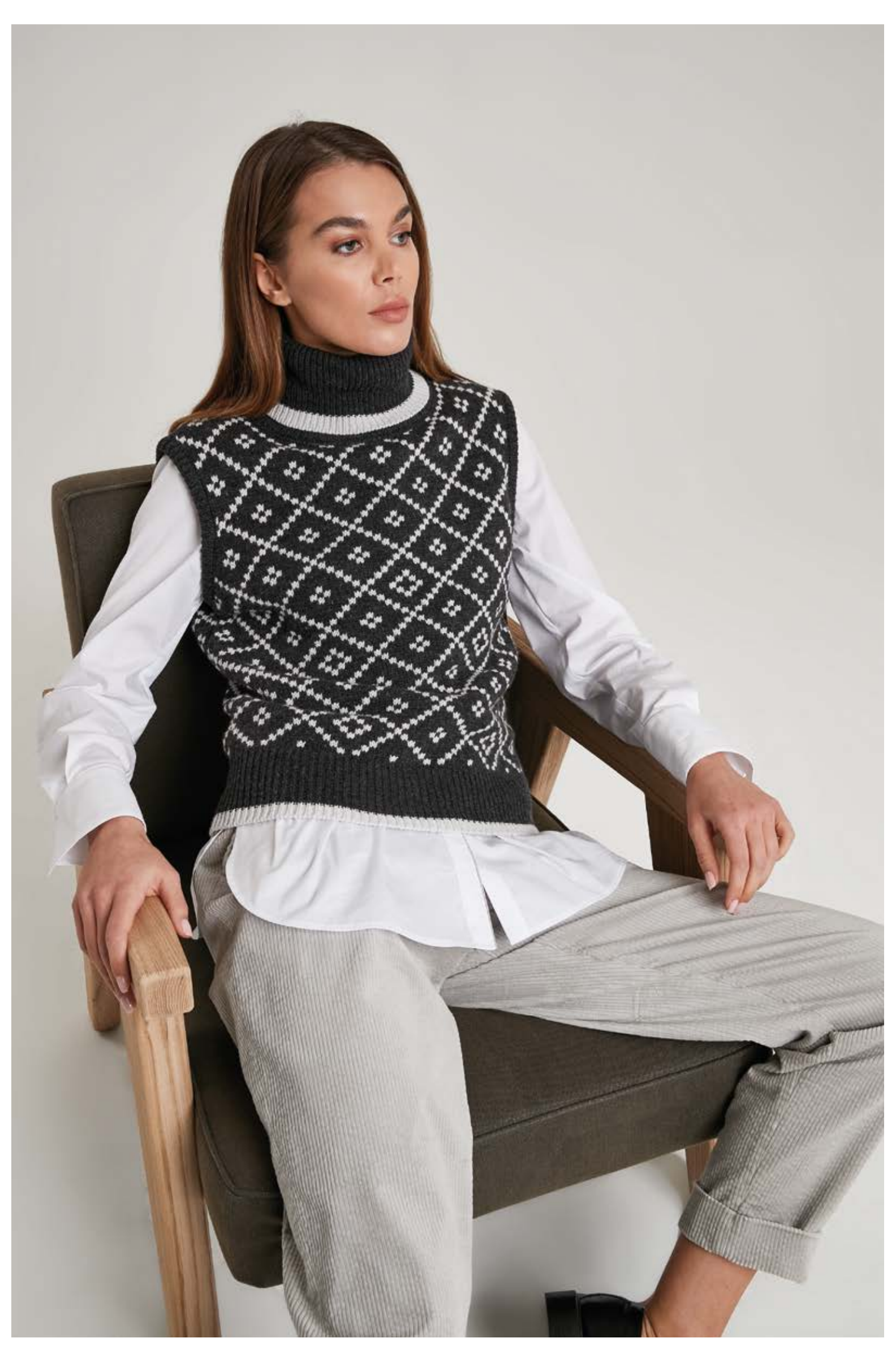
Shirt in stretch popeline, art. 5041 Jacquard gilet in wool, viscose and cashmere, art. 2734 Corduroy trousers in cotton, art. 3041