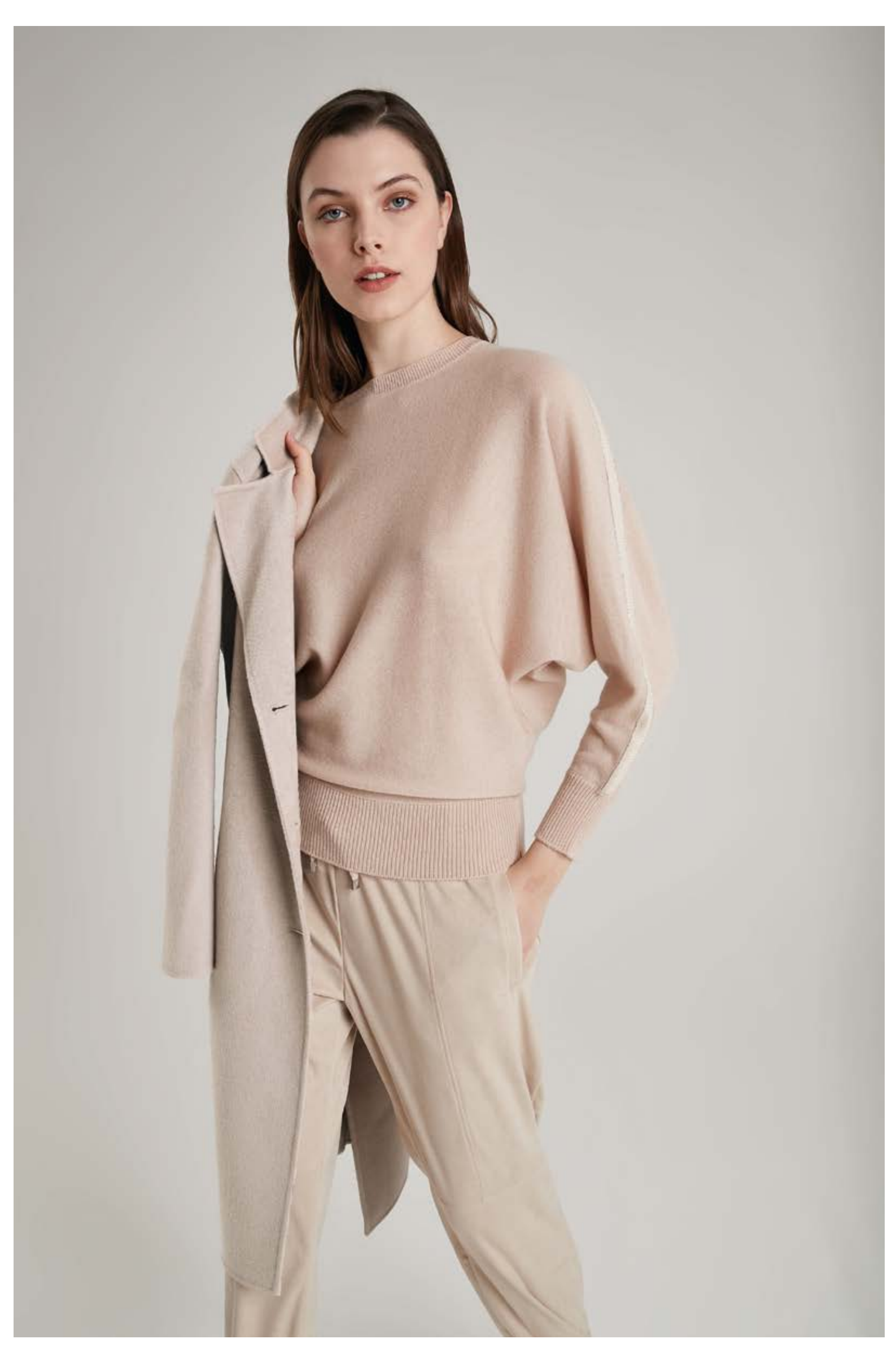
Sweater in wool and cashmere, art. 2207 Trousers in faux suede, art. 3017 Coat in double fabric wool and cashmere, art. 8110