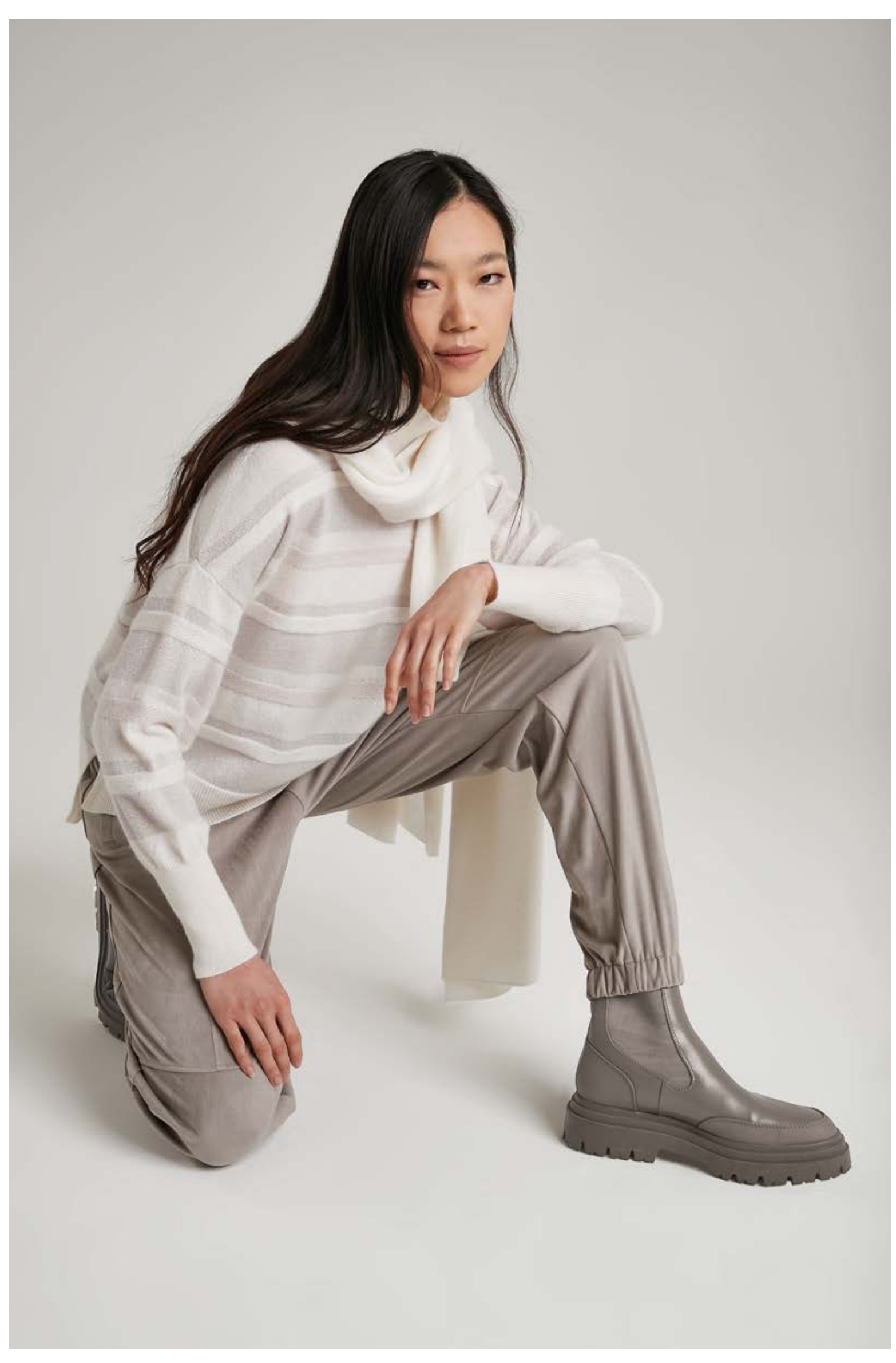
Turtle-neck sweater in cashmere with lurex, art. 2104 Trousers in faux suede, art. 3017 Scarf in cashmere, art. 6014