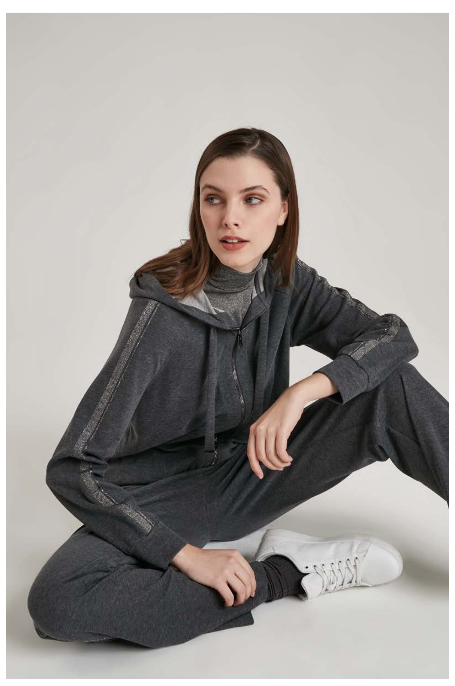
Turtle-neck top in jersey lurex, art. 1331 Cotton sweater in cotton, art. 1801 Pants in cotton, art. 3002