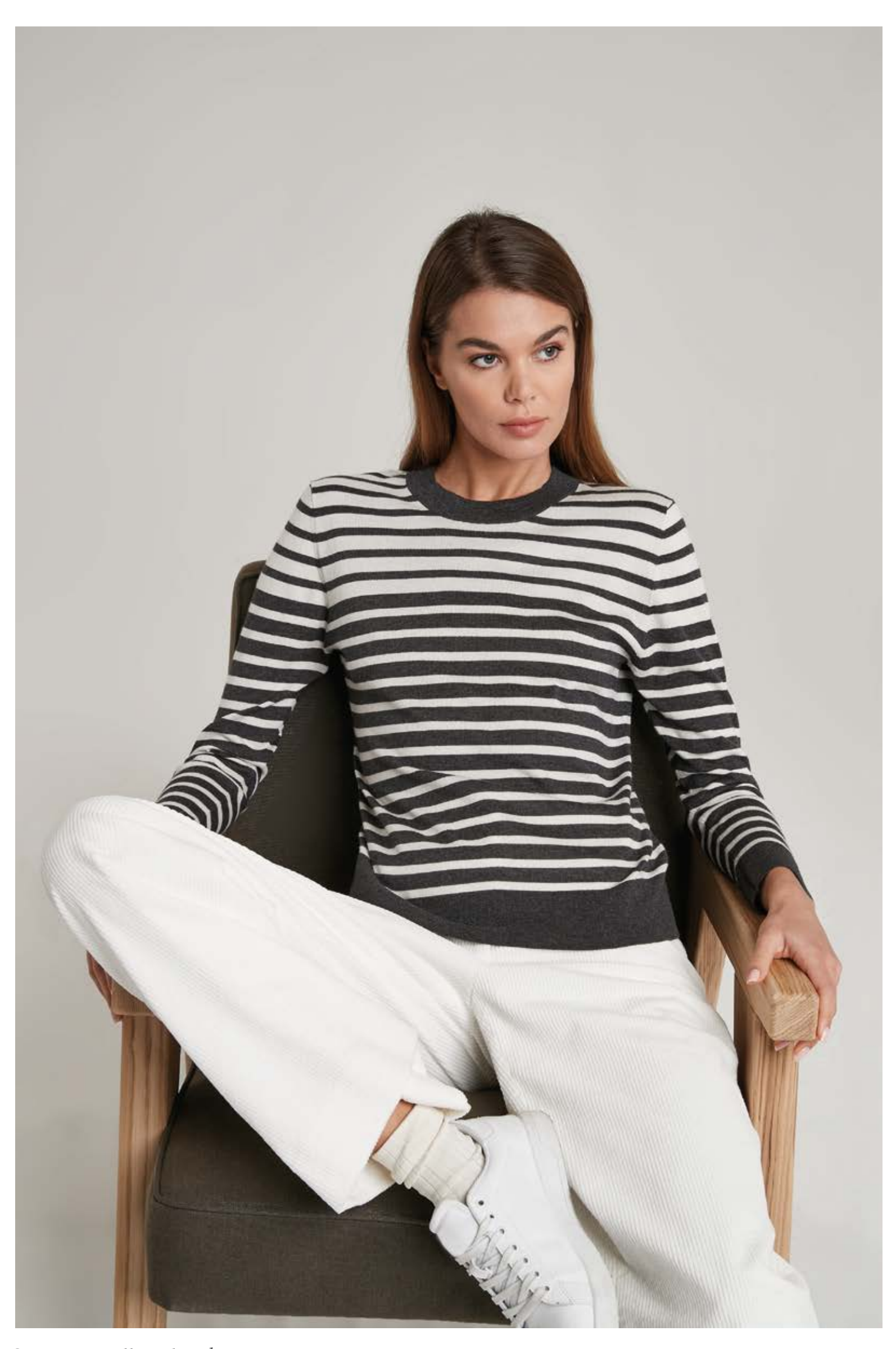
Sweater in silk and cashmere, art. 2024 Corduroy trousers in cotton, art. 3043