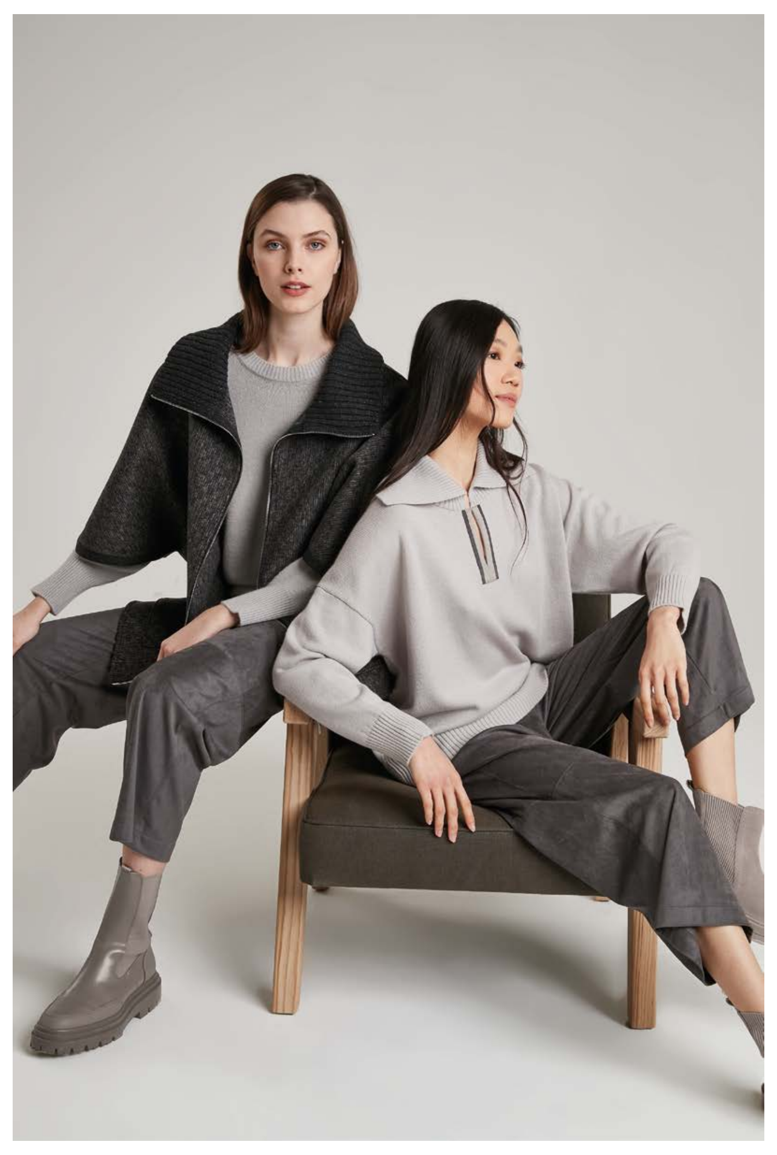
LEFT: Sweater in cashmere, art. 2122 - Coat in wool and alpaca, art. 8132 Trousers in faux suede, art. 3018 RIGHT: Sweater in wool and cashmere, art. 2223 - Trousers in faux suede, art. 3018