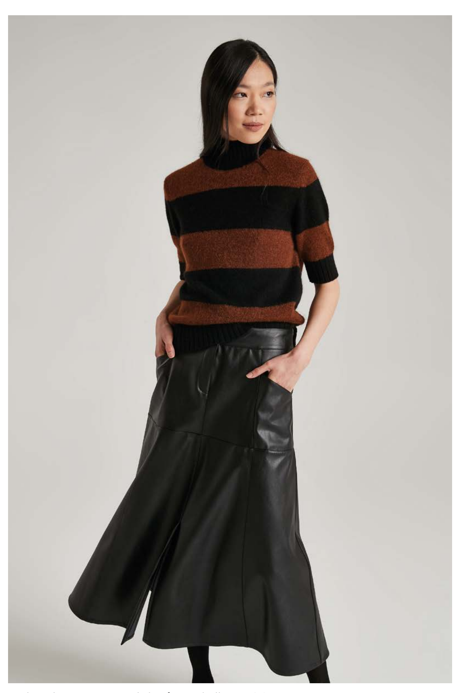
Turtle-neck sweater in super kid mohair and silk, art. 2621 Skirt in faux leather, art. 3064