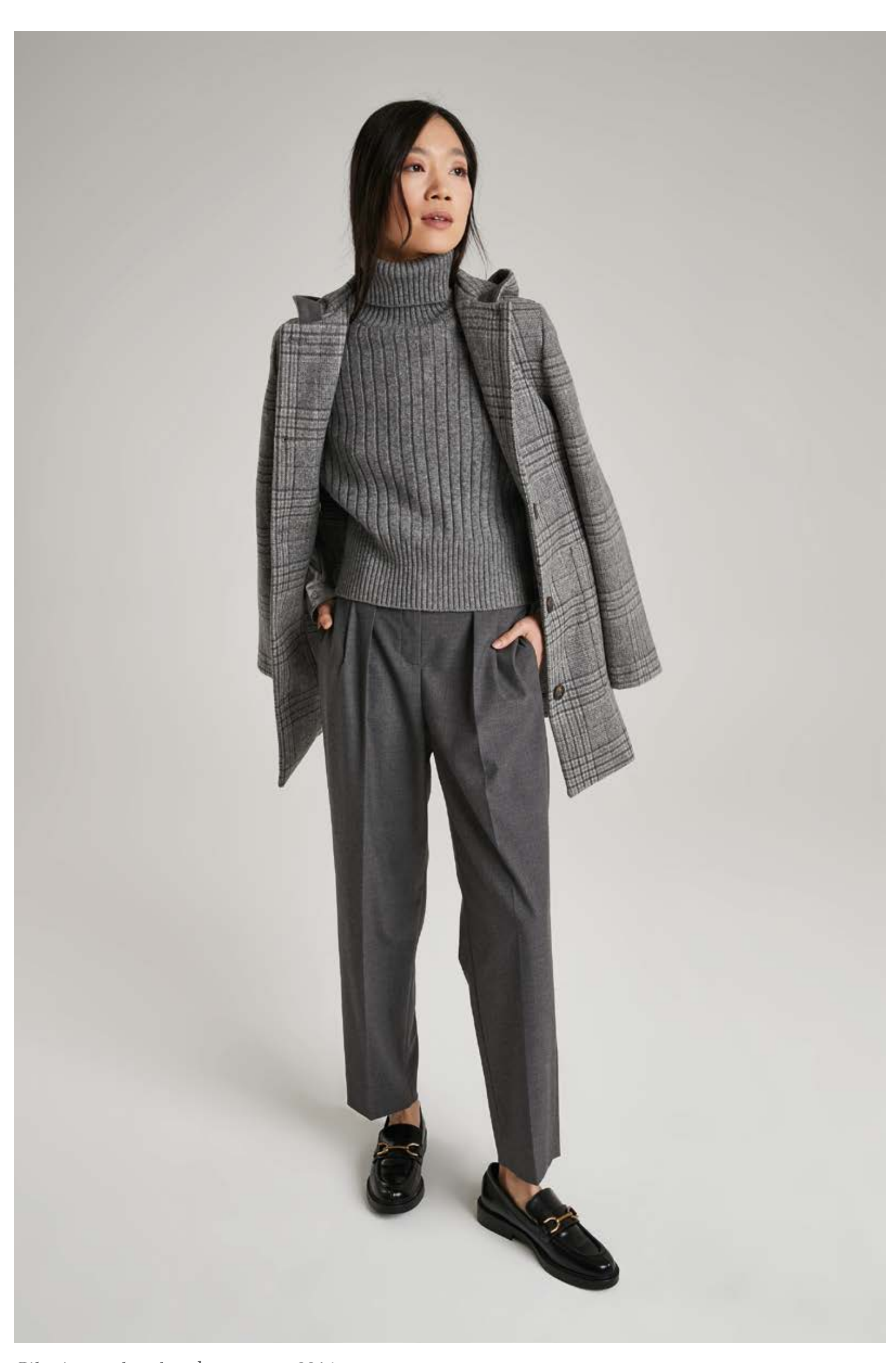
Gilet in wool and cashmere, art. 2214 Hooded coat in wool and nylon, art. 8121 Trousers in viscose, art. 3022