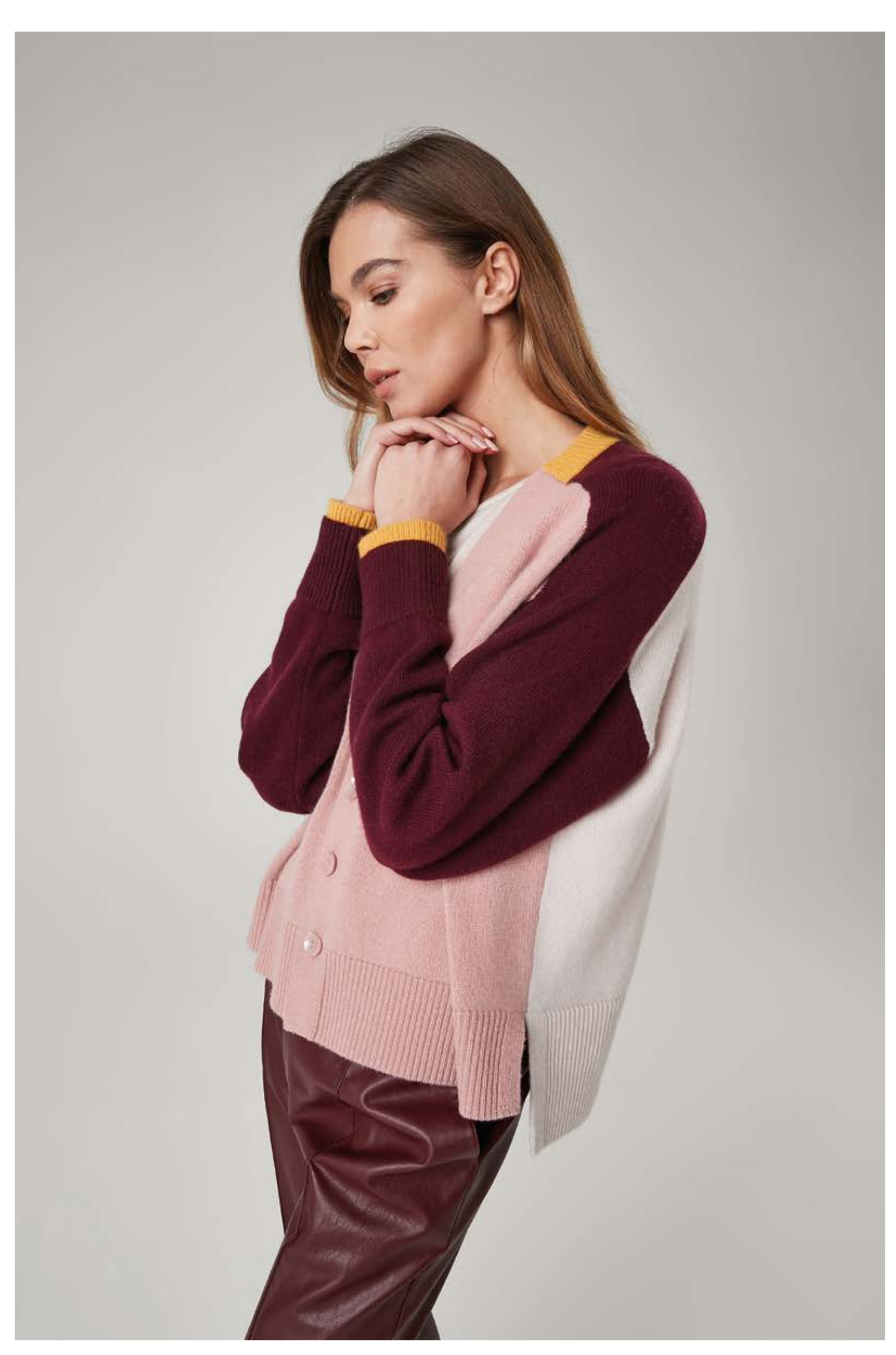
Top in jersey milk fiber, art. 1161 Cardigan in cashmere, art. 2138 Trousers in faux leather, art. 3060