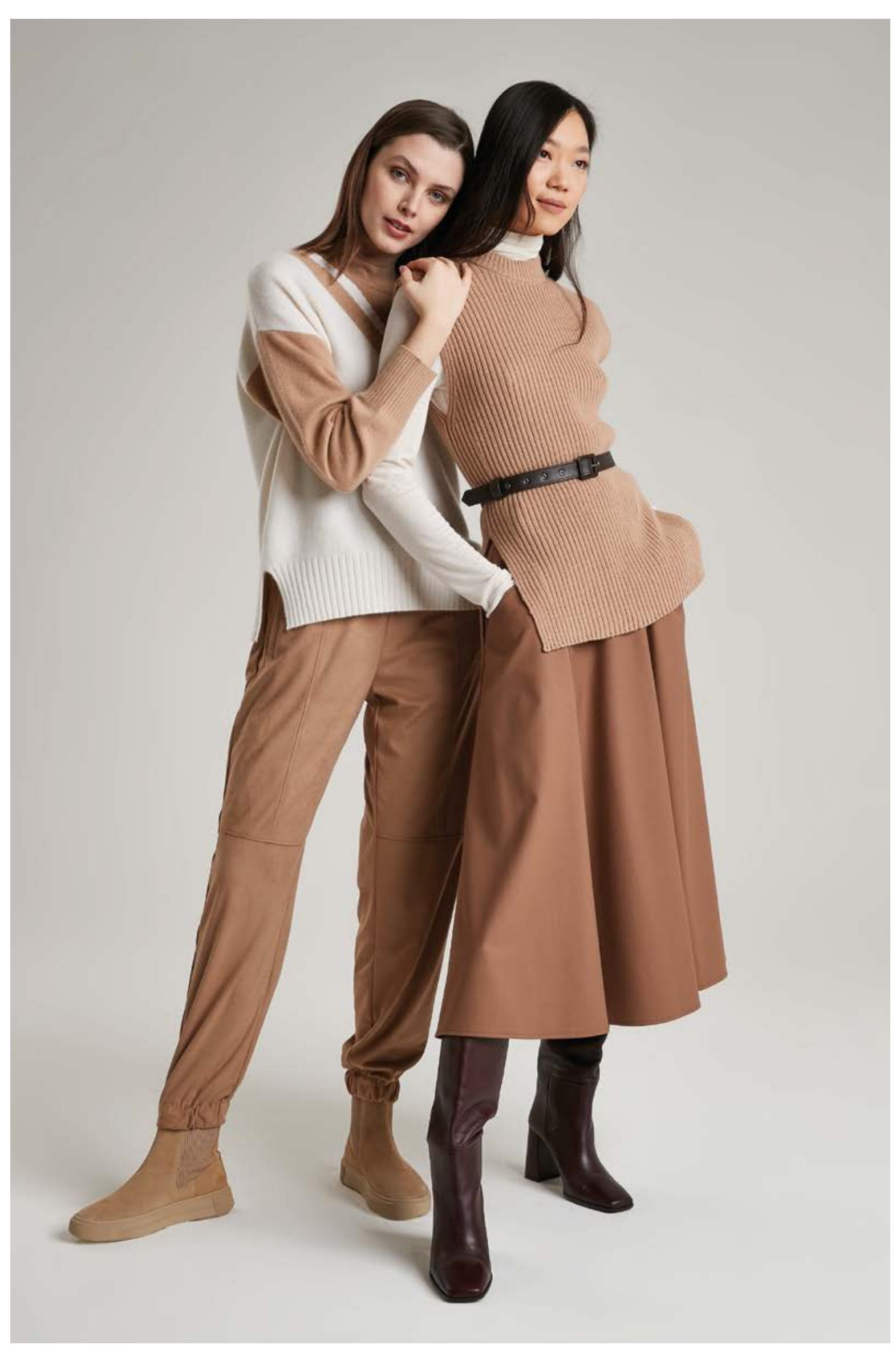
LEFT: Top in silk and cashmere, art. 2011 - Sweater in cashmere, art. 2131 -Trousers, art. 3017 RIGHT: Turtle-neck t-shirt art. 1502 - High-neck top in wool and cashmere, art. 2215 Skirt in viscose, art. 3024 - Belt in faux leather, art. 6050