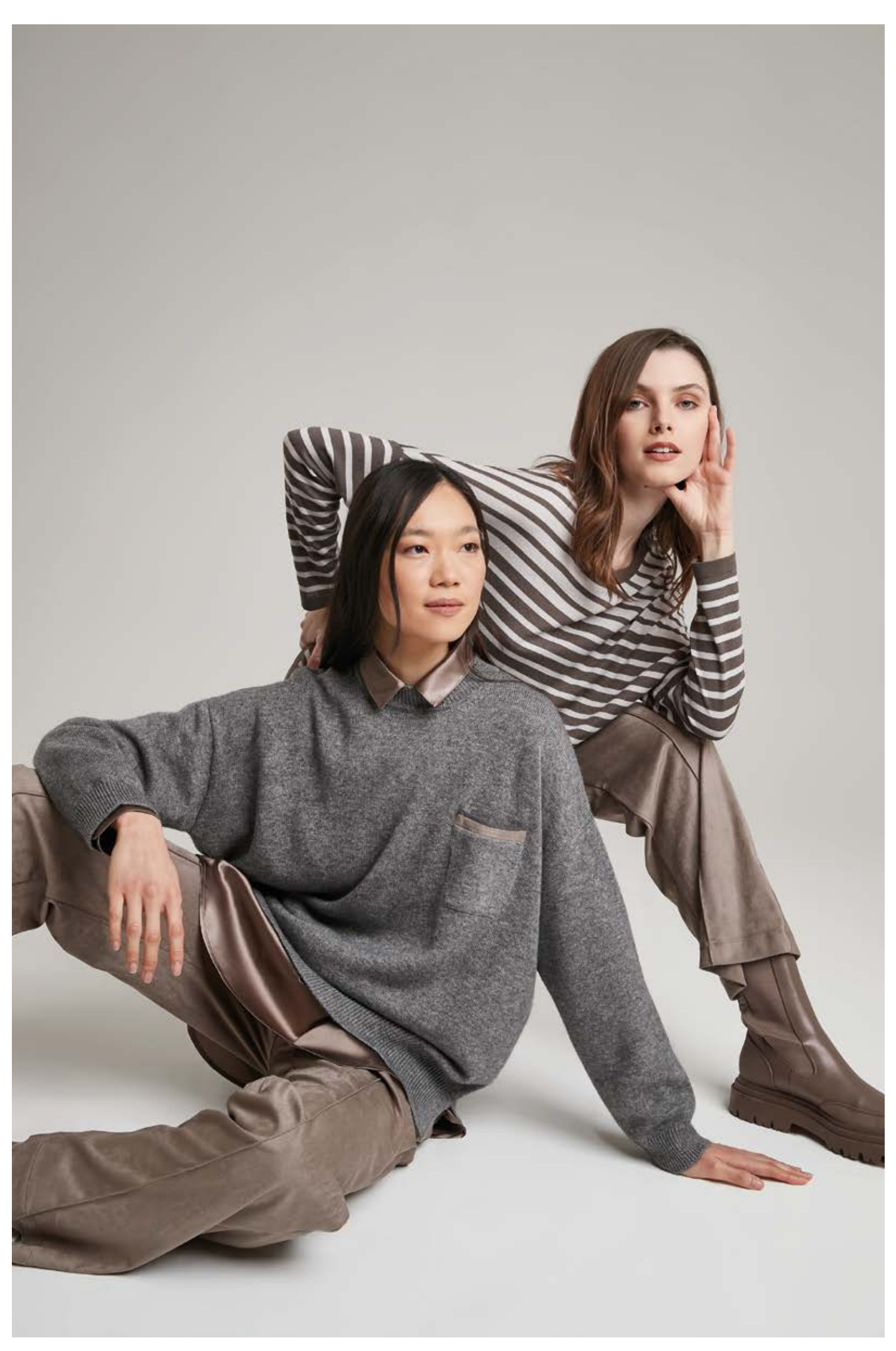
LEFT: Shirt in satin silk stretch, art. 1913 Sweater in wool and cashmere, art. 2208 - Trousers in faux suede, art. 3016 RIGHT: Sweater in silk and cashmere, art. 2025 - Trousers in faux suede, art. 3016