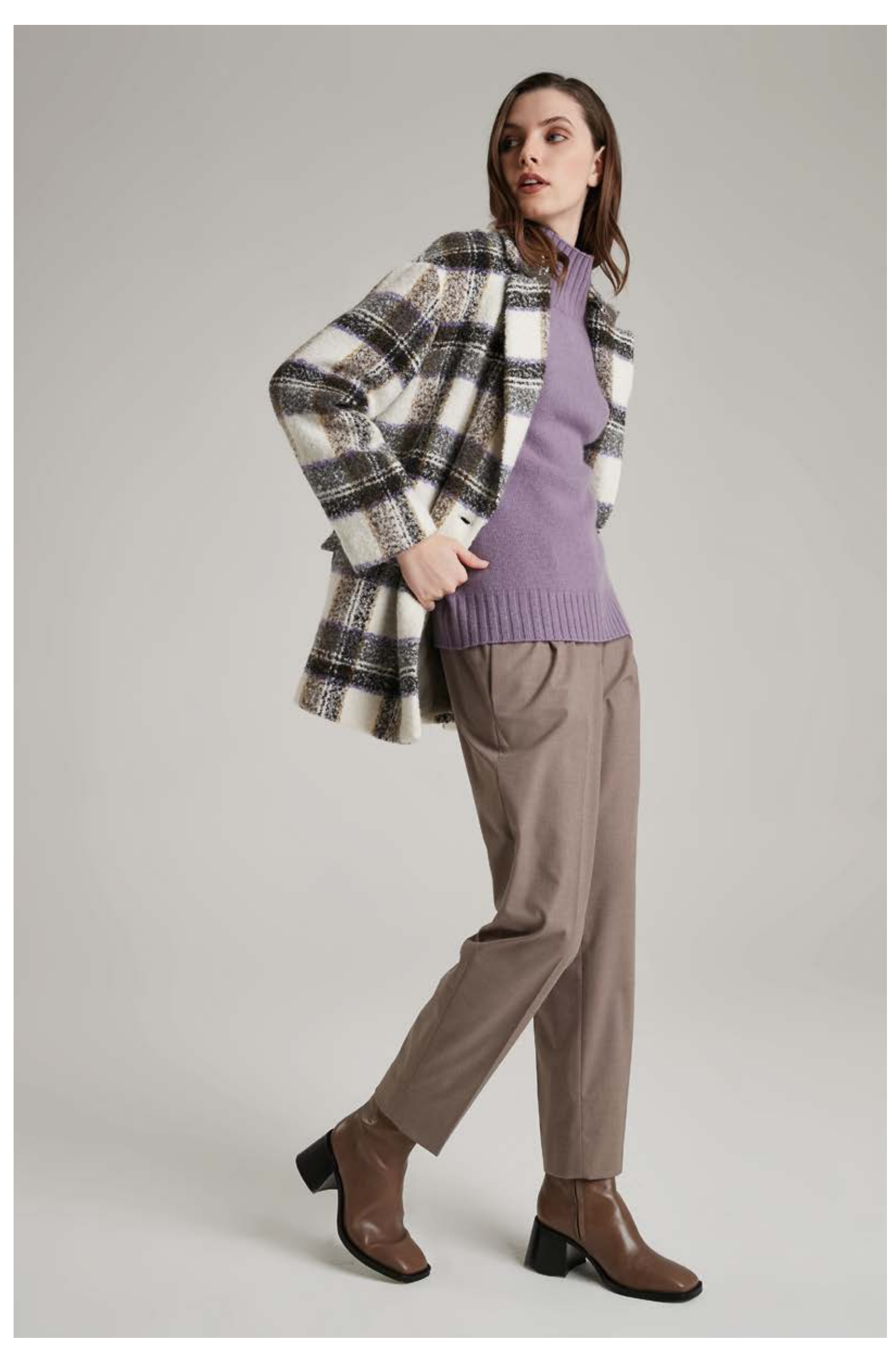
Turtle-neck sweater in cashmere, art. 2142 Coat in wool, art. 8142 Trousers in viscose, art. 3022