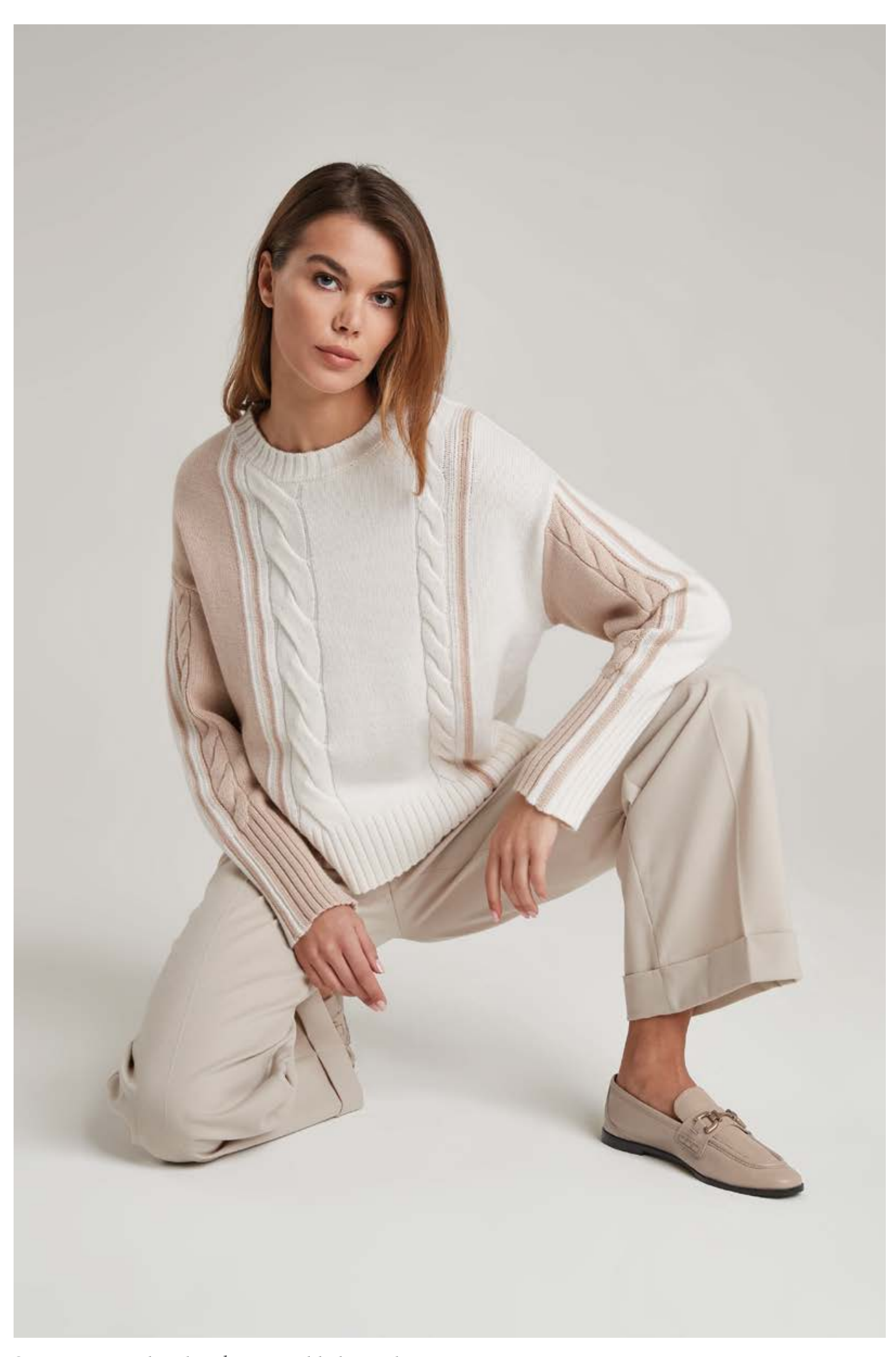
Sweater in wool and cashmere, cable knitted, art. 2235 Trousers in viscose, art. 3023