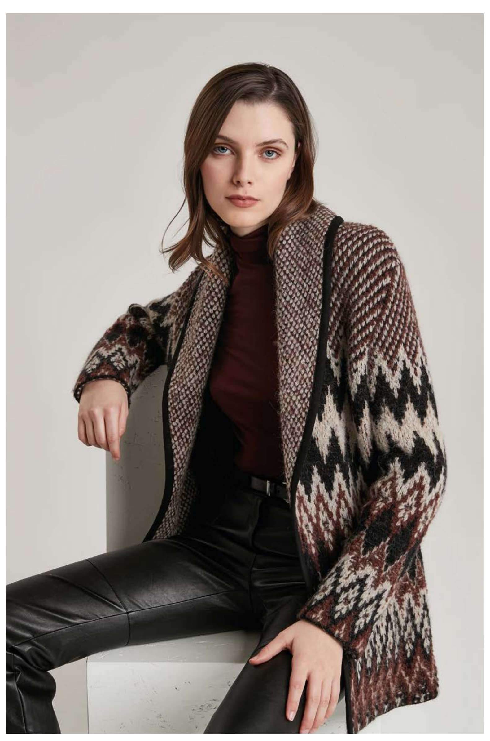
Turtle-neck t-shirt in modal cashmere, art. 1512 Jacquard cardigan in alpaca and wool, art. 2713 Trousers in faux leather, art. 3061 - Leather belt, art. 6038