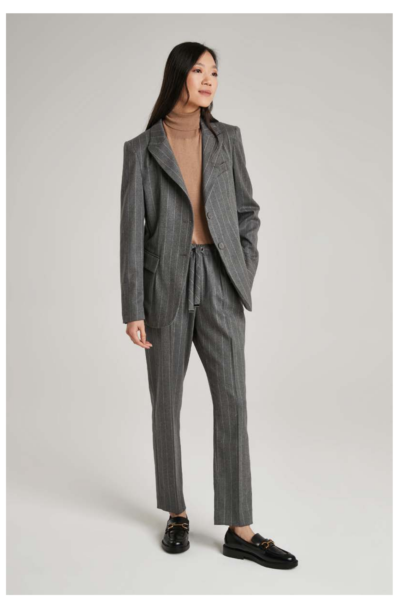
Turtle-neck top in silk and cashmere, art. 2011 Pinstripe jacket in viscose, art. 8061 Pinstripe trousers in viscose, art. 3026