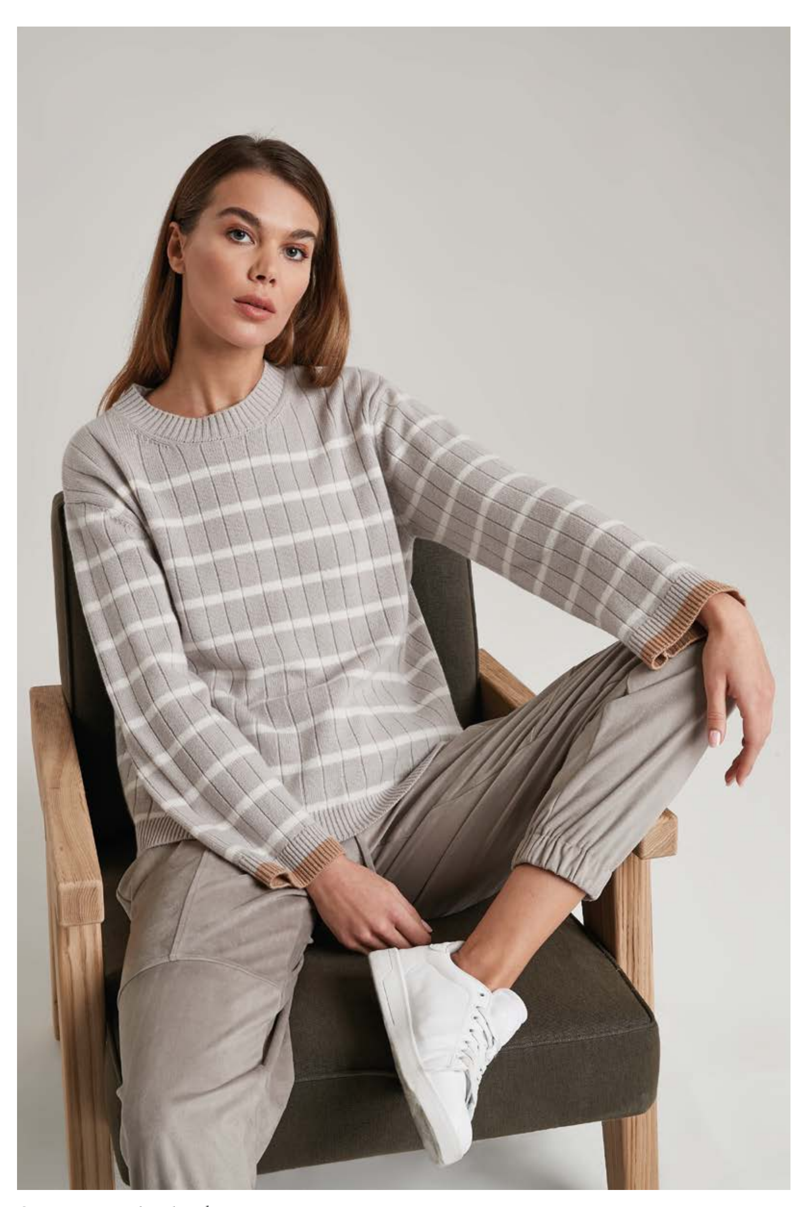
Sweater in wool and cashmere, art. 2233 Trousers in faux suede, art. 3017