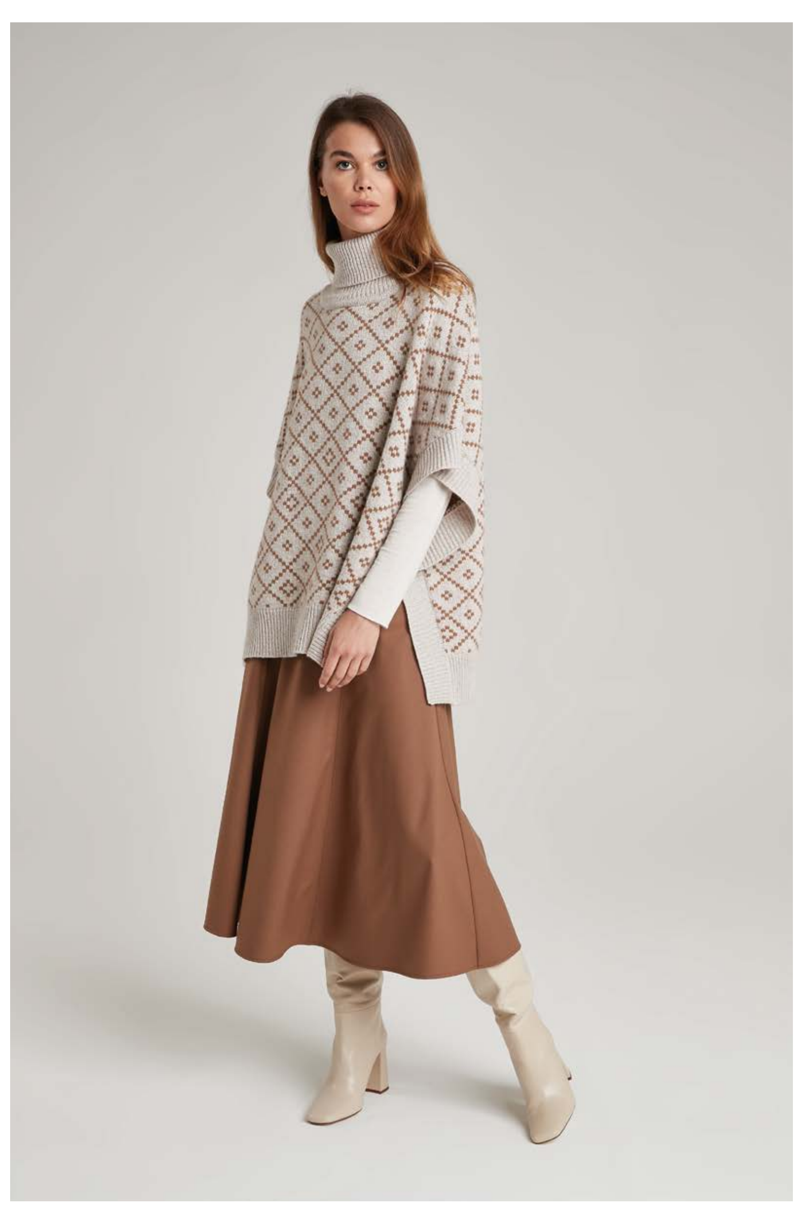
Turtle-neck t-shirt in modal cashmere, art. 1502 Turtle-neck jacquard poncho in wool, viscose and cashmere, art. 2732 Skirt in viscose, art. 3024