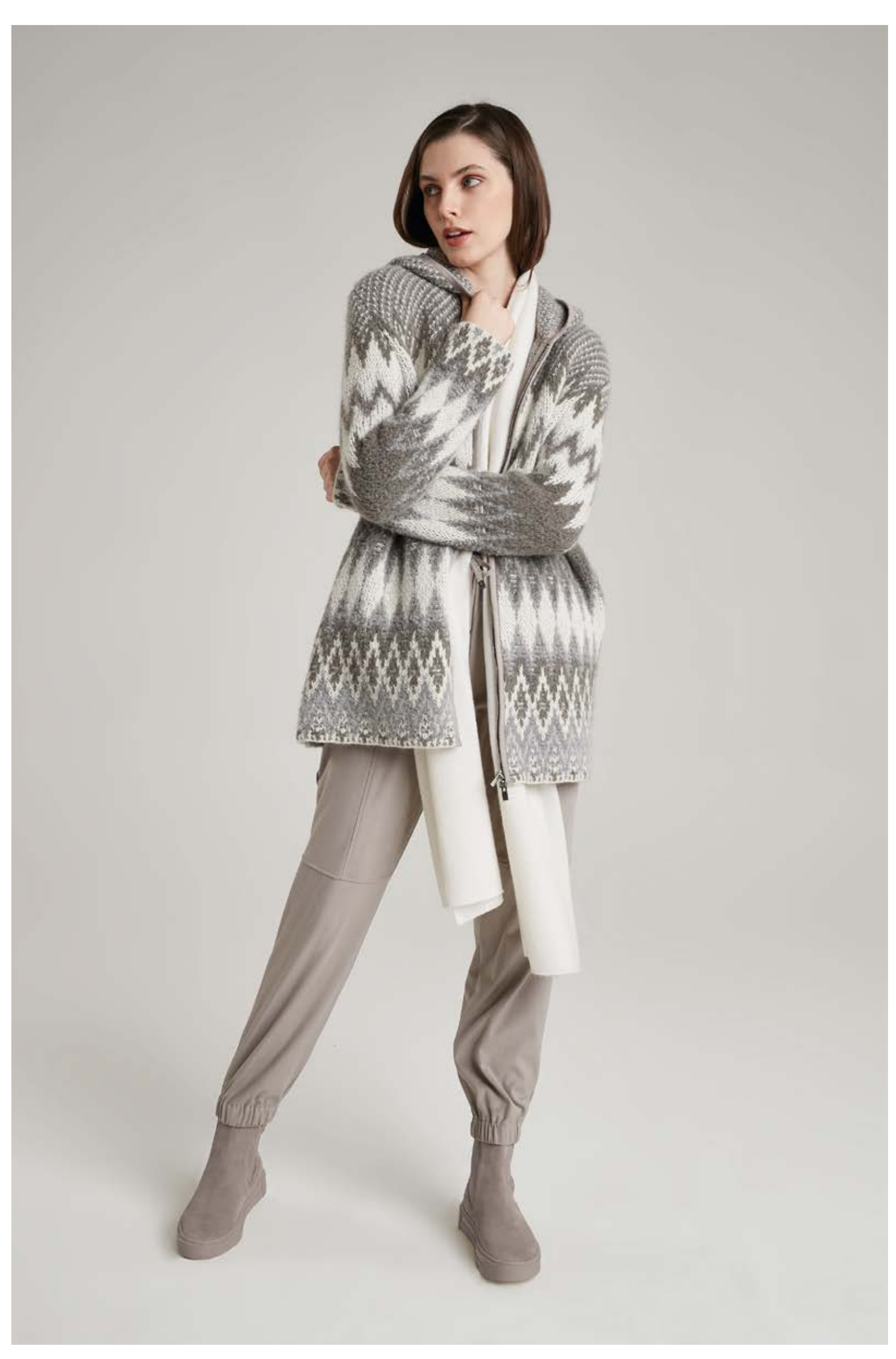
T-shirt in micromodal and cashmere, art. 1300 Jacquard hooded sweater in wool and alpaca, art. 2712 Trousers in faux suede, art. 3017 - Scarf in cashmere, art. 6014