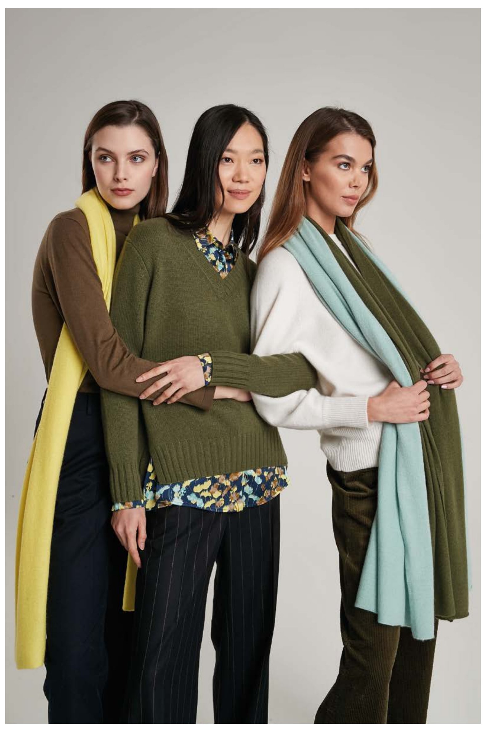
LEFT: Turtle-neck sweater in silk and cashmere, art. 2002 - Trousers in viscose, art. 3021 CENTRE: Shirt, art. 5021 - V-neck sweater in cashmere, art. 2141 - Pinstripe trousers, art. 3028 RIGHT: Sweater in cashmere, art. 2122 - Corduroy trousers in cotton, art. 3043 Scarves in cashmere, art. 6014