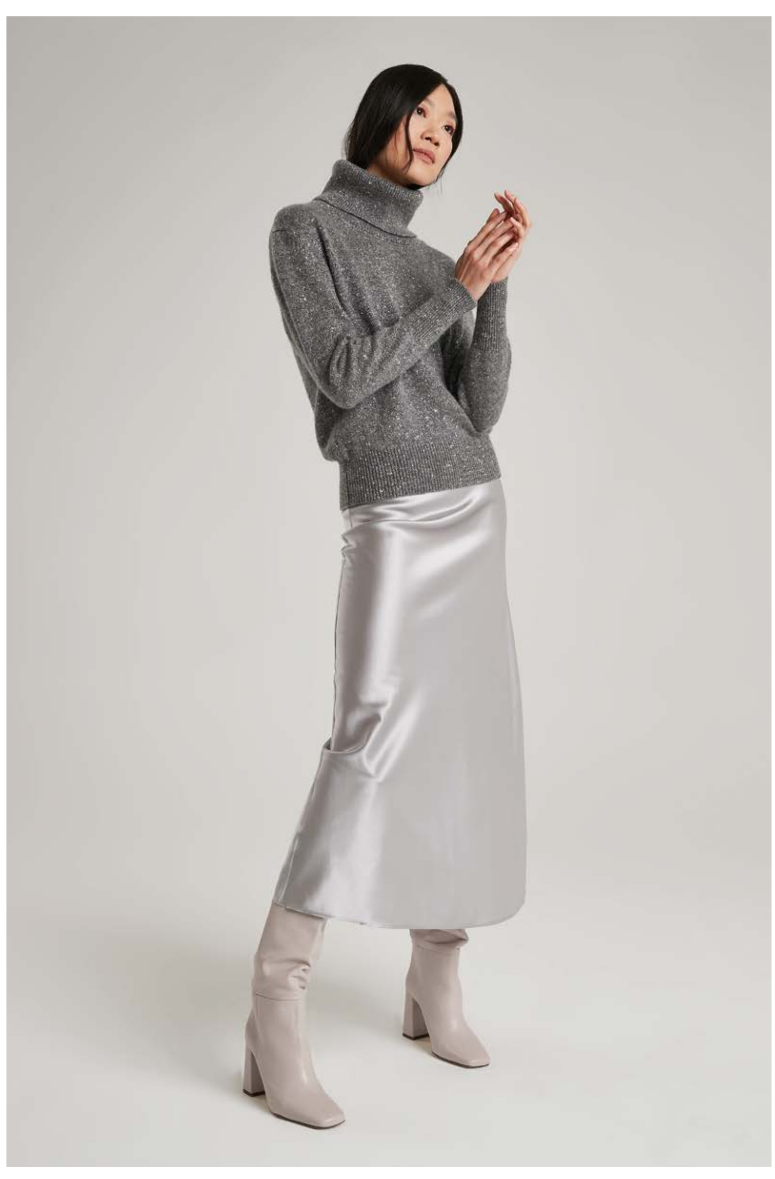
Turtle-neck sweater in cashmere and wool with lurex, art. 2601 Dress in satin silk stretch, art. 4001