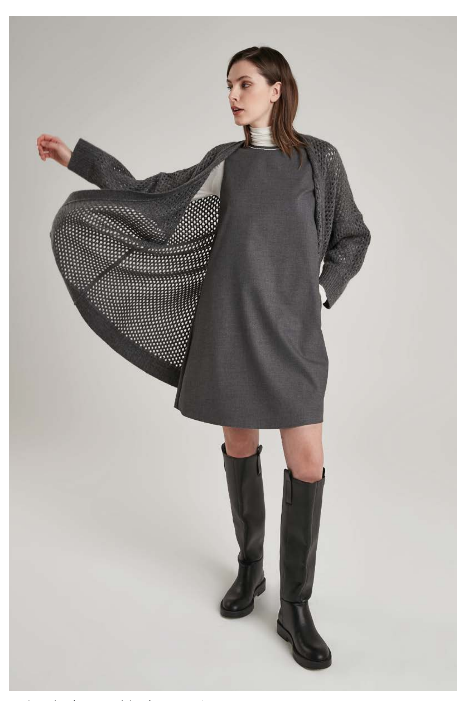
Turtle-neck t-shirt in modal cashmere, art. 1502 Dress in viscose, art. 4012 Cardigan in cashmere and silk, art. 2663