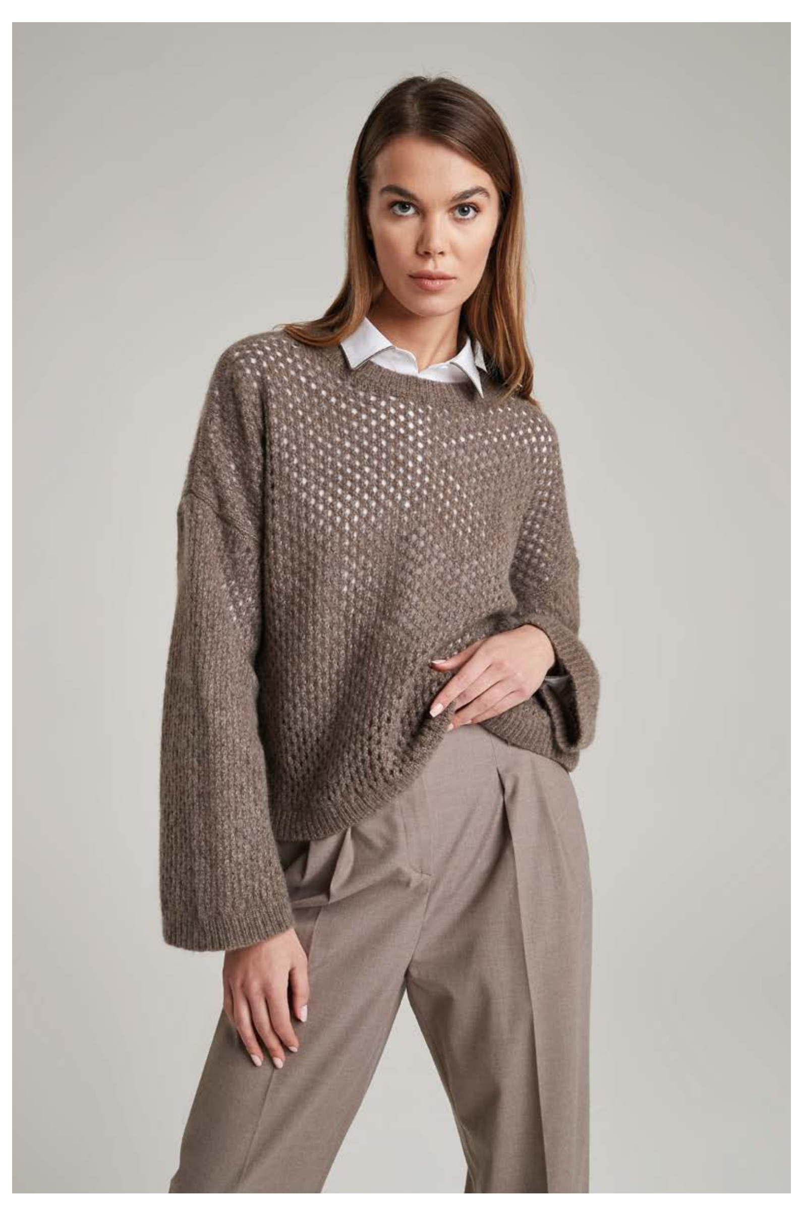
Shirt in stretch popeline, art. 5040 Sweater in cashmere and silk, art. 2660 Trousers in viscose, art. 3022