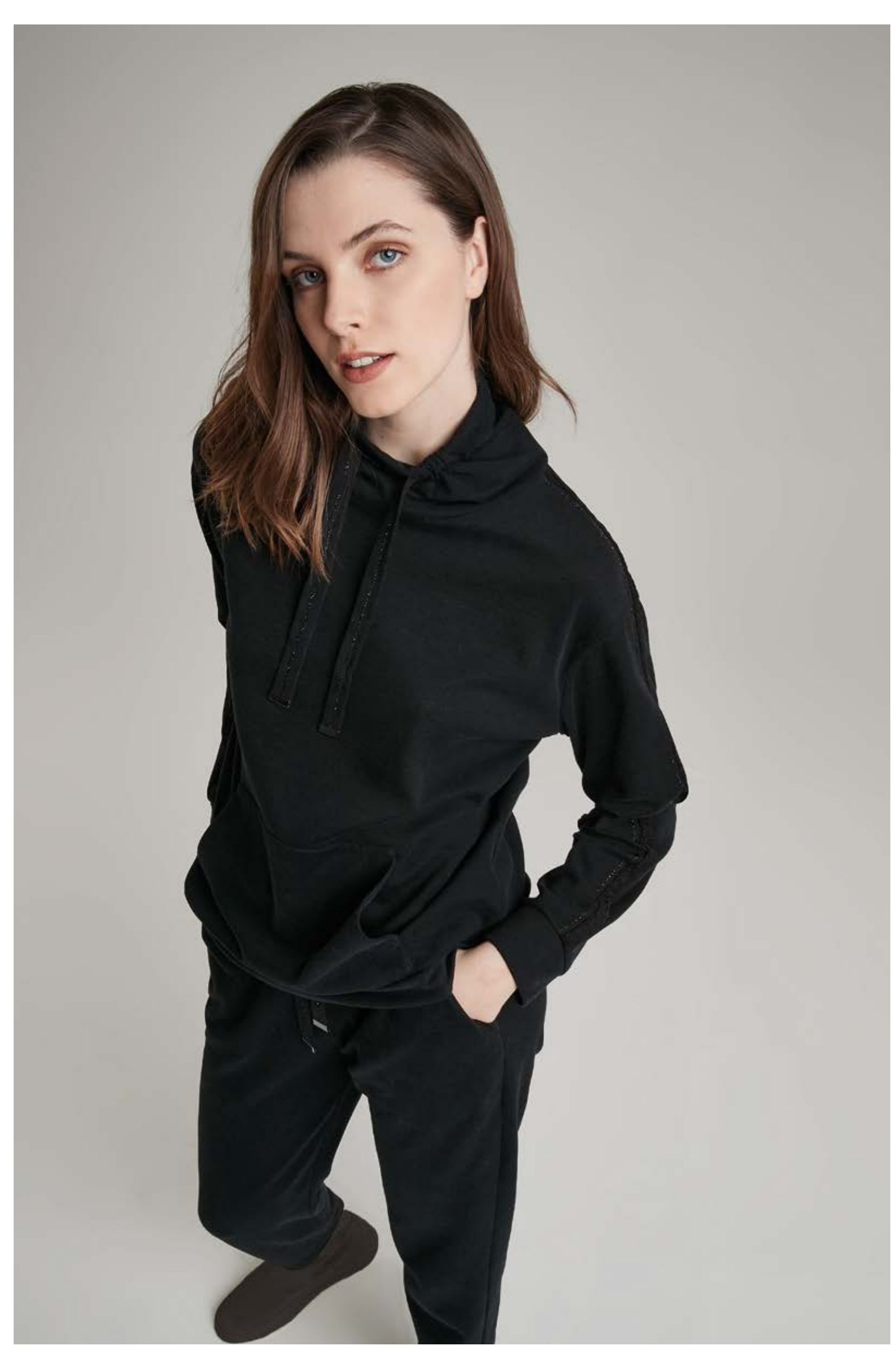
High-neck sweater in cotton, art. 1802 Pants in cotton, art. 3001