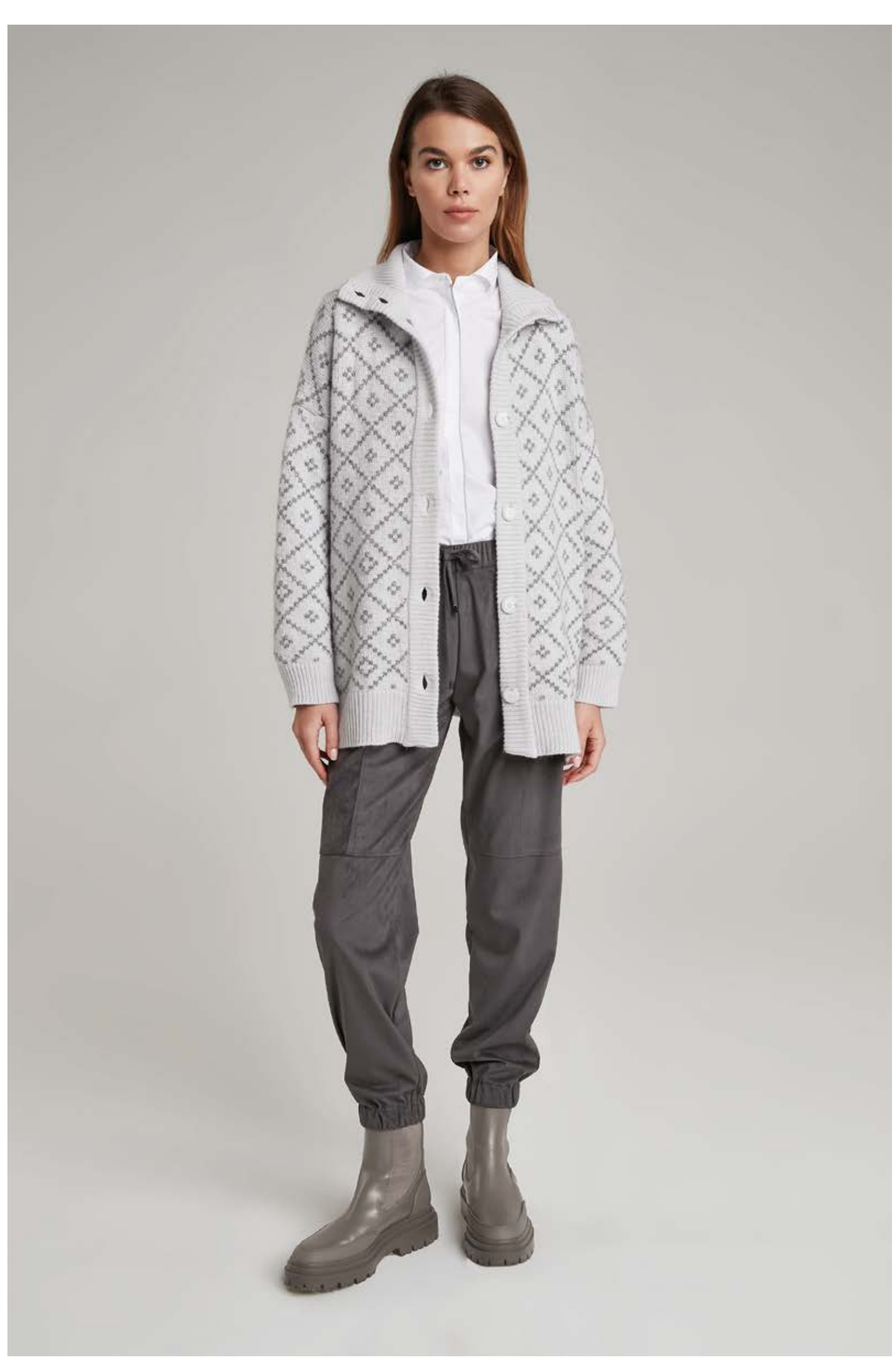
Shirt in stretch popeline, art. 5041 Jacquard cardigan in wool, viscose and cashmere, art. 2733 Trousers in faux suede, art. 3017