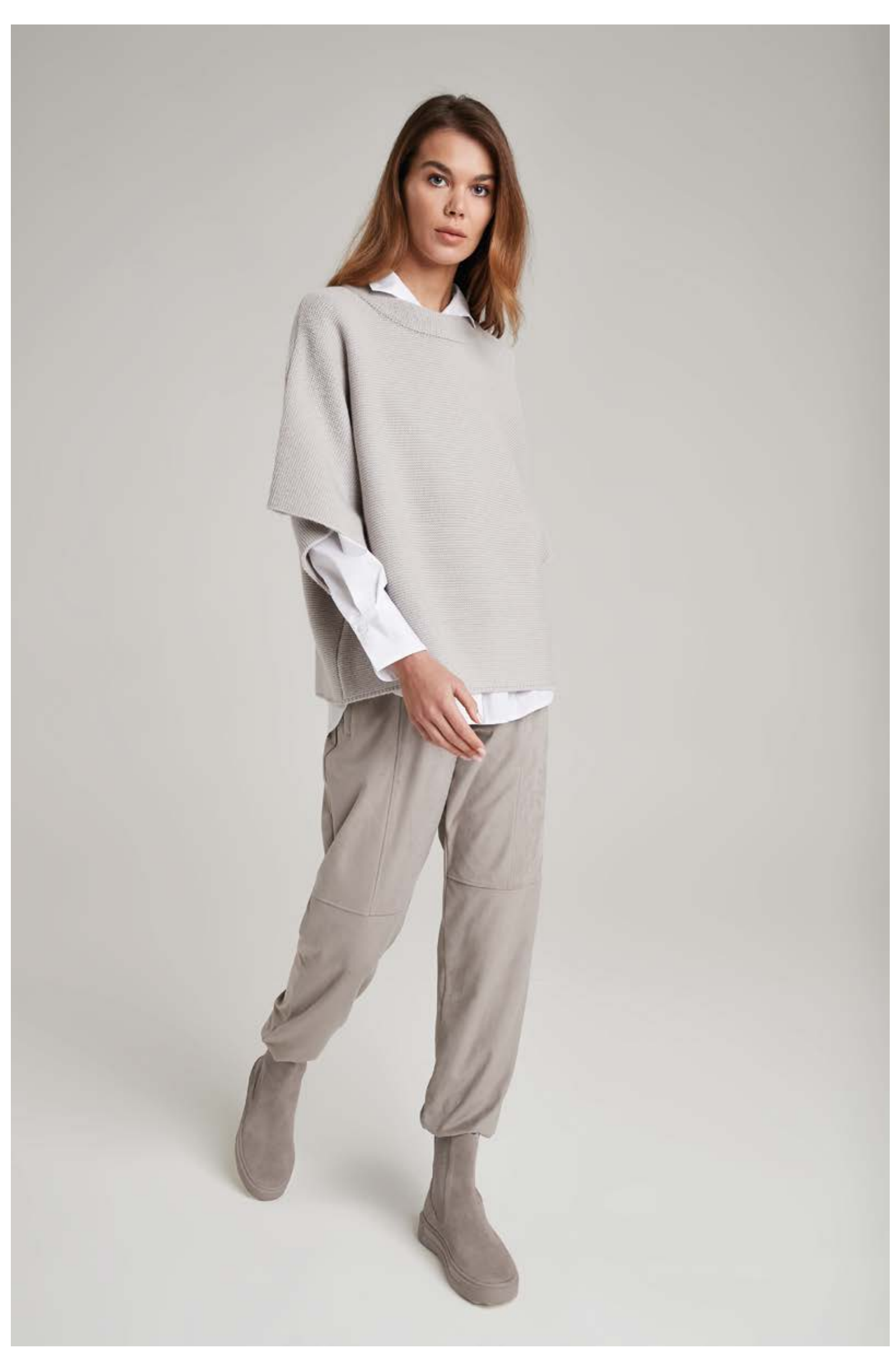
Shirt in stretch popeline, art. 5041 Poncho in wool and cashmere with lurex, art. 2260 Trousers in faux suede, art. 3017