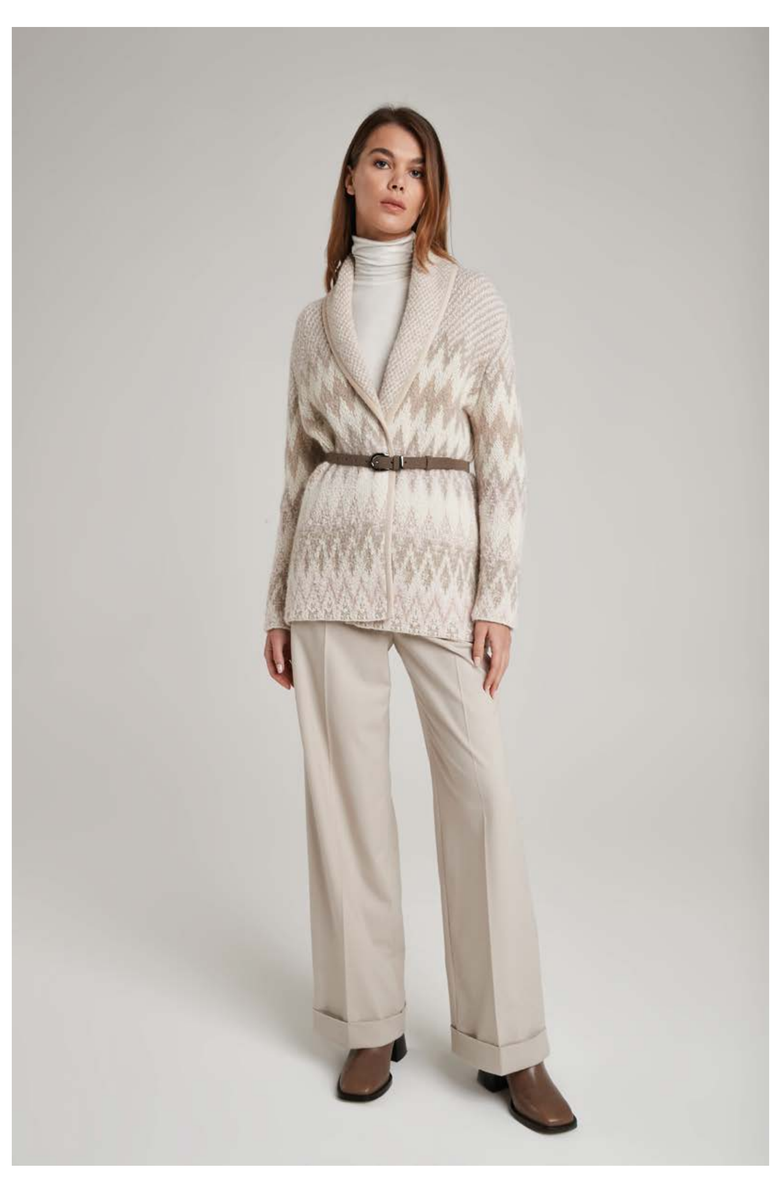
Turtle-neck t-shirt in modal cashmere, art. 1513 Jacquard cardigan in wool and alpaca, art. 2713 Trousers in viscose, art. 3023 - Leather belt, art. 6035