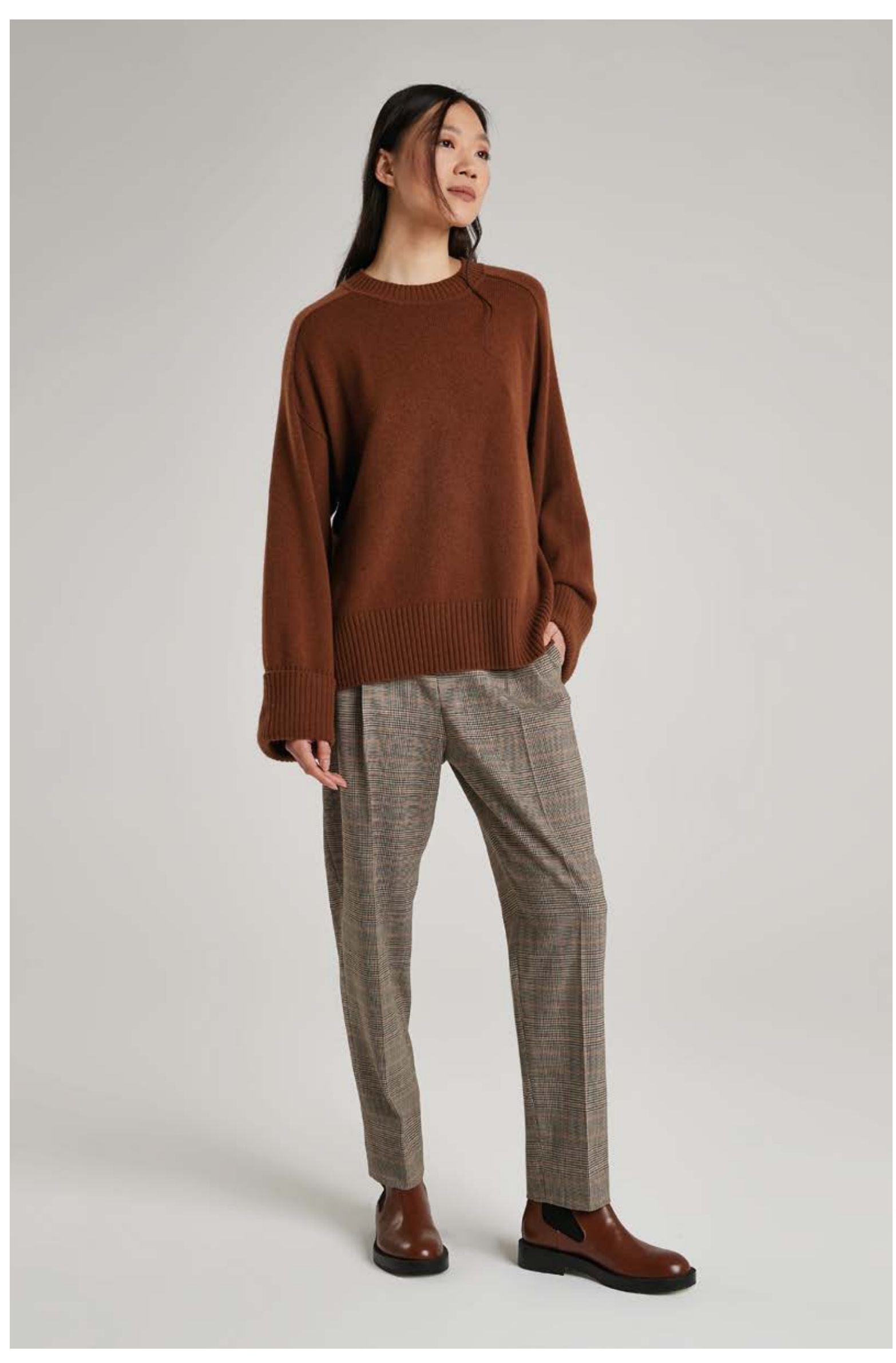
Sweater in cashmere, art. 2123 Trousers in viscose, art. 3036