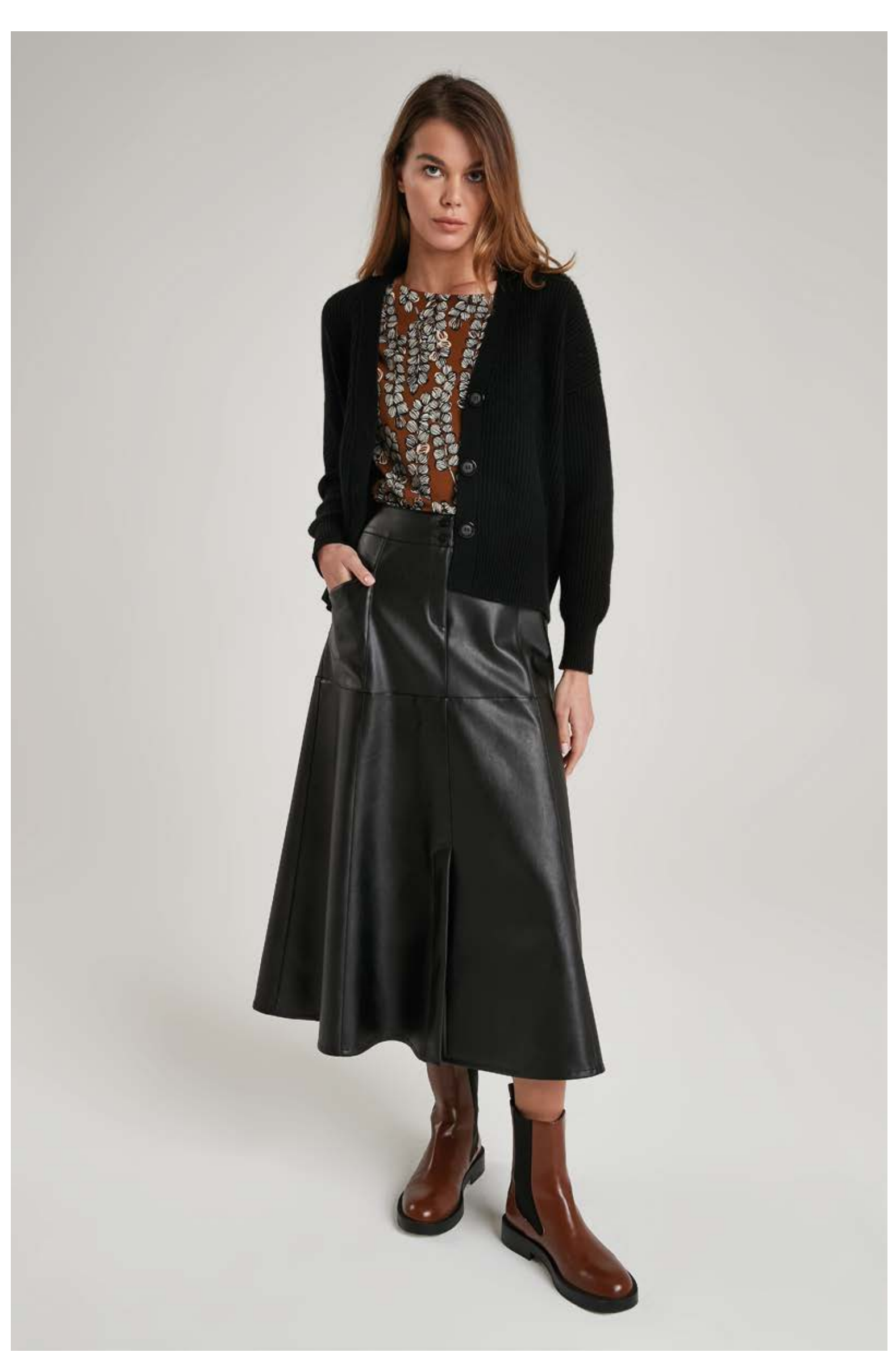
Blouse in stretch viscose, art. 1940 Cardigan in wool and cashmere, art. 2219 Skirt in faux leather, art. 3064