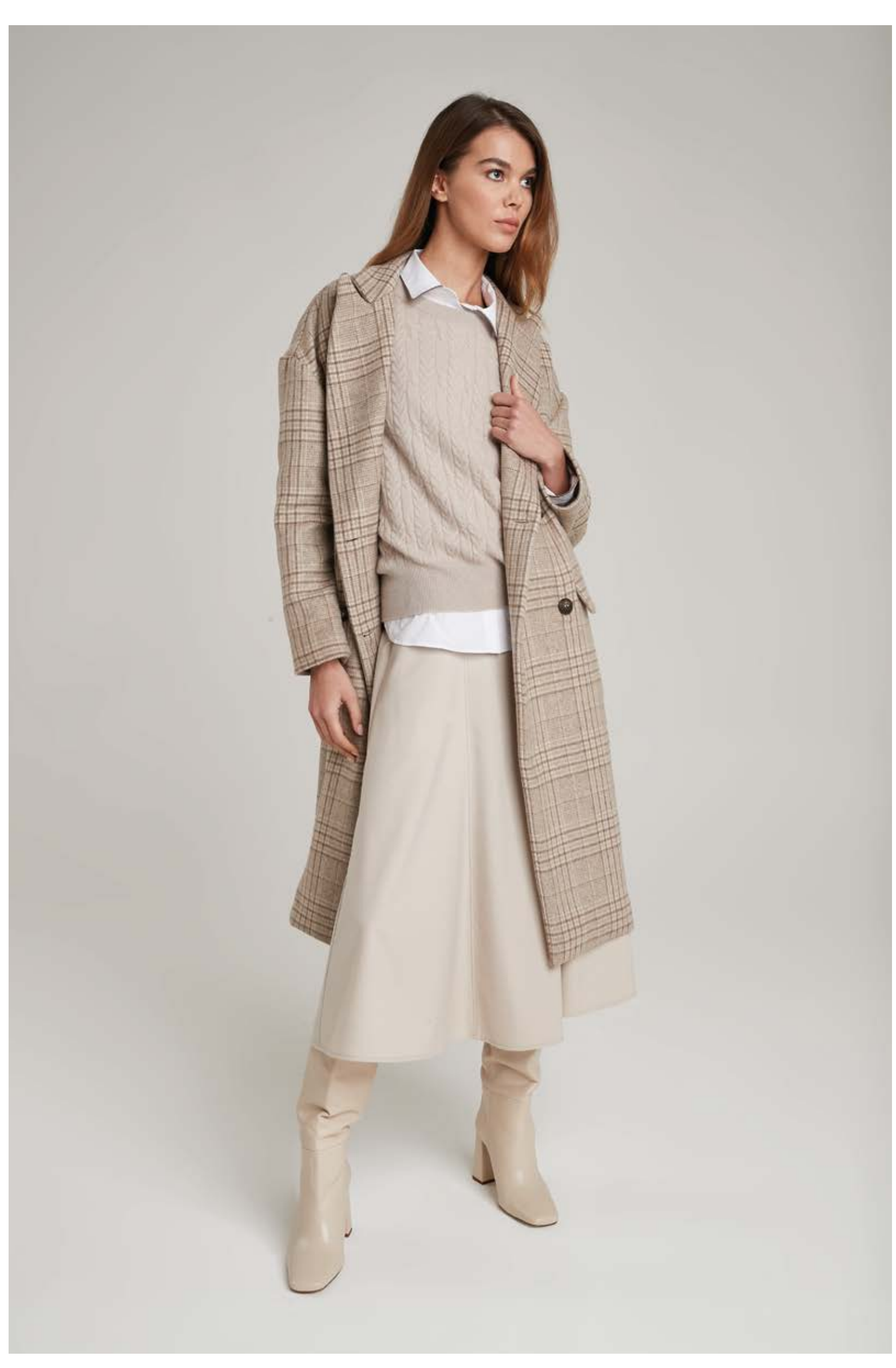
Shirt in stretch popeline, art. 5040 Gilet in cashmere with cables, art. 2162 Skirt in viscose, art. 3024 - Coat in wool and nylon, art. 8120