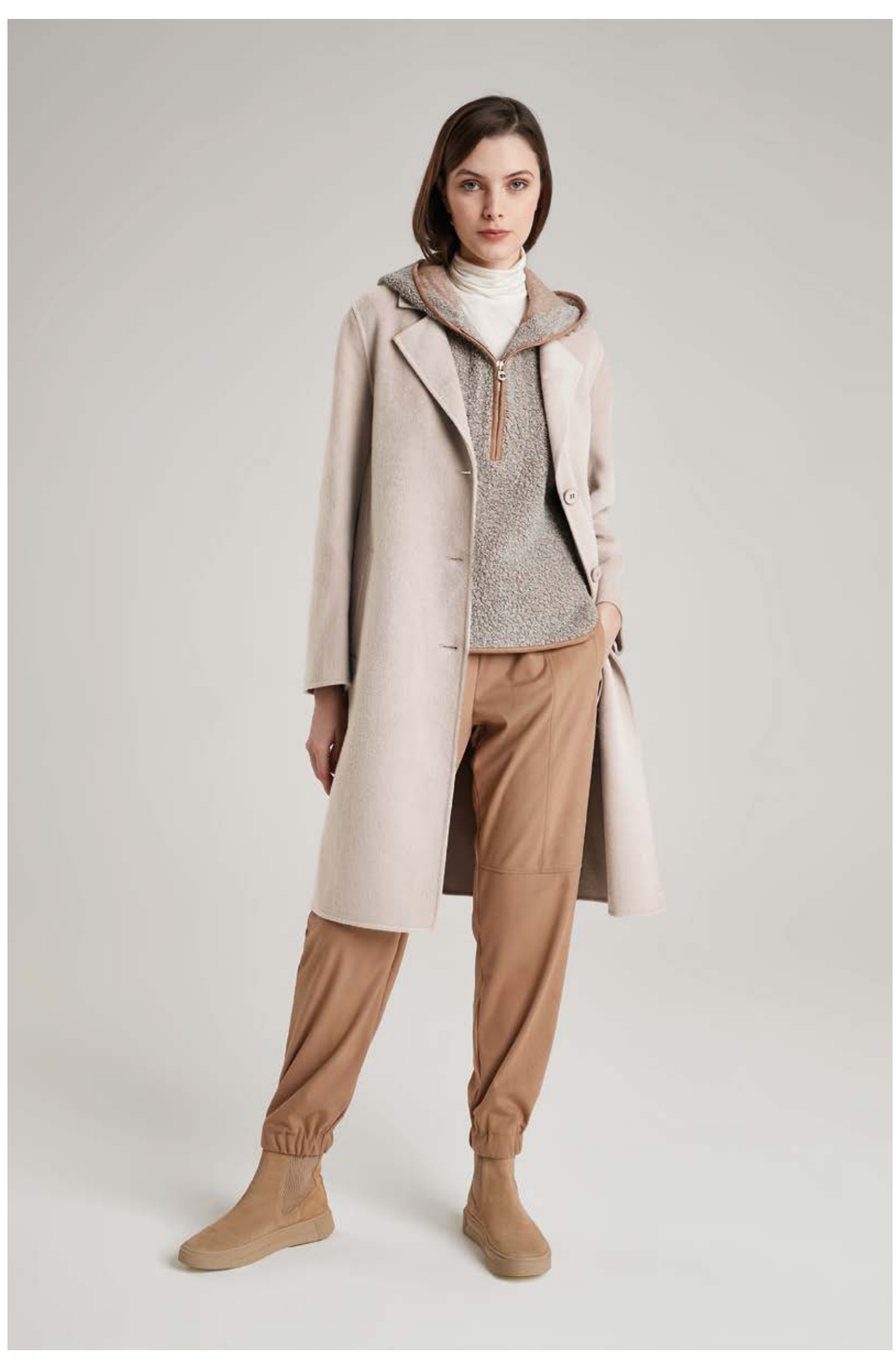
Turtle-neck t-shirt in modal cashmere, art. 1502 - Hooded gilet in terry cloth, art. 8003 Coat in double fabric wool and cashmere, art. 8110 Trousers in faux suede, art. 3017