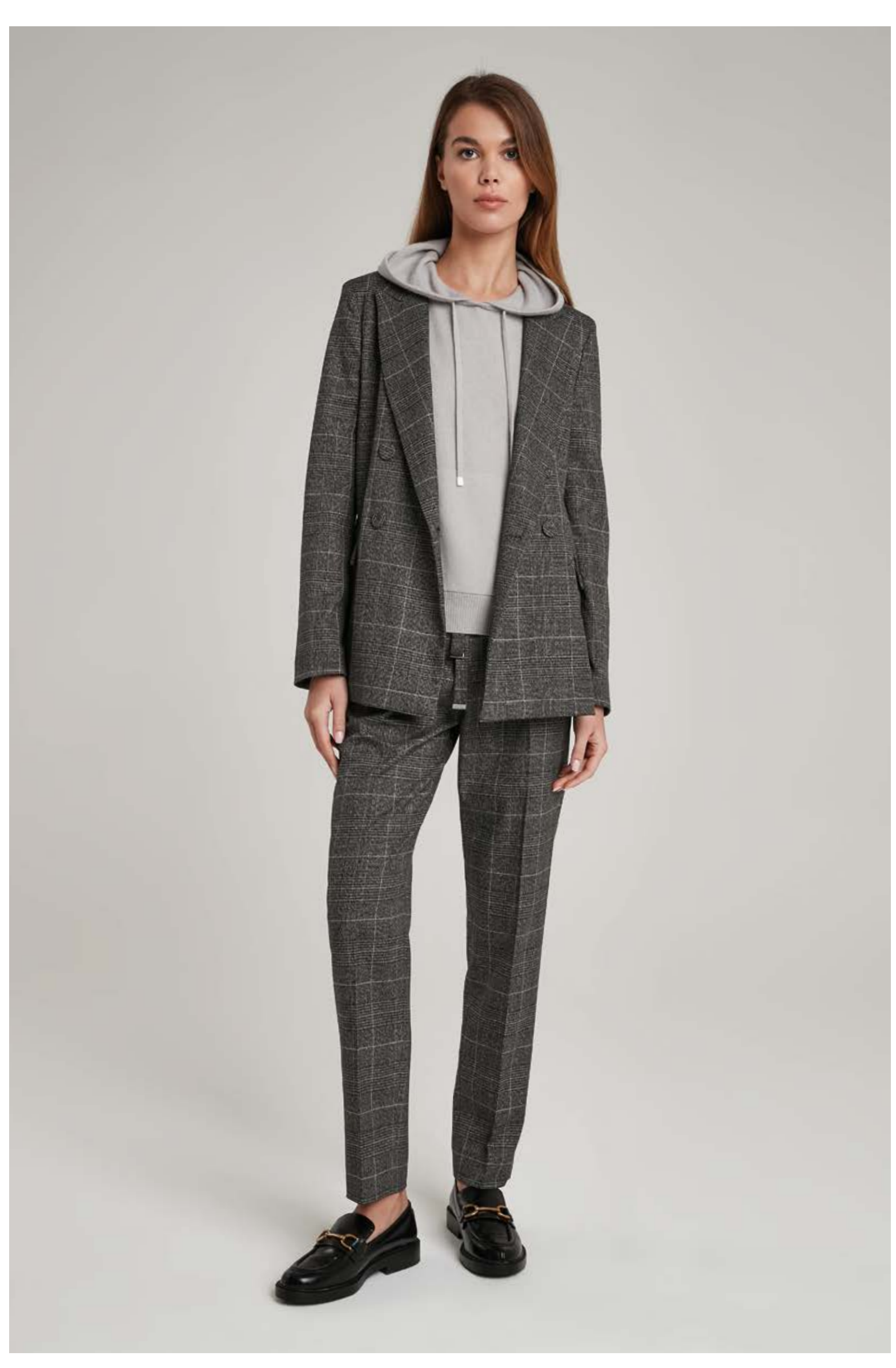
Hooded sweater in cashmere, art. 2111 Jacket in viscose, art. 8064 Trousers in viscose, art. 3031