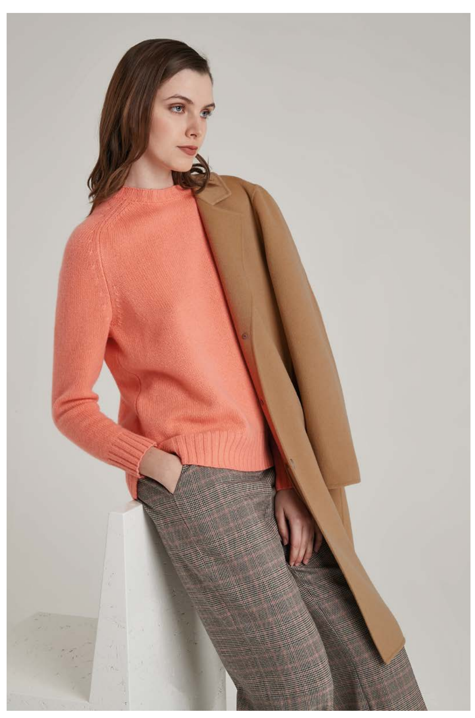
Sweater in cashmere, art. 2140 Coat in double fabric wool and cashmere, art. 8110 Trousers in viscose, art. 3037