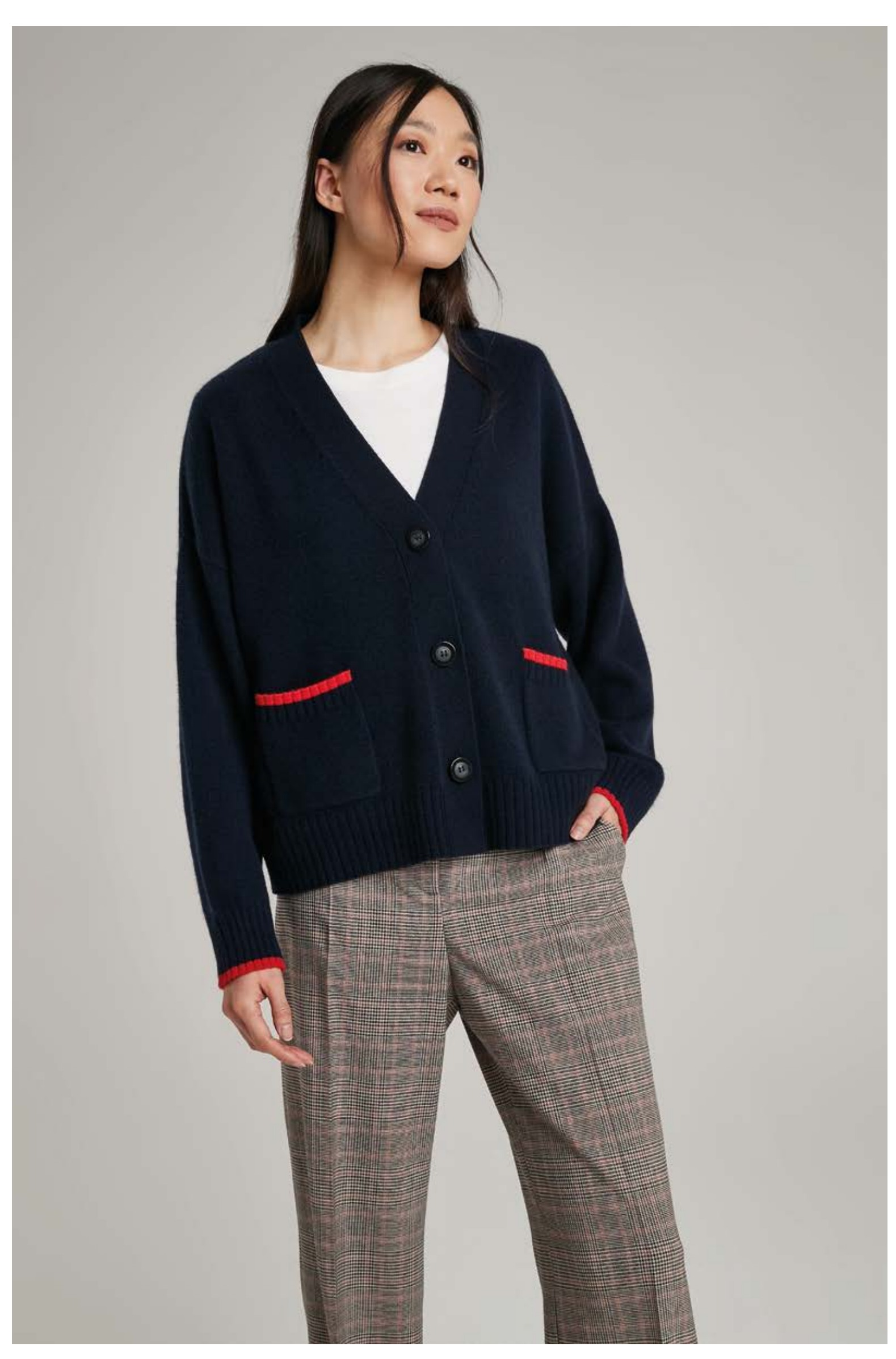
T-shirt in cotton, art. 1454 Cardigan in cashmere, art. 2120 Trousers in viscose, art. 3037