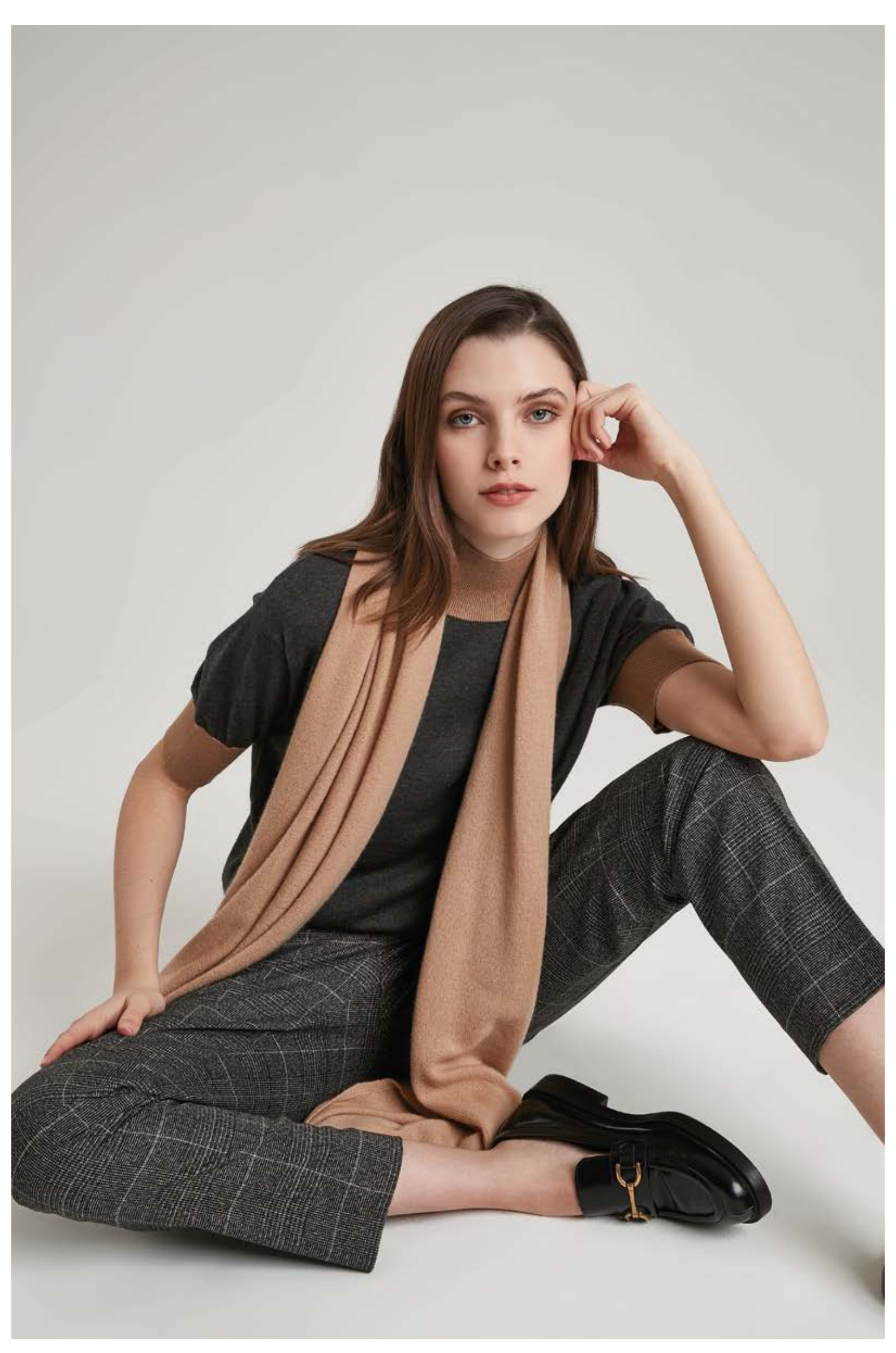
Turtle-neck sweater in silk and cashmere, art. 2016 Trousers in viscose, art. 3031 Scarf in cashmere, art. 6014