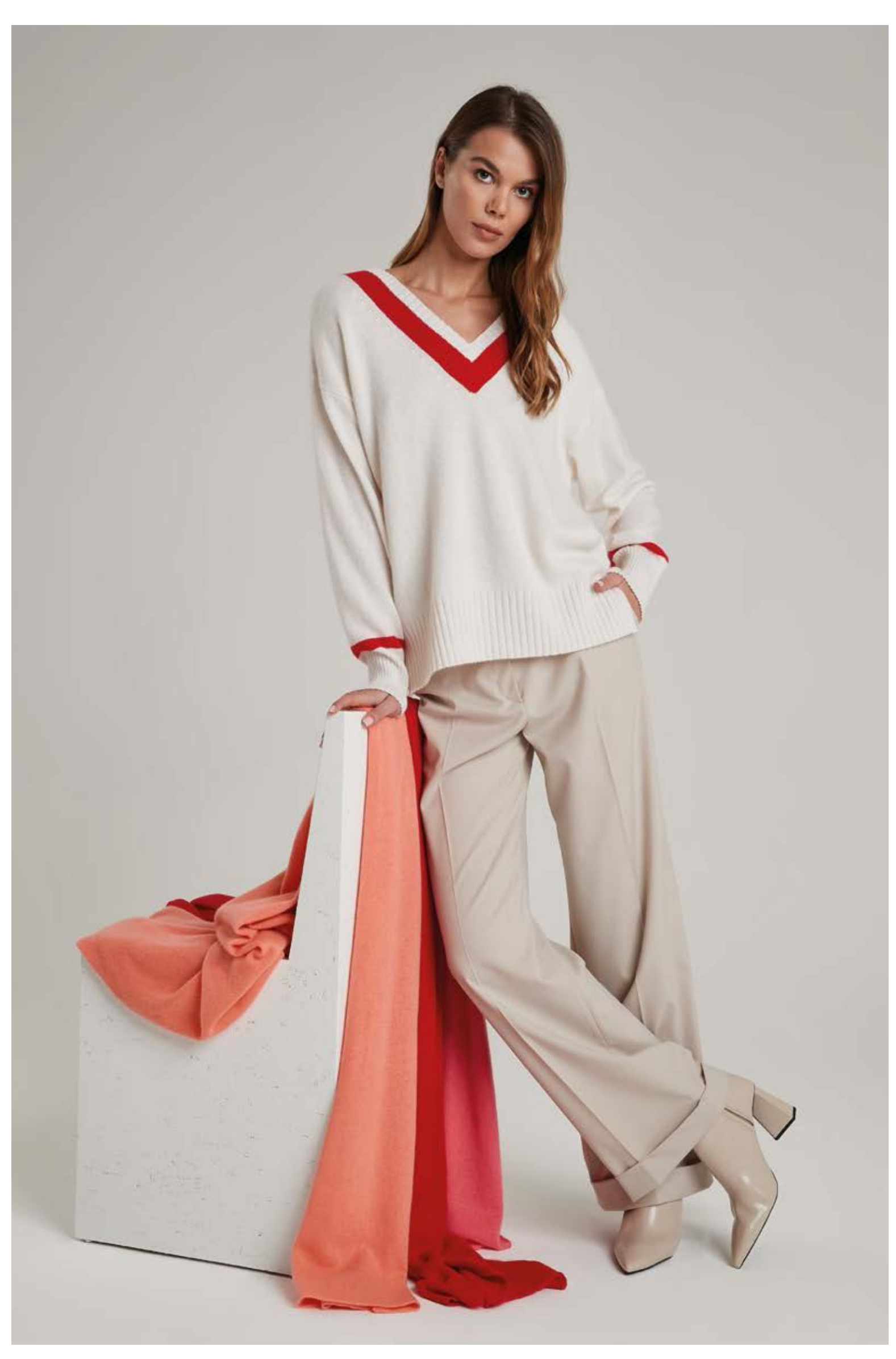
V-neck sweater in cashmere, art. 2139 Trousers in viscose, art. 3023 Scarves in cashmere, art. 6014