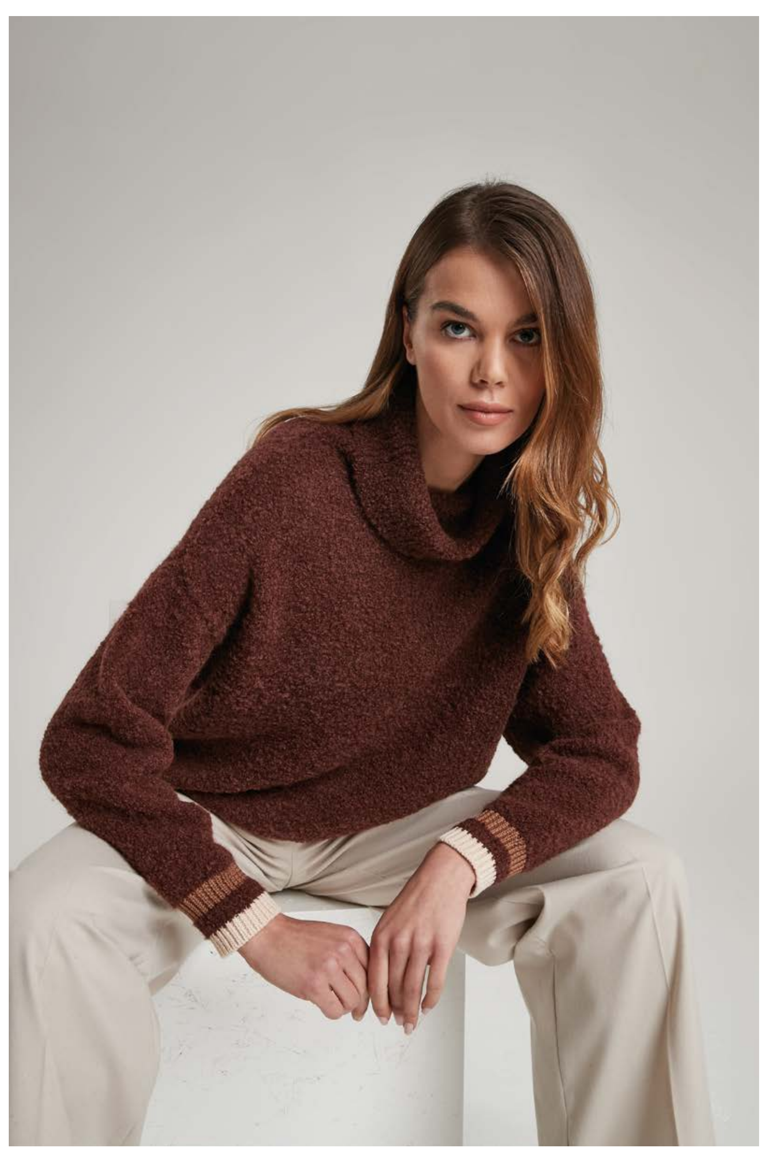
Turtle-neck sweater in alpaca and wool bouclé, art. 2554 Trousers in viscose, art. 3023