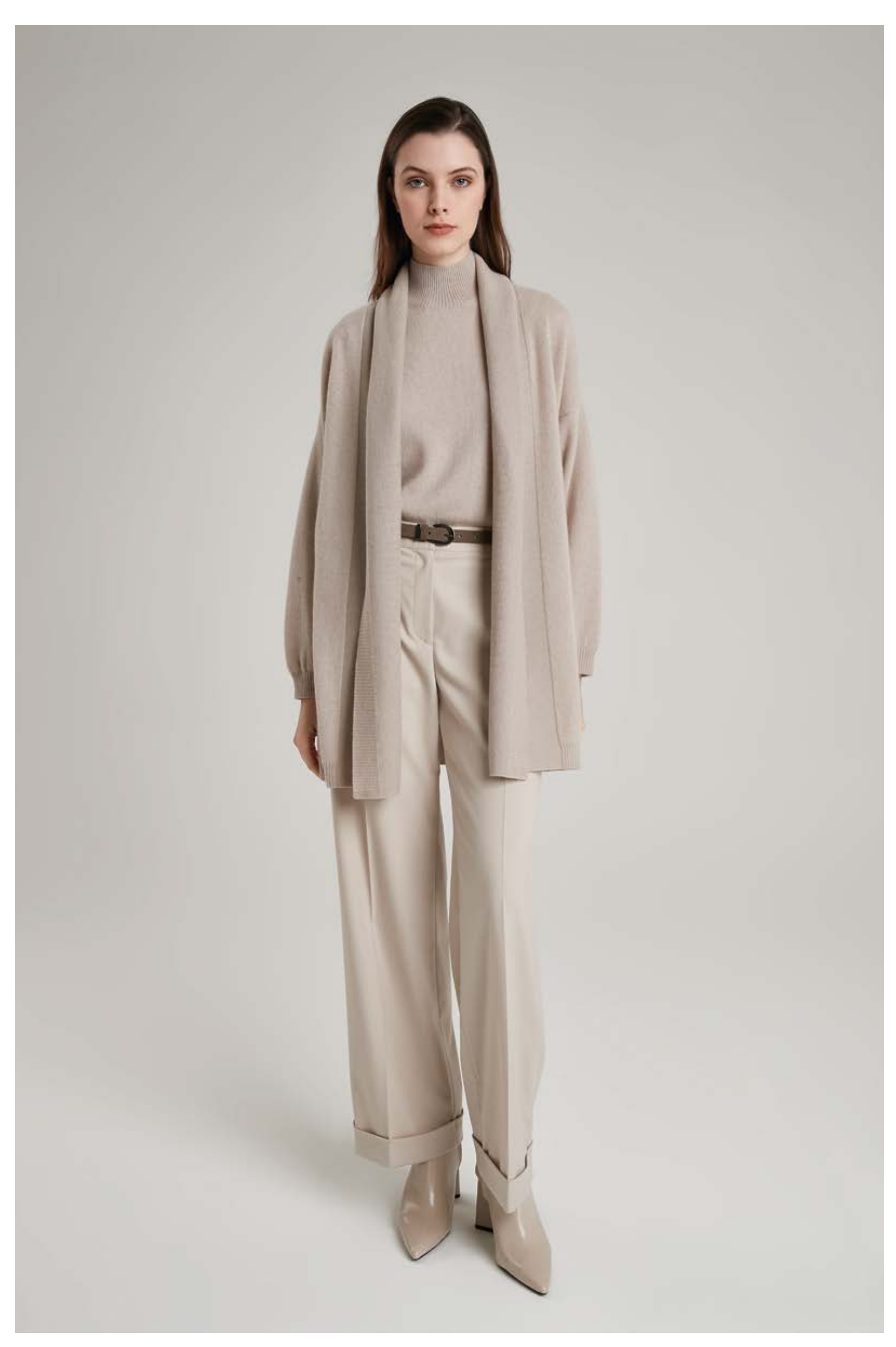
Turtle-neck top in cashmere, art. 2115 Cardigan in cashmere, art. 2116 Trousers in viscose, art. 3023 - Leather belt, art. 6035