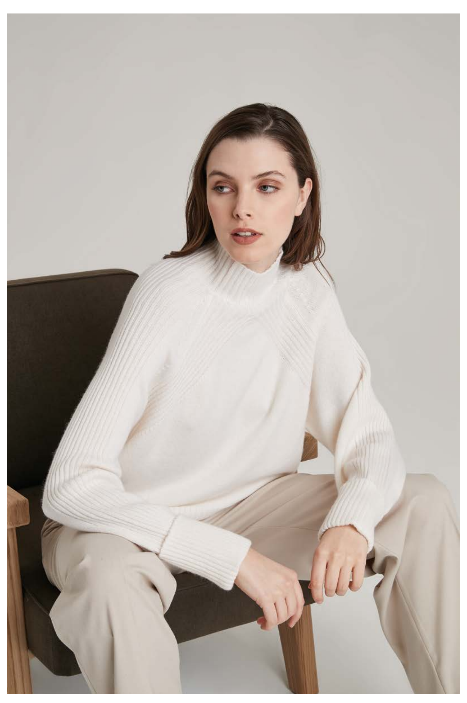
Turtle-neck sweater in wool and cashmere, art. 2221 Trousers in viscose, art. 3023