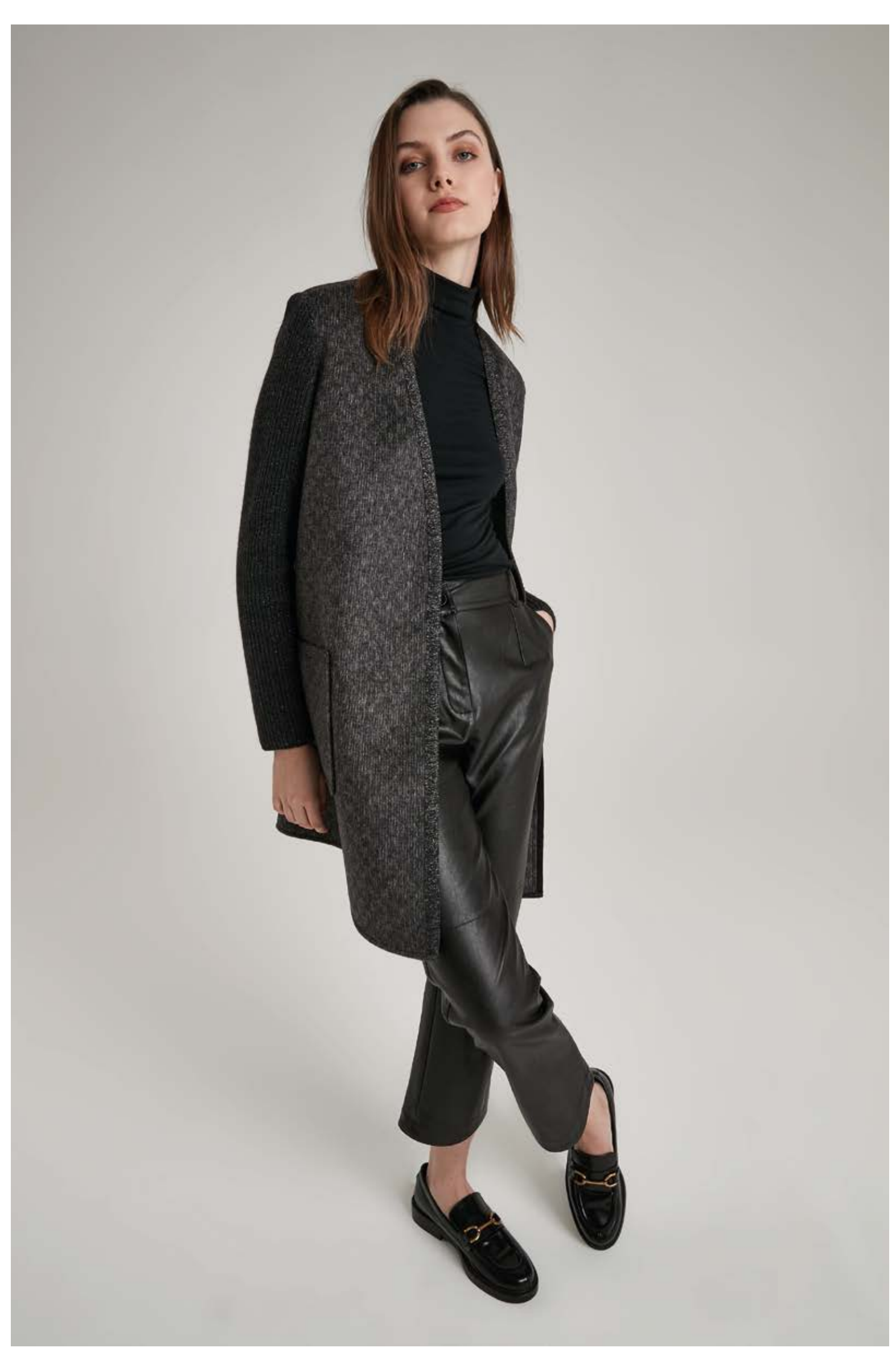
Turtle-neck t-shirt in modal cashmere, art. 1512 Coat in wool and alpaca, art. 8133 Trousers in faux leather, art. 3061