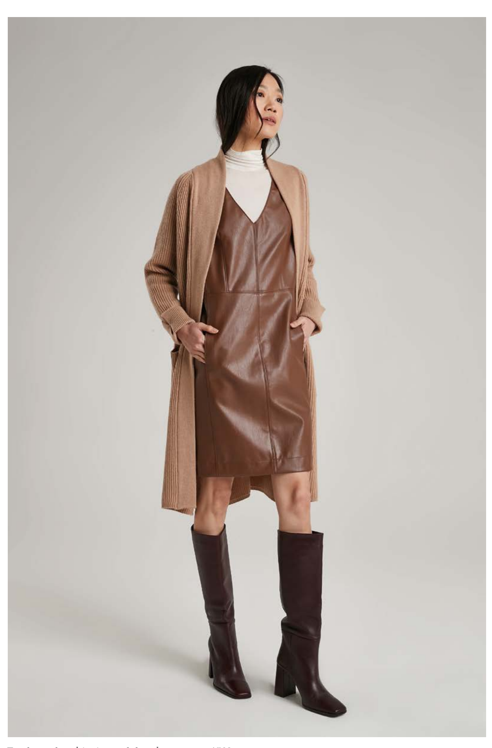
Turtle-neck t-shirt in modal cashmere, art. 1502 Dress in faux leather, art. 4050 Sweater in wool and cashmere, art. 2217