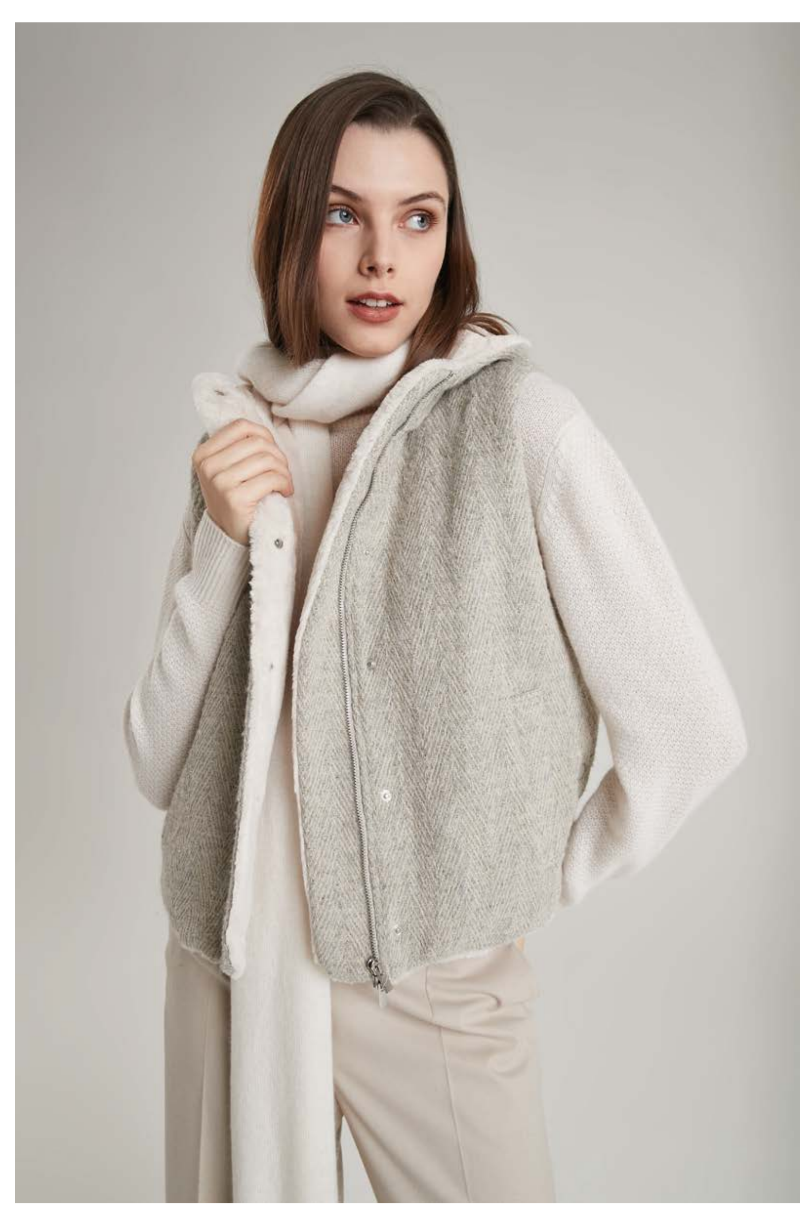
Turtle-neck sweater in cashmere moss stitch, art. 2137 Gilet with faux fur, art. 8138 Trousers in viscose, art. 3023 - Scarf in cashmere, art. 6014