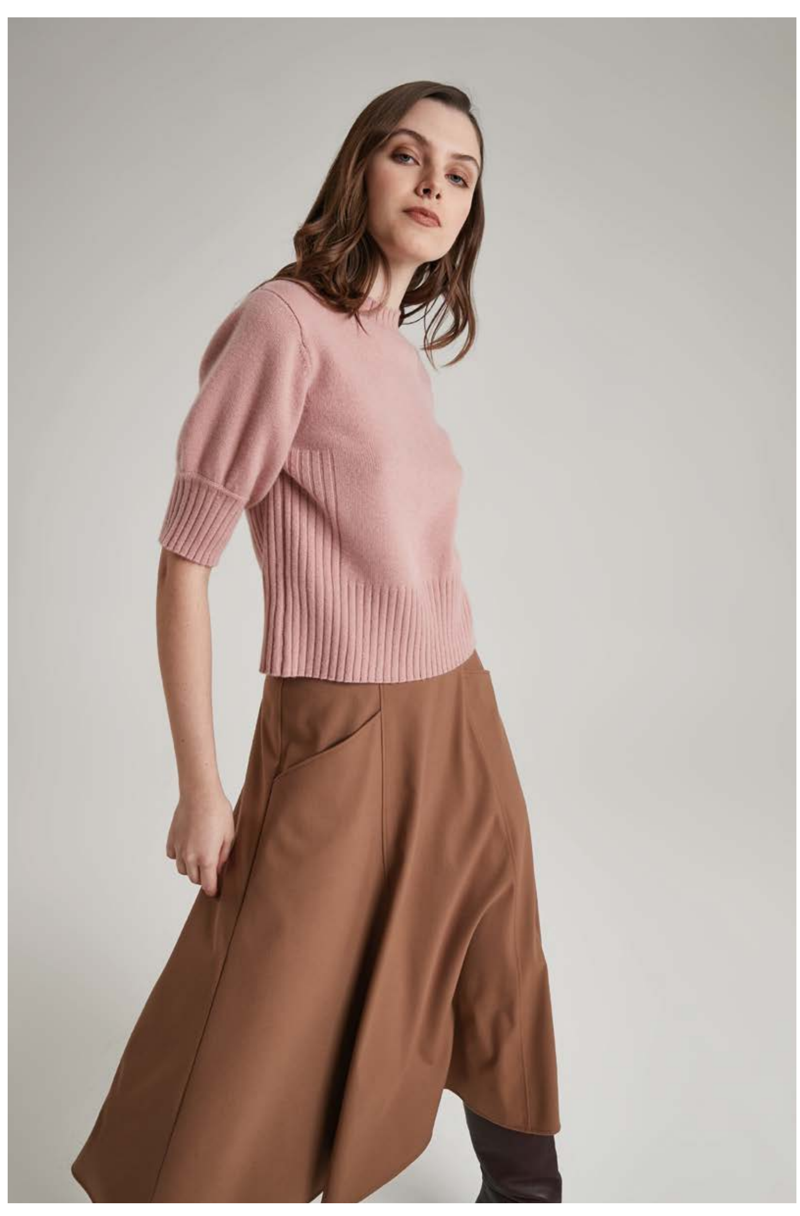
Sweater in cashmere, art. 2130 Skirt in viscose, art. 3024