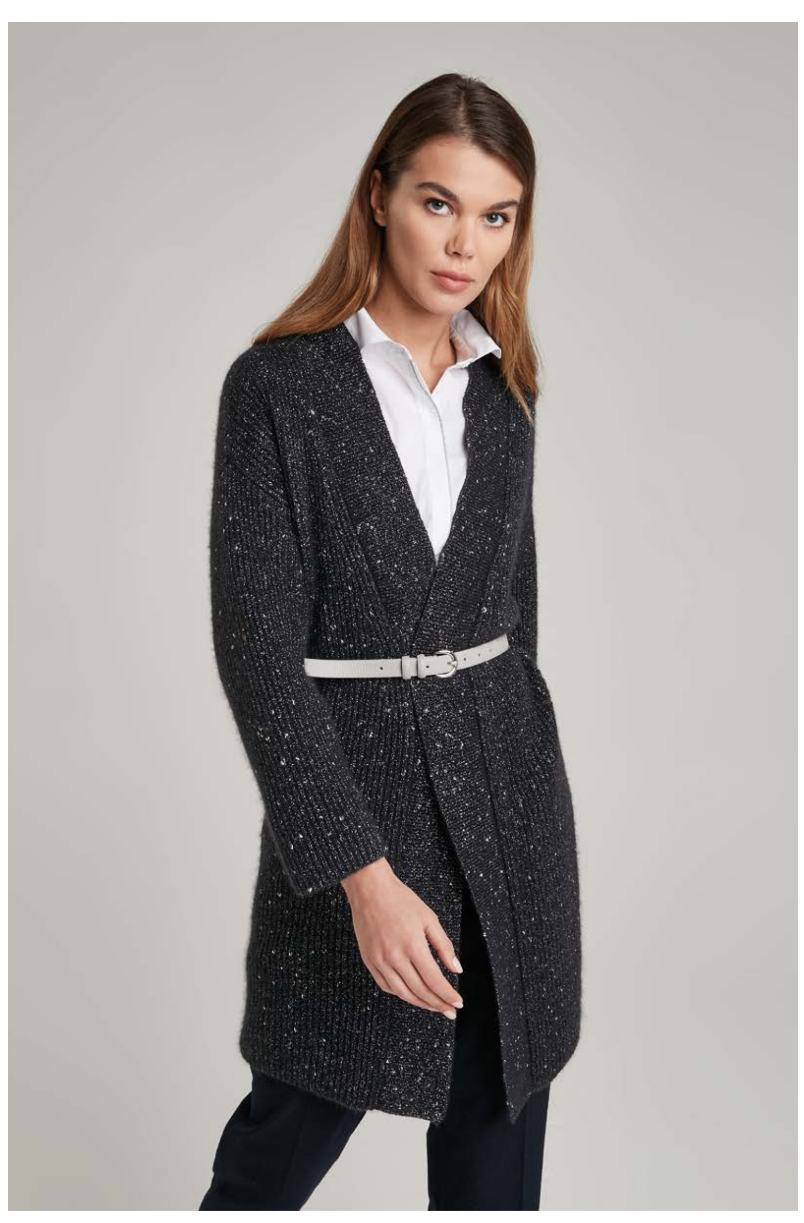
Shirt in stretch popeline, art. 5041 Cardigan in cashmere and wool with lurex, art. 2603 Trousers in viscose, art. 3021 - Leather belt, art. 6036