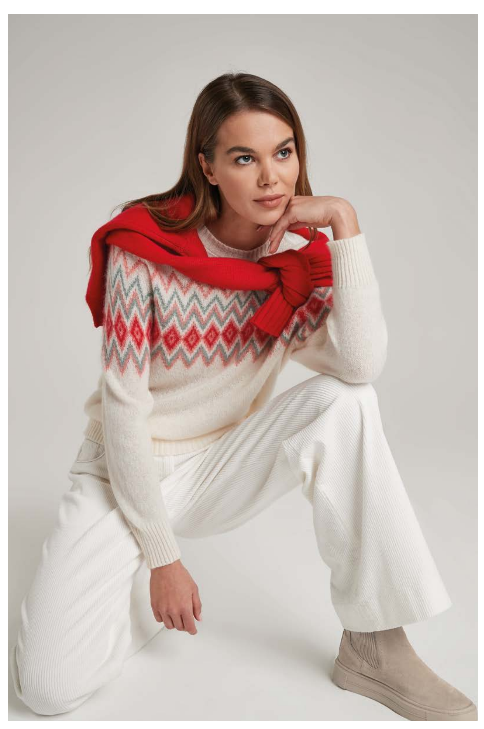
Sweater in super kid mohair and silk, art. 2635 Corduroy trousers in cotton, art. 3043 On shoulders: Sweater in cashmere, art. 2140