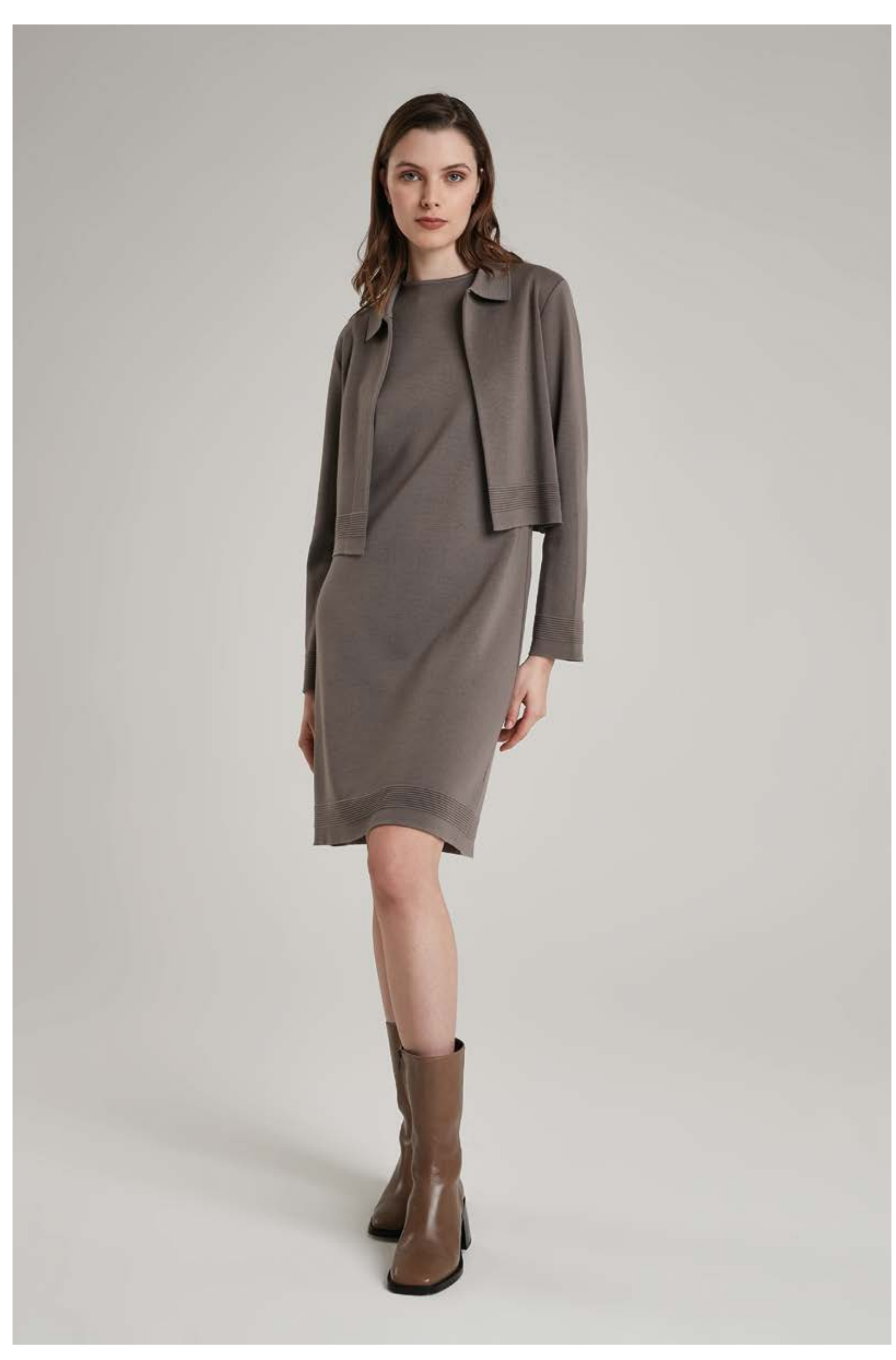
Sleeveless dress in merino wool, art. 2510 Jacket in merino wool, art. 2513