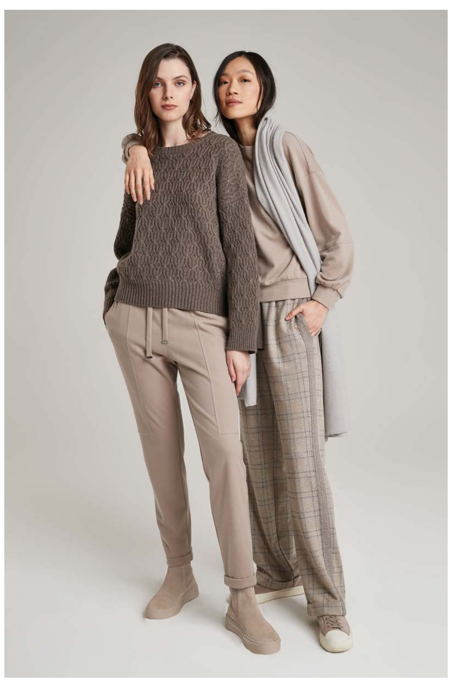
LEFT: Sweater in wool and cashmere, art. 2212 - Pants in cotton, art. 3005 RIGHT: Sweater in cotton, art. 1805 - Jacquard check trousers in cotton and viscose, art. 3009 Scarf in cashmere, art. 6014