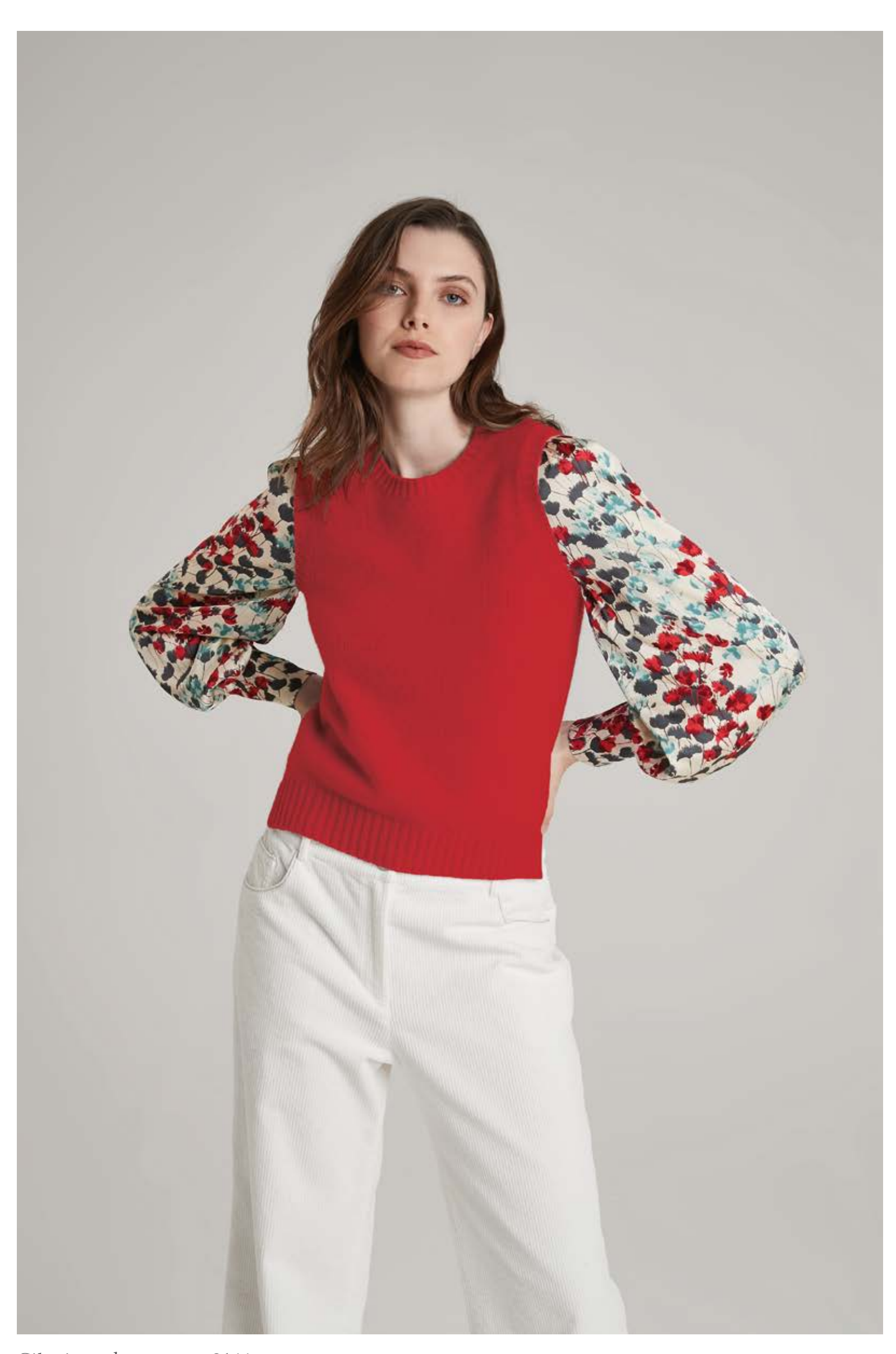
Gilet in cashmere, art. 2144 Blouse in stretch viscose, art. 1934 Corduroy trousers in cotton, art. 3043