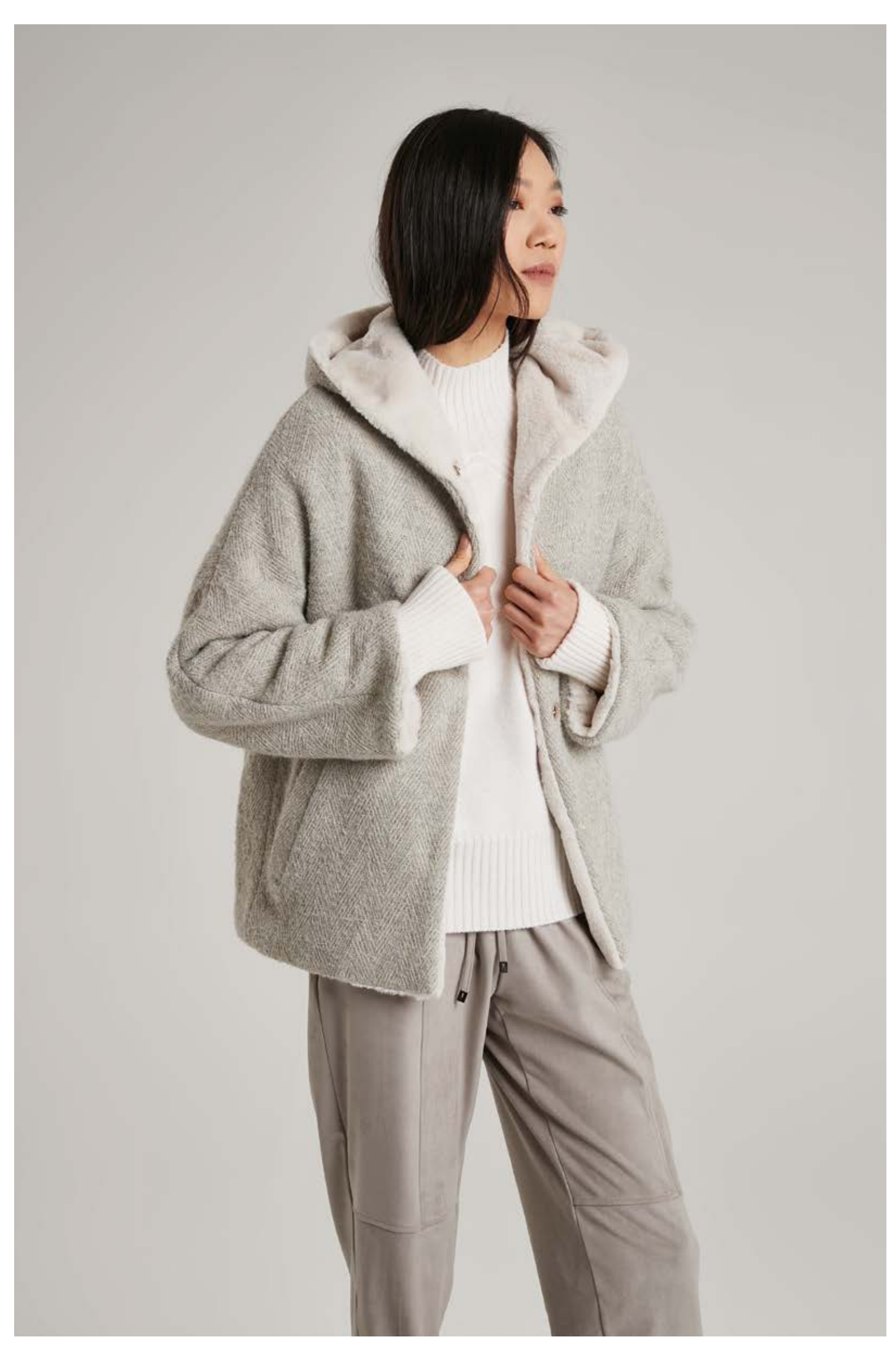
Turtle-neck sweater in wool and cashmere, art. 2221 Kimono coat with faux fur, reversible, art. 8137 Trousers in faux suede, art. 3017