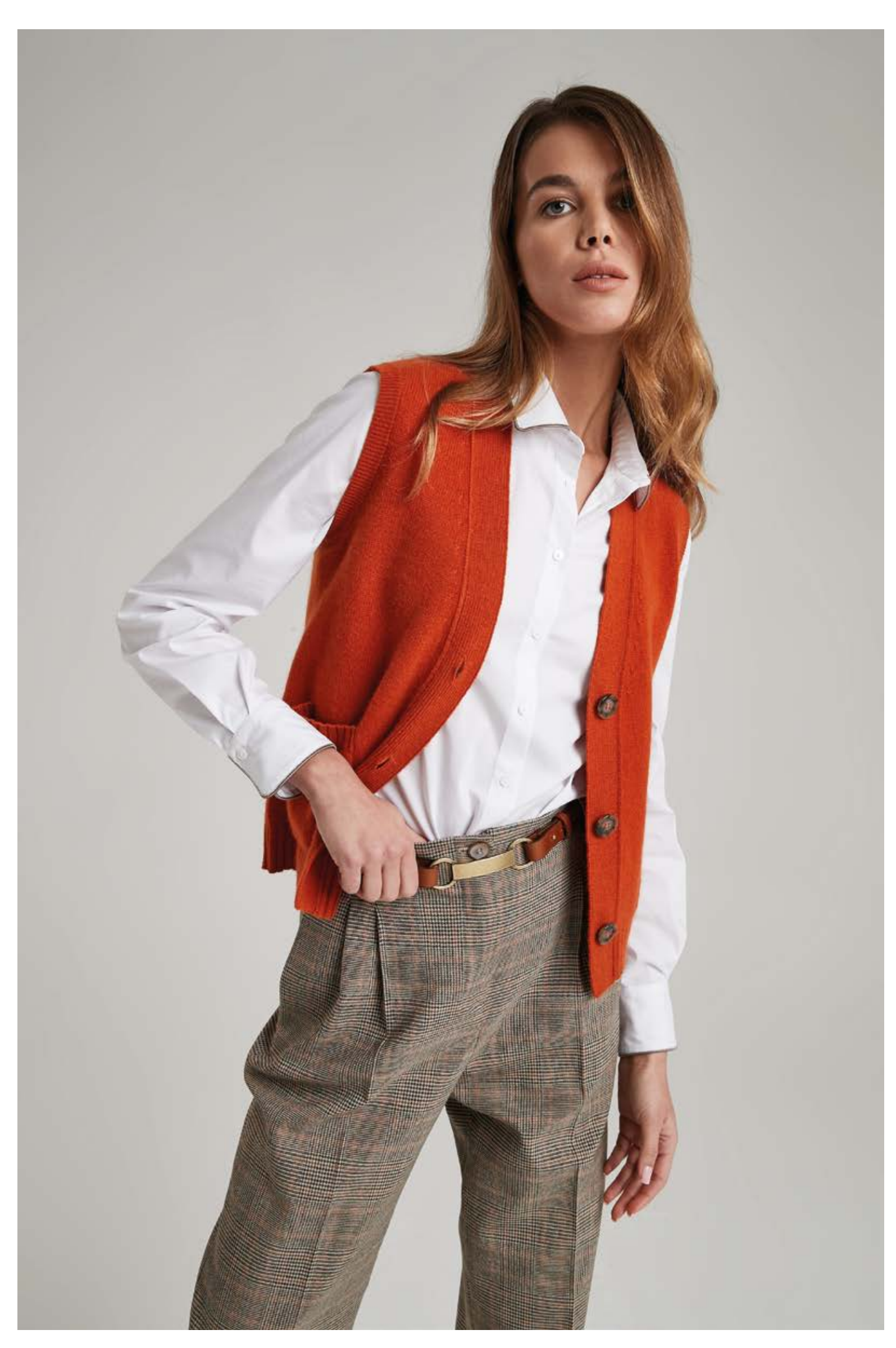
Shirt in stretch popeline, art. 5040 Gilet in cashmere, art. 2134 Trousers in viscose, art. 3036 - Leather belt, art. 6039