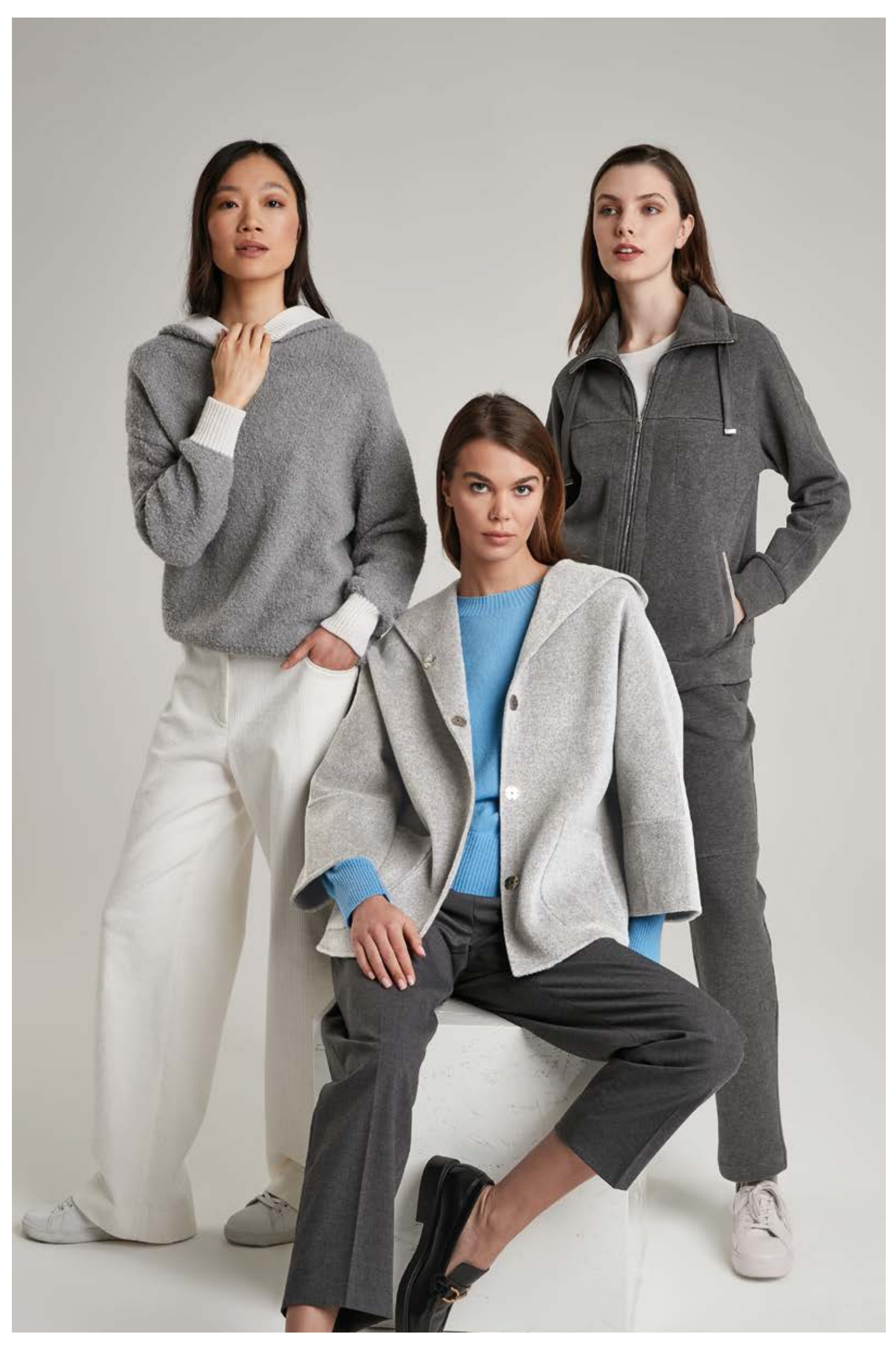
LEFT: Hooded sweater in alpaca and wool bouclé, art. 2551 - Corduroy trousers in cotton, art. 3043 CENTRE: Sweater in cashmere, art. 2100 - Coat in wool and cashmere, art. 8114 - Trousers, art. 3022 RIGHT: T-shirt, art. 1454 - Sweater in organic cotton, art. 1814 - Pants in organic cotton, art. 3014