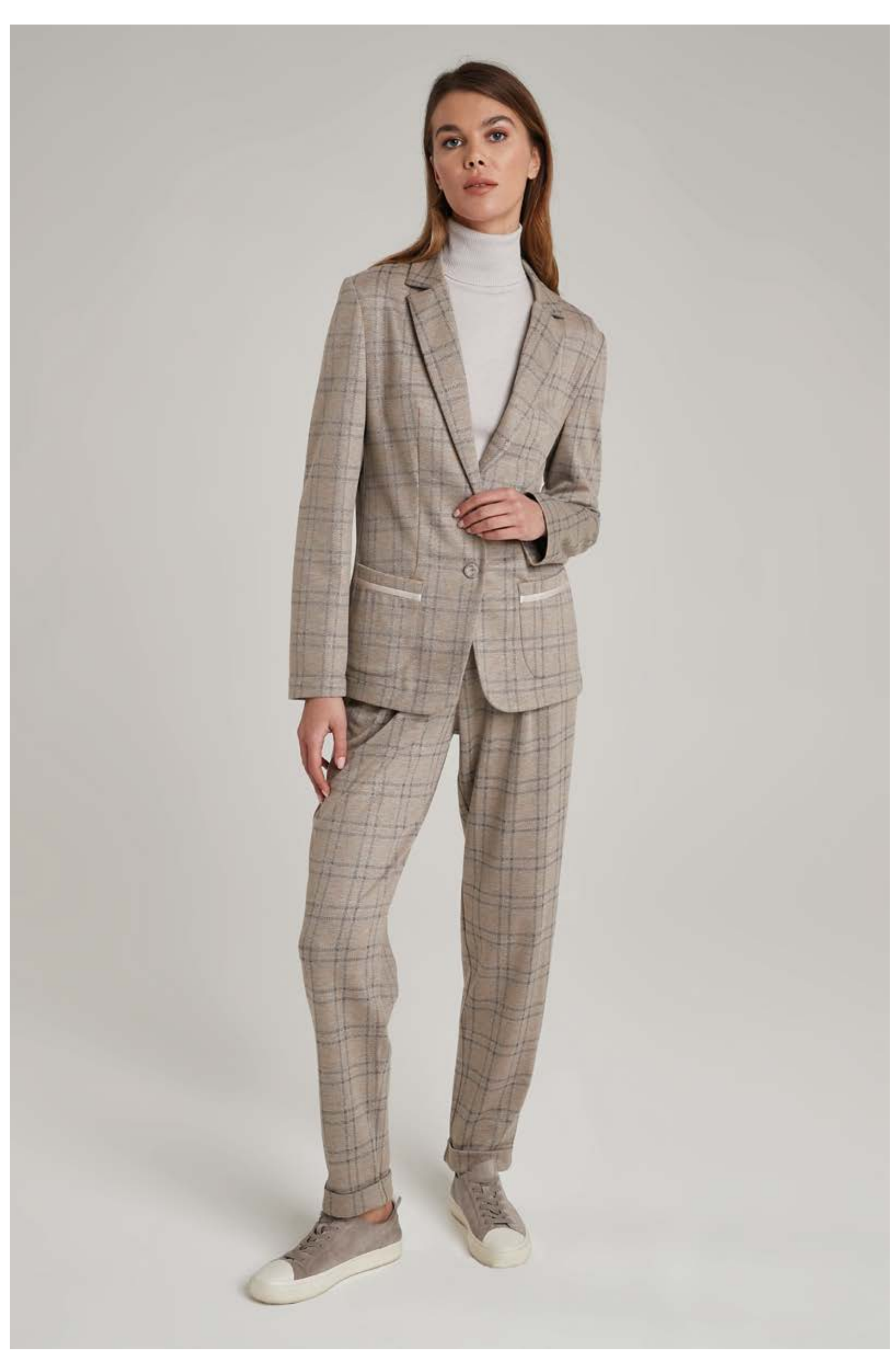
Turtle-neck sweater in silk and cashmere, art. 2002 Jacquard check jacket in cotton and viscose, art. 8008 Jacquard check trousers in cotton and viscose, art. 3008