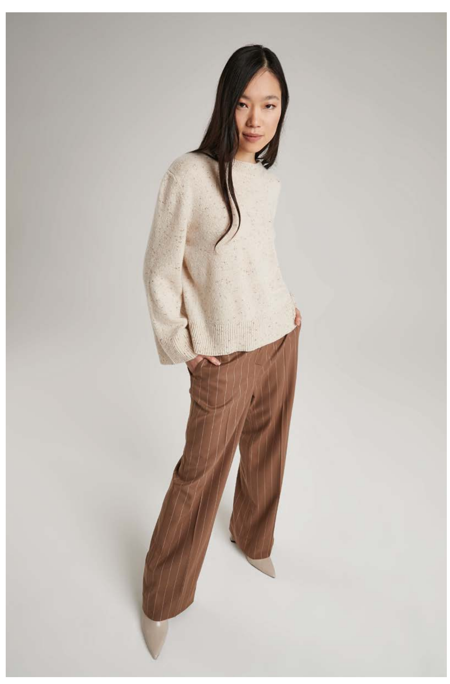
Sweater in cashmere and wool with lurex, art. 2600 Pinstripe trousers in viscose, art. 3028