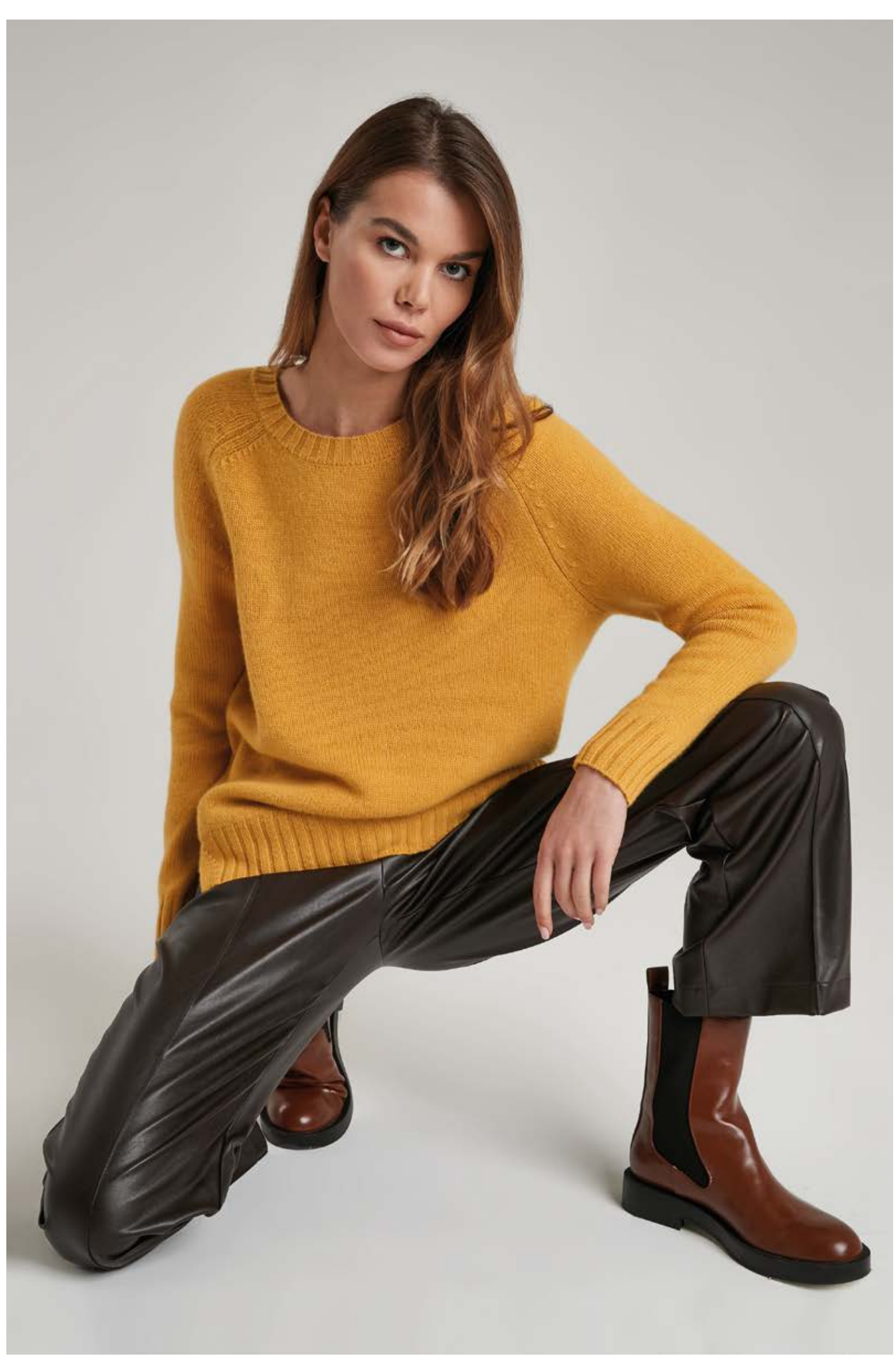
Sweater in cashmere, art. 2140 Trousers in faux leather, art. 3062