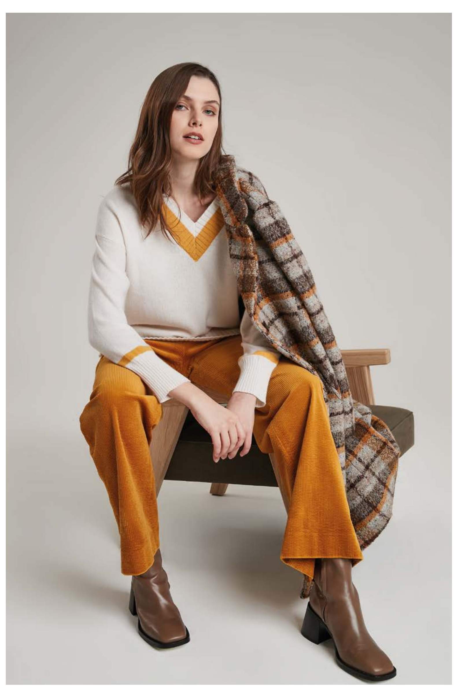
V-neck sweater in cashmere, art. 2139 Coat in wool, art. 8143 Corduroy trousers in cotton, art. 3043