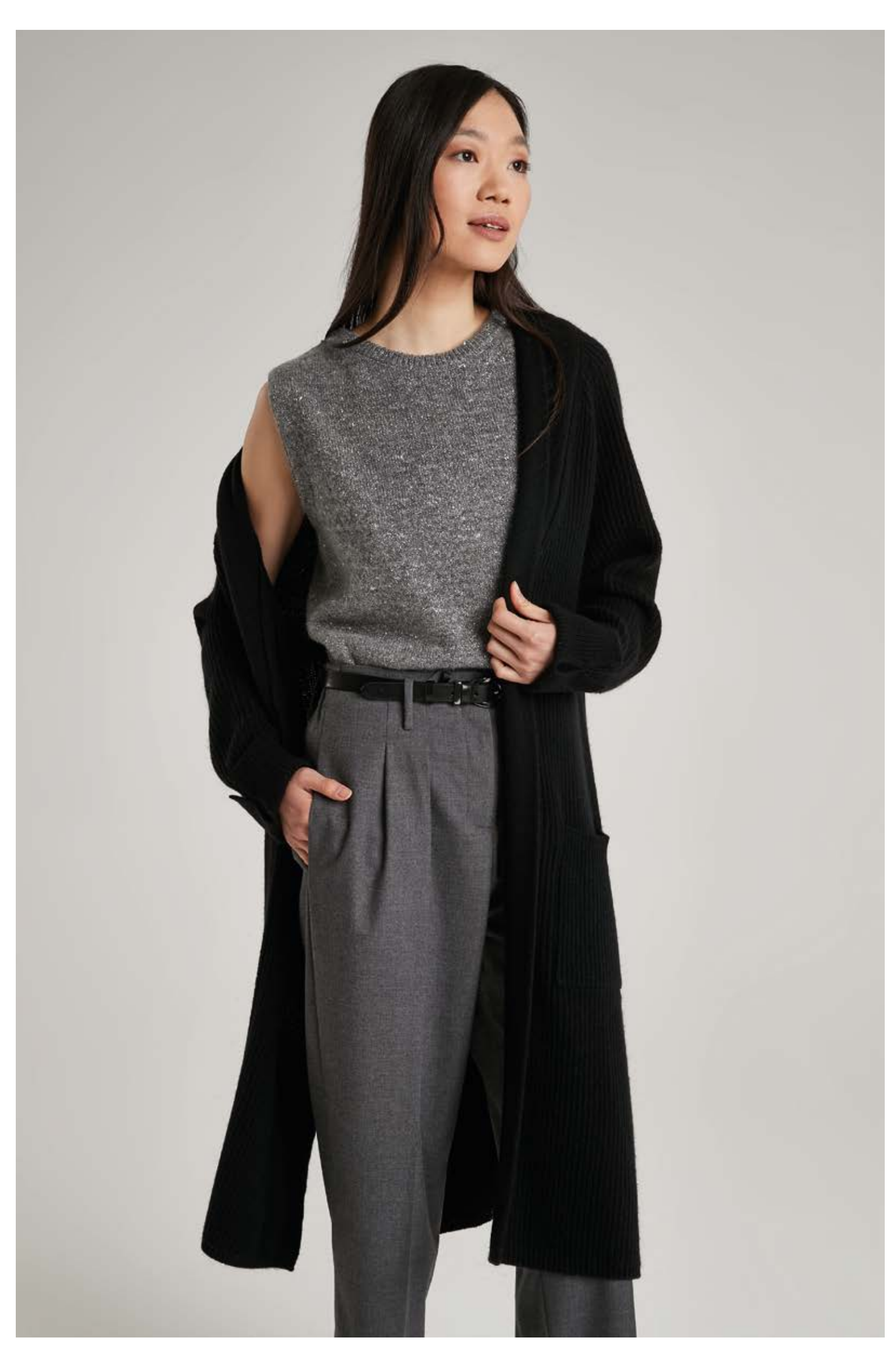
Gilet in cashmere and wool with lurex, art. 2604 Cardigan in wool and cashmere, art. 2217 Trousers in viscose, art. 3022 - Leather belt, art. 6038