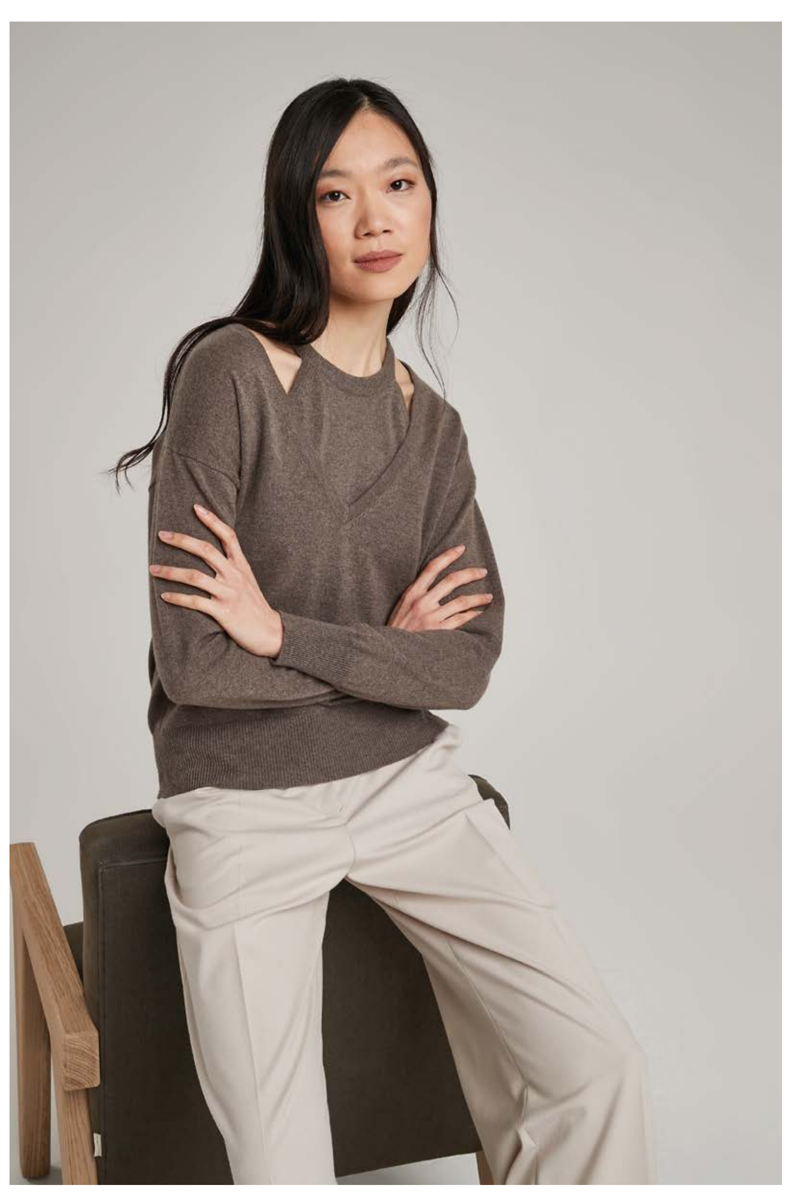
Top in wool and cashmere, art. 2200 V-neck sweater in wool and cashmere, art. 2201 Trousers in viscose, art. 3023