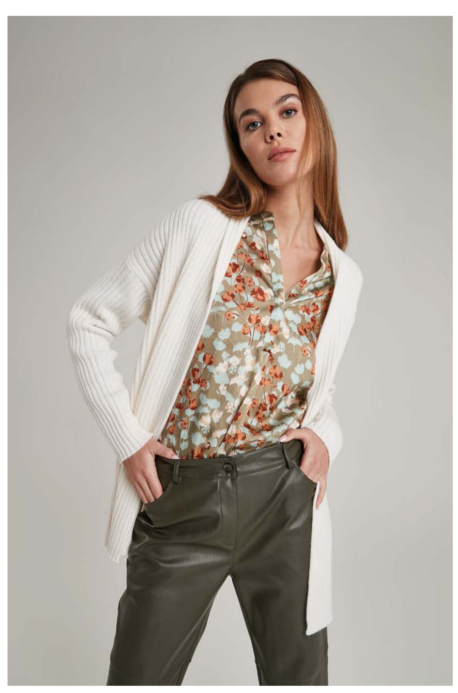
Blouse in stretch viscose, art. 1933 Cardigan in wool and cashmere, art. 2220 Trousers in faux leather, art. 3061