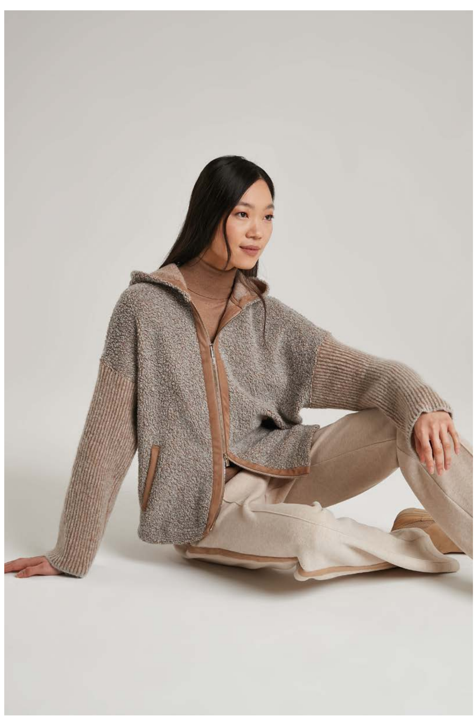
Turtle-neck top in silk cashmere, art. 2011 Hooded sweater in terry cloth, art. 8001 Pants in organic cotton, art. 3013