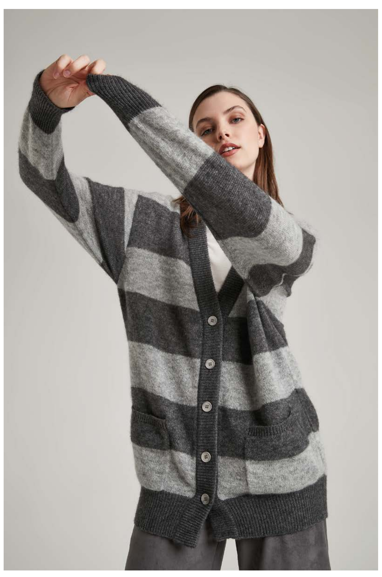
Turtle-neck t-shirt in modal cashmere, art. 1502 Cardigan in super kid mohair and silk, art. 2623 Trousers in faux suede, art. 3018