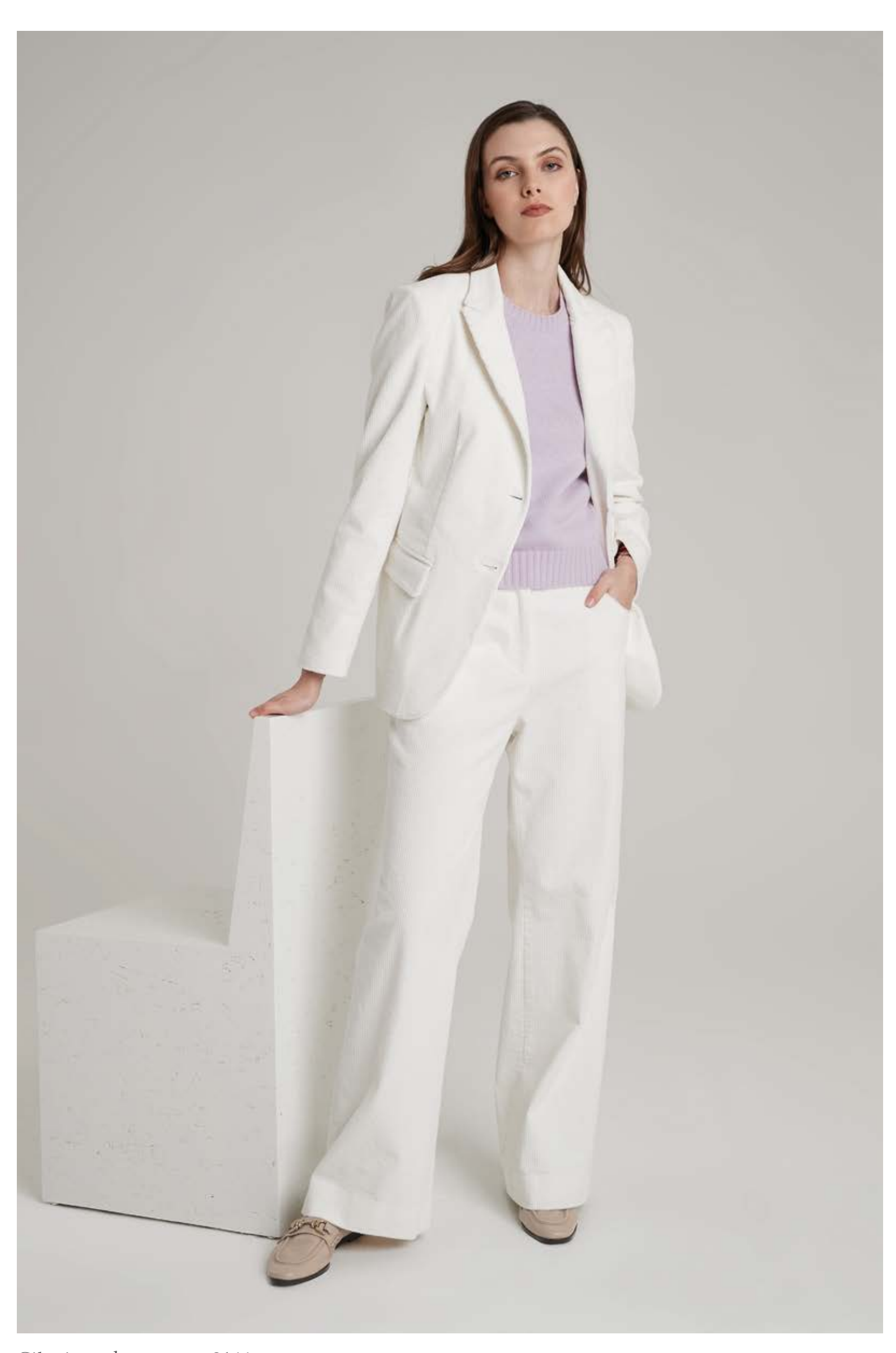
Gilet in cashmere, art. 2144 Corduroy jacket in cotton, art. 8073 Corduroy trousers in cotton, art. 3043