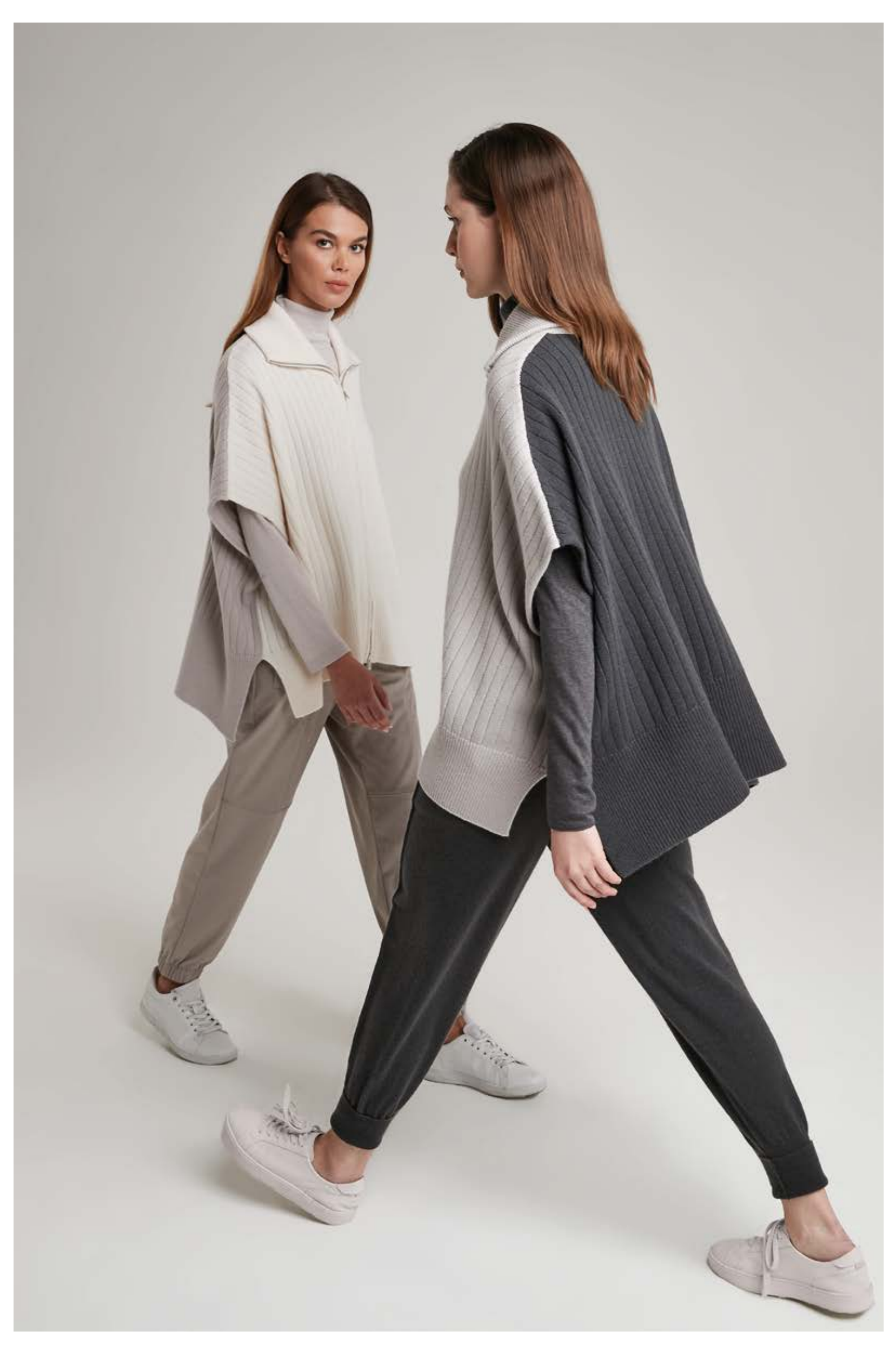
LEFT: Turtle-neck sweater in silk and cashmere, art. 2002 - Poncho in wool and cashmere, art. 2216 Trousers in faux suede, art. 3017

RIGHT: Poncho in wool and cashmere, art. 2216 - Pants in cashmere, art. 2158