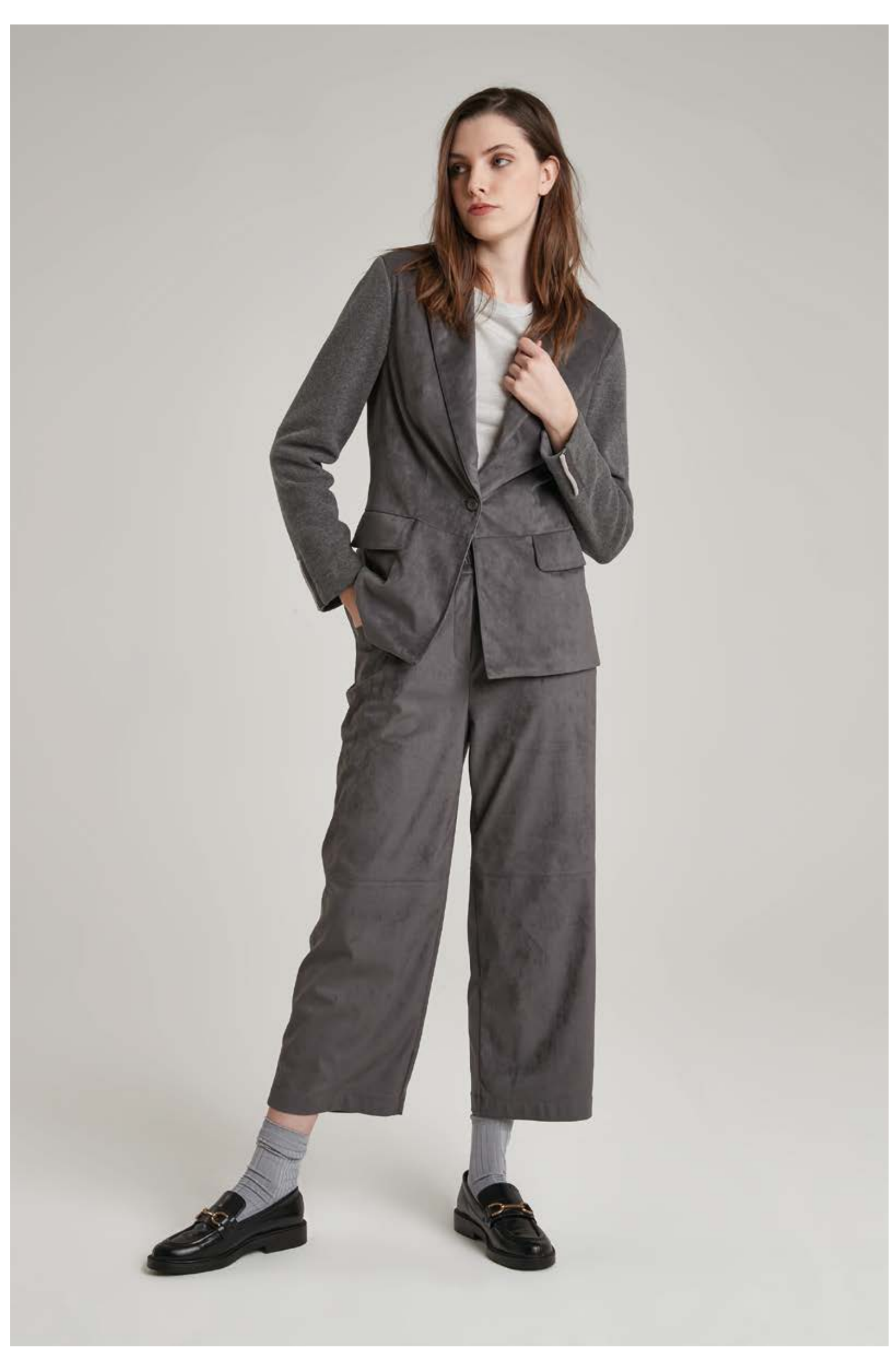
T-shirt in jersey lurex, art. 1332 Jacket in organic cotton and faux suede, art. 8013 Trousers in faux suede, art. 3018