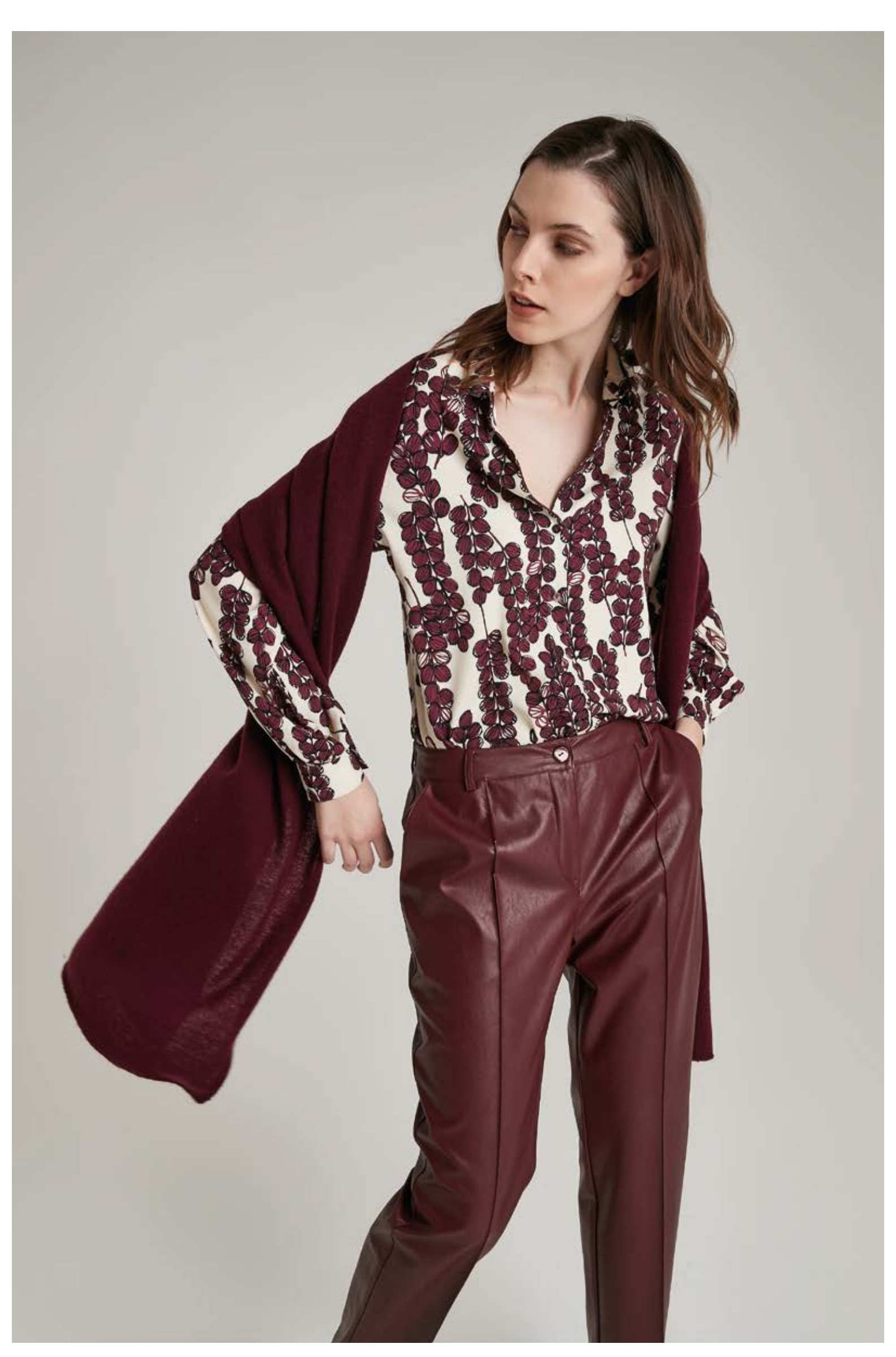
Shirt in stretch viscose, art. 5032 Trousers in faux leather, art. 3060 Scarf in cashmere, art. 6014