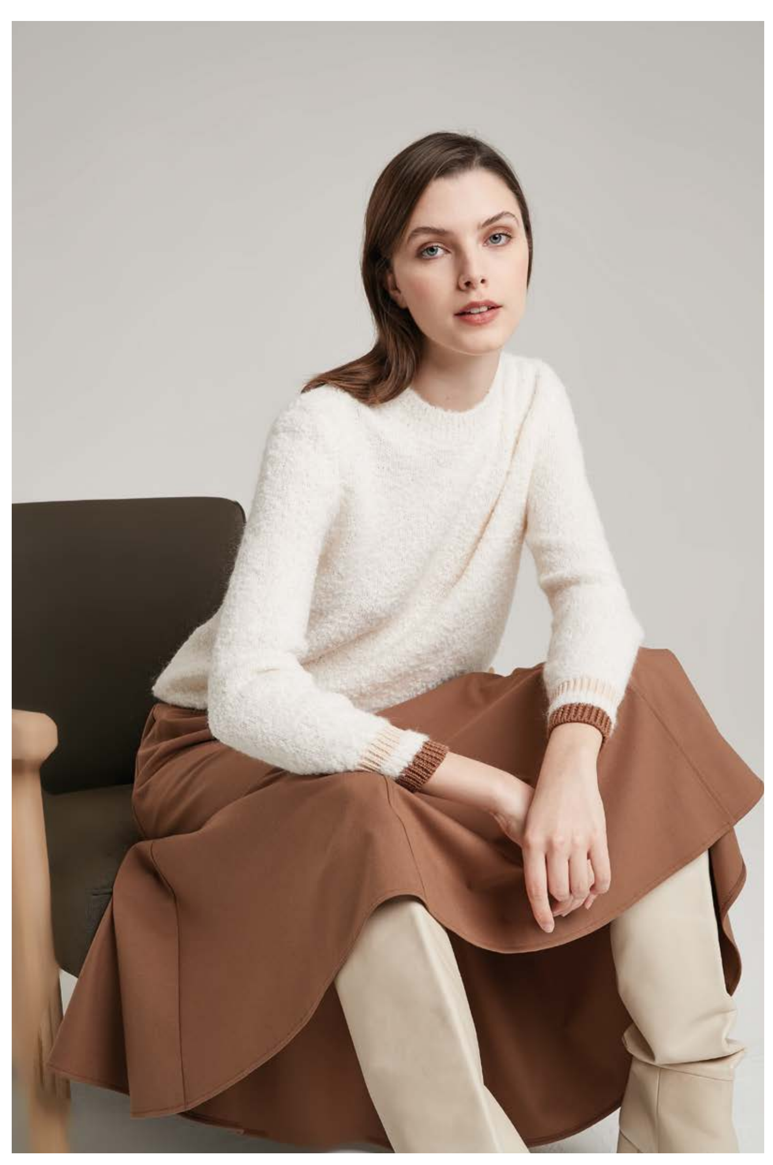
Sweater in alpaca and wool bouclé, art. 2553 Skirt in viscose, art. 3024