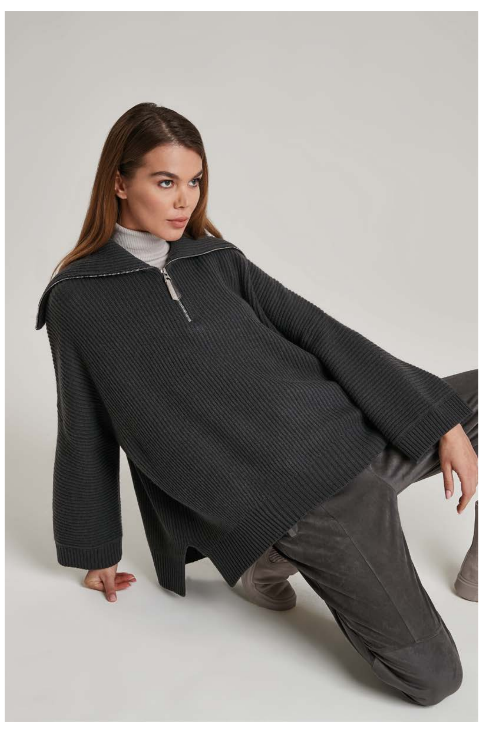
Turtle-neck sweater in silk and cashmere, art. 2002 Maxi pullover in wool and cashmere, art. 2225 Trousers in faux suede, art. 3017