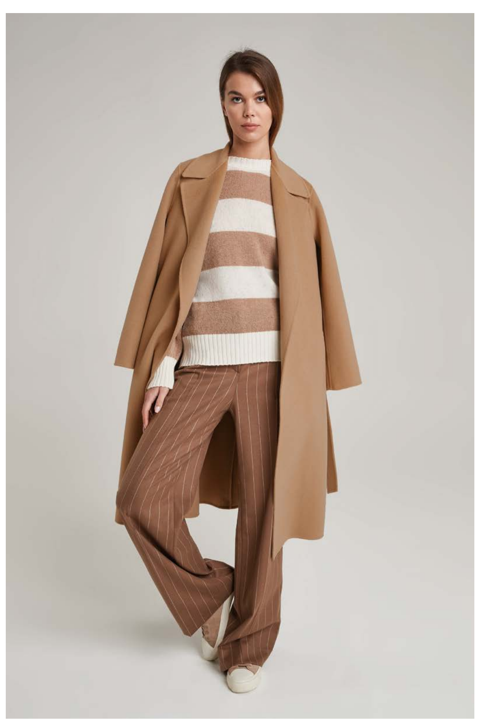
Sweater in super kid mohair and silk, art. 2620 Pinstripe trousers in viscose, art. 3028 Coat in double fabric wool and cashmere, art. 8112